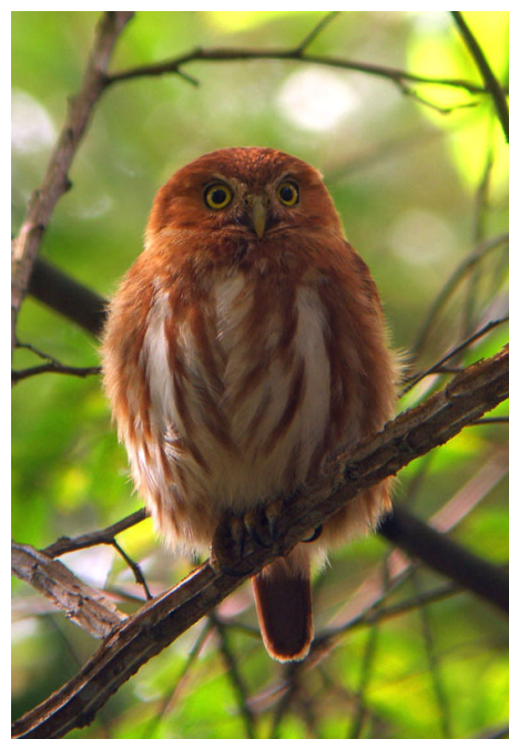
Moustached Wren (left) and Ferruginous Pygmy-Owl (right)