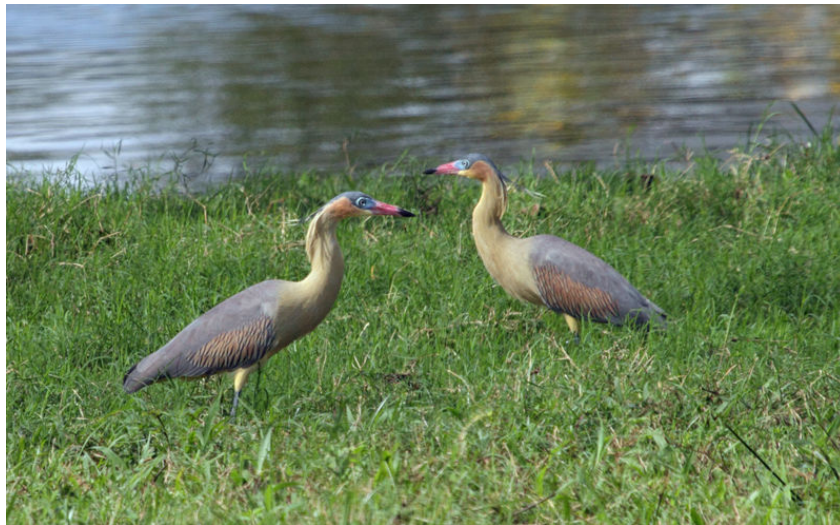
Whistling Herons in a field near Guapi Assu.