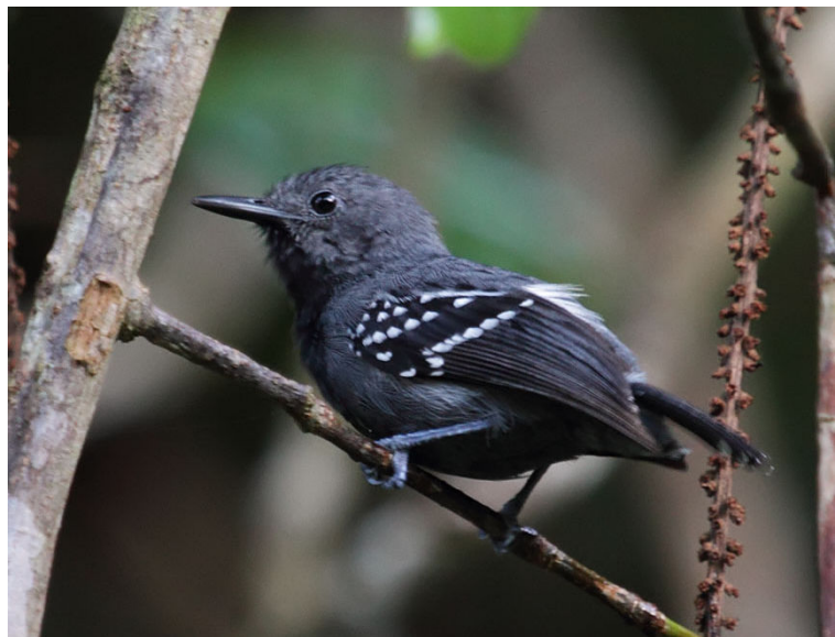
A handsome Swallow-tailed Hummer guards the Guapi Assu Bird Lodge feeder, and a male White-flanked Antwren, an endemic subspecies that will be split eventually.