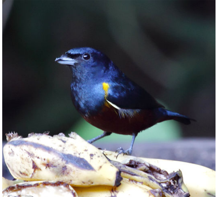
Sombre Hummer was the dominate species at the Serra dos Tucanos hummer feeders, while Chestnut-bellied Euphonia was one of the many colorful birds coming into bananas.

The next day we birded the forest around Macae de Cima, enjoying a number of colorful birds like White-browed Woodpecker, Bertoni's and Ochre-rumped Antbirds, Hooded Berryeater, another Bare-throated Bellbird, Black-and-gold Cotinga, Rufous-crowned Greenlet, Brassy-breasted Tanager, and Green-winged Saltator. Mixed species flocks kept us busy sorting through Pallid Spinetail, White-collared Foliage-gleaner, Pale-browed Treehunter, Gray-capped Tyrannulet (photo left), and others. We