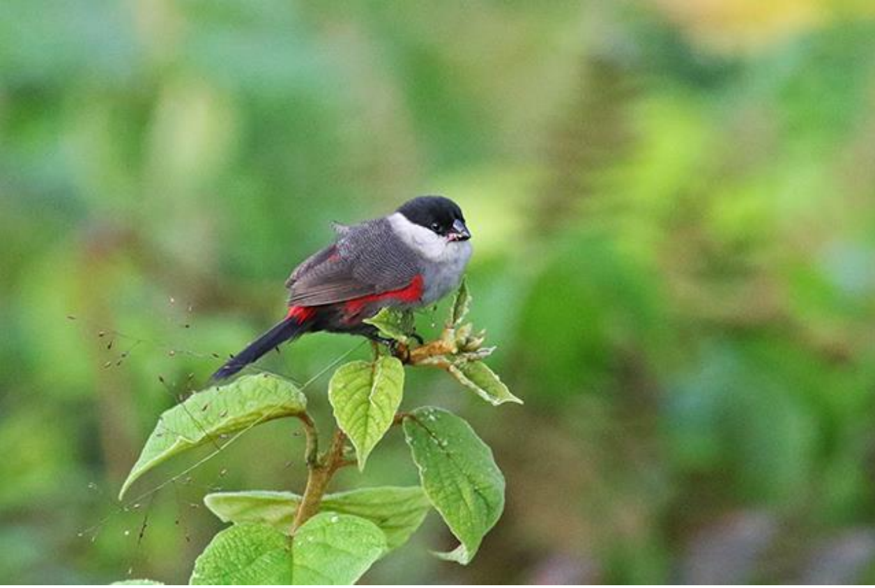
The attractive Kandt's Waxbill was recently split from Black-headed.

We repeated our morning vigil for the near-mythical Olive Ibis, this time at a different viewpoint but with the same results. We had another good selection of birds on our pre-breakfast birding, including Rameron & Delegorgue's Pigeons, Red-fronted Parrot, Hunter's Cisticola, Amethyst, Tacazze plus both Northern & Eastern Double-collared Sunbirds next to each other to allow comparison, a nice family of Kandt's Waxbills, Black-and-white Mannikins and Thick-billed Seedeater . After breakfast, we checked out and were just about to leave when another birder staying there took us over to where he had just had a nice flock. Some of the birds had already moved on but we did see Tropical Boubou, Black-throated & Gray Apalises and Kikuyu White-eye . We also had a brief Mountain Buzzard and a couple of Scarce Swifts fly over. We said goodbye to this wonderful place and set off along the bumpy entrance road where we flushed another Mountain Wagtail .