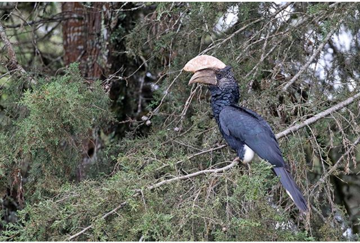
Silvery-cheeked Hornbill was a conspicuous resident at Mt Kenya.

We started with an hour of pre-breakfast birding at dawn. Our main target was the rare Olive Ibis which is usually only seen in flight. We positioned ourselves with a view of the forested valley below. There was a flowering tree nearby where we saw Tacazze & Amethyst Sunbirds and hopping around in the grass a pair of Kandt's Waxbills . Rameron & Delegorgue's Pigeons landed in a distant tree and we had scope views, a Brown-capped Weaver made a brief appearance, several Red-fronted Parrots flew by noisily and we also had our first Gray Wagtail which scurried around the edge of the pool below. There was no sign of Olive Ibis, though. We went down for breakfast where from the balcony we saw Hunter's Cisticola, Spectacled Weaver, Waller's Starling and Thick billed Seedeater . An ibis flew by and over the forest valley below. It seemed to fly differently from a Hadada Ibis but we couldn't say for sure. We moved down to the parking lot where before setting off, we had several close White-bellied Tits and our first Willow Warbler . Abbott's Starling and Gray-headed Nigrita also were perched nearby and we had good looks in the scope.