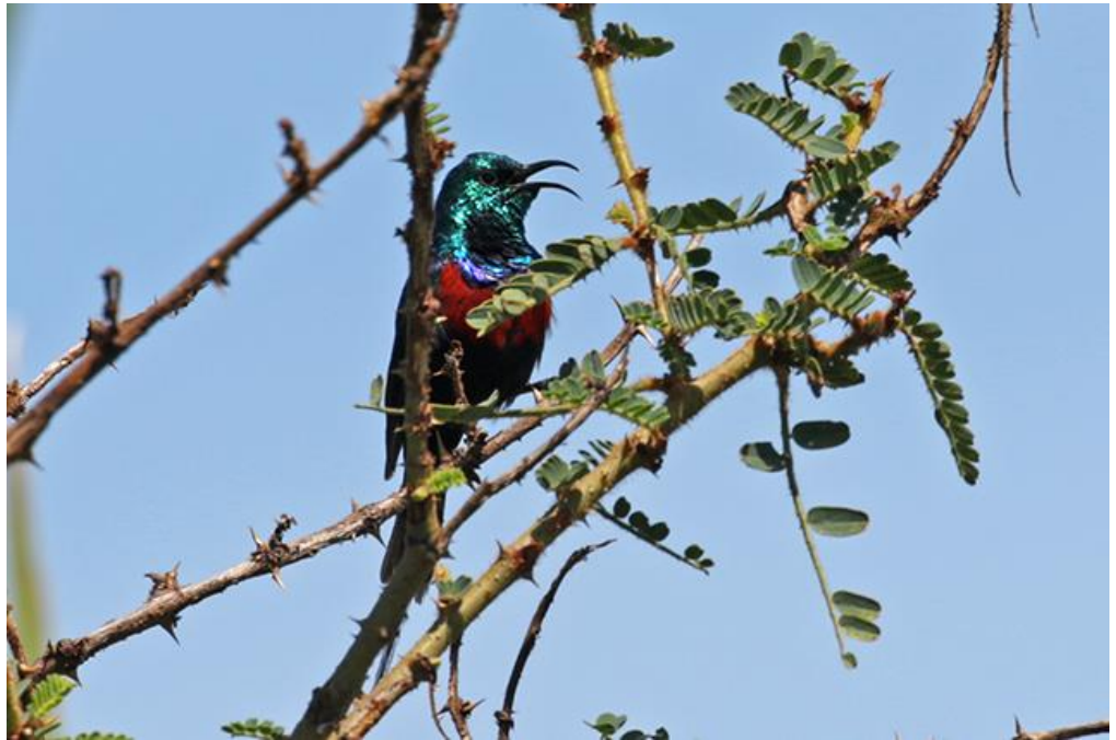
Red-chested Sunbird is often found by the water's edge.

We had a long drive to the Masai Mara so only had a short time to bird the garden. We made an effort to find a couple of species we had only heard thus far, namely Great Blue Turaco and Blue-shouldered Robin-Chat but both remained elusive. After a heavy downpour during the night, the skies were now blue and the early morning light fresh on the huge Black-and-white Casqued Hornbills , allowing a few last photos before breakfast. We hit the road, and after about an hour and a half's drive, we had reached the town of Kisumu on the edge of Lake Victoria. We eagerly accepted the option of another boat ride as it was the best way to search the papyrus beds. We started straight off with some common species which were now very familiar to us like White-winged & Whiskered Terns, Long-tailed Cormorant, Pied Kingfisher and Hamerkop but also saw our first African Jacana and Purple Heron . We were not really looking for water birds, but rather the rare passerines of the papyrus beds. We picked up our target Carruthers's Cisticola quickly, followed by Greater Swamp Warbler and Swamp Flycatcher , but only heard the White-winged & Black-headed Weavers which were all busy nest building. One of our main targets was Papyrus Gonolek and we heard it, but it wouldn't come in.