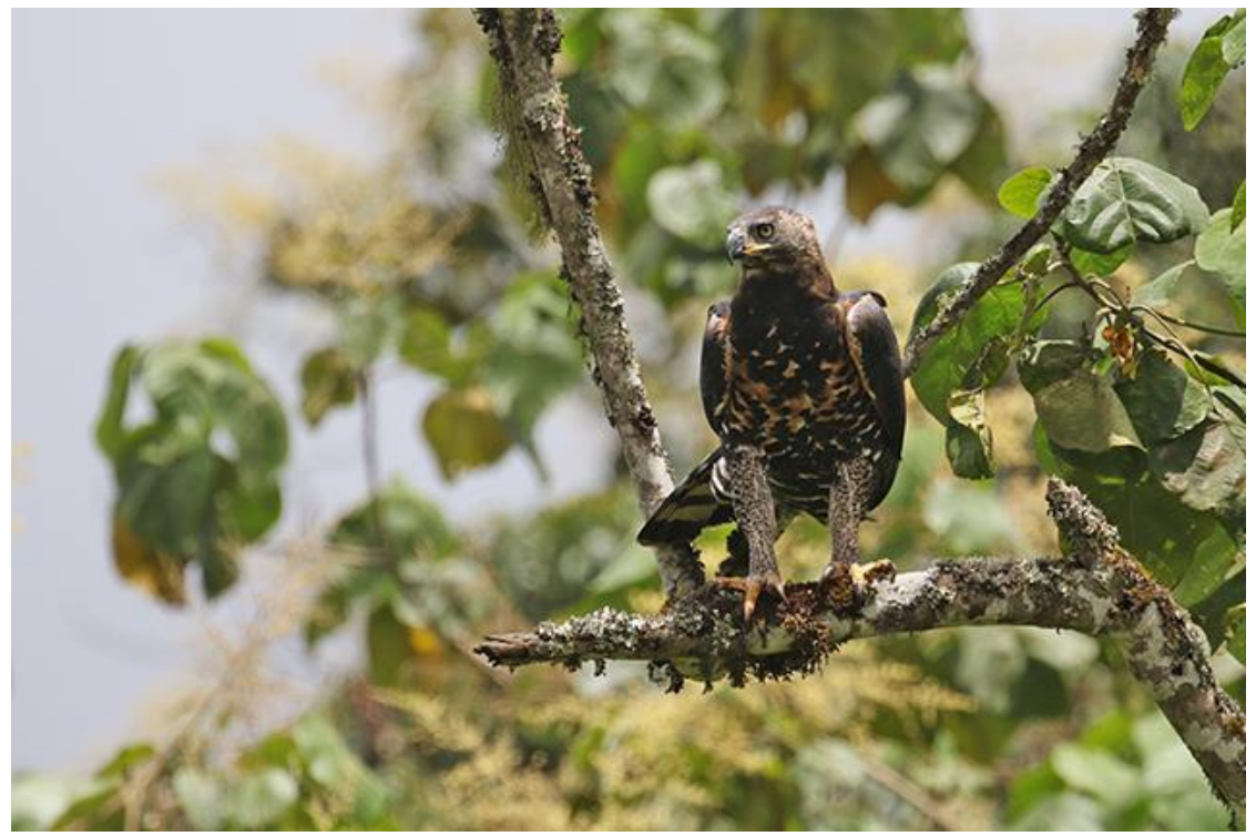
Crowned Eagle is Africa's largest and often feeds on monkeys.

After breakfast, we made our way through the thick Nairobi traffic which took a while. We passed through one area where all the trees were covered in Marabou Storks . We finally made our way out of the city and started to make our way towards our destination of Mount Kenya. We drove over one bridge in particular that had a huge colony of nesting Little Swifts . Our main birding stop on the way was at some rice fields near the town of Mwea. We found a quiet place to stop and set up the scope by the roadside. Perching on top of the rice were several White-winged Widowbirds and Yellow-crowned Bishops . We also had Zitting & Winding Cisticolas plus Barn and Bank Swallows perched on a fence. There was an overhead wire that had a number of birds on it, including Village Indigobird , Grey-headed Kingfisher , Superb Starling and African Pied Wagtail . We had a fly-bys of Spurwinged & Blacksmith Lapwings before we set off again. Passing Mwea, we also had a close Hamerkop in a ricefield and we managed to stop and take photos. One last stop before arriving was at a bridge over a river with another Little Swift nesting colony. Here we found our first Lesser Striped Swallows , plus more Northern Fiscals , Yellow Bishops , Baglafecht Weaver and Red-billed Firefinch . We arrived at the gate of Castle Lodge and along the entrance road had a magnificent Crowned Eagle which flushed off the road and perched very close.