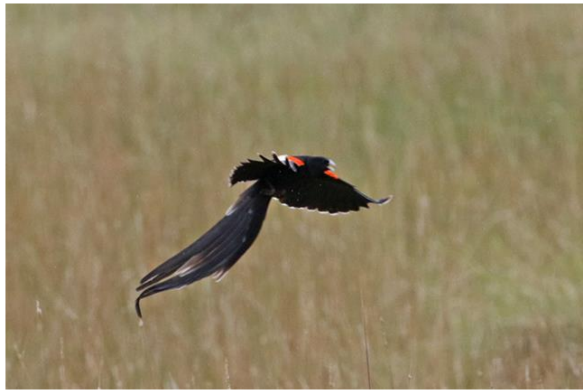
A displaying male Long-tailed Widowbird.

We had a long drive back to Nairobi today so packed up the vehicles straight after breakfast and hit the road. We had a rest stop at a gas station after a couple of hours, and as people enjoyed coffees, some of us took a short walk around and were surprised how many birds there were. Here we saw D'Arnot's Barbet , Speckled Mousebird and Purple Grenadier . Our main birding site on the way back was a place called Murungaru and our main target was the endangered endemic Sharpe's Longclaw . This required a walk on a grassy hillside to try and flush it up. It didn't take long and we soon had extended flight views and even brief views of a bird on the ground running between clumps of grass. As it turned out, it was our 500<sup>th</sup> species for our trip list! Another big target was the impressive Long-tailed Widowbird and there was one male doing its slow-motion like flight display. Other good birds seen here were Levaillant's & Wing-snapping Cisticolas , Angola Swallow , African Snipe , African Citril and Golden-winged Sunbird . It had been drizzling but it got heavier and we were forced to retreat to the vehicles to eat our packed lunches. Before continuing towards Nairobi we stopped for a bit of souvenir shopping. Back in Nairobi we said goodbye to our wonderful drivers after an amazing journey around Kenya.