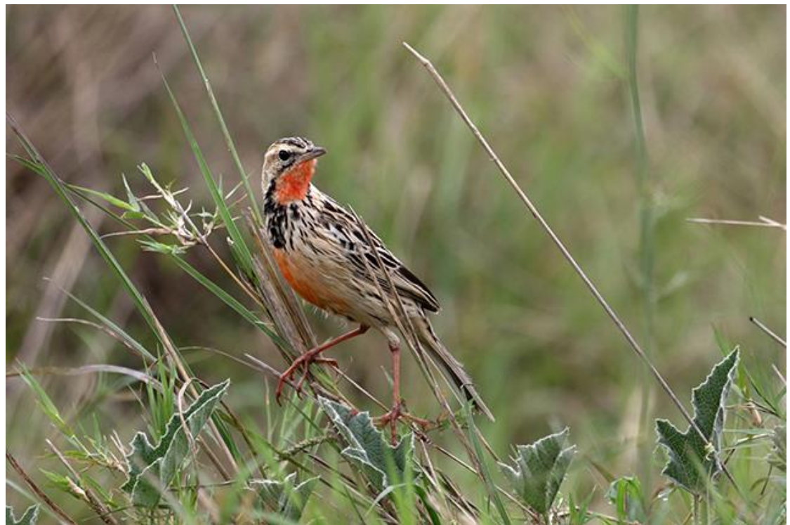
The gorgeous Rosy-throated Longclaw.

After breakfast, we spent a short time birding in the camp while the drivers loaded our bags. We found a nice female Purple Grenadier , a long-tailed African Paradise-Flycatcher and a Brown-crowned Tchagra . On the walk to the parking lot, we also had an African Green Pigeon in the scope. We drove down to gate of Mara Triangle Conservancy which borders the Maasai Mara and on the way saw White-headed Barbet and Yellow-fronted Canaries . At the gate we had hundreds of Little Swifts flying around and scuttling across the road, our first Red-necked Francolins . After the drivers had finished the entrance procedures, we drove in and soon had a Black Stork flying by. There were many vultures & eagles in the nearby trees and working through them found Lappet-faced & White-rumped Vultures plus Ruppell's Griffon and Tawny, Steppe and a surprise Imperial Eagle . Other good birds in this area were Yellow-throated Longclaw , Plain-backed Pipit , Fan-tailed Widowbird , Yellow-billed Oxpeckers on some Cape Buffalo and our first Flappet Lark which did its flight display for us. Of course, there was no shortage of mammals either and we saw Topi , Coke's Hartebeest and Bohor Reedbuck . We turned down onto the floodplain of the Mara River and here saw Ross's Turaco flashing its bright red feathers in flight, plus our first Banded Snake-Eagle , Black-bellied Bustard and Coqui Francolin .