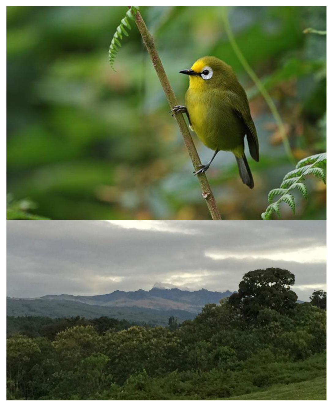
White-eyes have undergone a major taxonomic revision. This is the new endemic Kikuyo White-eye. Mt Kenya.

We went back for lunch and a short rest before going back out again in the afternoon. The drivers took us up the same track as yesterday afternoon, but we planned to go further up to access to different habitat. It had been pretty wet recently and the grassy road was a little slippery and seemed to get narrower and narrower. We decided that we had gone far enough, and we got out and started birding back down the track while the drivers went to look for a place to turn around. We saw many of the same birds again, including Scaly Francolin, Scarce Swift, Hartlaub's Turaco, Tullberg's Woodpecker, Kikuyu White-eye, Slender-billed, Eastern Mountain & Yellow-whiskered Greenbuls, Black-tailed Oriole and Northern Double-collared Sunbird, but added one or two new ones like Long-crested Eagle, a family of 8 White-headed Woodhoopoes, Brown Woodland-Warbler and a big flock of Slender-billed Starlings. We also saw a Colobus Monkey doing a huge jump between the trees. The clouds had been getting darker and inevitably it finally started to rain so we got back in the vehicles and drove back to the lodge after a good day of birding.