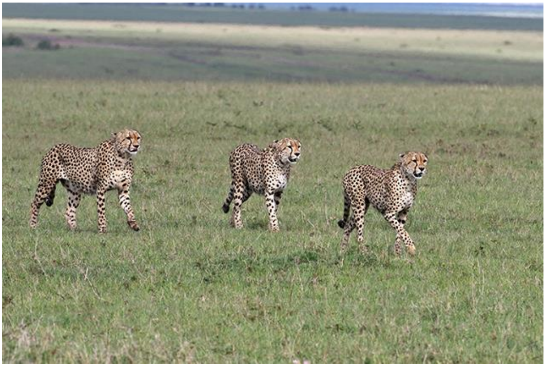
Cheetahs stalking through the Maasai Mara was one of the enduring images of the trip.

It was our last full day in the Maasai Mara and we had a few specific targets, top of the list being Southern Ground Hornbill and any cats. After breakfast we waited in front for the lodge for our packed lunches. While we waited, I called in our first Sulphur-breasted Bush-Shrike . We also saw African Yellow White-eye & African Paradise Flycatcher . It had rained over night and was still overcast. The birds were still quiet, although we did find a pocket of activity with Bare-faced Go-away-bird , White-browed Coucal , Yellow-fronted Canary and our first Pale Flycatcher of the trip. We meandered around the eastern area of the park looking for our targets and found White-bellied Bustard , Saddle-billed Stork , Lappet-faced Vulture , Montague's Harrier and Grey Kestrel . We had great views of 5 Cheetahs , several Lion and Spotted Hyaena sightings. The drivers had heard word over the radios that ground hornbills had been seen some distance away, and as we worked our way up through the park, we picked up Black-winged Lapwing , Red-capped Lark and some beautiful Rosy-throated Longclaws . We missed the ground-hornbills at one spot, but instead we found Green-backed Woodpecker . Drivers would often stop and exchange sightings with other vehicles, most only interested in Lions. In exchange, we would ask about ground-hornbills, and finally we met a vehicle that had just seen them. We went to the spot to check it out.