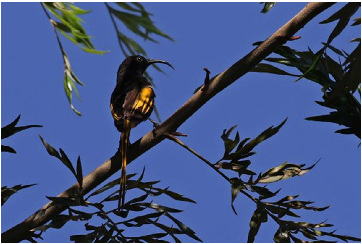
One of the world's best sunbirds: Golden-winged Sunbird.

We spent half an hour on the deck birding over the waterhole before breakfast and picked up Common, Green & Wood Sandpipers, Yellow-billed Stork , a Tropical Boubou picking off moths that had been attracted to the light, several vocal Hunter's Cisticola, Cape & Rüppell's Robin-Chats, Eastern Double-collared Sunbird plus our first Cape Wagtail & African Swift . After breakfast, some of us took a short walk along the boardwalk while our drivers packed the bags into the vehicles and we added our first Golden-winged Sunbird and Doherty's Bushshrike , which were both very attractive birds. We left The Ark, with everybody agreeing they would have like to spend more time here. Driving down towards the gate, we had Long-crested Eagle and Augur Buzzard and just one vehicle the uncommon Blue-headed Coucal . We left the park and were on our way to Lake Nakuru where we would spend the night. We saw our first Cape Crows going through a town and had another stop where we had a mystery raptor that turned out to be a dark morph Augur Buzzard .