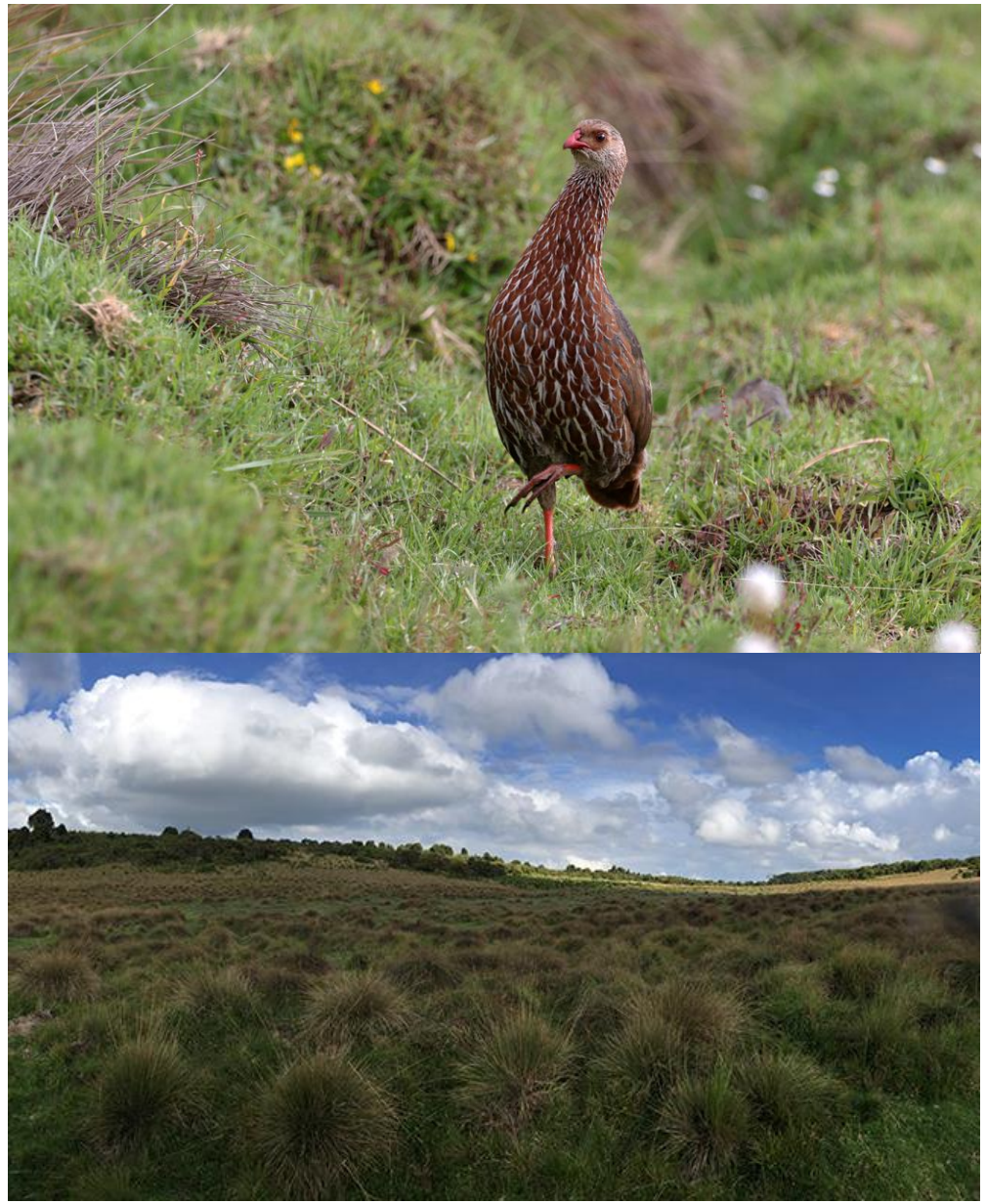
Jackson's Francolin. Moorland at the higher reaches of Aberdares NP.

As soon as we got above the last patches of forest and out into the open moorland, our driver spotted a Moorland Chat . This was soon followed by our first Aberdare Cisticola , a very range-restricted endemic species. Two of our three targets down and our third was to follow quickly. The driver spotted the large Jackson's Francolin just along the road. It came closer and walked right past our vehicles allowing wonderful photo opportunities. In addition to these targets we had several Plain Martins , a female Montagu's Harrier , several Yellow-crowned Canaries drinking at a puddle in the road and finally a beautiful Malachite Sunbird . We had a long drive back down so didn't daudle. We picked up a few birds on the way down, including African Stonechat , African Harrier- Hawk , some close African Black Duck and a Silvery-cheeked Hornbill perched on top of a tall tree. We would have made good time back to the lodge if a huge bull Elephant hadn't blocked the road. After 15 minutes of waiting, it became apparent that it wasn't going to move so we had to take a big detour. It was dusk by the time we got back and there were many Spotted Hyaenas in the road. The waterhole was quiet at night and we didn't receive any alerts at our room for rhinos or leopards. Before going to bed, we did have a few Common Genets and a Greater Galago on the fire escape picking off moths and a family of Giant Forest Hogs grazing down below.