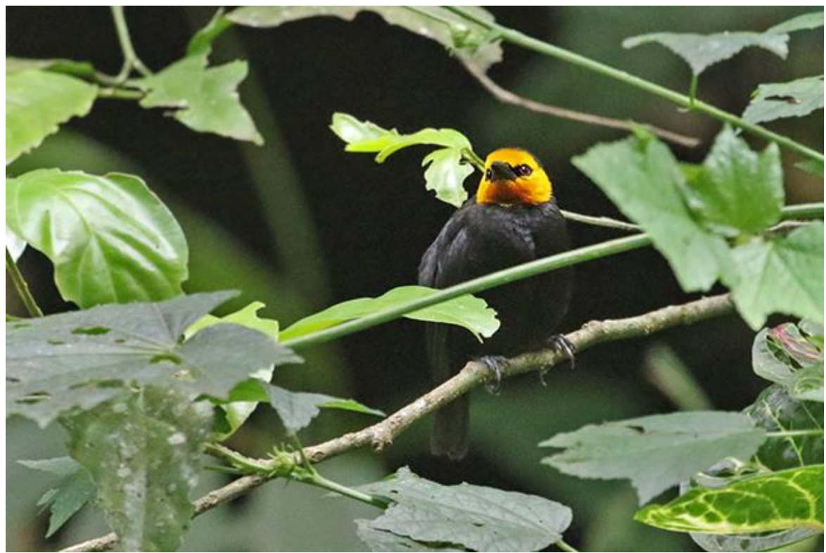
Black-billed Weaver is a very unusual-looking forest weaver.

We started the day with a bit of pre-breakfast birding with our local guide. The beautiful grounds of Rondo Retreat were full of bird song in the early morning although the light wasn't great to begin with. Our first bird was a calling Yellow-billed Barbet which our local guide found and I put in the scope. We also had many other scope views of perched birds including our first African Green Pigeon , White-throated Bee-eater , Petit's Cuckooshrike , Stuhlmann's Starling , Olive-bellied Sunbird , Red-headed Malimbe , Black-necked , Veillot's & Brown-capped Weavers and Grey-headed Nigrita . A close pair of Chubb's Cisticolas were perched low down and our first Snowy-crowned Robinchat also came in close. Another important new family to get was the Southern Hyliota which we saw but were too active in the canopy to get photos of. Our half an hour of birding turned into an hour and we finally pulled ourselves away for breakfast. Afterwards we drove to the headquarters. While the drivers organised the entry permits, the local guide walked us around some nearby habitat where we picked up Tree Pipit , Joyful Greenbul and Pink-footed Puffback . We continued down a narrow forest trail which was pretty quiet and not easy birding, but we did see White-headed Woodhoopoe , Dusky Tit and Black-collared Apalis .