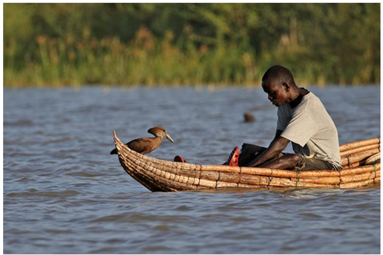
Good friends. A local fisherman with a Hamerkop.

This morning we had a boat ride out onto Lake Baringo. I didn't expect to get many new species, but I was pleasantly surprised. We started off working our way around the edge photographing many species in the early morning light. We had nice close Goliath, Black, Squacco & Striated Herons; Malachite, Giant & Pied Kingfishers and numerous Hamerkops with their strangely large nests. A flock of Bristle-crowned Starlings flew over and the sky was filled with numerous Barn swallows, several dozen Bank, plus a few Wire-tailed & Red-rumped Swallows. Along the edge, we also had close Nubian Woodpecker, Red-tailed Shrike and several breeding plumaged Northern Masked-Weavers. A couple of fishermen came out on their flimsy little boats made by lashing together reeds. They were hardly crocodile-proof. These guys produced a fish to feed to the local African Fish-Eagle and once we were all in place it was flung out and the huge raptor swooped down and picked it up while we all snapped away optimistically. Our local guide directed our boatmen to a large tree on the edge of the lake and after a bit of manoeuvring, pointed out a huge Verreaux's Eagle-Owl to us. What a scoop!