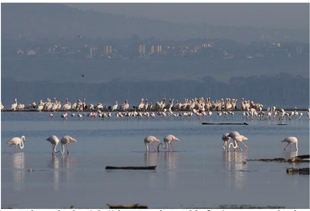
Increased water levels at Lake Nakuru caused most of the flamingos to move elsewhere.