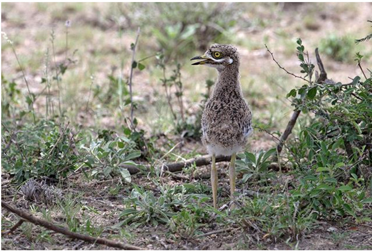
This Spotted Thick-knee chick was attended by its doting parents.

Today we were driving down from Nairobi into the Great Rift Valley towards Lake Magadi. There were a lot of birding stops along the way, and some groups see so many birds that they don't even make it to the lake. After making it through Nairobi's traffic, we got up to the high town of Corner Baridi. Bairidi means cold and it was pretty cold and misty up there. We started the descent and stopped very soon where the mist had cleared. We had a very productive stop here. By the side of the road we saw the drab Brown Parisoma, African, Long-billed & Tree Pipits, Little Rock-Thrush , several Yellow Bishops, Red-billed Firefinch and Red-fronted Barbet . From here we walked up to an open area where we added Abyssinian Wheatear and a dark swift that I identified as Nyanza Swift . Our driver chatted with a local land-owner who gave us access to his land. We climbed over his fence, guilt-free, and accessed a nice patch of woodland where we saw the gorgeous Red-and-yellow Barbet , plus Yellow-bellied Eremomela, Cape Robin-Chat and African Citril . The Swiss owner joined us and gave us a little talk about the area. We returned to the vehicles and continued down the steep road to the town of Olepolos.