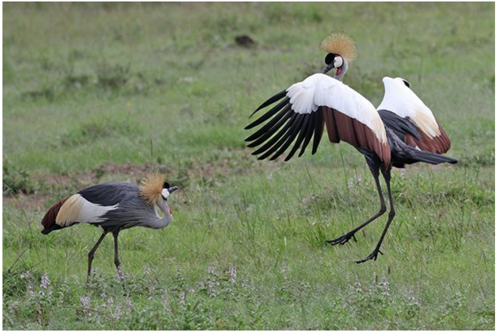
A pair of Grey Crowned Cranes dancing.

On our first full day of the tour, we were exploring the Nairobi National Park. After breakfast we met our driver, Sammy, and set off for the park entrance just a 20-minute drive away. After the short entry procedures, we entered the park and from that point we were restricted to the vehicle due to the presence of dangerous animals like Lion and Buffalo. We drove through some nice lush forest where we saw our first birds, including Emerald-spotted Wood-Dove , a juvenile African Goshawk , the beautiful Cinnamon-chested Bee-eater and a White-eyed Slaty- Flycatcher . We also had our first mammals with Bushbuck and Syke's Monkey . The road descended into an open grassland with dotted bushes where we added a breeding-plumaged Red-collared Widowbird , Winding Cisticola, Northern Pied-Babbler, Whinchat and Rufous-naped Lark . We drove towards a small lake and flushed Black & Yellow-billed Storks from the road into a tree where they posed for photographs. A magnificent African Fish-Eagle also flew by. At the pond we added many species, including African Darter , Yellow-billed & Red-billed Ducks , Spur-winged Lapwing , Pied Kingfisher and many shorebirds. The highlight though was when a beautiful pair of Gray Crowned-Cranes flew in. We continued our exploration of the grasslands, adding our first White-backed & Rüppell's Griffons , Yellow-throated , Pangani and Rosy-throated Longclaws , Long-tailed Fiscal , Brimstone Canary and the unusual Parasitic Weaver .