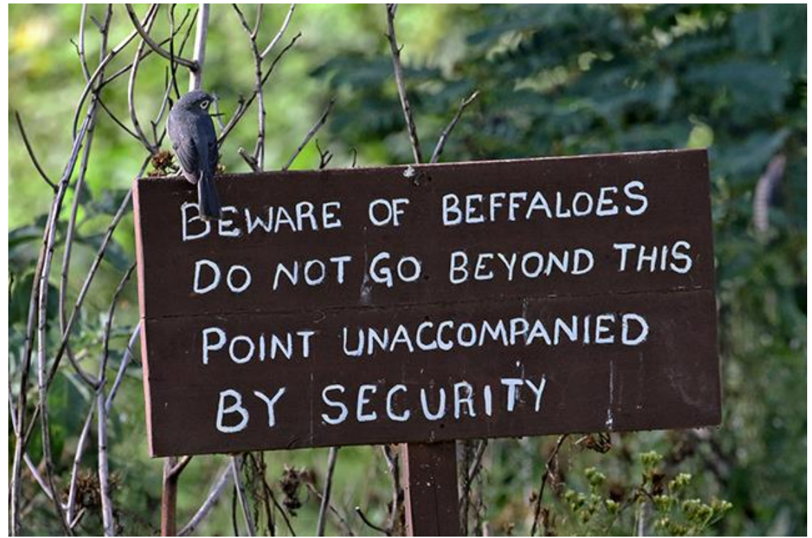
White-eye Slaty-Flycatcher says, "Beware of Beffaloes!"

In the trees we had some flocking species, including White-bellied Tit, Red-faced Crombec, Red-headed Weaver and Mountain Gray Woodpecker, plus a noisy family of Arrow-marked Babblers. Further round, we had perched Long-crested Eagle and Augur Buzzard, and coming back out on the grassland, Rufous-naped Lark, Northern Anteater-Chat and our first Gray-backed Fiscals. After a required pit stop at a little compound with African Black-headed Oriole, we drove on to the 'Baboon Cliffs' on the other side of the lake. We didn't see any baboons here but did have numerous Nyanza Swifts and Rock Martins, and scanning the lake shore below, a female Eurasian Marsh-Harrier, several African Spoonbills, Gray-hooded Gulls and Pink-backed Pelican. Finishing our drive back to the lodge for lunch we saw another group of 5 White Rhinos including 2 young ones, which was nice to see given the recent plight of the species. We had a nice buffet lunch back at the lodge, after which we saw Meyer's Parrots and White-browed Robin-Chat. Leaving the park, our final bird was a soaring White Stork. We set off on our way to Lake Naivasha, and arrived at Lake Naivasha Sopa Lodge where we had a one night stop. It was a magnificent lodge with huge rooms and set in large gardens at the lake's edge.