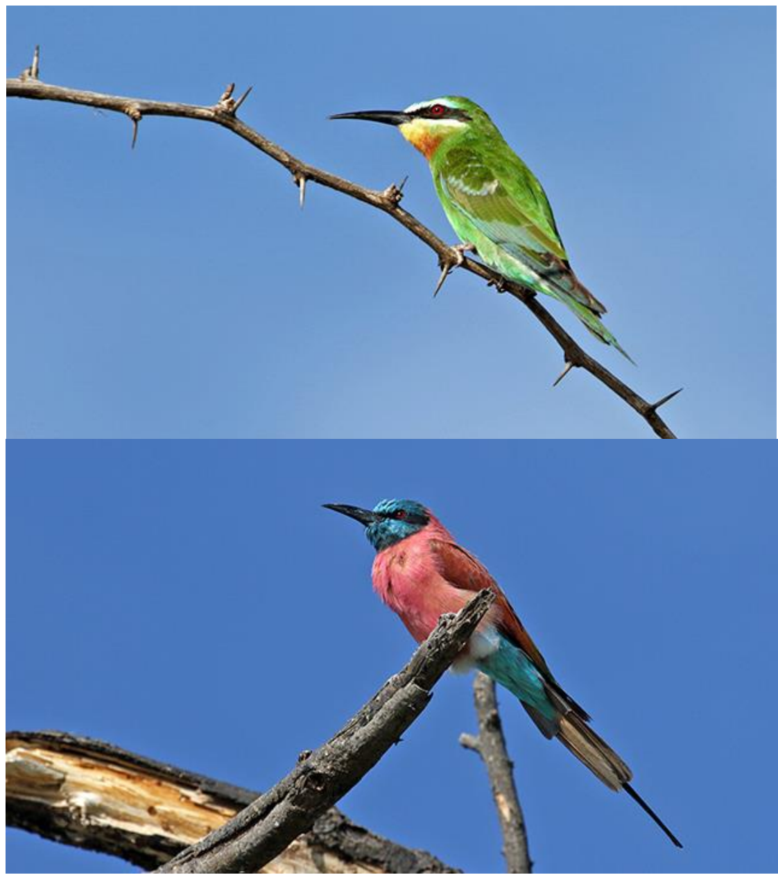
Bee-eaters of Lake Baringo: Blue-cheeked & Northern Carmine.

We walked around the thorny scrub trying unsuccessfully not to get too scratched up. We picked up quite a bit of stuff, including Namaqua Dove, a soaring Lesser Spotted Eagle, Dark Chanting-Goshawk, Blue-naped Mousebird, Northern Red-billed Hornbill and some more Green Woodhoopoes. We also had a displaying pair of D'Arnaud's Barbets with their polkadot plumage and distinctive 'cocked-tail' posture. We continued our search for Hunter's Sunbird eventually finding just a drab female feeding on a cactus flower. Only our guide and youngest member of the group, Nyjal, saw a fly over Magpie Starling flock which was a bit frustrating. On the way back to the vehicles we did find a pair of Black-throated Barbets which posed nicely for photos. After leaving we saw Fan-tailed Raven flying and a lone Pygmy Falcon perched on a roadside wire. The rest of the day was spent driving to Kakamega Forest which was several hours away. We did have a brief stop for the stunning White-crested Turaco, then a lunch stop after which we located a distant Boran Cisticola in the scope. On arrival at our destination and we were greeted by a huge pair of Black-and-white Casqued Hornbills and a Grey-throated Barbet in the garden. After several one-night stops, it was nice to finally have 3 nights in the same place.