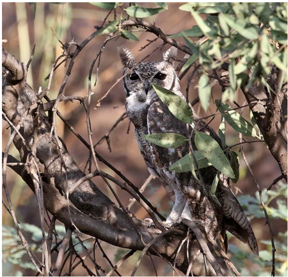
Greyish Eagle-Owl was one of the many staked out birds at Lake Baringo.