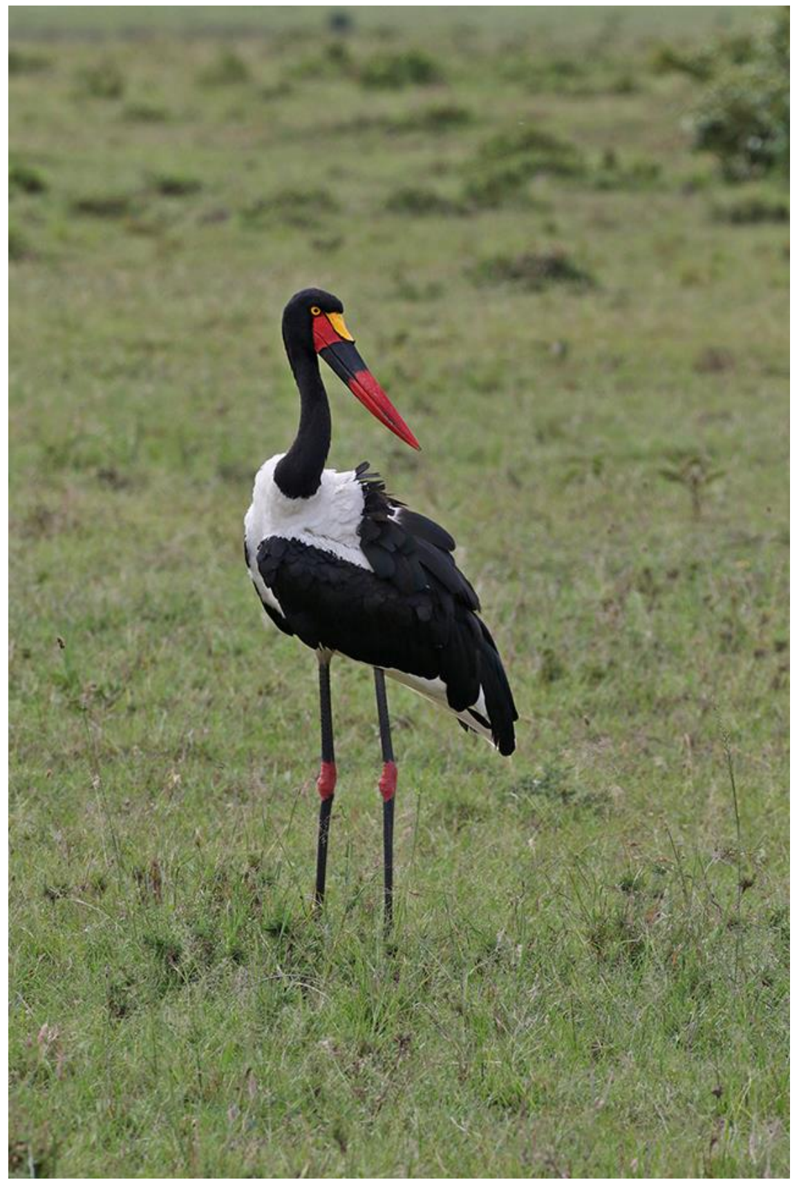
The regal Saddle-billed Stork.