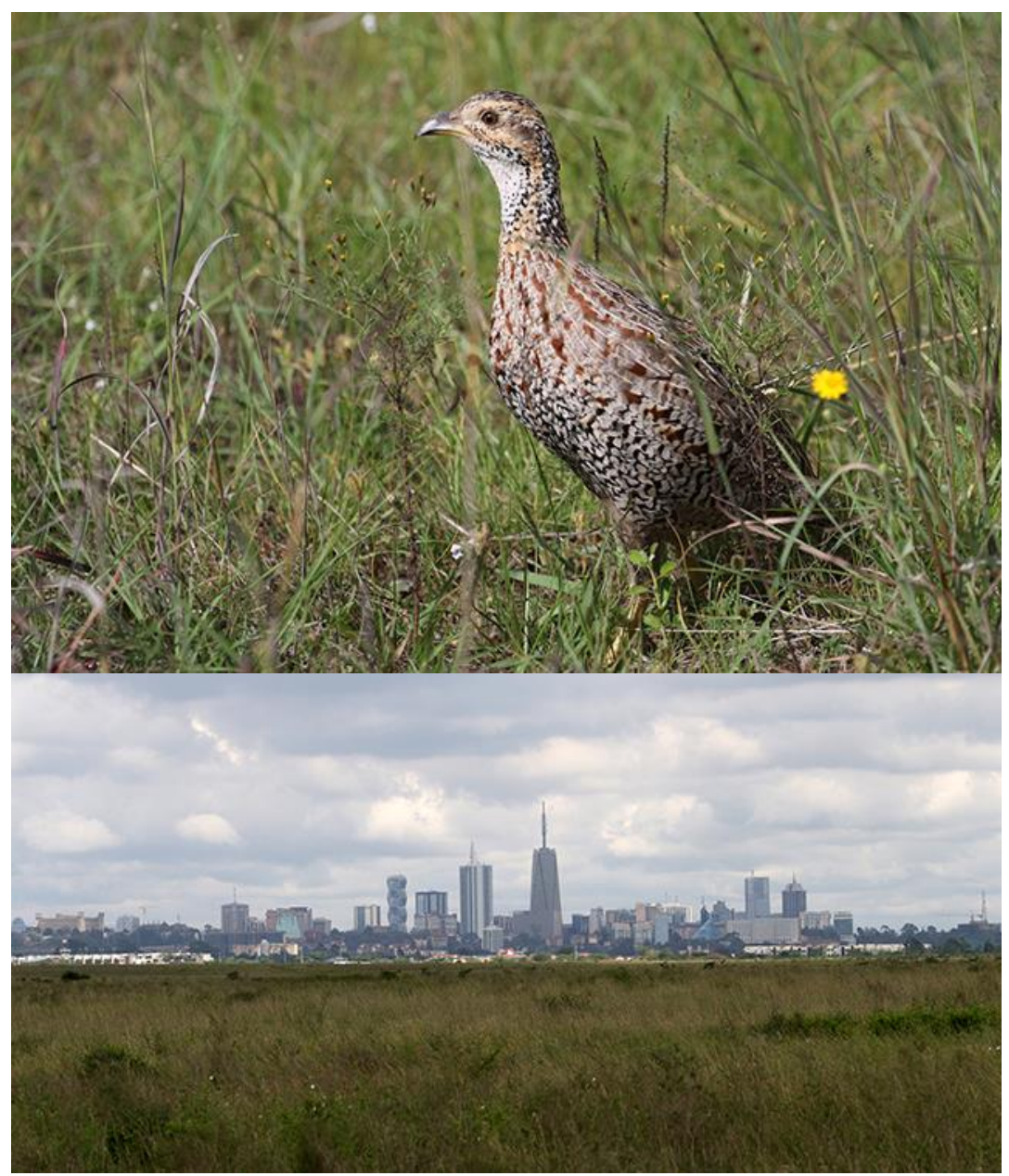
Shelley's Francolin & the urban backdrop of Nairobi National Park.

In the afternoon, we added some nice raptors, including Black-winged Kite , the enormous Lappet-faced Vulture , Tawny & Steppe Eagles and the unique Secretarybird . We also had our first Hamerkop which was a welcome sight to one member of the group who is trying to photograph all the worlds bird families. Next, we had one of the highlights of the day. In some open grassland, I heard some distant Shelley's Francolins which I managed to call in just next to the vehicle and they posed beautifully for photos. We continued under the imposing railway bridge into the southern part of the park. Here we saw our first Superb Starling plus Red-backed Scrub-Robin , Yellow breasted Apalis and Pale White-eye . Our time was running out and we looped around back towards the park entrance. On the way out, we came across hundreds of Cape Buffalo , attended by both Red-billed & Yellow-billed Oxpeckers . Here we also added the diminutive Pectoral-patch Cisticola high up in the sky, doing its flight display. Amazingly this was our 9<sup>th</sup> cisticola species of the day! We left the park by a different gate where we had a few lastminute additions of Streaky Seedeater , White-browed Sparrow-Weaver and Red-billed Firefinch taking our daily total to an incredible 125 bird species!