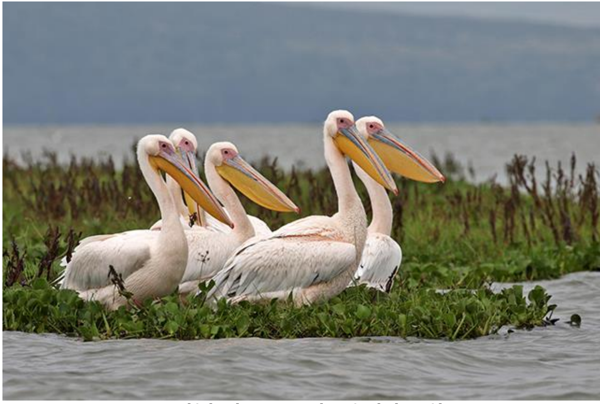
Waterbirds galore on our Lake Naivasha boat ride.

Before leaving Lake Naivasha, we had a boat ride planned on it. After an amazing breakfast buffet at our plush hotel, we packed up and drove the short distance to the edge of the lake where the boats were waiting. Before boarding, we had a pair of Gray Crowned-Cranes foraging through the long grass. We set off and along the edge of the water we had a lot of close birds providing wonderful photographic opportunities of Yellow-billed Stork, Goliath Heron, Giant & Pied Kingfishers and African Fish-Eagles . As we moved out onto the open water we saw numerous Gray-hooded Gull, Gull-billed, White-winged & Whiskered Terns, Long-tailed & Great Cormorants and beautifully-plumaged Great White Pelicans which pattered the water as the took off and waterskied when they landed. We made our way to Crescent Island, which is a game reserve and we saw many Defassa Waternbuck and our first Blue Wildebeest . There was a huge selection of waterbirds with Hottentot Teal, Long-toed Lapwing, Black-tailed Godwit, Ruff, Little Stint and African Spoonbill , many of which were flushed up when a male Eurasian Marsh-Harrier passed by. The highlight was a rare vagrant Red-necked Phalarope . We set off back and as we pulled up to the edge of the lake saw a very close Hamerkop .