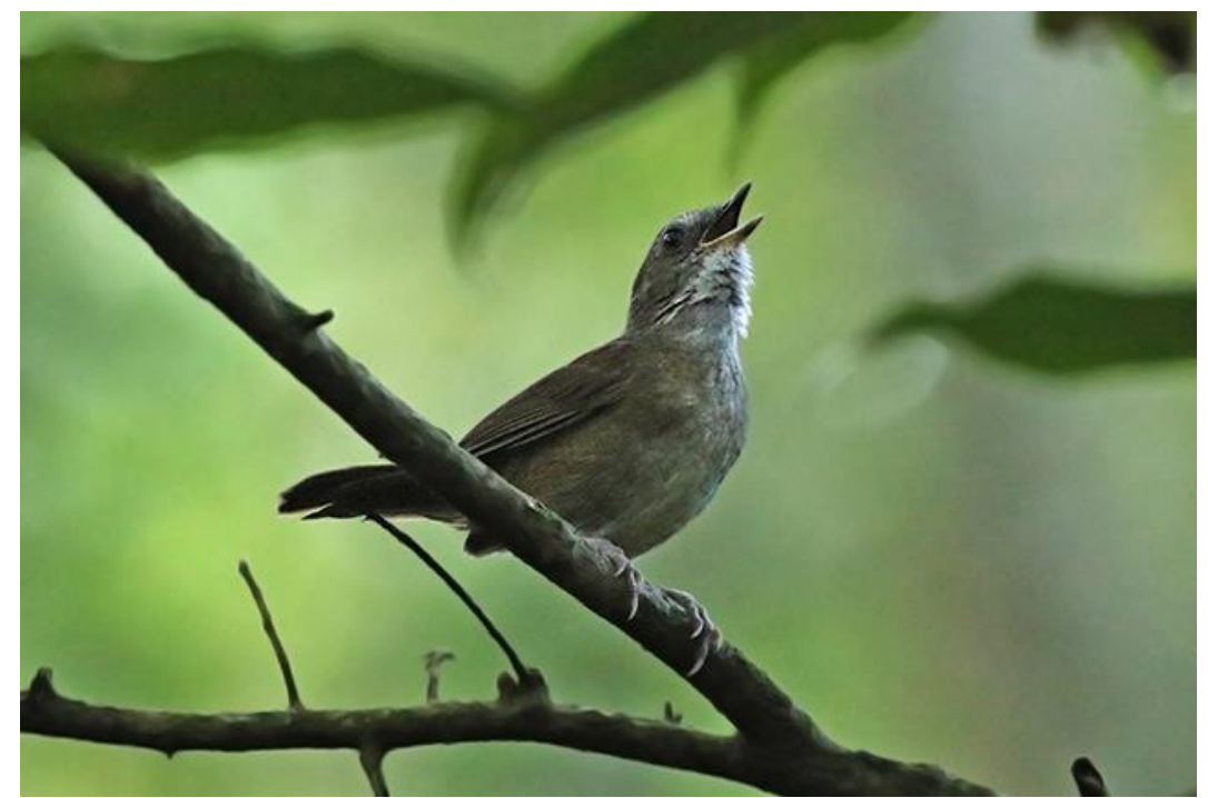
It's usually difficult to even see a Scaly-breasted Illadopsis. This one performed beautifully.

We started before breakfast by scoping African Green Pigeon, Petit's Cuckooshrike and Black-necked Weavers and taking a walk along a trail. We didn't see much but what we did see was good, with a Yellow-billed Barbet carrying food into a nest hole, a singing Scaly-breasted Illadopsis, Snowy-crowned Robinchat and a Tambourine Dove drinking from the fish pond. After breakfast, we took a walk along the road. Activity was much better and we saw a noisy pair of Chubb's Cisticolas, a pair of Luhder's Bush-Shrikes, Shelley's Greenbul, Olive-bellied & Green-throated Sunbirds, Black-billed Weaver carrying nesting material, plus our first Blackcrowned Waxbill and Red-headed Bluebill. We turned down a side track that was also pretty good. We had best views so far of Brown-throated Wattle-eyes, MacKinnon's Shrike plus first Green & Green-headed Sunbirds, Ugandan Woodland-Warbler and Chestnut Wattle-eye of the trip. Using Red-chested Owlet calls brought in our first White-tailed Ant-Thrush, Equatorial Akalat and the owlet also replied but wouldn't show itself. To top it off we found an ant swarm with several Brown-chested Alethes in attendance. Some people were either tired or were having technical problems with their camera and decided to head back to the lodge.