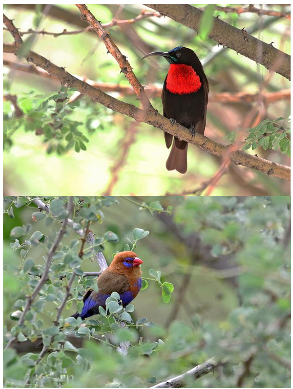
Two of Kenya's prettiest birds: Scarlet-chested Sunbird & Purple Grenadier.

We reached the parking lot of the museum and we ate our lunch under the shelter of a roof. Despite the full heat of midday, there were a surprising number of birds around us and almost every bite of our sandwiches was interrupted by another species. Here we saw Gray Wren-Warbler , Scarlet-chested Sunbird , Red-billed Quelea , African Silverbill and Yellow-spotted Bush Sparrow . After lunch we took a short walk and saw Red-and-yellow & Black-throated Barbets . We had a chance to visit the small museum with some fascinating information of the prehuman discoveries of the area. Indeed, we had so many birding stops in the morning and didn't have time to visit Lake Magadi, but not to worry, we would be visiting several similar rift lakes later in the trip. We had a few more birding stops on the way back to Nairobi adding Eastern Chanting-Goshawk , Von der Decken's Hornbill (spotted by Nyjal), both Lilac-breasted & Rufous-crowned Rollers , Buff-bellied Warbler , Red-fronted Prinia and Eastern Violet-backed Sunbird . Our last stop on the climb back up produced Augur Buzzard , Blue-capped Cordonbleu and our best views so far of Purple Grenadier . We arrived back at our hotel at a reasonable hour and some of us took advantage of a free upgrade to the adjoining 5-star hotel.