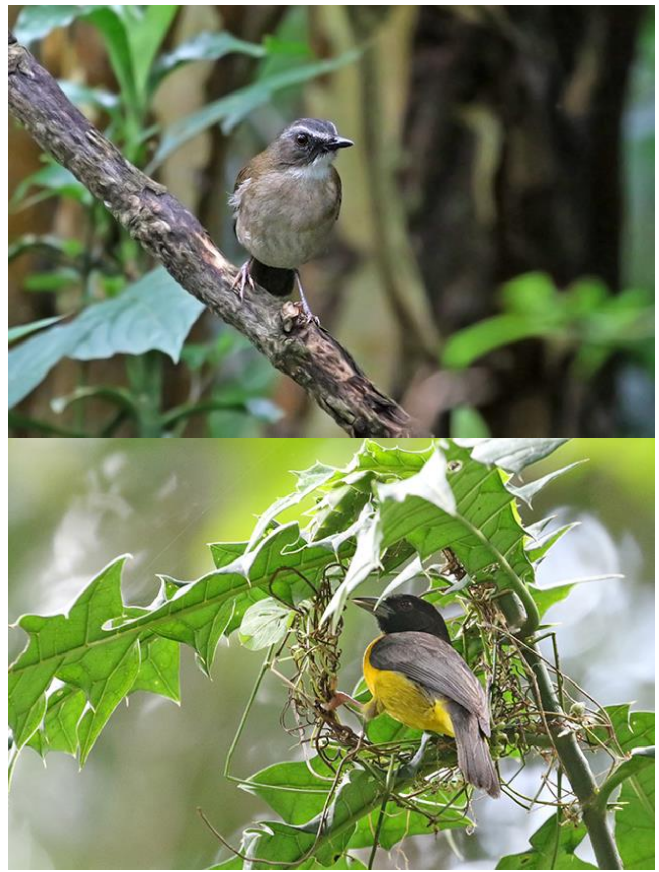
Brown-throated Alethe at an ant swarm & Forest Weaver starting its nest.