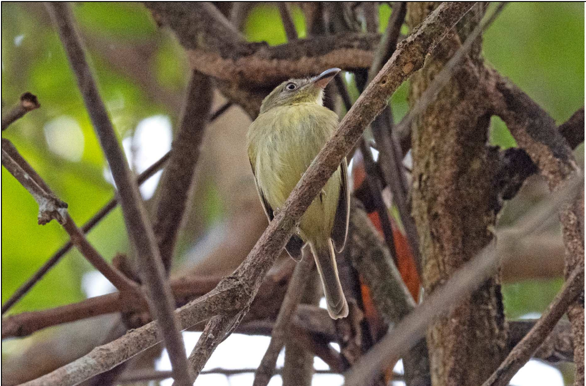
Southern Bentbill from Las Gaviotas Road and Santa Marta Antbird along the El Dorado Road.