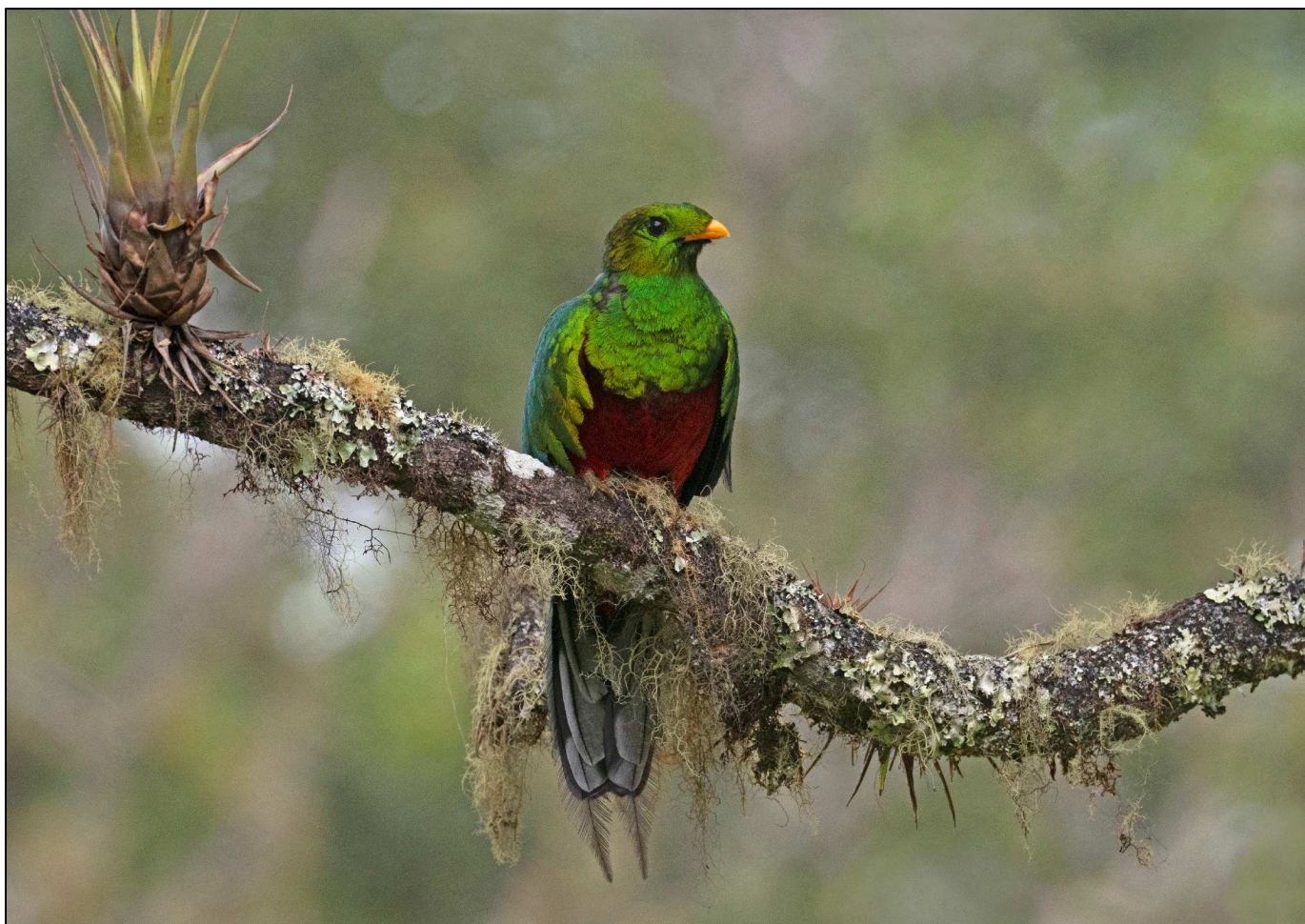
The endemic White-tipped Quetzal from the Santa Marta Mountains