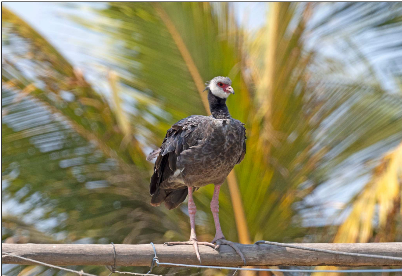
Northern Screamer from the Palermo area

Later in the morning, we did some road birding near kilometer 4. This continued to yield some great birds, like Bare-faced Ibis , Snail Kite , Wattled Jacana , Brown-throated Parakeet , Spot-breasted Woodpecker , Straight-billed Woodcreeper , Cattle Tyrant and White-headed Marsh-Tyrant . However, the most interesting sighting was aided by our driver, Virgilio , who took us to a recent spot for Northern Screamer , where this rare species was waiting for us on arrival!