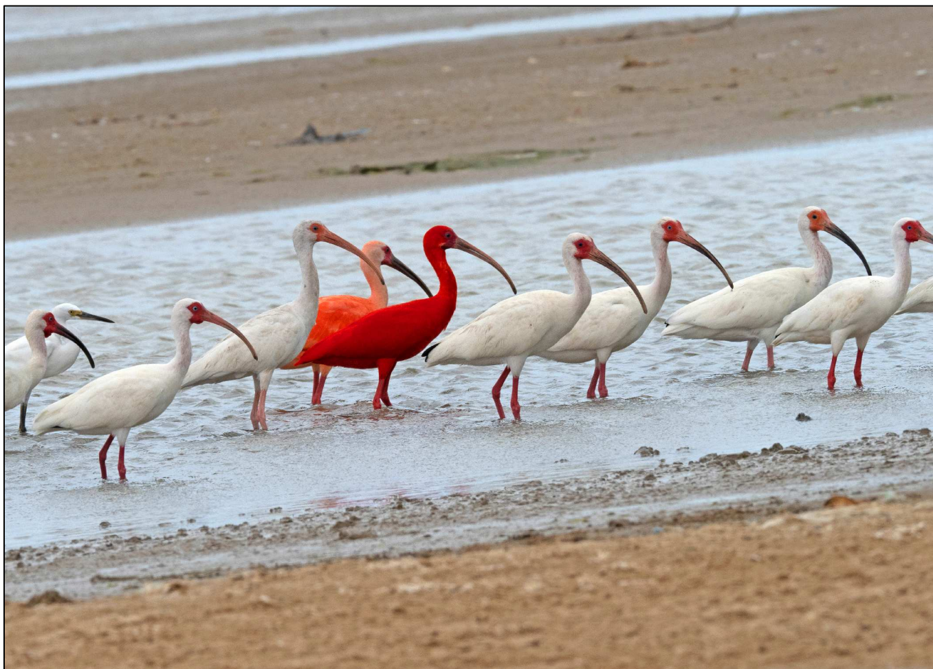
Scarlet and White Ibises from Boca Camarones near Salamanca Bird Sanctuary

Once again, we took a packed breakfast in the field with us, this time starting out at a place called Boca Camarones , which means “mouth of the shrimp”. This is where a lot of shrimp gather at the meeting of fresh and saltwater. The highlight here were the mobs of Scarlet and White Ibises , which look pretty special side-by-side, and this coastal area also featured plenty of other waterbirds, like Royal and Caspian Terns , Roseate Spoonbill , Whimbrel , Lesser Black-backed and Laughing Gulls , Black Skimmer , Brown Pelican , Magnificent Frigatebird , Black-bellied Plover and American Oystercatcher .