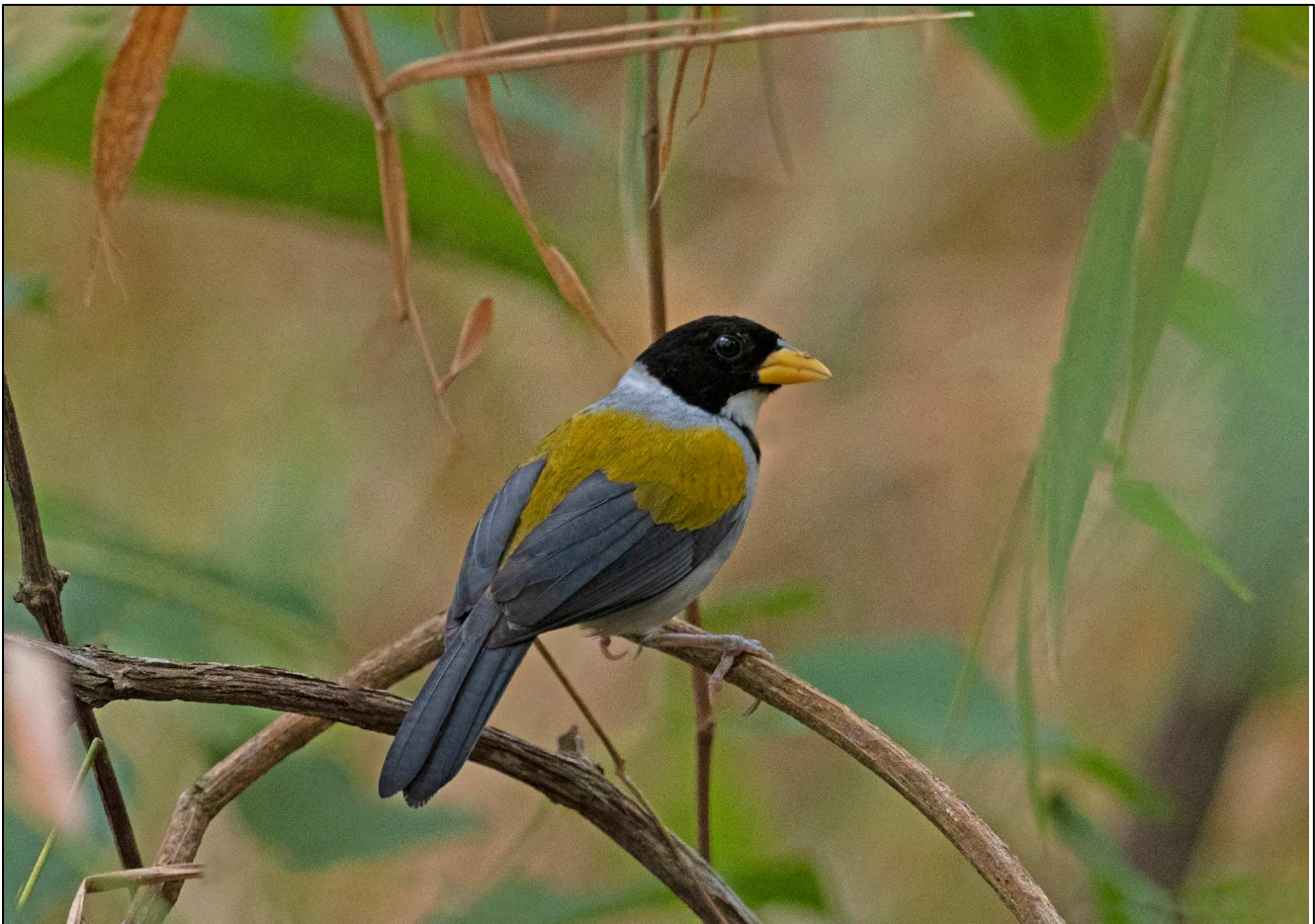
Golden-winged Sparrow in the Minca area

Later on, we headed downhill, where we saw the endemic Coppery Emerald , in addition to Rufous-tailed Jacamar, Gartered Trogon, Coopman's Tyrannulet, Sepia-capped Flycatcher, Pale-eyed Pygmy-Tyrant, Streak-headed Woodcreeper, Black-and-white Warbler, Yellow-legged Thrush, American Redstart, Thick-billed Seed-Finch and Lesser Goldfinch . Best of all was getting the endemic Golden-winged Sparrow before we left the area. On top of these species, we also saw a number in the air, including raptor species like Swallow-tailed and Plumbeous Kites, Broad-winged Hawk and Black Hawk-Eagle .