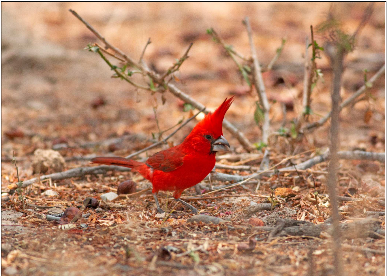
Vermillion Cardinal from Flamenco Bird Sanctuary