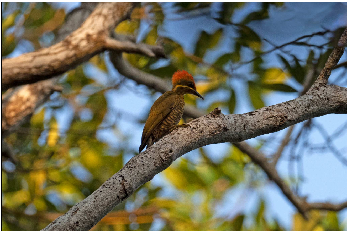
Green-and-gold Woodpecker from Isla Salamanca