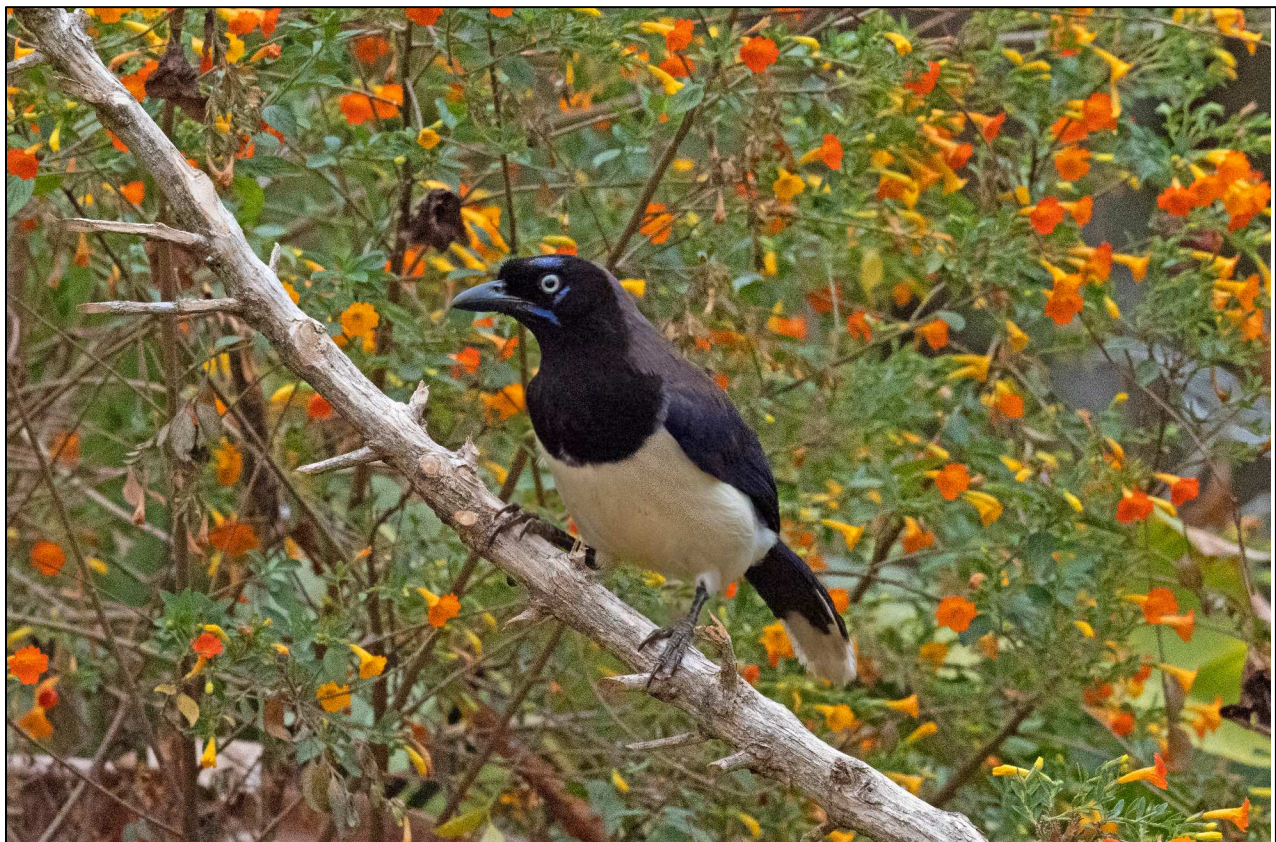
Black-chested Jay at El Dorado Lodge

After covering the higher elevations the day before, on this day we focused in and around the lodge, lower down and closer to home. The birding started right on the deck of the lodge, where fruit feeders and hummingbird feeders drew in a bounty of interesting species, like Blue-naped Chlorophonia , Band-tailed Guan , Black-chested Jay , Crowned Woodnymph and the very scarce Lazuline Sabrewing .