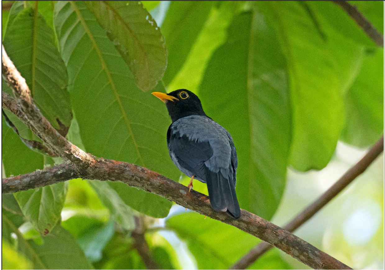
Yellow-legged Thrush from near Minca

After packing up and loading up our bags on the jeeps, we started driving downhill where we met once again with our original driver Virgilio . There was time for one final stop before we returned to our Baranquilla hotel for a final night, when we found another endemic, the Chestnut-winged Chachalaca , which provided a good close to the tour. In the same area, other species were found like Saffron Finch , Russet-throated Puffbird , Brown-throated Parakeet , Great Kiskadee , Gray-Kingbird and the endemic Sapphire-bellied Hummingbird one more time too.