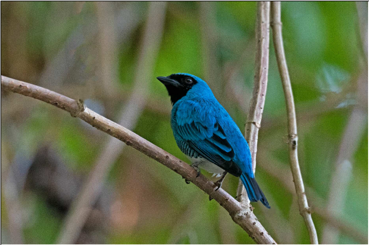
Swallow Tanager from Minca area and Yellow-baked Oriole at Colores de la Sierra