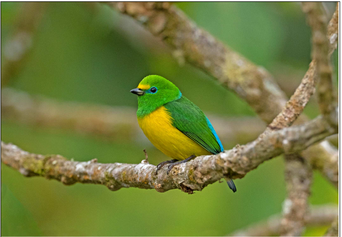
Blue-naped Chlorophonia from El Dorado Lodge