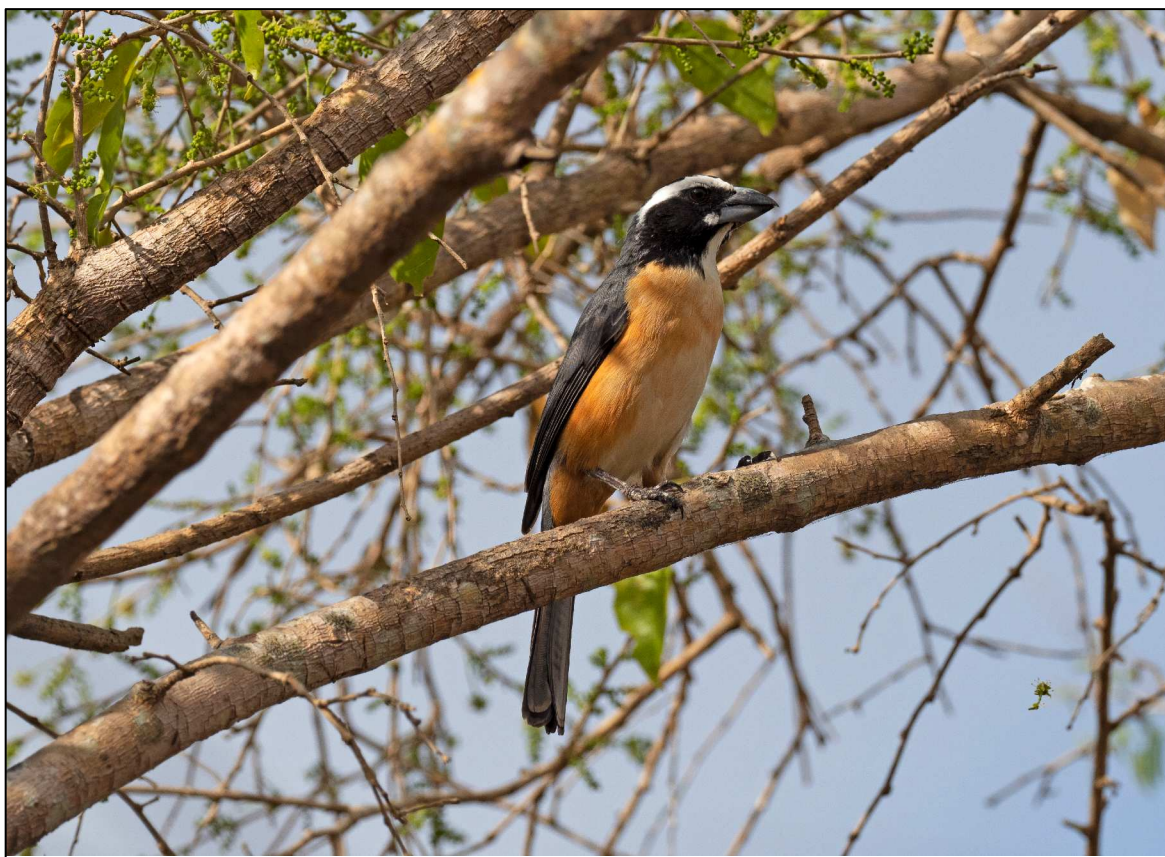
Orinocan Saltator from Los Flamencos and Rusty-breasted Antpitta along the El Dorado Road