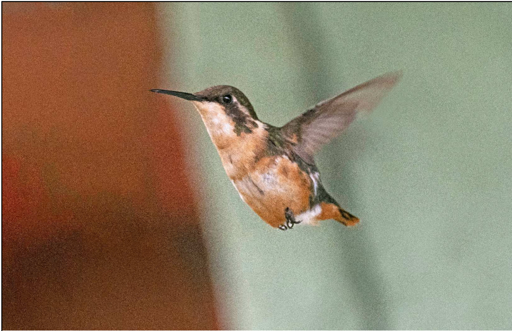
Private feeders in the Santa Marta Mountains produce these two endemic hummingbirds, Santa Marta Woodstar and White-tailed Starfrontlet