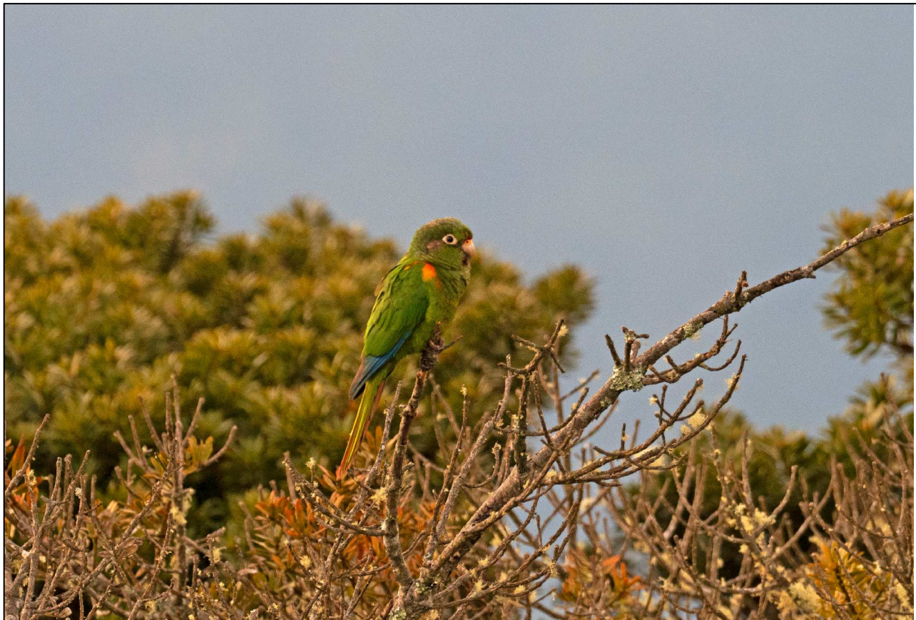
Santa Marta Parakeet from Sierra Nevada National Park