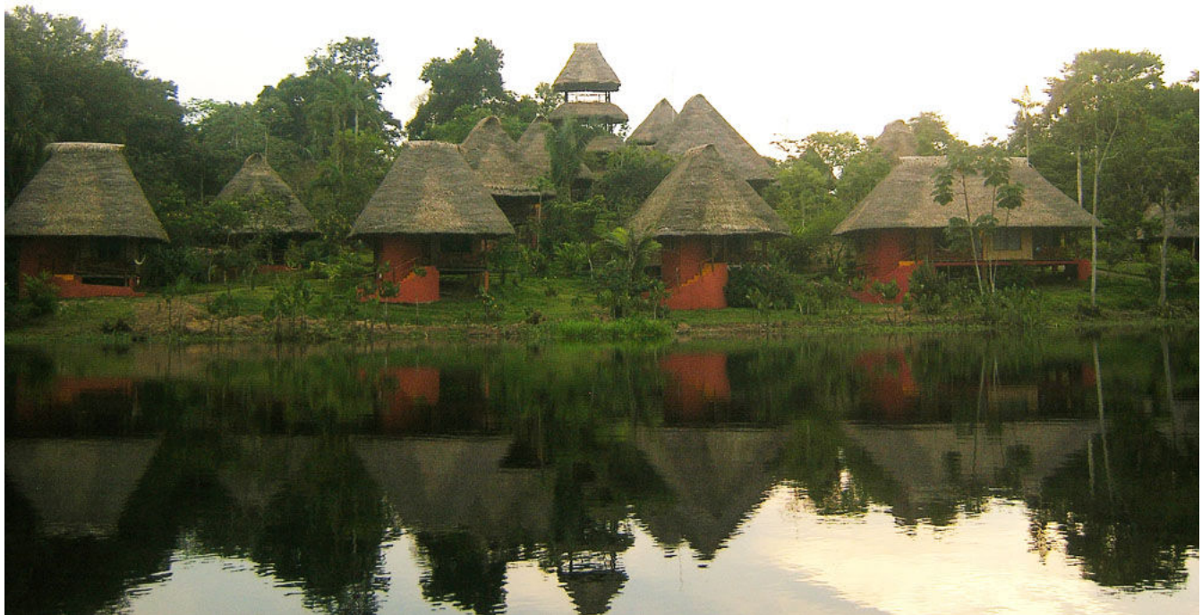
Napo Wildlife Center

13 March 13. We had an early breakfast and walked to the wooden canopy tower, which is just about 40 meters above the ground. Actually, the platform is built just below the treetop, so this high elevation view gave us a chance to search for some canopy species that you won't see from the ground. Before getting there we had great views of a Black-banded Woodcreeper , that came in to our call. Once we arrived at the tower and climbed the stairs, there were birds waiting for us, despite light rain, which