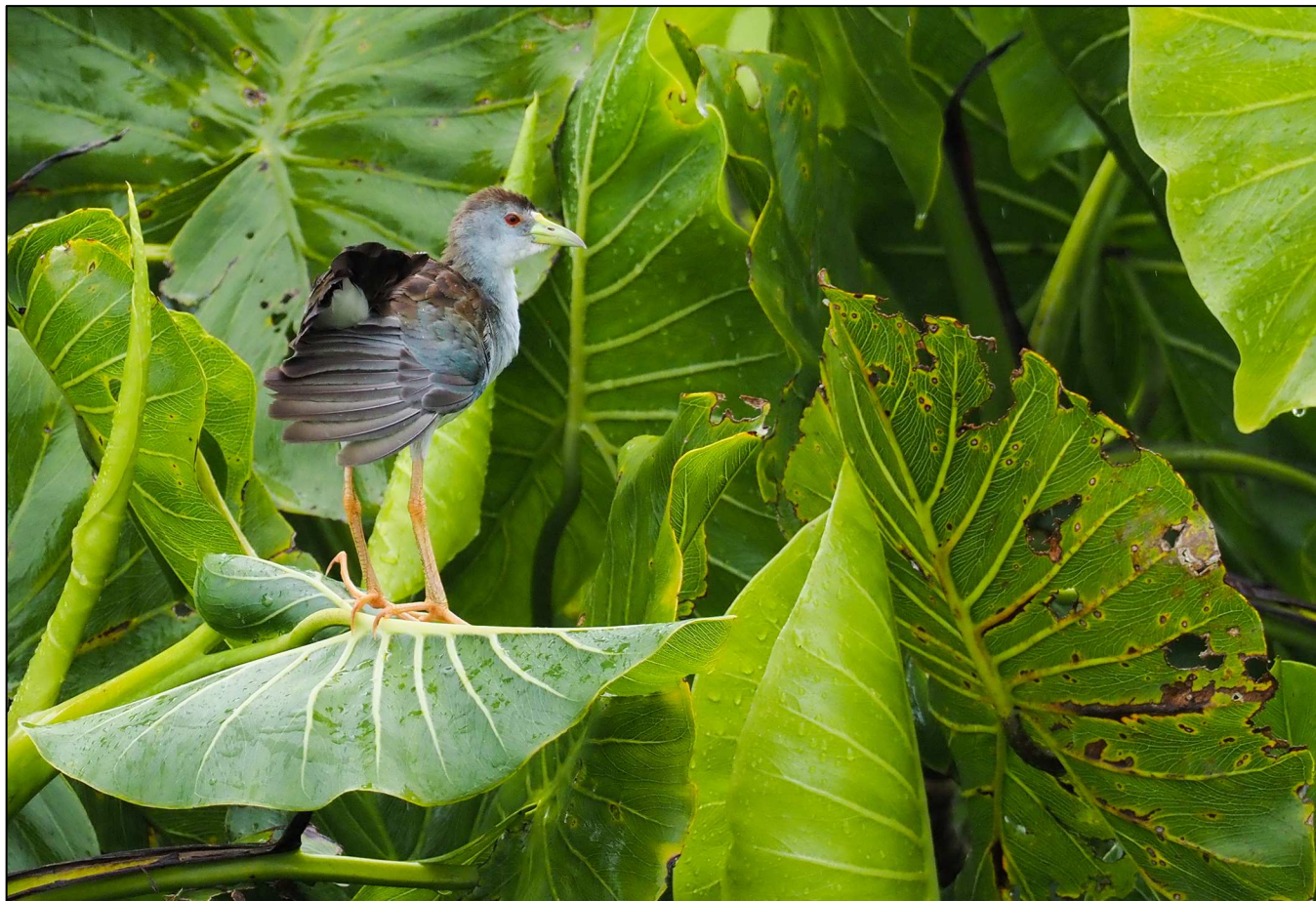
A few short boat trips on the lake at Limoncocha in the Amazon, led to us seeing the often difficult Azure Gallinule.

Aside from the feeder action, birds were moving in small flock nearby, which held Golden collared Honeycreeper , Scarlet and Summer Tanagers , Olive-backed Woodcreeper , and Tropical Parula , to round out the day.