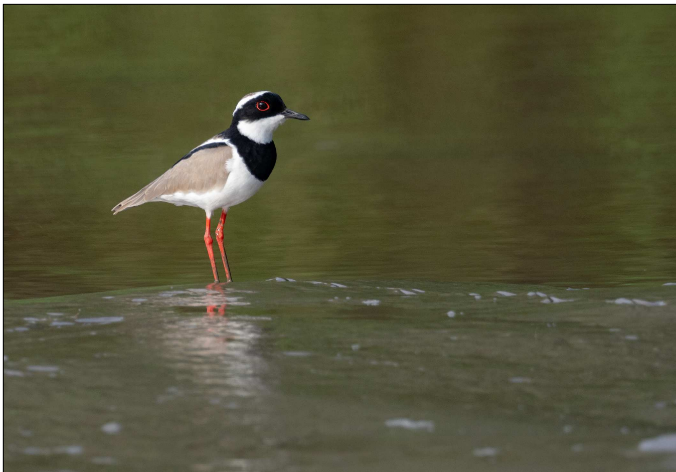
Riverside birds, seen during the short boat trip between the town and the Harpy Eagle nest site in the Amazon , included this dapper Pied Plover (Lapwing).