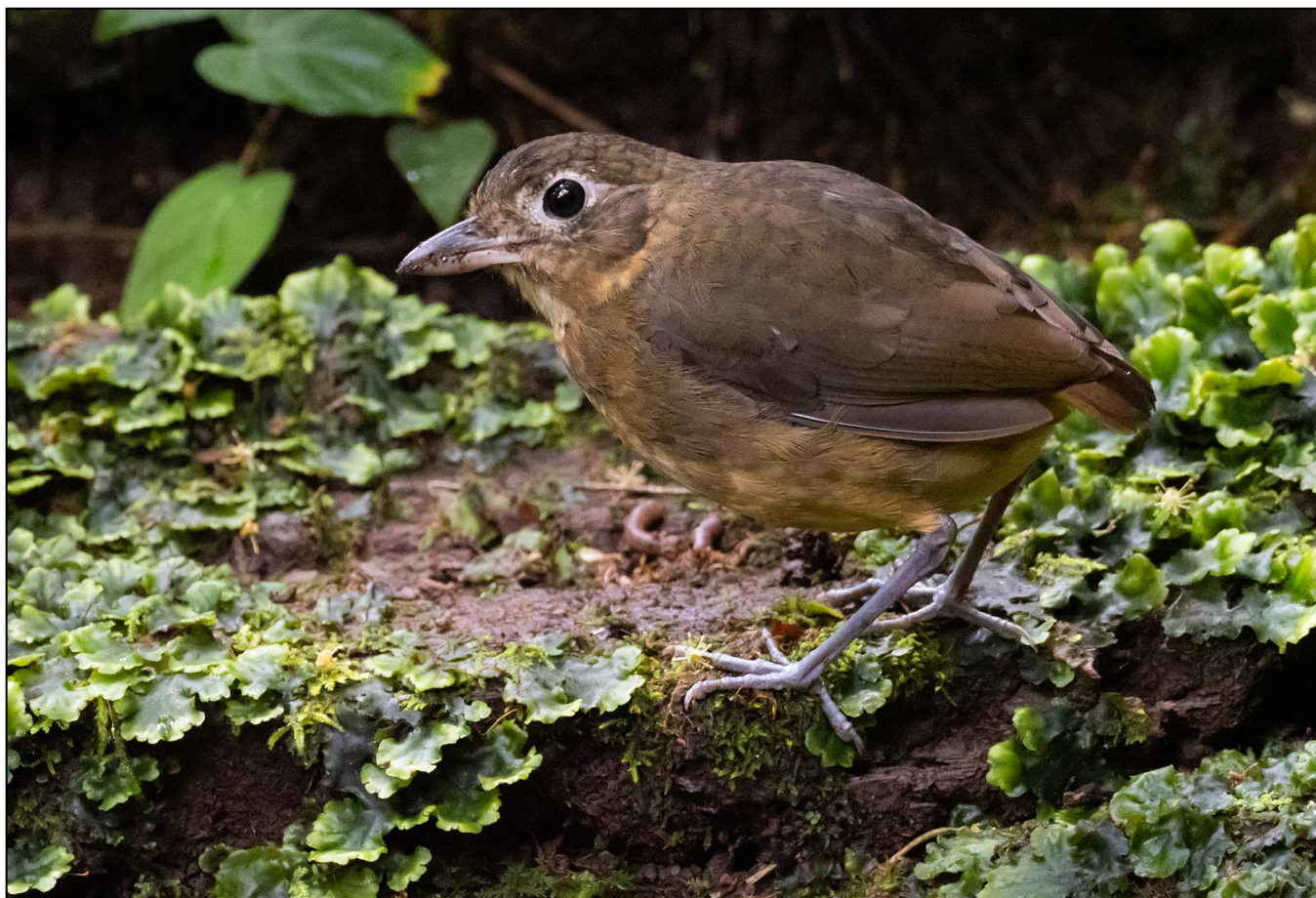
Plain-backed Antpitta is one of the toughest antpittas to SEE in Ecuador. However, a now well-established forest feeding station at WildSumaco Lodge has changed all of that!

DAY 5 (1 st February): WildSumaco. The morning was spent going to get a Covid-test in Coca , due to international rules now necessitating this, and birding to and from there. This produced some excellent species, like Fiery-throated Fruiteater , Green-backed Trogon , Paradise Tanager , and Blue-naped Chlorophonia , as well as Large-headed Flatbill , Olivaceous and Rufous-naped Greenlets , Lined Antshrike , Swallow Tanager , White-thighed Swallow , and Rufous-winged Antwren . After lunch back at Sumaco , we took a different, local, trail in the afternoon, where the highlights were Short tailed Antthrush , Foothill Stipplethroat , Black-and-white Tody-Flycatcher , White throated Spadebill , plus stellar looks at a spectacular Crested Quetzal .