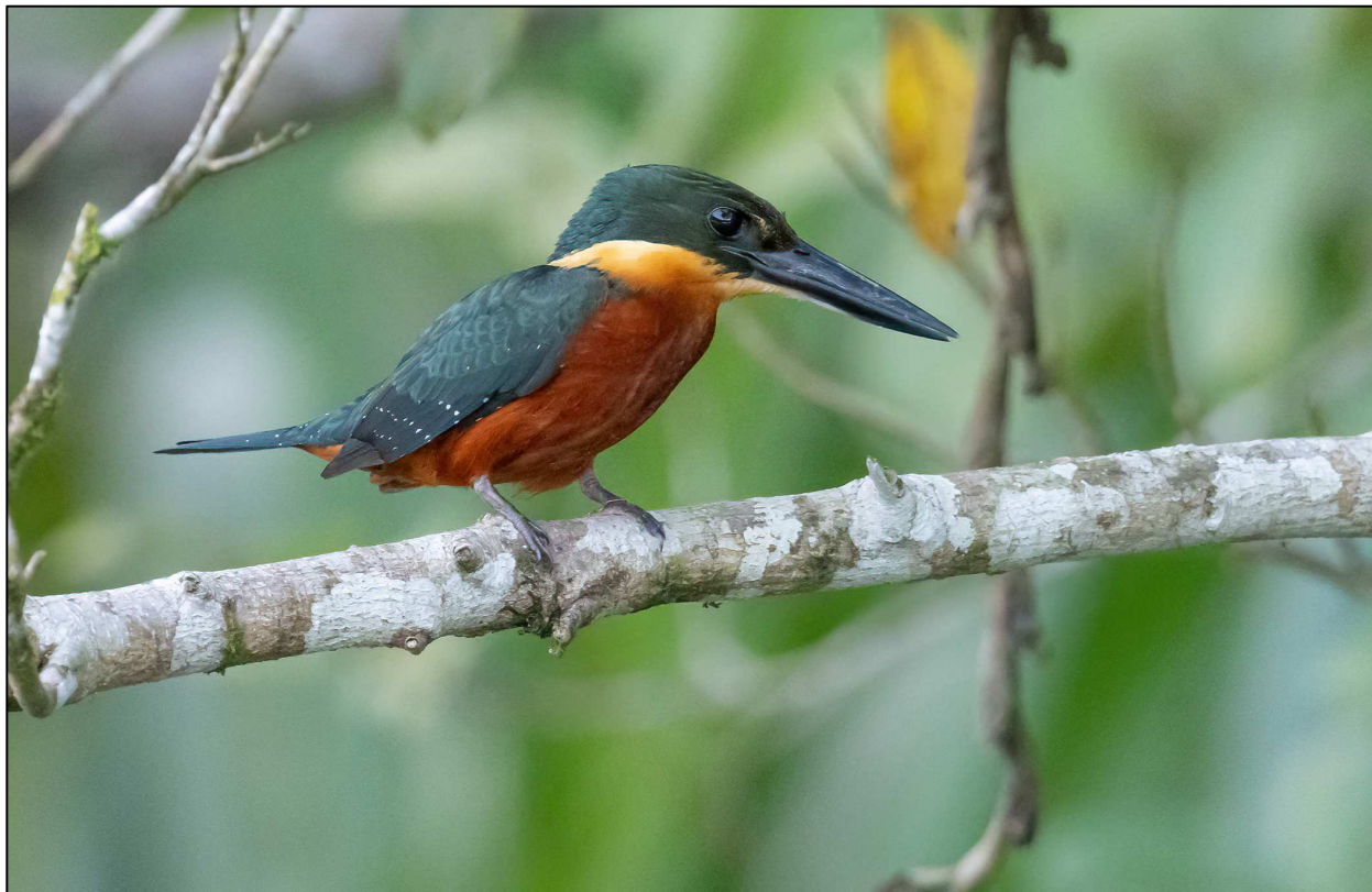
Colors of the Amazon: Green-and-rufous Kingfisher and Scarlet-crowned Barbet.