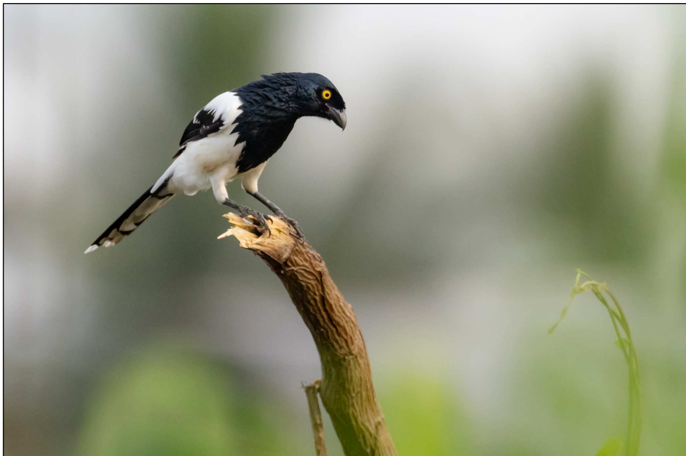
TANAGERS, like this striking Magpie Tanager, were a particular highlight of the time spent in the Eastern Foothills of the Andes at WildSumaco.