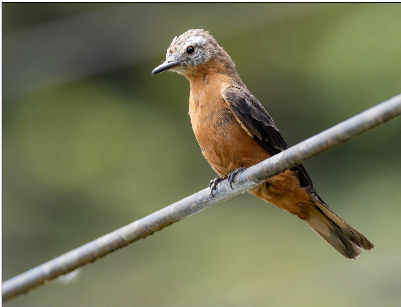
Cliff Flycatcher was found on the drive back from Sumaco to Quito.