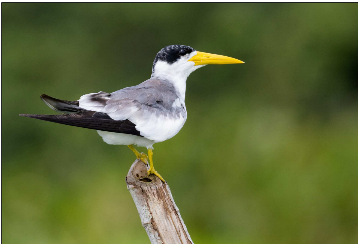
Alongside the waterways in the Amazon we found this photogenic Large-billed Tern.