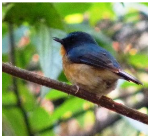
Hill Blue Flycatcher

After lunch we walked down to the Nature Study Trail spotting a beautiful pair of Velvet-fronted Nuthatches on the way. The forest was a little quiet but we did manage to find Olive-backed Pipit & White-tailed Robin . Next to the Bonsai & rock gardens where we got Chestnut-bellied Rock-Thrush & Asian Emerald Cuckoo but no Limestone Wren-Babbler despite a concerted effort. Later on we tried again at km21 for the cute little Chestnut-headed Tesia with no luck but we had Buff-throated Warbler as a consolation. The last birds of the day were at a local hotel with a small waterfall home to Hill Blue-Flycatcher, Rufous-bellied Niltava and White-capped Redstart . Some really beautiful birds. We had done well to pick up so many new species for the trip and enjoyed a cold beer in the warm late afternoon.