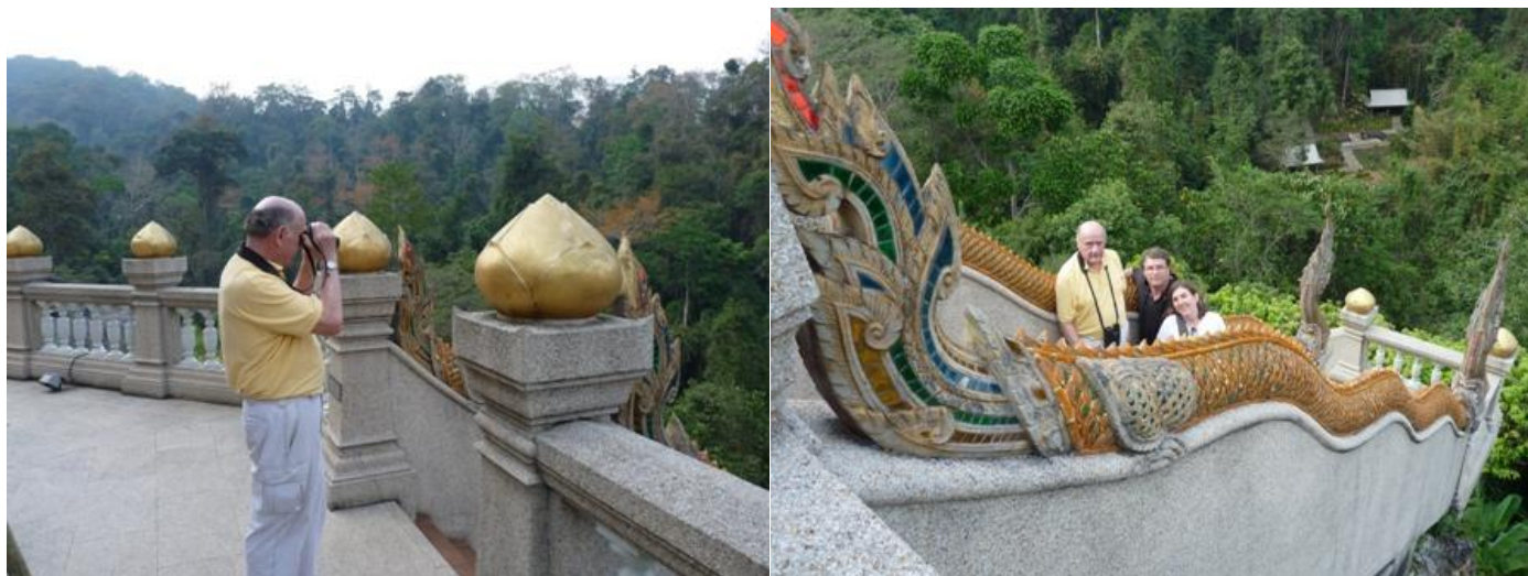
Great views from Wat Tam Pha Plong temple at Doi Chiang Dao

Today was mainly a travelling day. After a trouble free flight to Chiang Mai, we picked up our 4WD vehicle and started heading north. We had just a couple of hours to check out the famous Wat Tam Pa Plong temple steps at Doi Chiang Dao. After a delicious meal at Malee's guest house we walked along the road checking the large trees and scrub. Blue-throated Barbets were calling all over and we managed to get a nice scope view of this colourful bird. It was very quiet for birds making this stop more of a cultural one, but we did pick up several nice birds such as Black Bulbul, Black-hooded Oriole & Asian Paradise Flycatcher . We also had a nice flyby of a beautiful Emerald Dove . As we enjoyed the lovely view from the top of the temple we were treated to fantastic views of a pair of Brown-backed Needletails from above. A final treat was being shown a Grey-capped Pygmy-Woodpecker nest by a resident British birdwatcher at Malee's who gave us some great site information on other places too. After trying and failing for the Grey-headed Lapwing, we continued on to the delightful Maekok River Village Resort for a late dinner.