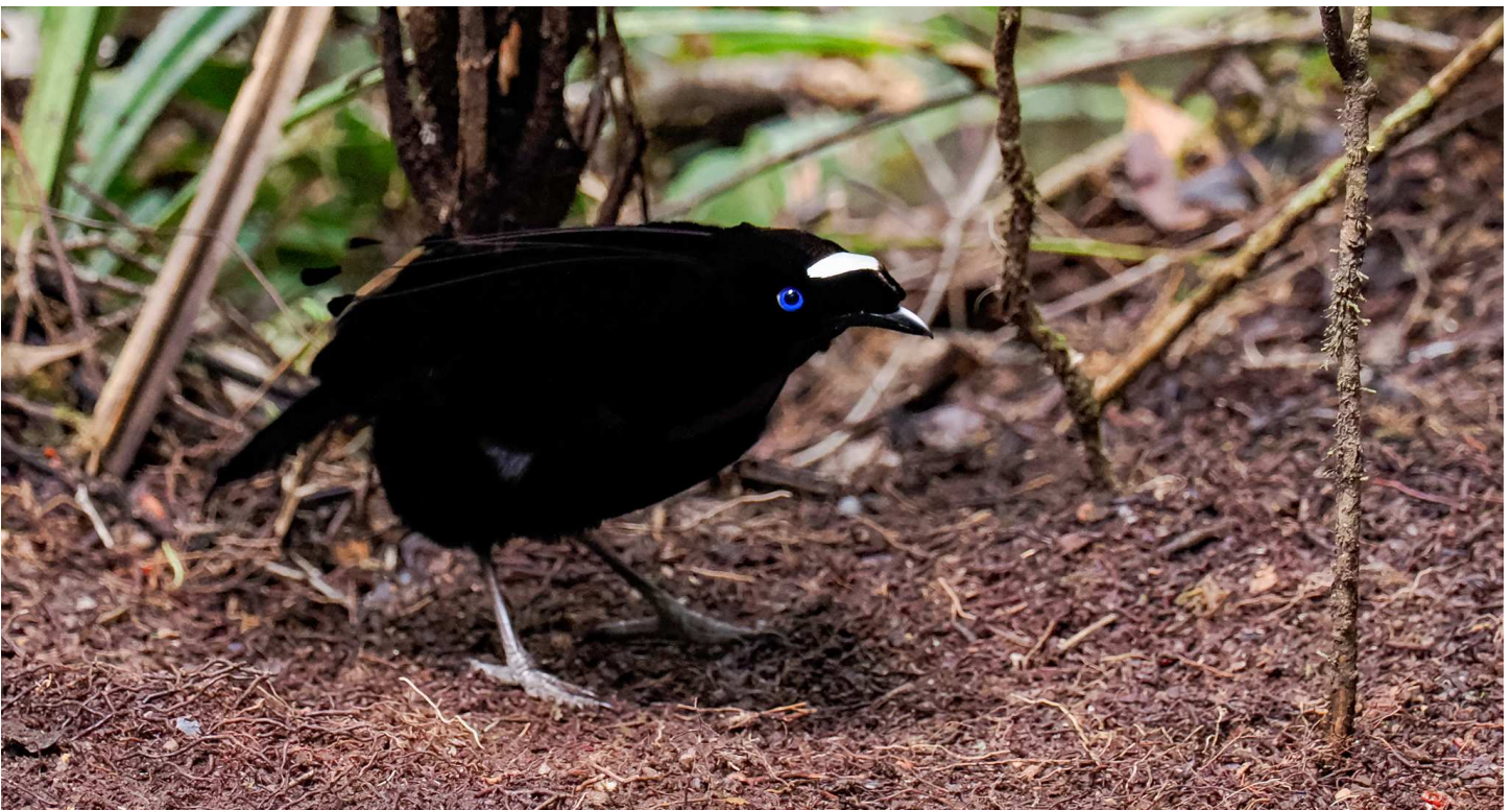
Western Parotia by Daniëlle Perdae