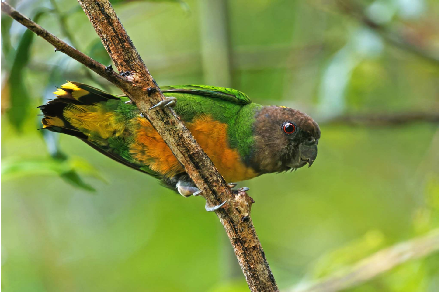
Geelvink Pygmy-Parrot by José Illanes

Kicking things off with a couple of days of birding on Biak island, those who signed up for the pre-tour extension added nearly all the island's endemic species and subspecies to their total West Papua haul, as well as some other bonuses; thanks in no small part to the bonus morning's birding we enjoyed on our first day, owing to the early arrival of all members of the group.