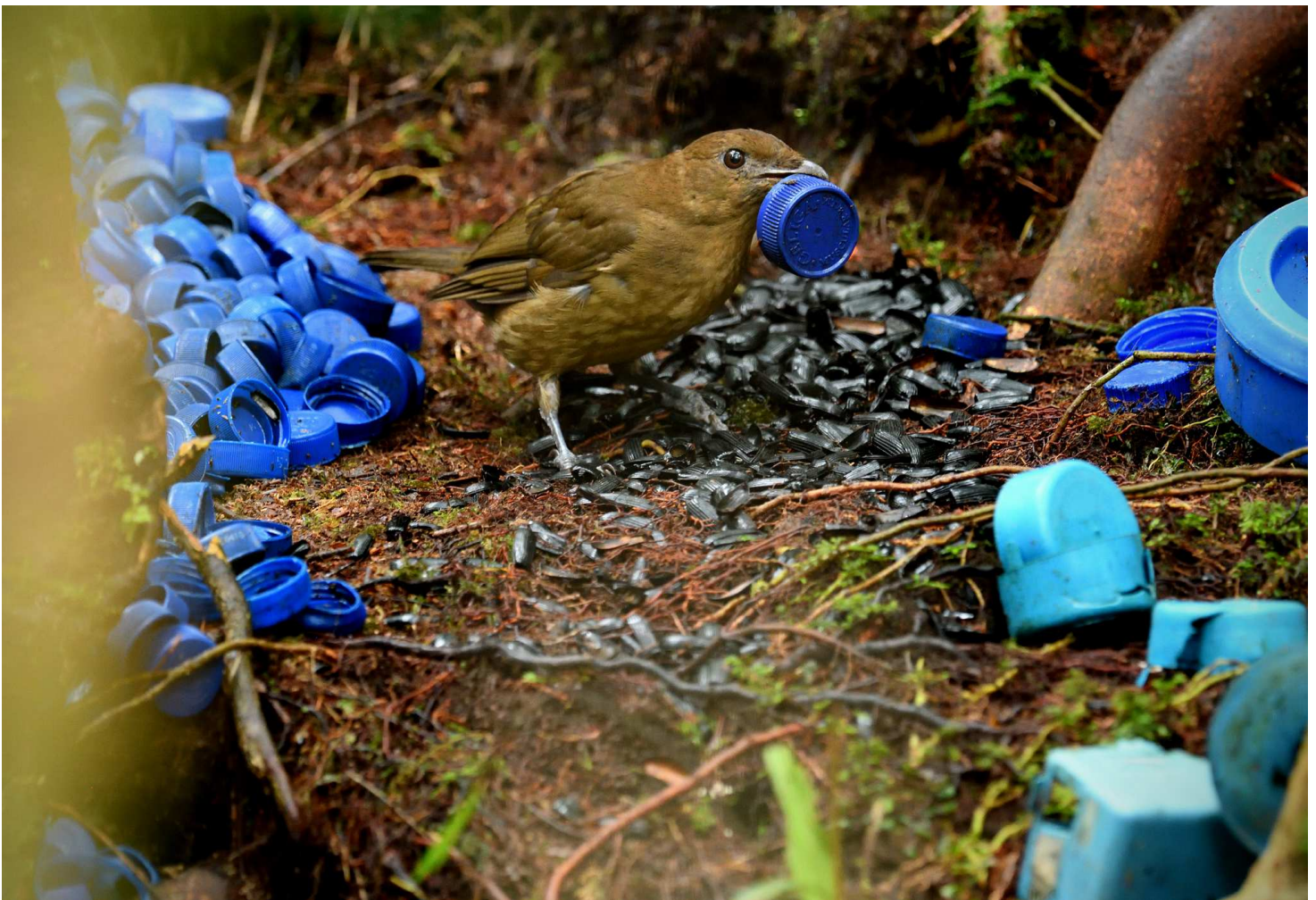
Vogelkop Bowerbird