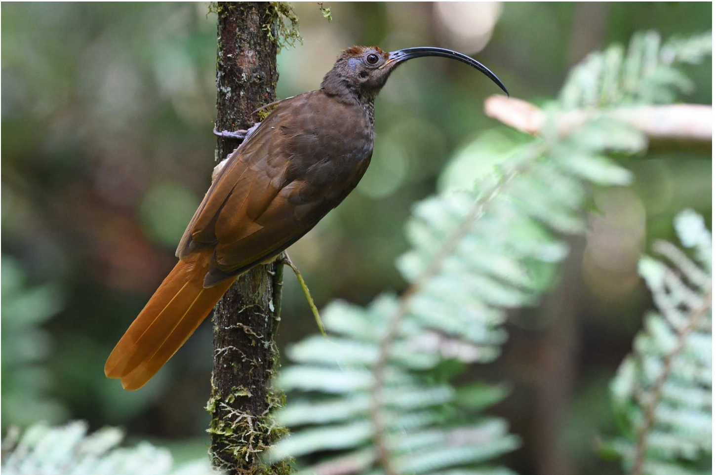
Black-billed Sickbill

The Arfak mountains were next on the agenda, and so we winged our way across Cenderawasih Bay to Manokwari, had a quick lunch, and set off for our drive to base-camp in Minggre village. Stopping along the way, we managed to pick up a few new species, including our first Vulturine Parrots of the trip, but our real Arfak adventures were only to begin the next morning.