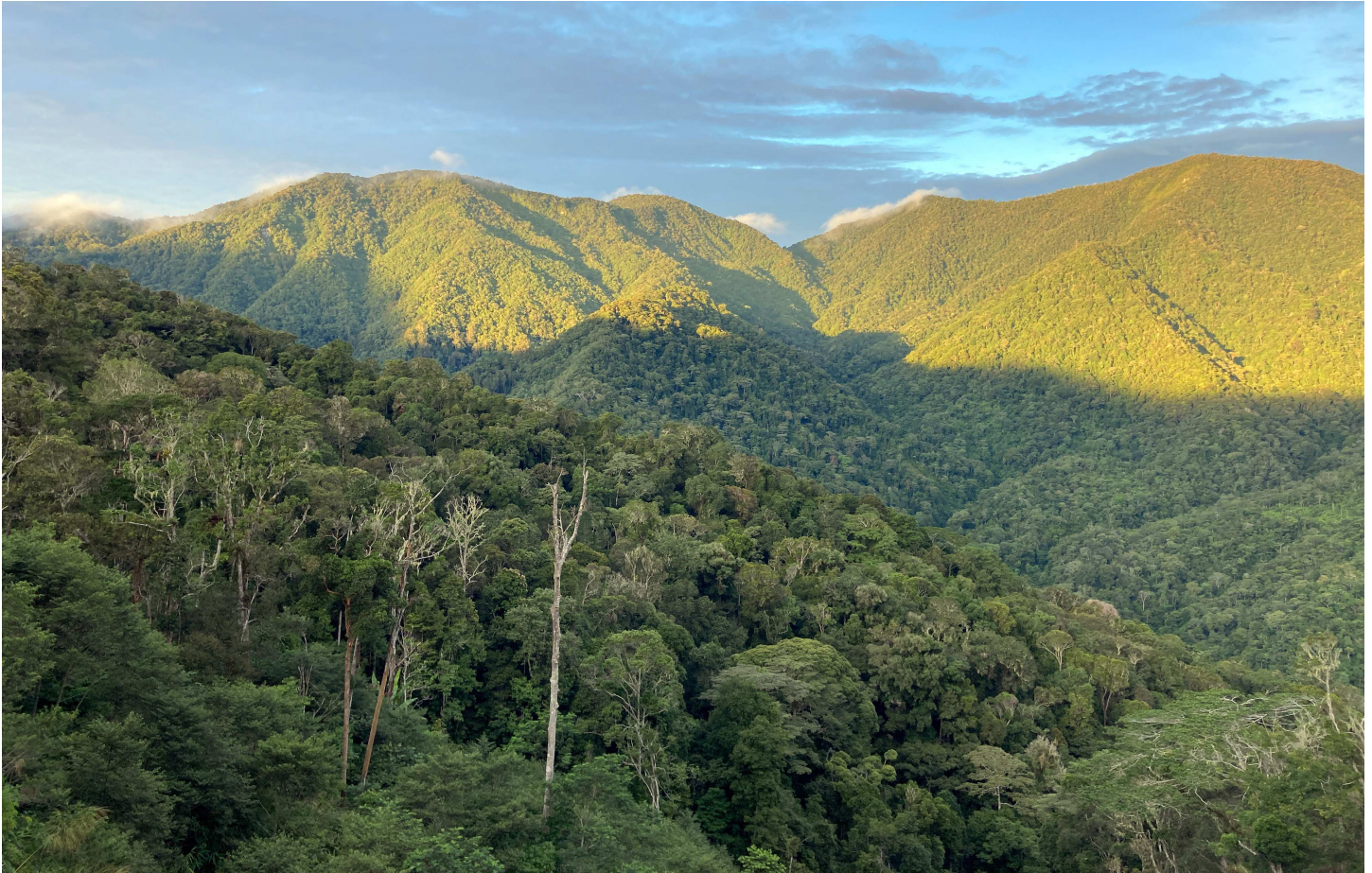
New Guinea Landscape by Daniëlle Perdaen