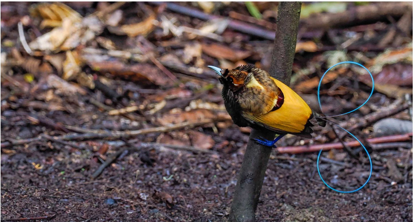
Magnificent Bird-of-Paradise by Daniëlle Perdae