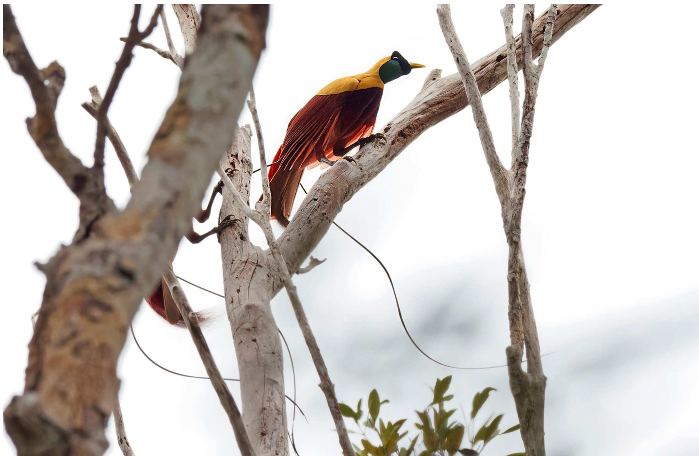
Red Bird-of-Paradise by José Illanes