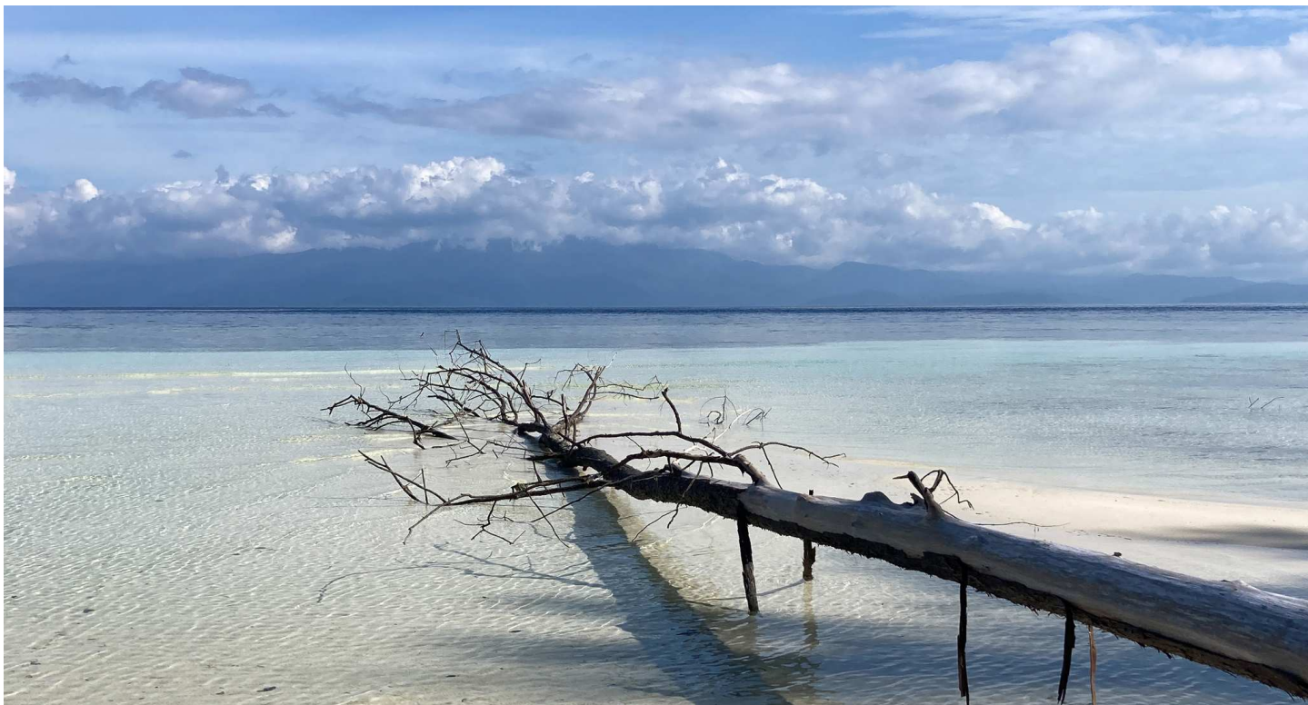
Merpati Island Scenery