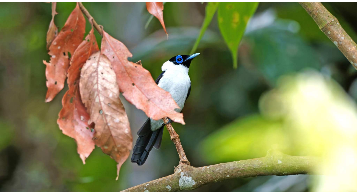
Frilled Monarch