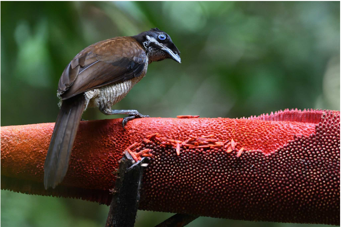
Western Parotia (female) by Rich Lindie

For our second morning in the Arfaks, we made our way into the valley above Syoubri Village, where top sightings included both Tit-Berrypecker and Mottled Berryhunter , a small flock of Orange-crowned Fairywrens and two Spotted Berrypeckers , followed by a short-but-steep hike from basecamp to see a roosting Mountain Owlet-Nightjar . For the afternoon, we started with a visit to a couple of hides overlooking Magnificent BoP display courts, where we all got to see this well-named bird, and where some got to see its mesmerizing display. After that, some birding along a nearby stretch of road produced a wonderful flock that held several Goldenface and Drongo Fantails .