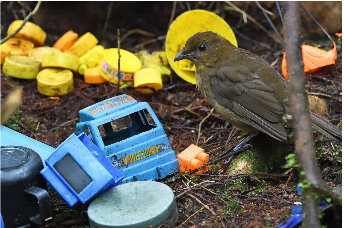
Vogelkop Bowerbird by Rich Lindie

After a photo-shoot and a somewhat ceremonial fairwell from our hosts at camp, we made our way down to the foothills, where some fast-paced birding bagged us Northern Variable Pitohui , Friiled Monarch , Greater Black Coucal and Golden Monarch before we finally made our way back to Manokwari.