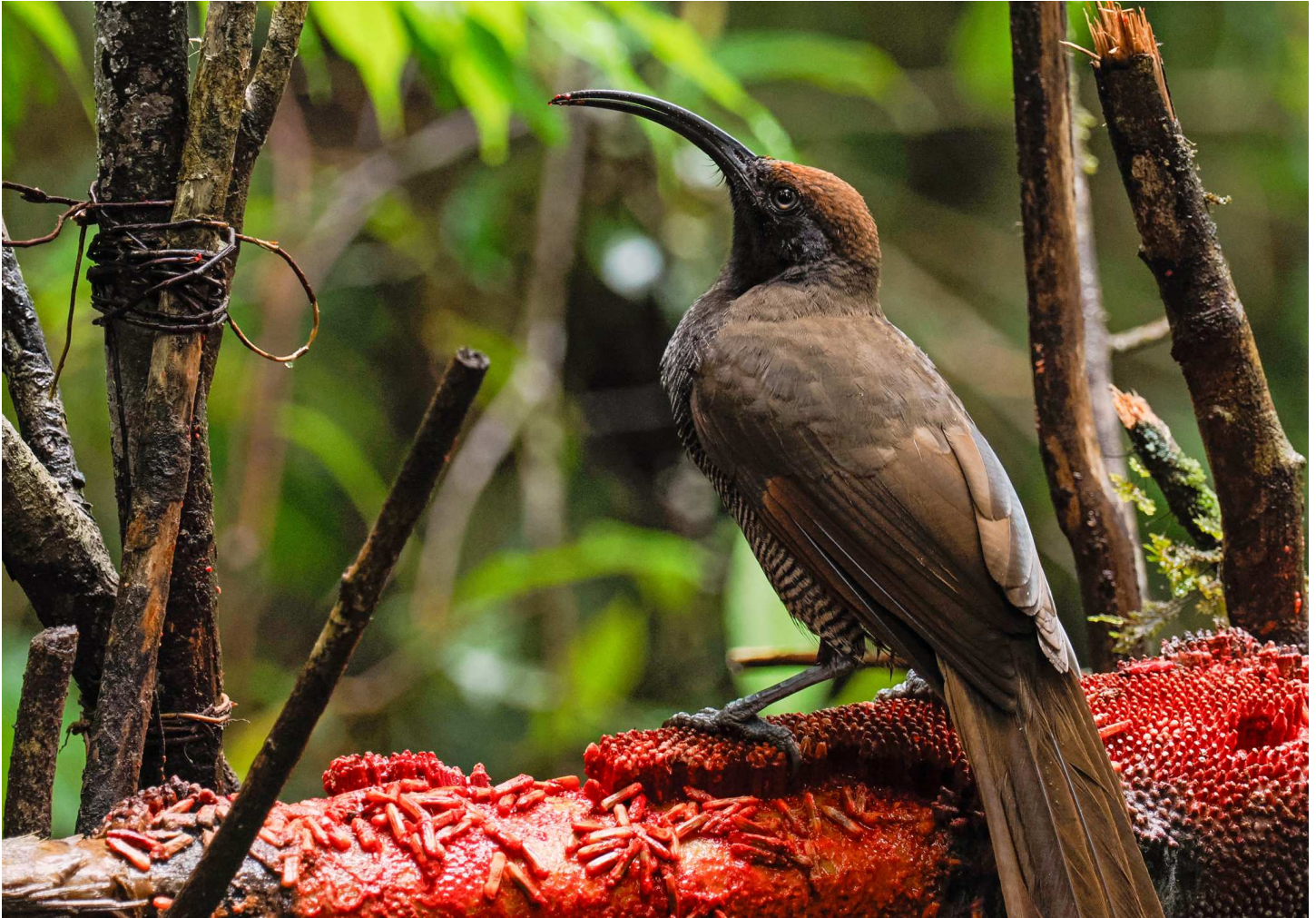
Black Sickbill by Daniëlle Perdaen