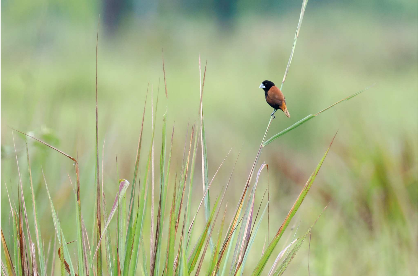
Grand Munia by Daniëlle Perdaen

For our second morning in the area, revisits to the tower and the trails behind the lodge provided yet more firsts, as well as some appreciated further looks at species seen only the day before, while the afternoon saw us dodging rain storms at the KM9 viewpoint, where bird activity was incredibly slow, though this was soon forgotten as our next stop was the air-conditioned lobby of our hotel in Sentani.