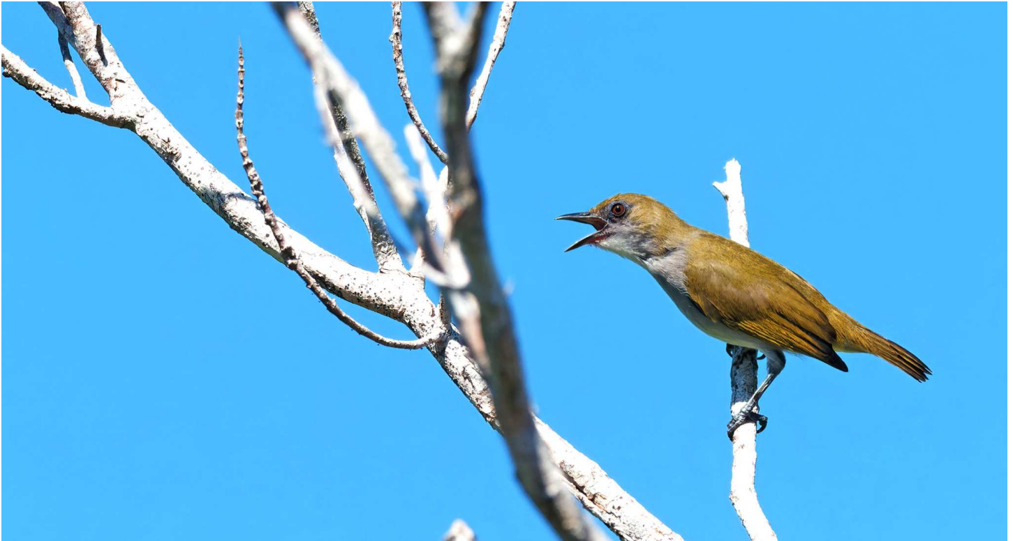
Biak White-eye