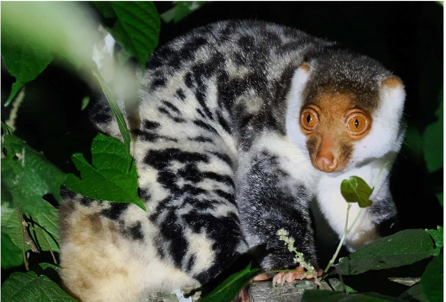
Waigeo Cuscus by Daniëlle Perdaen

Our final morning on Waigeo was spent along various stretches of road near the airstrip. It took some time but we eventually tracked down our first and only Palm Cockatoos of the trip, as well as some much-appreciated bonuses, including Lowland Peltops , Orange-fronted Hanging-Parrot and Radjah Shelduck . The ferry trip back to Sorong in the afternoon was somewhat uneventful, though we were glad to find that at least one air-conditioner was working in the cabin. A celebratory dinner at our hotel in Sorong saw in the last moments of the tour, though birding was not over, as the majority of the group went on to Jakarta the morning, where several hours produced some great birds, including Christmas Island Frigatebird!