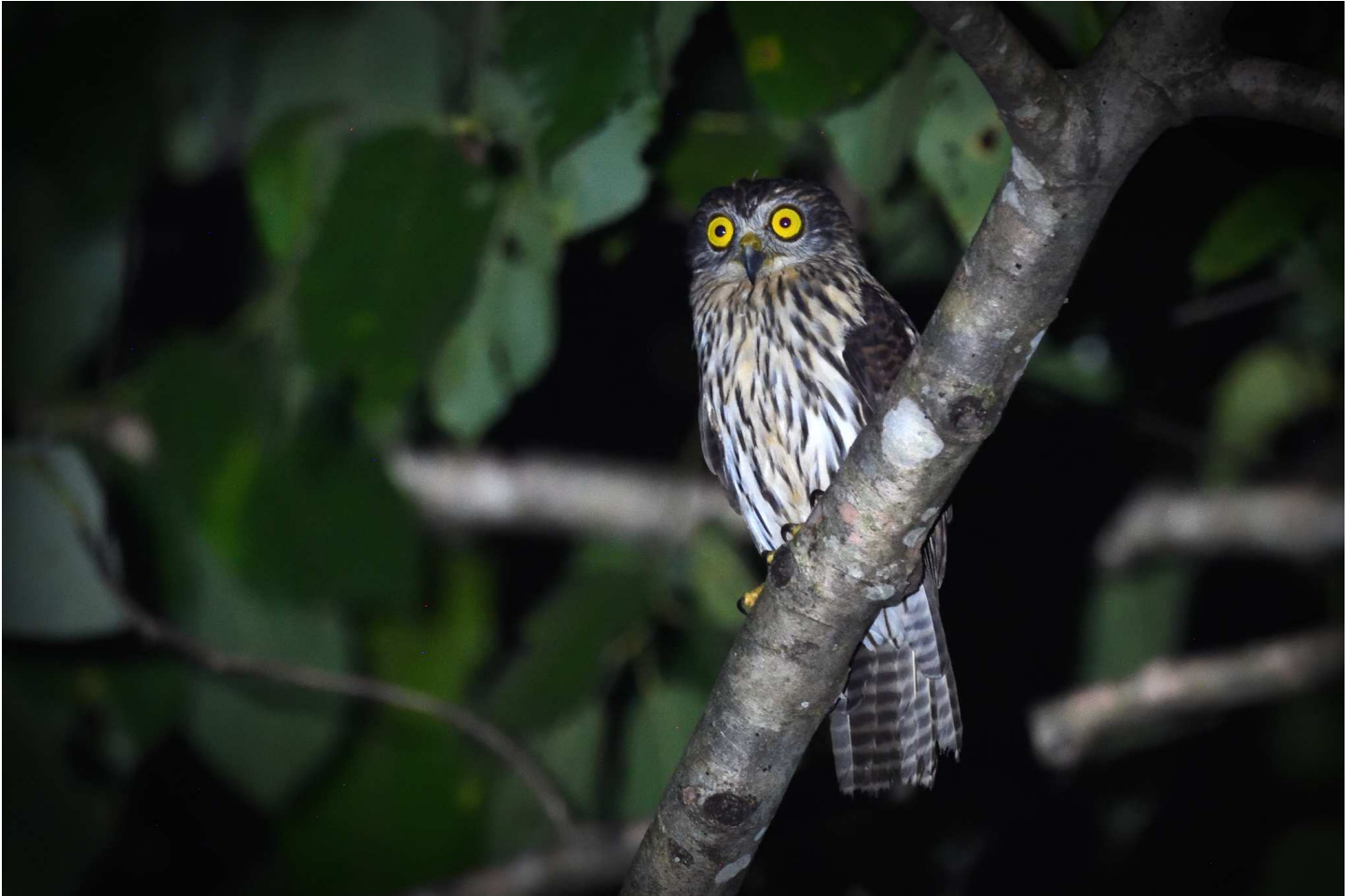
Papuan Owl

From Biak, we flew to Sentani where we collected the last of our 2023 TB West Papua family members, and made our way directly to Nimbokrang. There we spent the next two days and nights experiencing a combination of the most-humid weather of the trip and several of its most memorable sightings. Chief among these sightings were, of course, those of the first Birds-of-Paradise of the tour - four of which came within the first 24 hours! Starting with an afternoon visit to the small-but-productive canopy tower near our accommodation, where several species of cuckooshrike and honeyeater provided us with our first looks at mainland endemics, and where our very first species of Bird-of-Paradise was seen (albeit a Manucode), it finally felt like West Papua birding had begun in earnest.