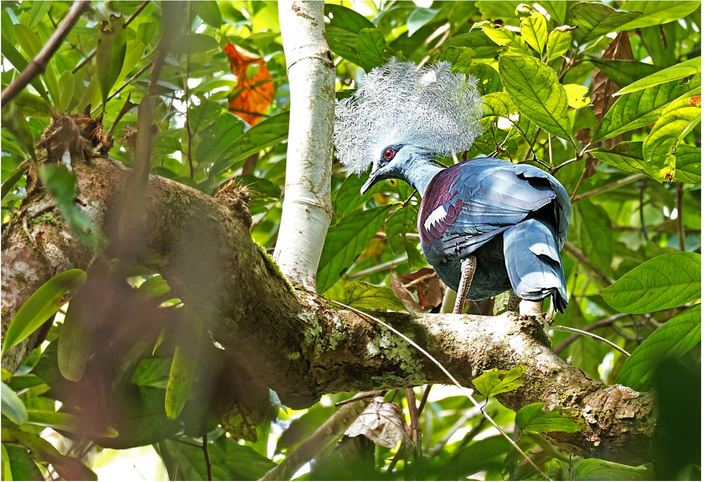
Western Crowned Pigeon by José Illanes

From Manokwari, we flew to Sorong, where we took a break at our hotel in the midday heat, and then headed out to some nearby mangroves. There, in yet more warm and steamy conditions, we finally caught up with Orange-fronted Fruit Dove and, after some patience, a gorgeous Blue-black Kingfisher !