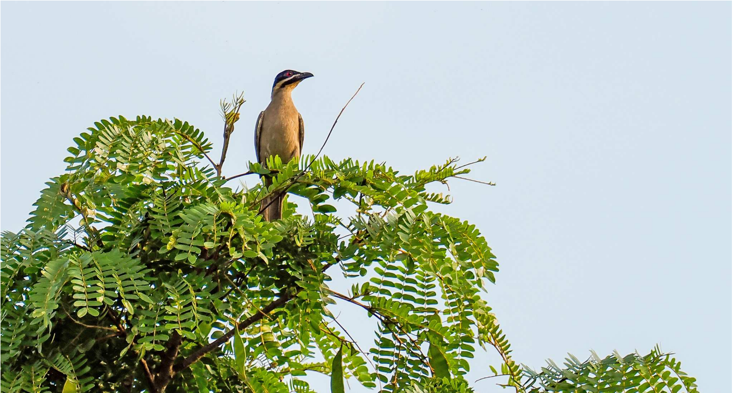
Dwarf Koel