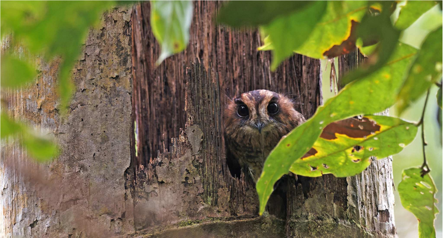
Vogelkop Owlet-Nightjar