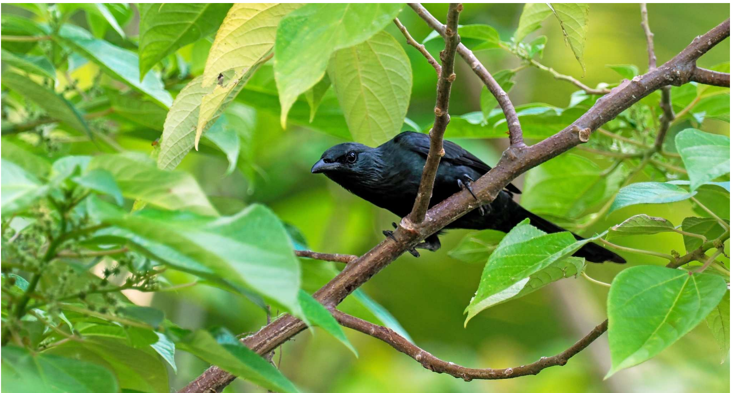
Moluccan Starling