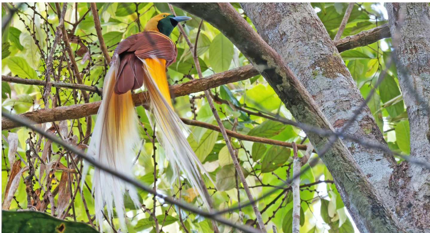
Lesser Bird-of-Paradise by José Illanes