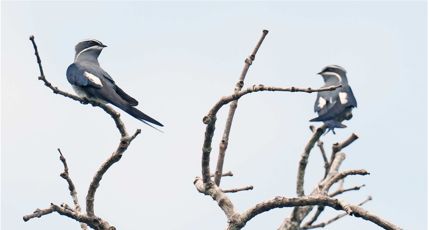
Moustached Treeswift by Daniëlle Perdaen