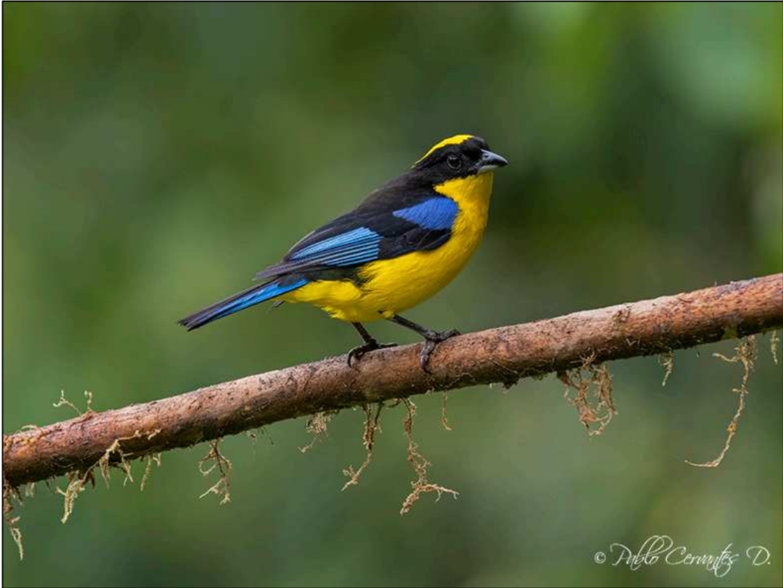
Blue-winged Mountain-Tanager (TOP) and Tayra