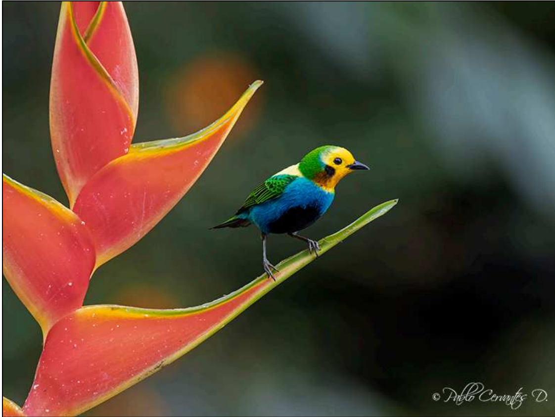
Multicolored Tanager (TOP) and Saffron-crowned Tanager