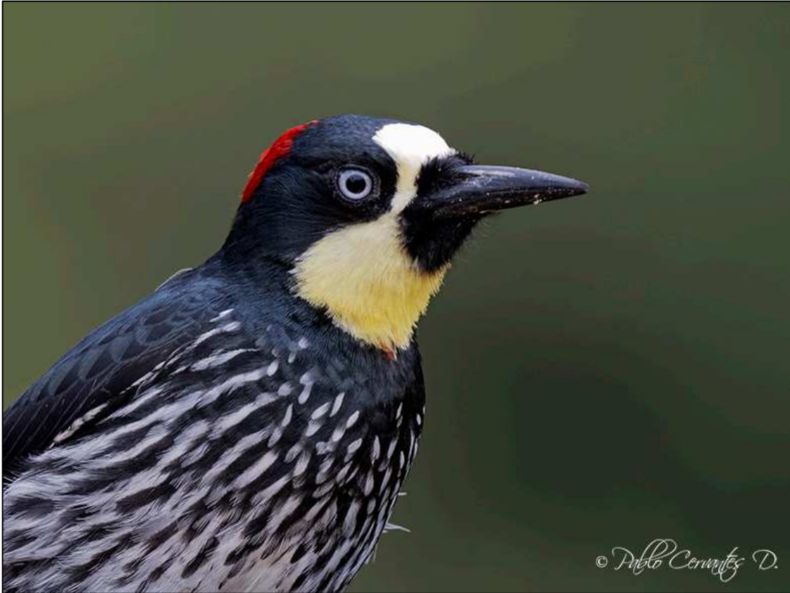
Acorn Woodpecker (TOP) and Slaty Brushfinch