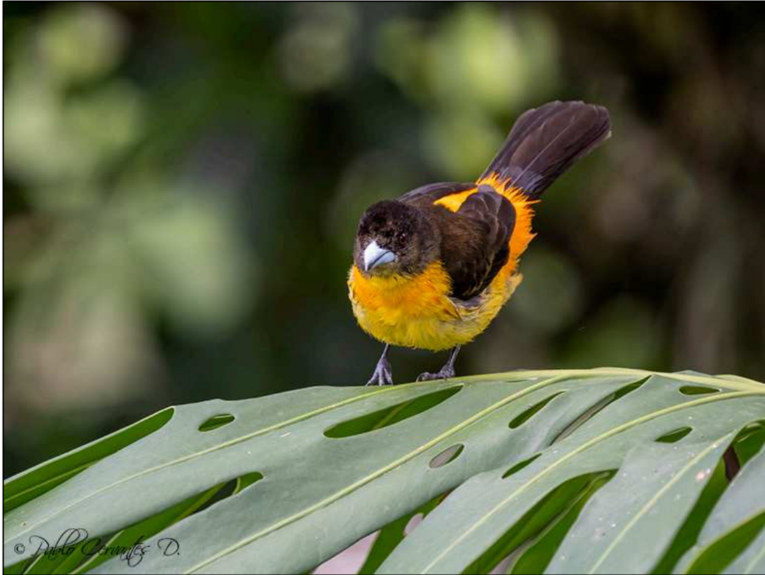
Flame-rumped Tanager (TOP) and Colombia Chachalaca