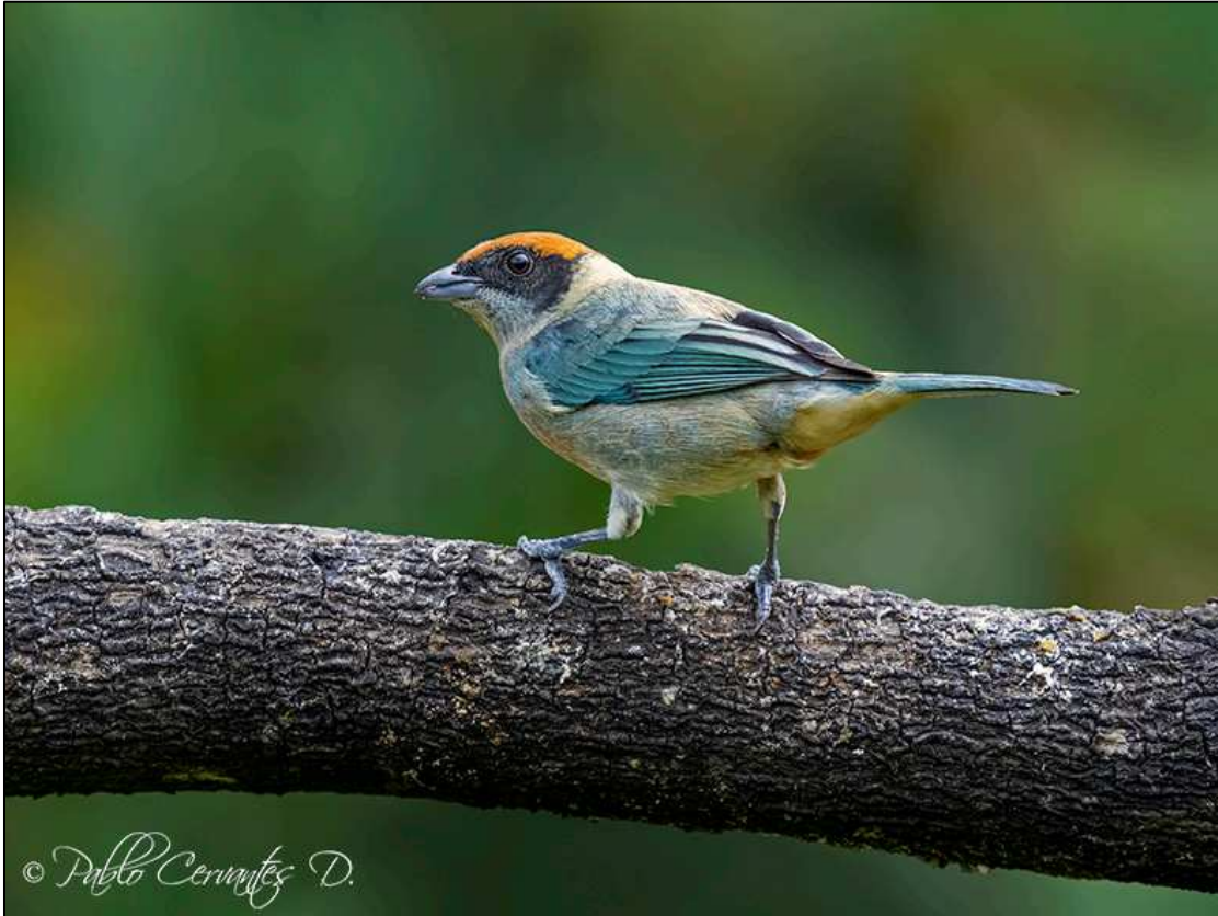
Scrub Tanager (TOP) and Summer Tanager