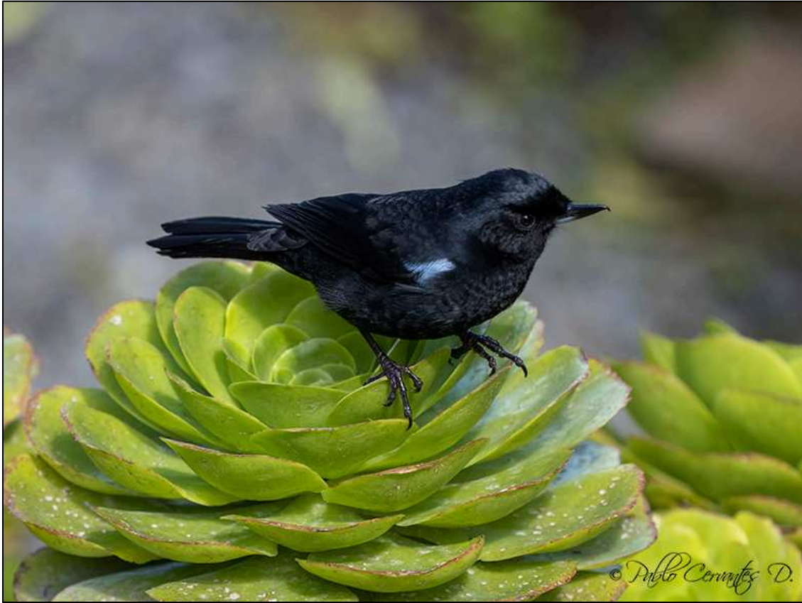
Glossy Flowerpiercer (TOP) and Gray-breasted Mountain-Toucan