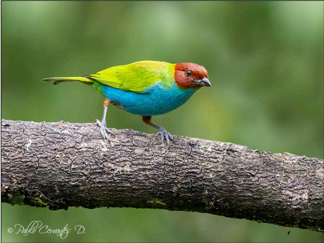
Bay-headed Tanager (TOP) and Crimson-backed Tanager