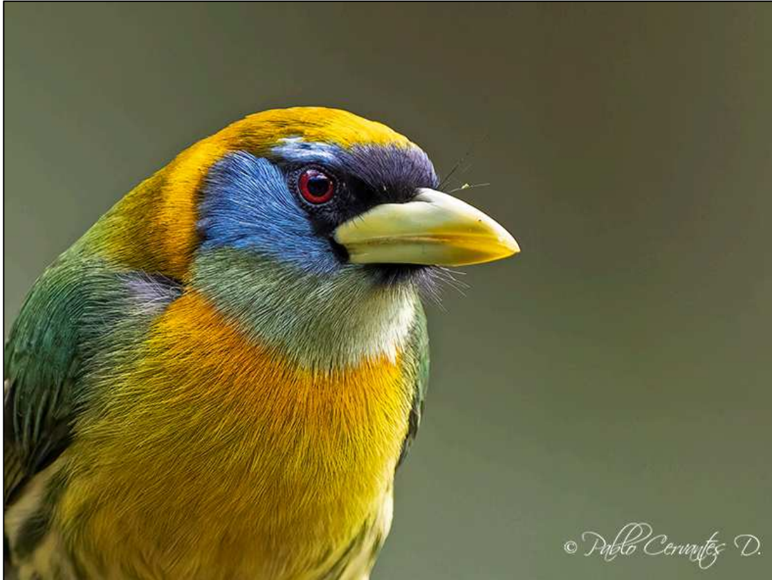
Female Red-headed Barbet (TOP) and Chestnut Wood-Quail