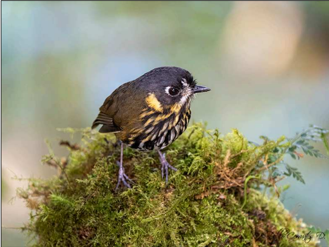
Two More Antpittas: Crescent-faced (TOP) and Equatorial Antpittas