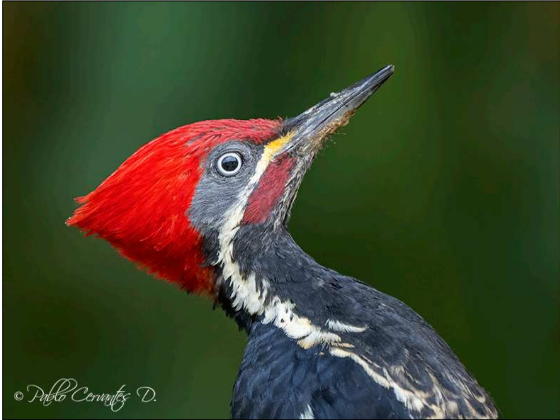
Lineated Woodpecker (TOP) and Saffron-crowned Tanager