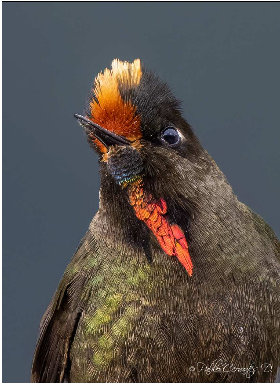
Rainbow-bearded Thornbill from Hotel Termales del Ruiz