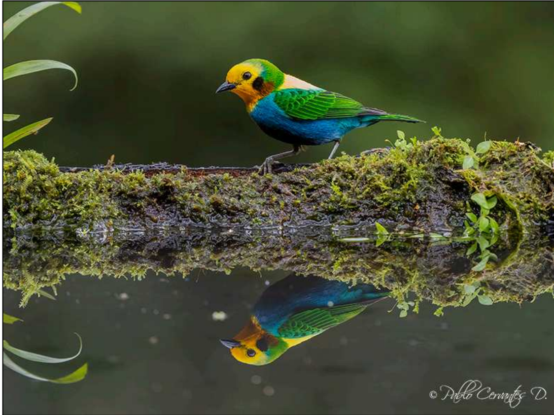
Multicolored Tanager (TOP) and Chestnut Wood-Quail