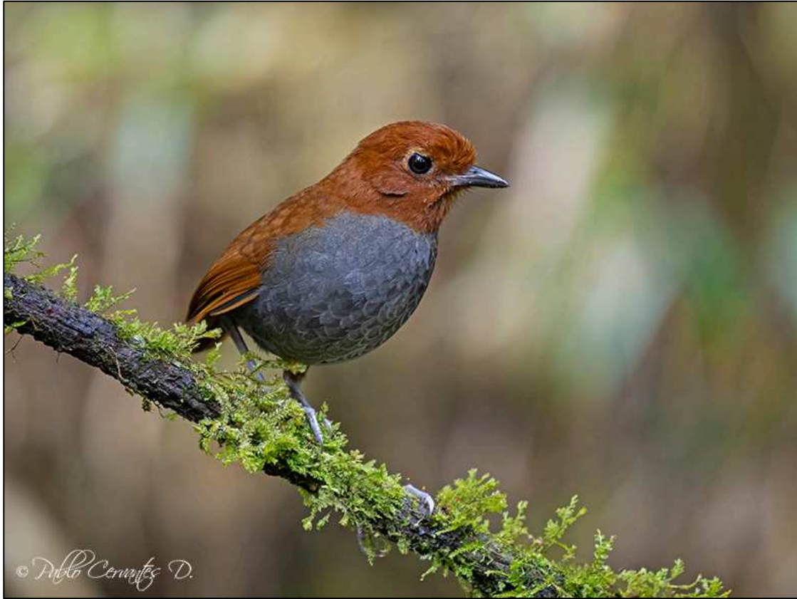
Bicolored Antpitta (TOP) and White-throated Quail-Dove