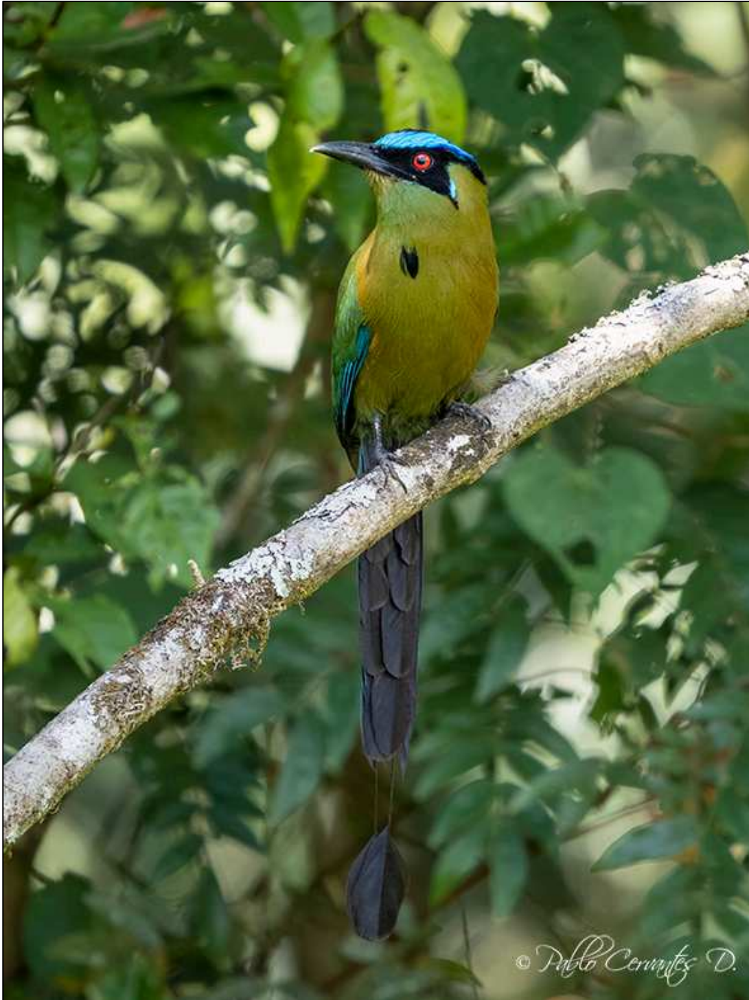
Andean Motmot (above and top of next page)

We spent most of this day at a lower elevation site, in the Andean foothills, Finca Bambusa . The reason for choosing this site was it offered us a good range of tanagers to photograph, which included Blue-necked, Bay-headed, Flame-rumped, Scrub, Guira, and Crimson-backed Tanagers and Summer Tanager . While the variety of tanagers to photograph was the main focus, we also photographed Colombian Chachalaca and Andean Motmot there too. We also saw Red-bellied Grackle there. At the end of the day we returned to El Jardin .