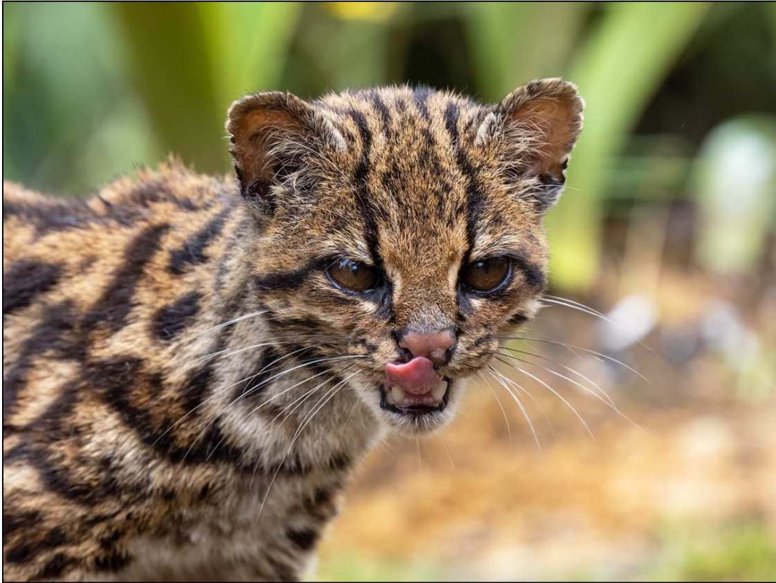
Northern Tigrina (formerly "Oncilla") and "Inca Jay", a form of Green Jay