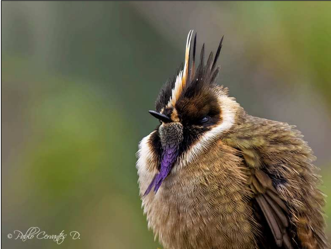
Buffy Helmetcrest (TOP) and Rainbow-bearded Thornbill