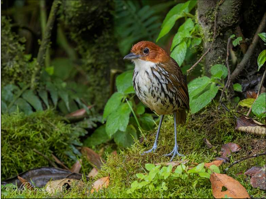
Chestnut-crowned Antpitta (TOP) and Green-and-black Fruiteater