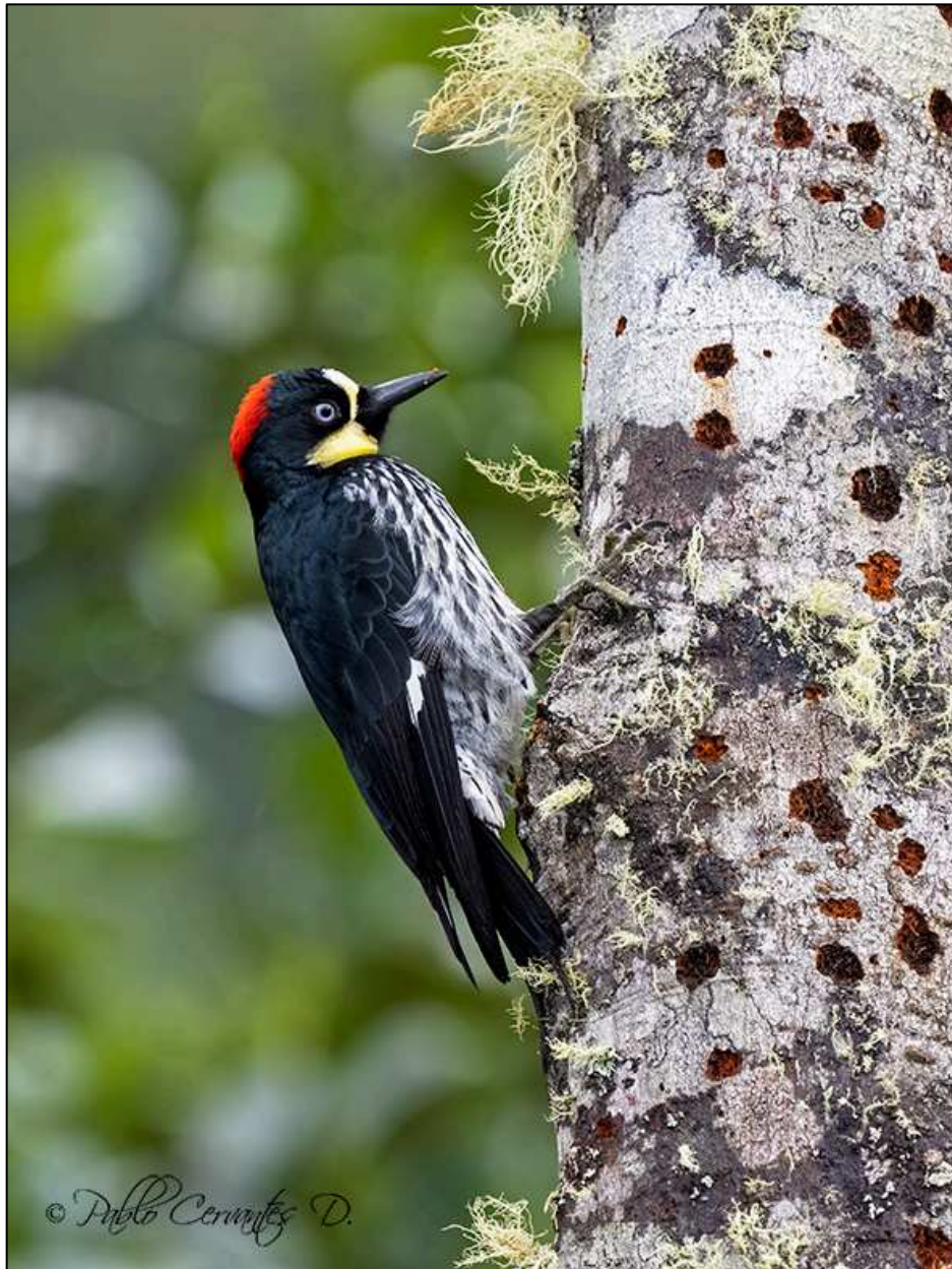
Acorn Woodpecker (above and next page)

One of the joys of birding and bird photography in the Andes is, a brief change in elevation brings a sudden change in the birds on offer. After yesterday's lower elevation tanager fest, we moved up into highland forest in the Andes, which resulted in a very different list of birds photographed. Today's highlights were Green Jay (of the distinctive South American form known as "Inca Jay"), Acorn Woodpecker , our first antpitta photographed on the tour ( Chestnut-naped Antpitta ), as well as hummingbirds like Andean Emerald , and Slaty Brushfinch . While bird photography was the undoubted focus of the tour, we were equally happy to photograph a wild cat that also came into the feeders, known now as Northern Tigrina , it was formerly under the name Oncilla , which has now been split into two geographically separated species (one in Central America and one in South America).