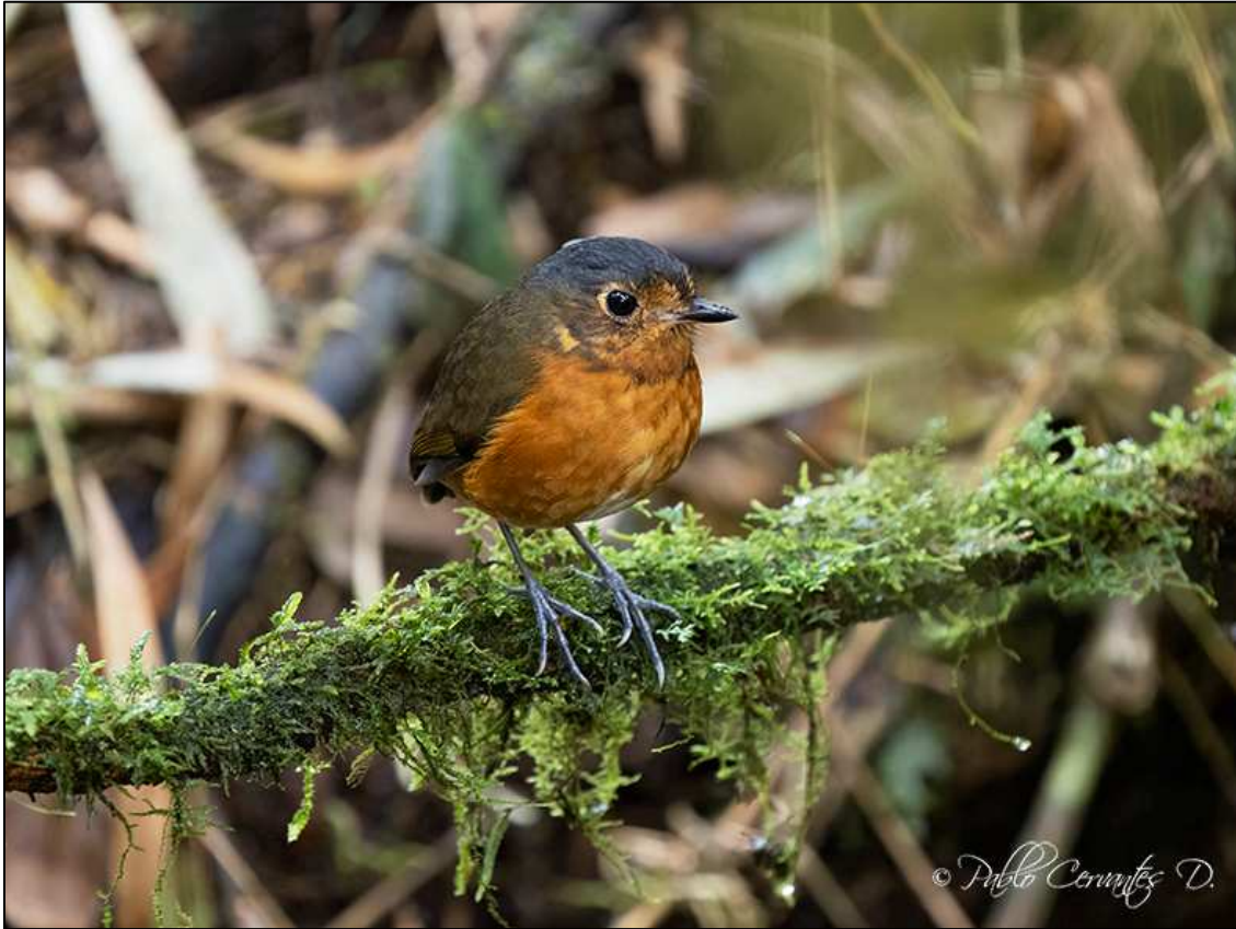
Slate-crowned Antpitta (TOP) and Brown-banded Antpitta