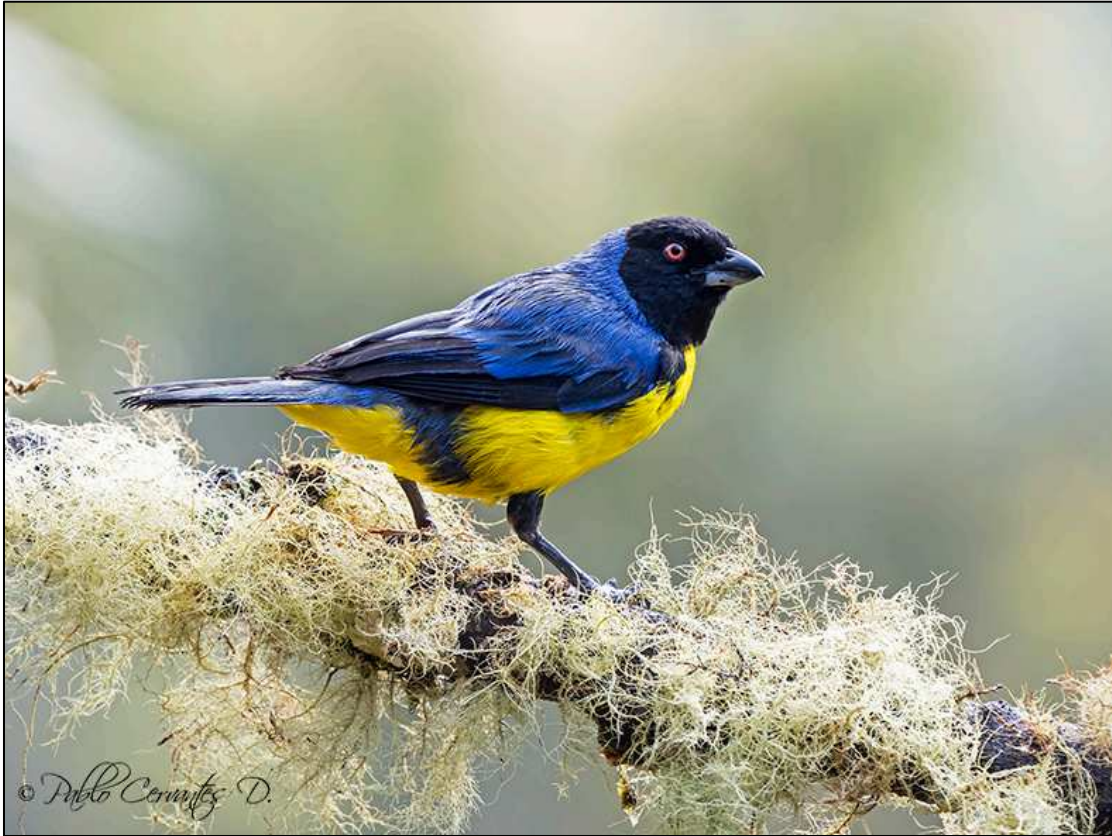
Hooded Mountain-Tanager (TOP) and White-naped Brushfinch