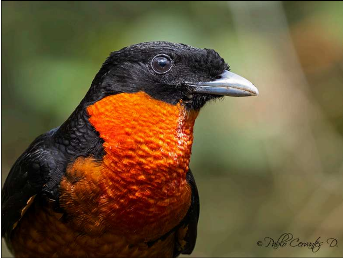
Red-ruffed Fruitcrow (TOP) and Crimson-rumped Toucanet