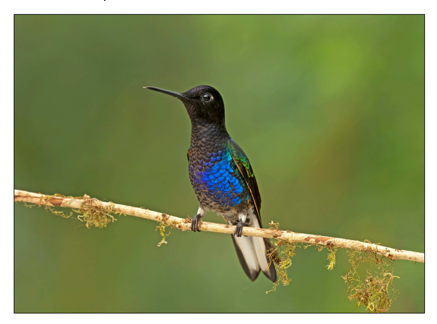
Velvet-purple Coronet from Amagusa Reserve

Just before lunch, we admired the hummingbirds at those feeders too, which were loaded with colorful species, like regional endemics such as Violet-tailed Sylph and Purple-bibbed Whitetip , while Velvet-purple Coronet (photo below) and Empress Brilliant were both colorful new additions there too. Green Thorntail , White-whiskered Hermit and Purple-throated Woodstar were also in attendance.