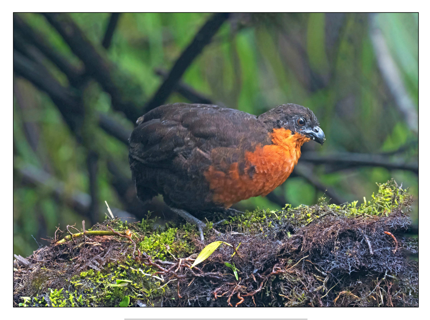
Dark-backed Wood-Quail from Refugio Paz de Aves

Once we were done with breakfast, we went to look for Yellow-breasted Antpitta (photo next page) and Chestnut-crowned Antpittas in two different, nearby, locations, and were happy to come back with both, knowing full well antpittas are always far from guaranteed, even at this extraordinary antpitta site. We also added Streak-headed Antbird, White-winged Tanager, Flavescent Flycatcher and a roosting Common Potoo there. After that, we needed to return to Quito, for people not joining the extension, and also to put us in a good location to start the extension. Local road closures forced us to take a longer route back to Quito, but eventually we got there in the evening as planned.