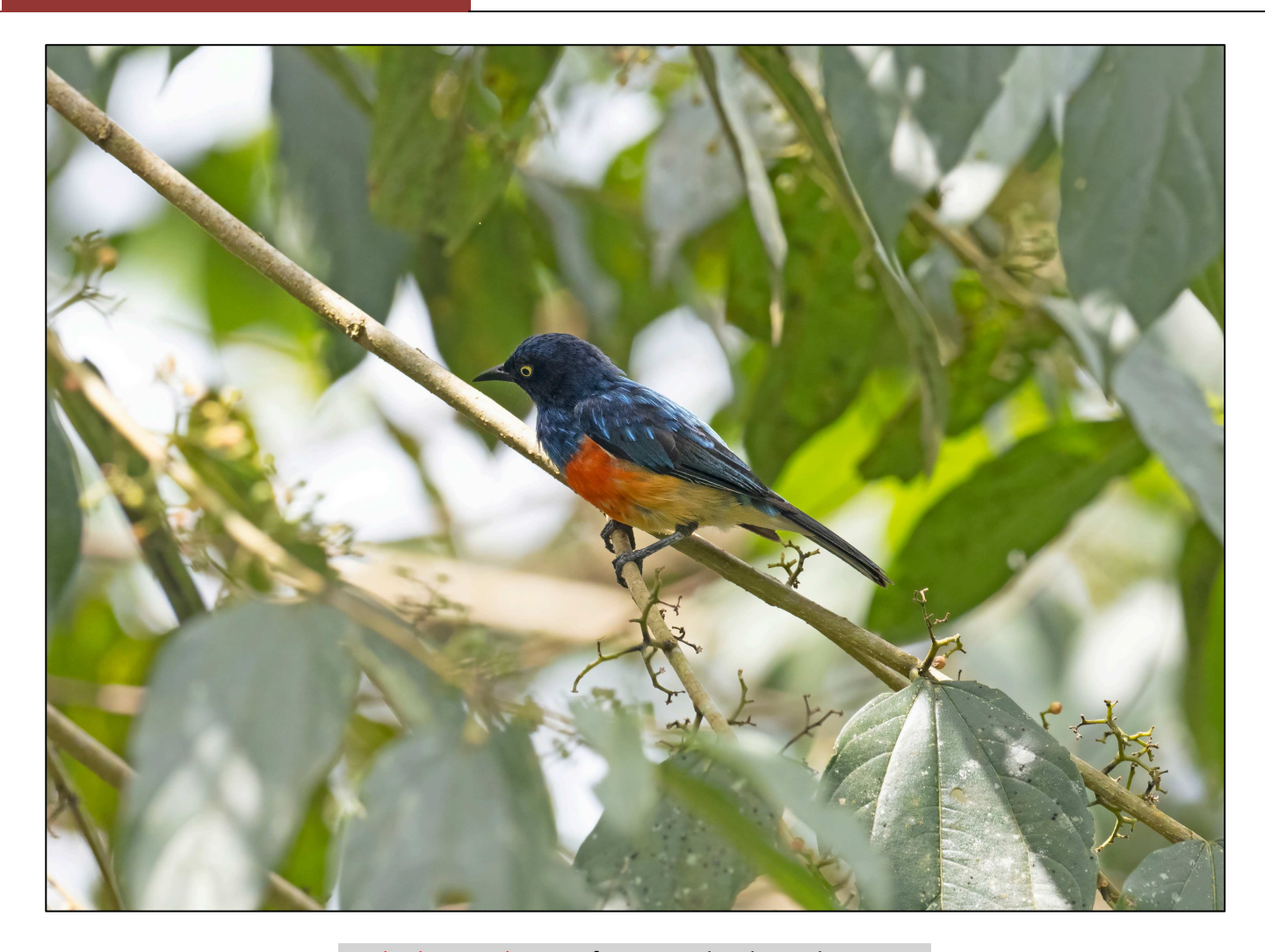
Scarlet-breasted Dacnis from Rio Silanche Bird Sanctuary

Finally, we arrived at the small reserve of Rio Silanche in the late morning and headed straight up the small canopy tower. Our higher position aided us in finding White-tailed Trogon , Cinnamon and Golden-olive Woodpeckers , and a feeding flock held birds like Masked Tityra , Choco and Ashy-headed Tyrannulets , Grayand-gold Tanager , Orange-fronted Barbet , and two species of gaudy tanagers – the threatened Scarlet-breasted Dacnis ( photo above ) and the striking Black-faced ( Yellow-tufted ) Dacnis , which both gave great looks.