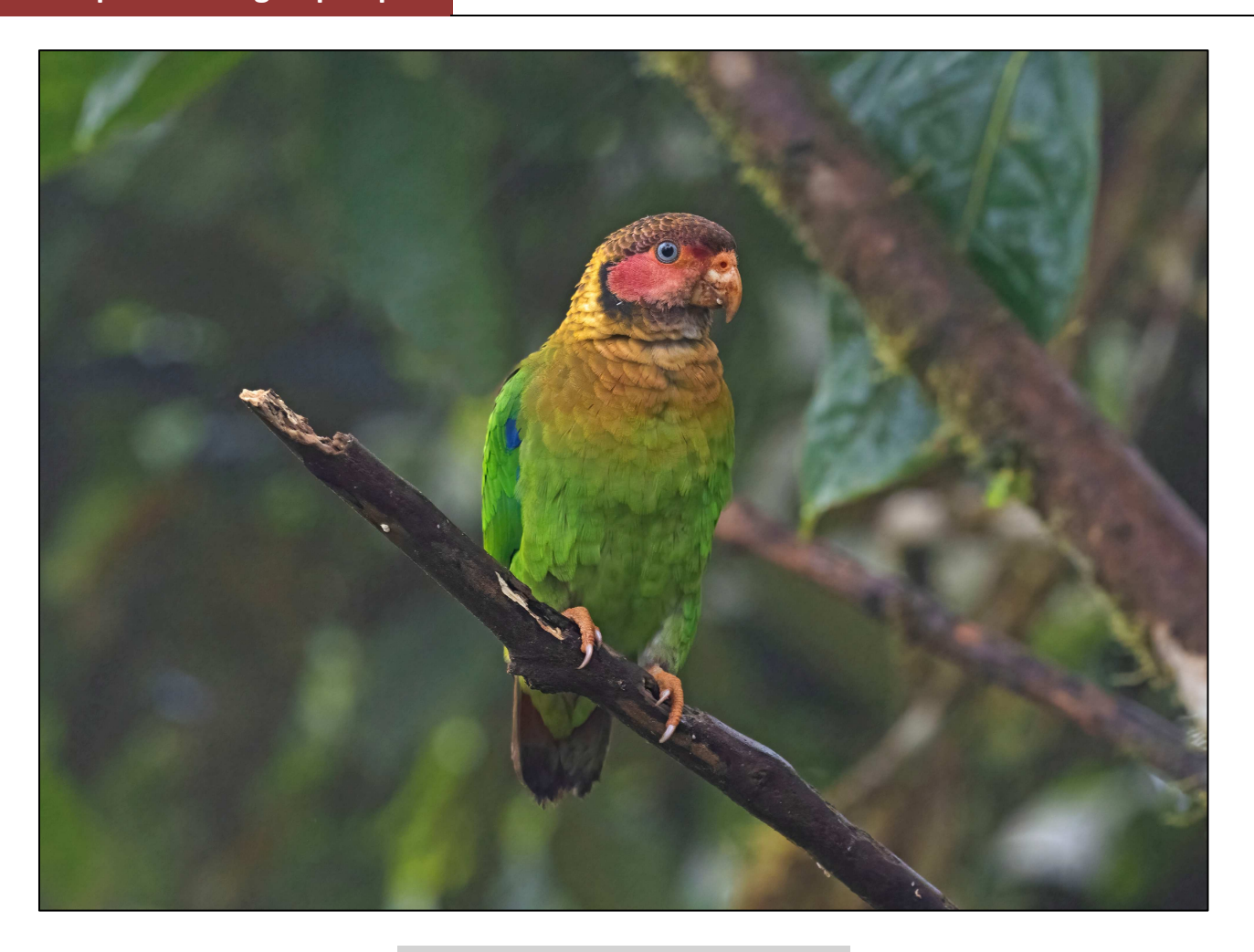
Rose-faced Parrot from Amagusa Reserve