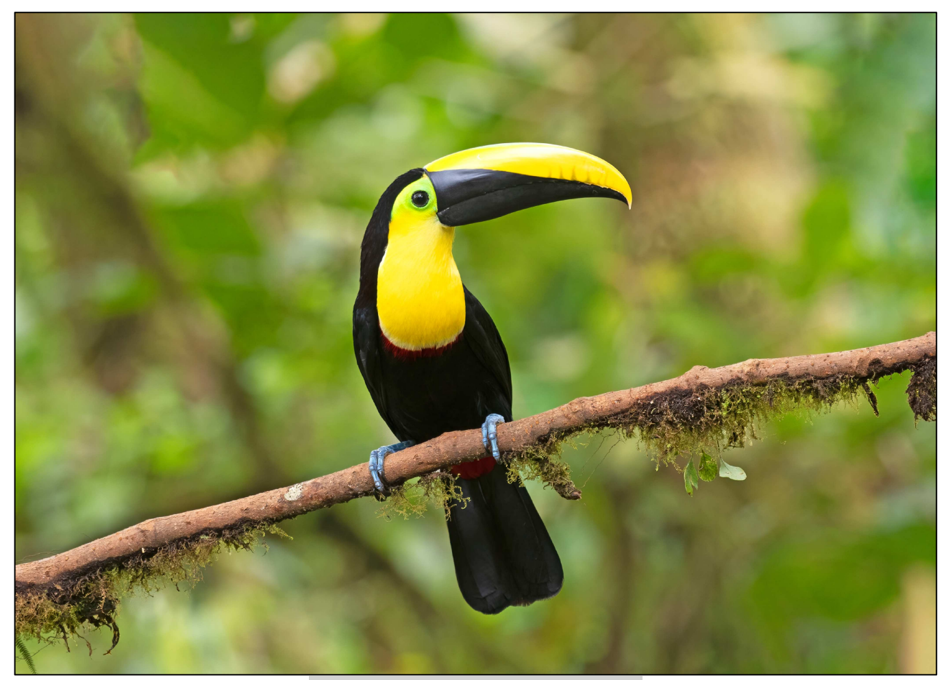
Choco Toucan from Milpe Bird Sanctuary