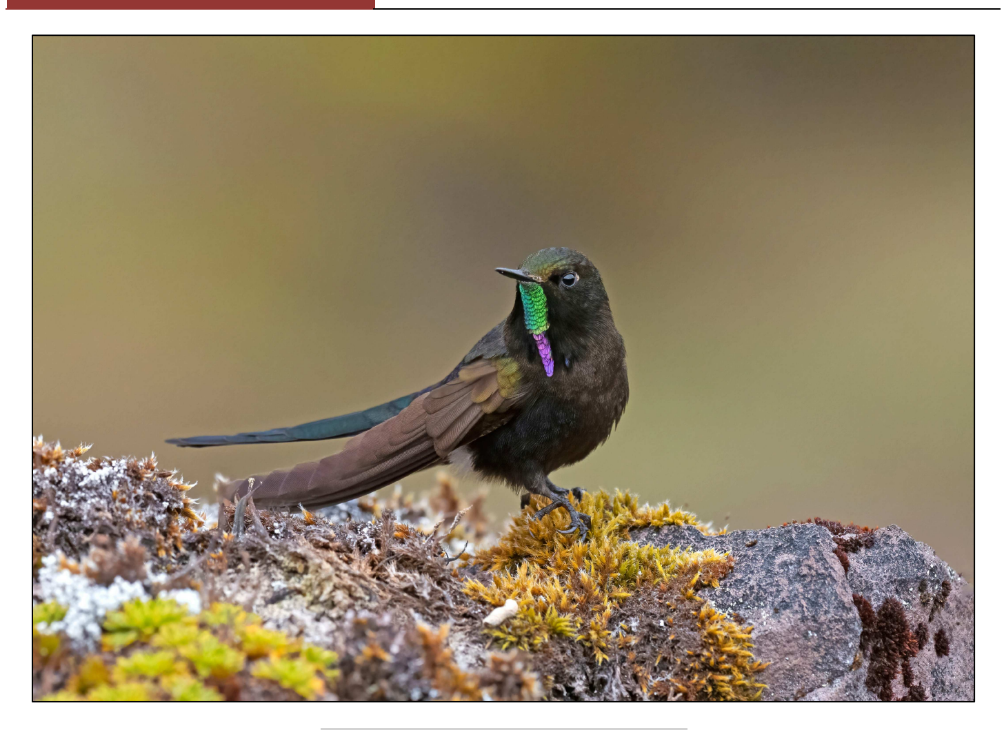
Blue-mantled Thornbill from Papallacta Pass