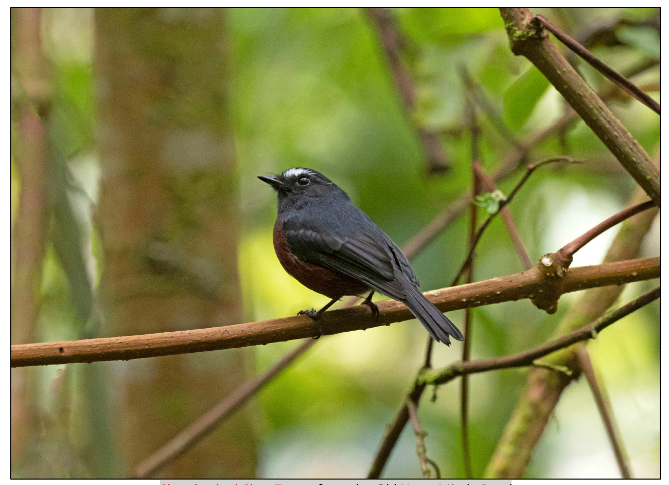
Slaty-backed Chat-Tyrant from the Old Nono-Mindo Road

We took lunch open site, in Yanacocha Reserve, a stone's throw from the feeders. After that, we began our journey back to Tandayapa, driving along the forested Old Nono-Mindo Road to return there, which offered some birds of its own. Our first stop provided us with the opportunity to see White-tailed Tyrannulet, Golden Grosbeak, and Blue-and-black Tanager, as well as allowing us to get our first looks of Turquoise Jay, the normally skulking Plain-tailed Wren gave us unusually long looks, and a Black-chested Buzzard Eagle soared above us. Much further down the road we picked up Hooded Mountain-Tanager, Cinnamon Flycatcher, and Slaty-backed Chat-Tyrant (photo below), and we also found a female Torrent Duck along the Alambi River. We arrived back at the lodge in the evening after a full, and productive, day in the field.