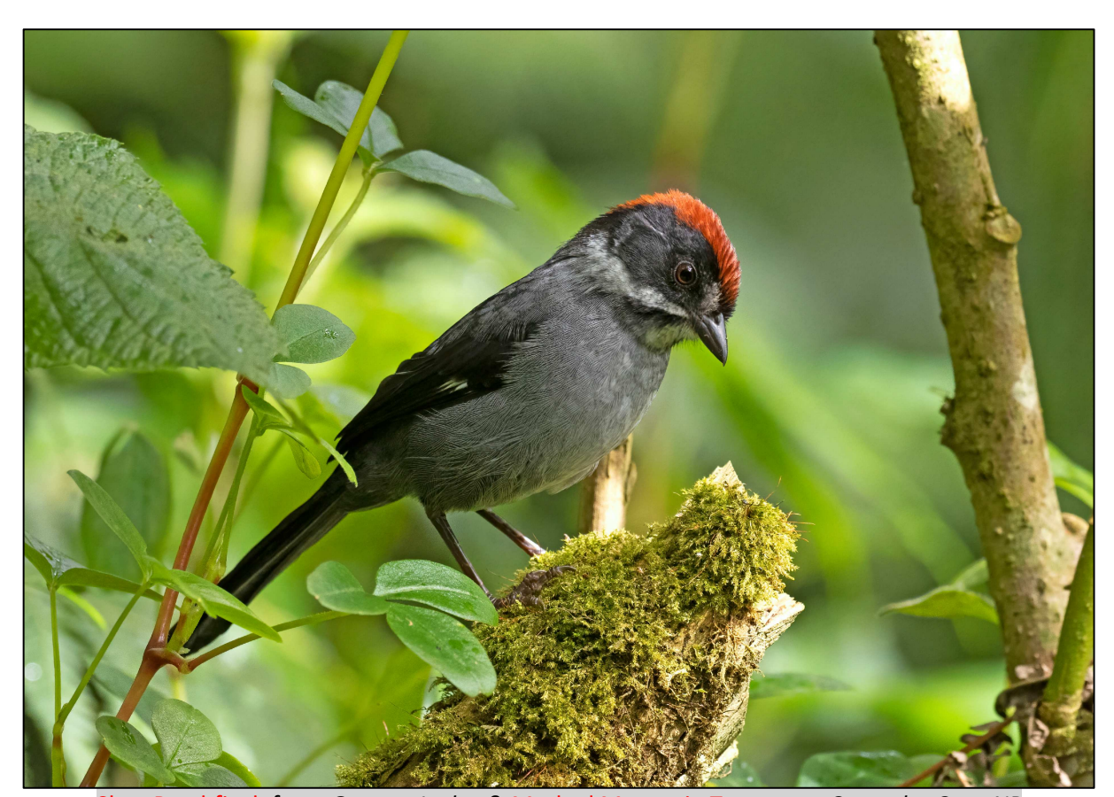
Slaty Brushfinch from Guango Lodge & Masked Mountain Tanager at Cayambe-Coca NP