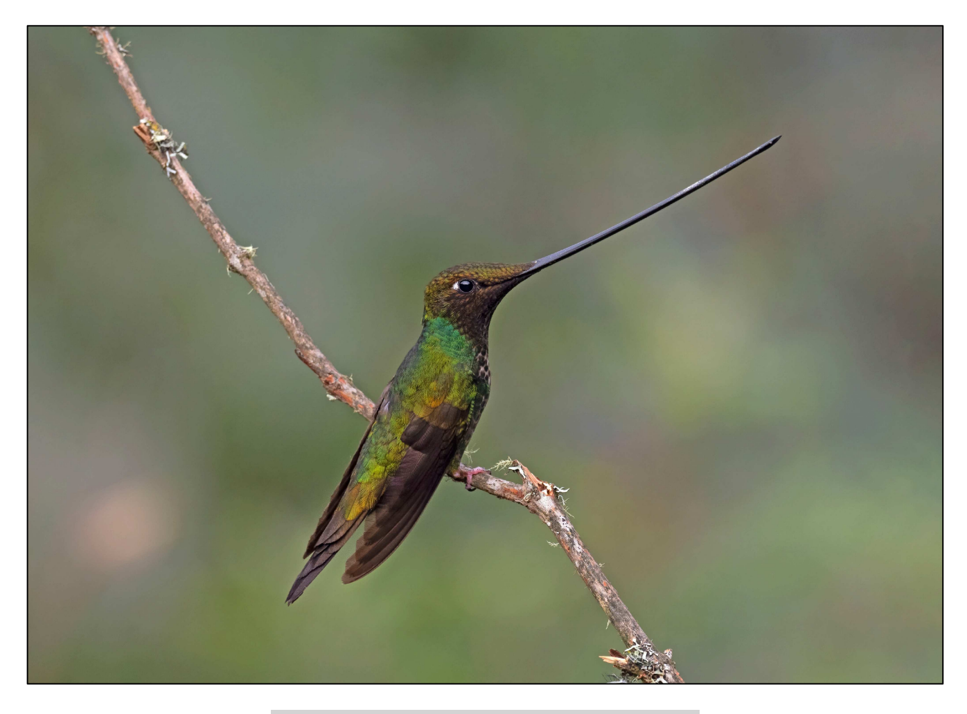
Sword-billed Hummingbird from Zuro Loma Reserve

After a great time at Zuro Loma , we continued on to nearby Yanacocha , where fruit feeders attracted striking birds like Scarlet-bellied and Black-chested Mountain-Tanagers , while the attendees at the hummingbird feeders included three new species, Golden-breasted Puffleg , the bold Shining Sunbeam , and Great Sapphirewing , the latter the second largest hummingbird on Earth. We also took a hike along the main, largely flat, trail through the reserve, which produced Bar-bellied and Crimson-mantled Woodpeckers , Spectacled Redstart , White-throated Tyrannulet , Blackish Tapaculo , Rufous Wren , Blue-backed Conebill and an Equatorial Antpitta hopping along the trail.