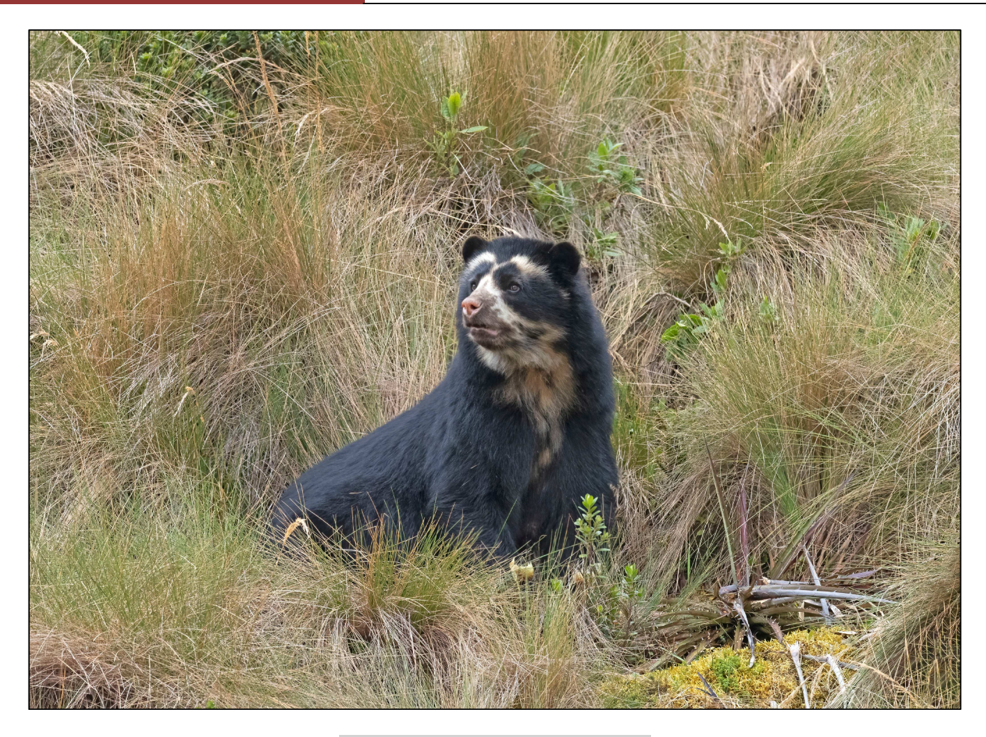
Spectacled Bear from Papallacta Pass

After a morning at high elevation, we were ready for a hot meal at Guango . We took a break after lunch, and then spent some time with the legendary hummingbirds feeders at the lodge. There, we got the miniature White-bellied Woodstar , spectacular Long-tailed Sylph and Tourmaline Sunangel , striking Collared Inca , and aggressive Chestnut-breasted Coronet , which was doing its level best to chase all other comers away. The rest of the day was spent walking the trails behind the lodge, searching for feeding flocks. We located some of these, which held Hooded and Buff-breasted Mountain-Tanagers , Blue-backed and Capped Conebills , Pearled Treerunner , Streaked Tuftedcheek , Gray-hooded Bush Tanager , Masked Flowerpiercer , Cinnamon Flycatcher , Black-crested Warbler , Black-eared and Black-capped Hemispingus , Bar-bellied Woodpecker , Slaty Brushfinch (photo page 16) and Pale-naped Brushfinches , Rufous-breasted Flycatcher , and Masked Trogon . The outstanding Plushcap , a bamboo loving tanager, was also working in the same flock. Our afternoon hike also took alongside the rushing, local river, where we hoped for, and got, better looks at Torrent Duck than we'd had before, this time seeing a pied male perched on a rock. The same trail also brought us Torrent Tyrannulet and Slaty-baked Chat-Tyrant . We spent the night at Guango Lodge , with hot water bottles to warm our beds at night!