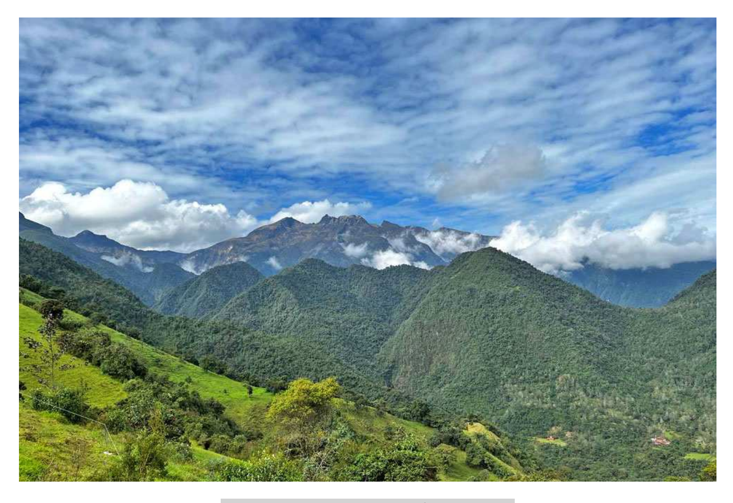
Guagua Pichincha Volcano viewed from Zuro Loma

There were many special birds on this tour, as usual, to this megadiverse part of the planet, although these were the ones that were most popular among this particular group: Toucan Barbet, Glistening-green and Mossbacked Tanagers, Masked Mountain Tanager, Golden-collared Honeycreeper, Ocellated Tapaculo, Yellowbreasted Antpitta, Rufous-bellied Seedsnipe, Indigo Flowerpiercer, Plate-billed Mountain-Toucan, Choco Toucan, Andean Condor, Scarlet-breasted Dacnis, Andean Cock of the Rock, Golden-headed Quetzal, Booted Racket-tail, White-bellied Woodstar, Lyre-tailed Nightjar, and Common Potoo.