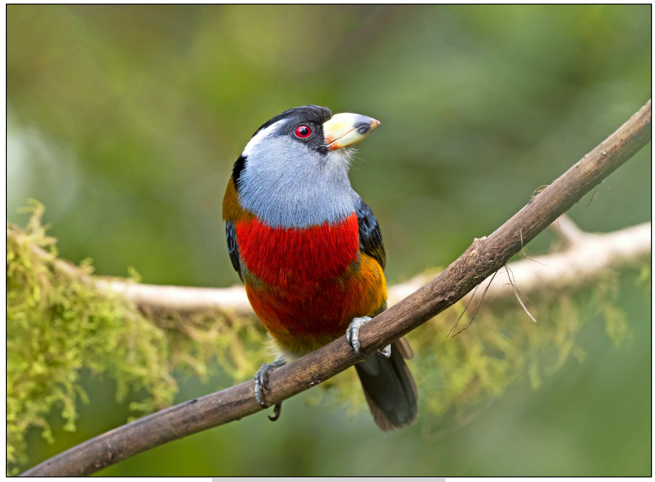
Toucan Barbet at Tandayapa Bird Lodge

This tour ran slightly different in order than usual, due to some local conditions at the time. Therefore, rather than go to Yanacocha on this day (when it was thought it might be closed), we went straight to Tandayapa Bird Lodge instead. As soon as we arrived, we were able to pick up at least thirteen different hummingbird species within fifteen minutes of being there, as we got birds like White-necked Jacobin , Andean Emerald , Greencrowned and Fawn-breasted Brilliants , Violet-tailed Sylph (an endemic to the Chocó bioregion), Brown Inca , the tiny Purple-throated Woodstar , Lesser , Brown , and Sparkling Violetears , Rufous-tailed Hummingbird , Buff-tailed Coronet , and the attractive Booted Racket-tail . While having a cup of coffee, we also checked out the fruit feeders on the other side of the building. These were active, with Rufous Motmot , Silver-throated , Golden , Blue-gray , Palm , Flame-faced , Golden-naped , Flame-rumped and Black-capped Tanagers , Redheaded Barbet , Black-winged Saltator , and the multicolored Toucan Barbet ( photo below ) all visiting at this time. The trails and the entrance road brought us Uniform Antshrike , Marble-faced Bristle-tyrant , Tricolored Brushfinch , Golden-crowned flycatcher , Smoke-colored Pewee , Slate-throated Redstart , Nariño Tapaculo , and the cute Ochre-breasted Antpitta which responded very quickly to playback.