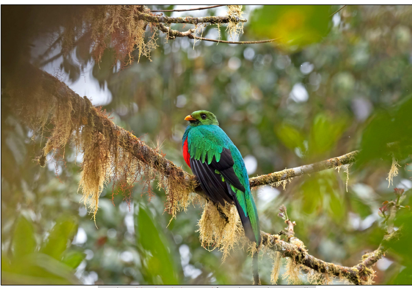
A male Golden-headed Quetzal from the Tandayapa Valley