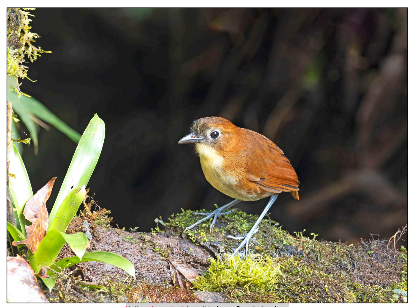
Yellow-breasted Antpitta from Paz de las Aves