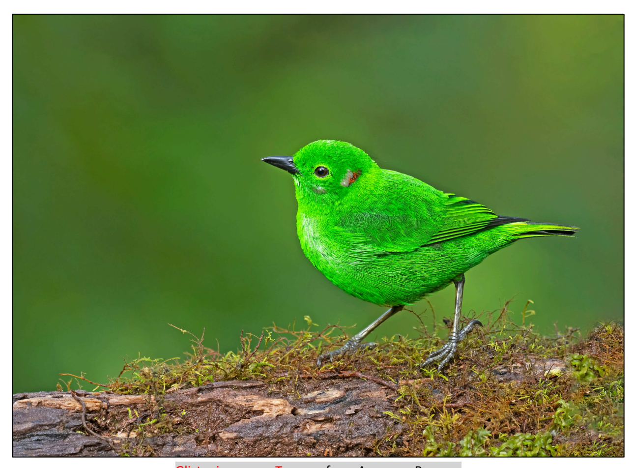
Glistening-green Tanager from Amagusa Reserve

12<sup>th</sup> - 21<sup>st</sup> June 2022