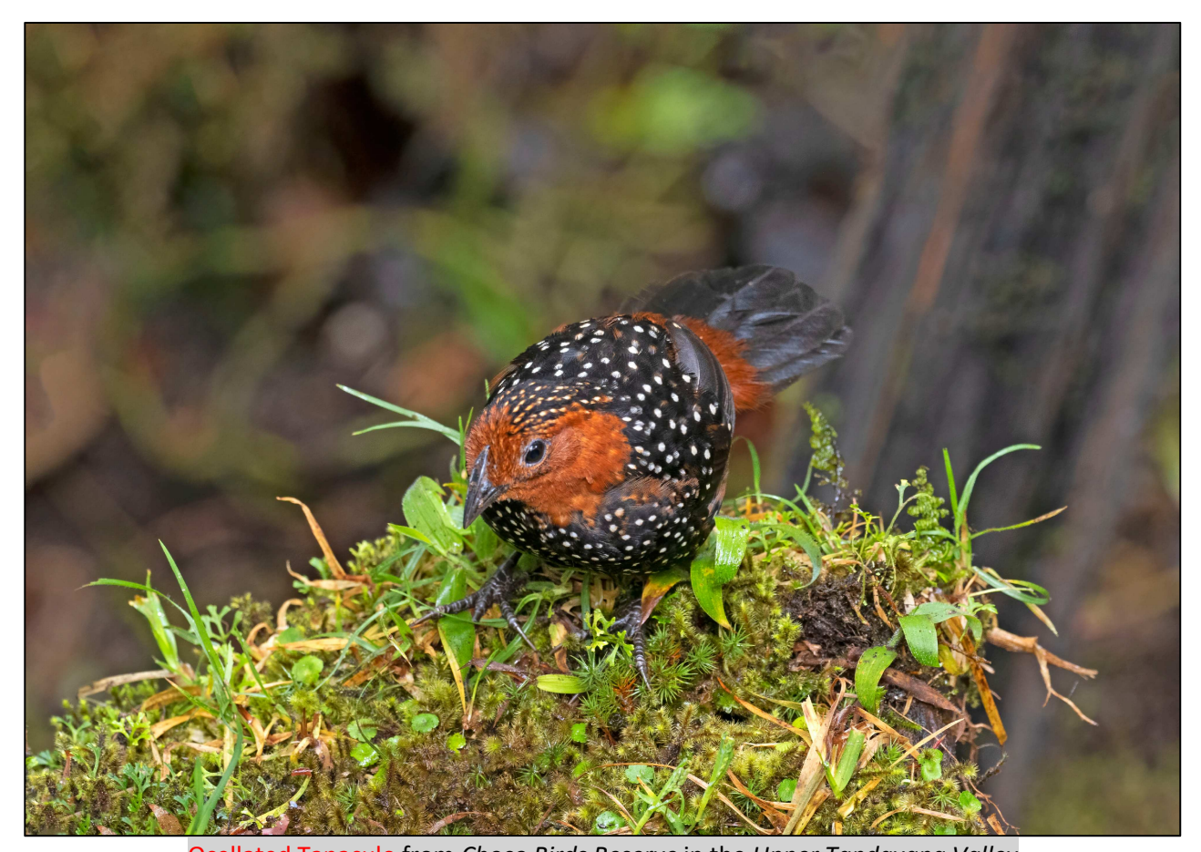
Ocellated Tapaculo from Choco Birds Reserve in the Upper Tandayapa Valley

Also on the same day we had the chance to visit the Upper Tandayapa Valley , which was very productive. We visited a new site, named Choco Birds Reserve , where we were able to see a procession of species at their feeders, including Beryl-spangled, Golden, Blue-capped and Metallic-green Tanagers, Blue-winged Mountain Tanager, Glossy-black Thrush, Masked Flowerpiercer, and Orange-bellied Euphonia. In the same area we found other species foraging away from the feeders, in the surrounding trees, like Dusky Chlorospingus, Pearled Treerunner, Mountain and Strong-billed Woodcreepers, Azara's Spinetail, Mountain Wren, and the exceptionally gaudy Plate-billed Mountain- Toucan. We also got a fly by from a Sharp-shinned Hawk. Best of all though, the owner of this small private reserve, Miguel , was able to lure out the shy Ocellated Tapaculo (photo below) for us to both see and photograph. The hummingbird feeders gave us the opportunity to add further higher altitude hummer species, including Speckled Hummingbird, Collared Inca, and another Chocó specialty, Gorgeted Sunangel.