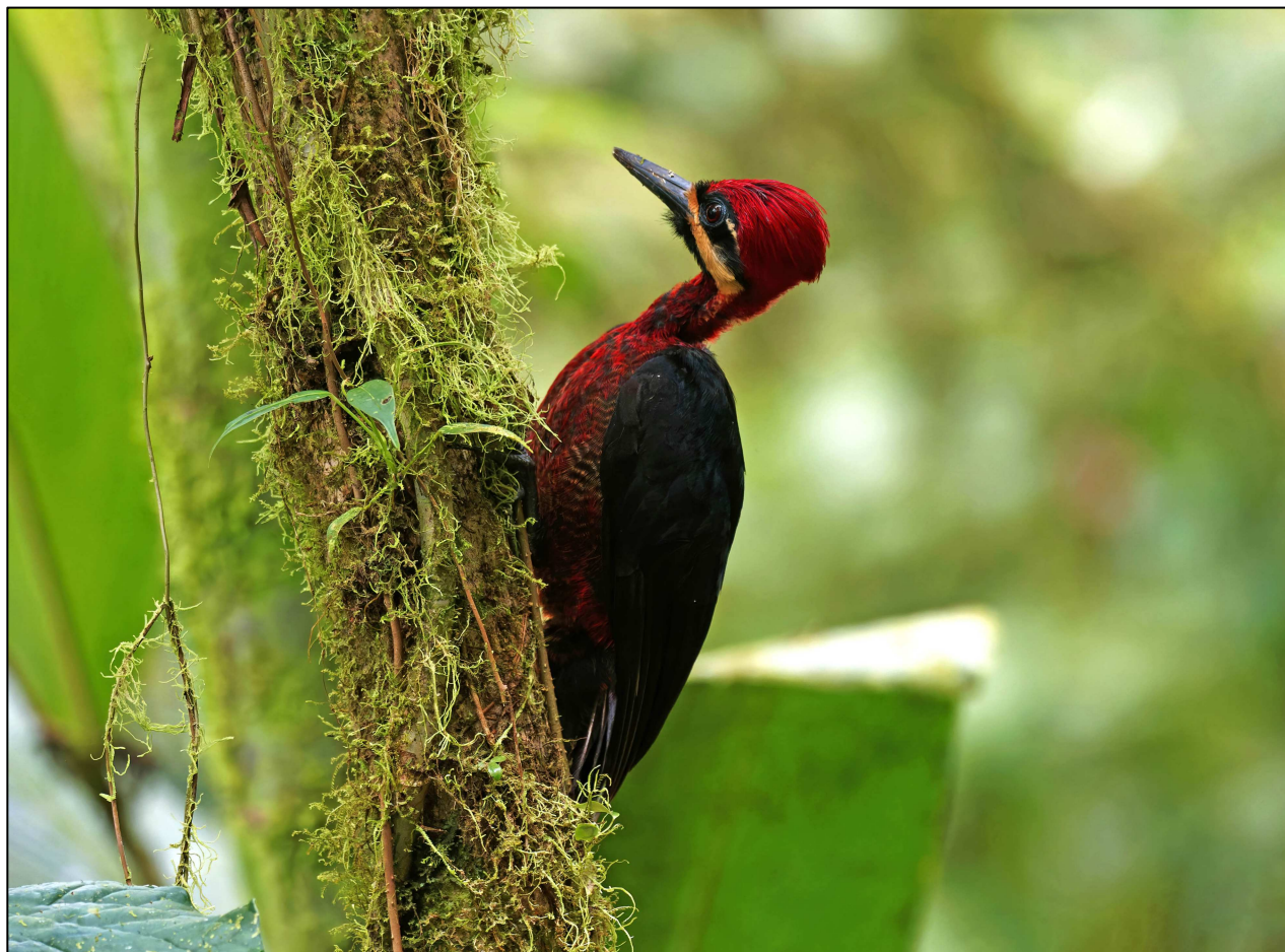
This Crimson-bellied Woodpecker was a shock find at Milpe , a very rarely seen species throughout it's entire range