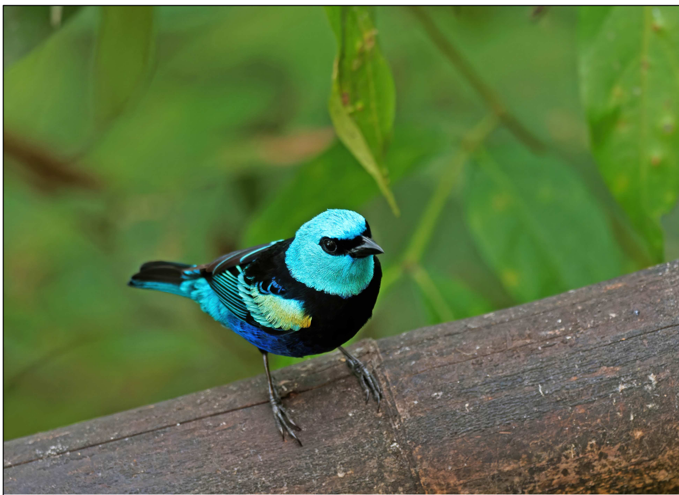
Blue-necked Tanager was seen in the lowlands and foothills

Having stayed close to “home” the day before, on this day we had one of the longest day trips of the tour, into the Pacific lowlands at Rio Silanche . We opted to take a packed breakfast and packed lunch, in this way avoiding getting up even earlier to have a cooked breakfast at the lodge before departure. We took our breakfast in the field, whilst getting our first birds along