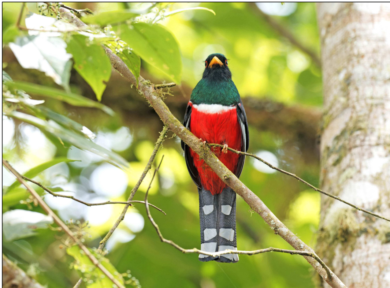
This male Masked Trogon was seen at Pacha Quinde