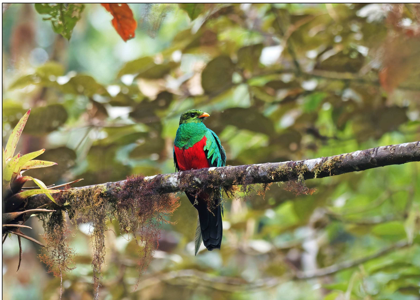
Road birding in the Tandayapa Valley was superb with this Golden-headed Quetzal encountered in the cloudforest there

Last but not least were the hummingbird feeders, which were busy with attendees like Green-crowned and Fawn-breasted Brilliants , Buff-tailed Coronet , Andean Emerald , Brown Inca , Lesser, Brown and Sparkling Violetears , White-necked Jacobin , Purple-throated Woodstar , and the adorable White-booted Racket-tail , a constant crowd pleaser. Tandayapa Bird Lodge had kickstarted our time in the cloudforest perfectly, though it was now time to explore slightly higher elevations, a short drive up from the lodge. A White-throated Quail-Dove was seen walking along the road, and a small feeding flock yielded Beryl-spangled Tanager , Flavescent Flycatcher , White-tailed Tyrannulet , Dusky Chlorospingus , Streaked Tuftedcheek , Capped Conebill , Blue-winged Mountain-Tanager , and Montane Woodcreeper . The same general area also produced Crested Quetzal , Masked Trogon , Turquoise Jay , Collared Inca , Tawny-bellied Hermit , Gorgeted Sunangel , Plate-billed Mountain-Toucan , and a Common Potoo sleeping beside the road.