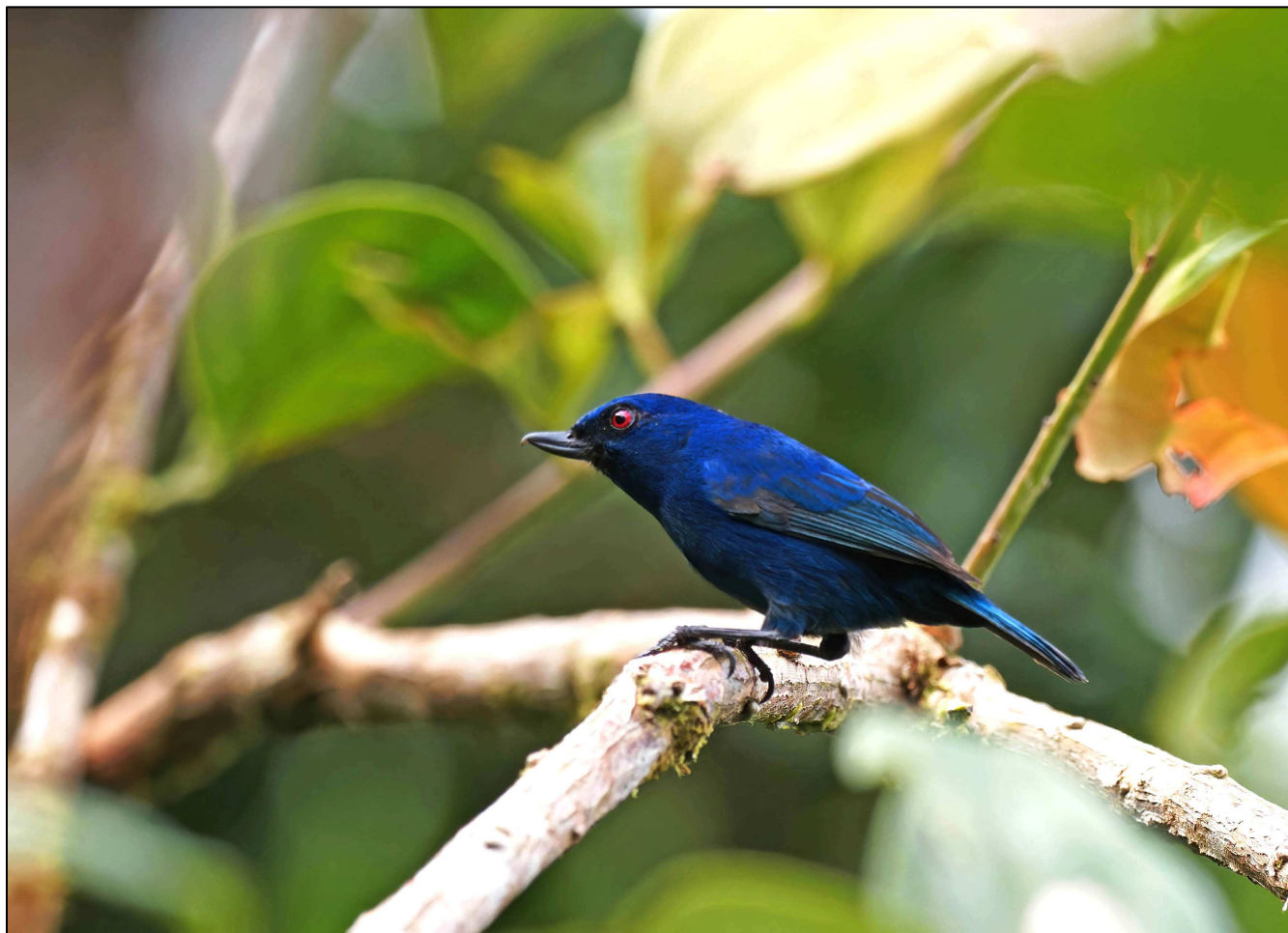
Indigo Flowerpiercer was among a long list of specialties seen around Mashpi