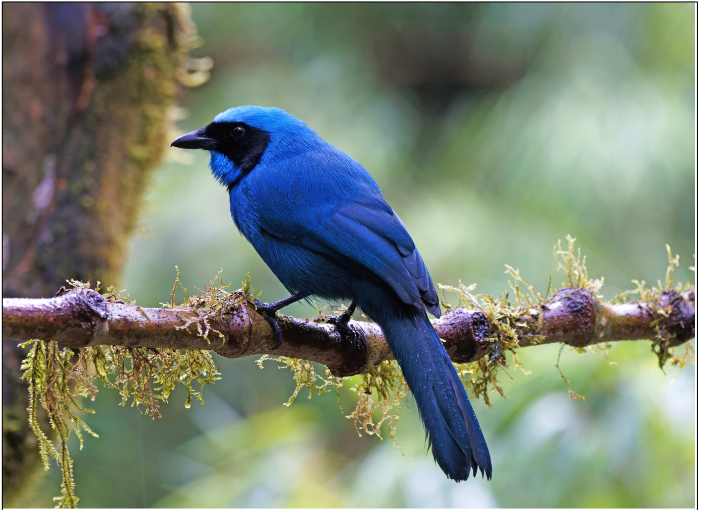
Guango Lodge once again proved itself to be one of the most reliable places to see (and see well) Turquoise Jays!

And so, all-too-soon, the final day's birding had arrived, and we made the most of it by covering Guango Lodge and the nearby very high elevation site of Papallacta , before returning to Quito for the final night of the tour. We started out by visiting the blind at Guango , which is at its very best at dawn, when the birds come to pick off the moths that have been attracted to the lights overnight. Once they are gone, the birds move away. More than ten species featured there, including 3 species of brushfinch ( Pale-naped , Chestnut-capped and Gray-browed Brushfinches ), 2 species of wren ( Rufous and Mountain Wrens ), and 2 species of jay ( Turquoise -photo above- and Green Jays ), as well as Strong-billed Woodcreeper and Russet-crowned Warbler . After the "blind birds" had moved away, we took a walk beside the rushing mountain river that borders the property, finding the hoped for Torrent Ducks and White-capped dipper , and lucking into a Fasciated Tigger-Heron too. This same walk also produced Andean Guan , Mountain Cacique , Hooded Mountain-Tanager , Gray-headed Bush-Tanager , Capped Conebill ,