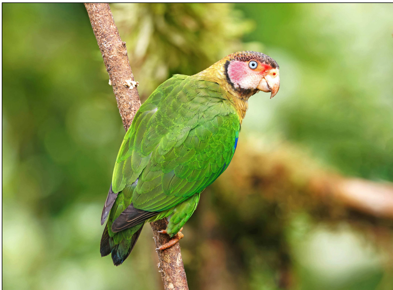
Rose-faced Parrot from Amagusa Reserve