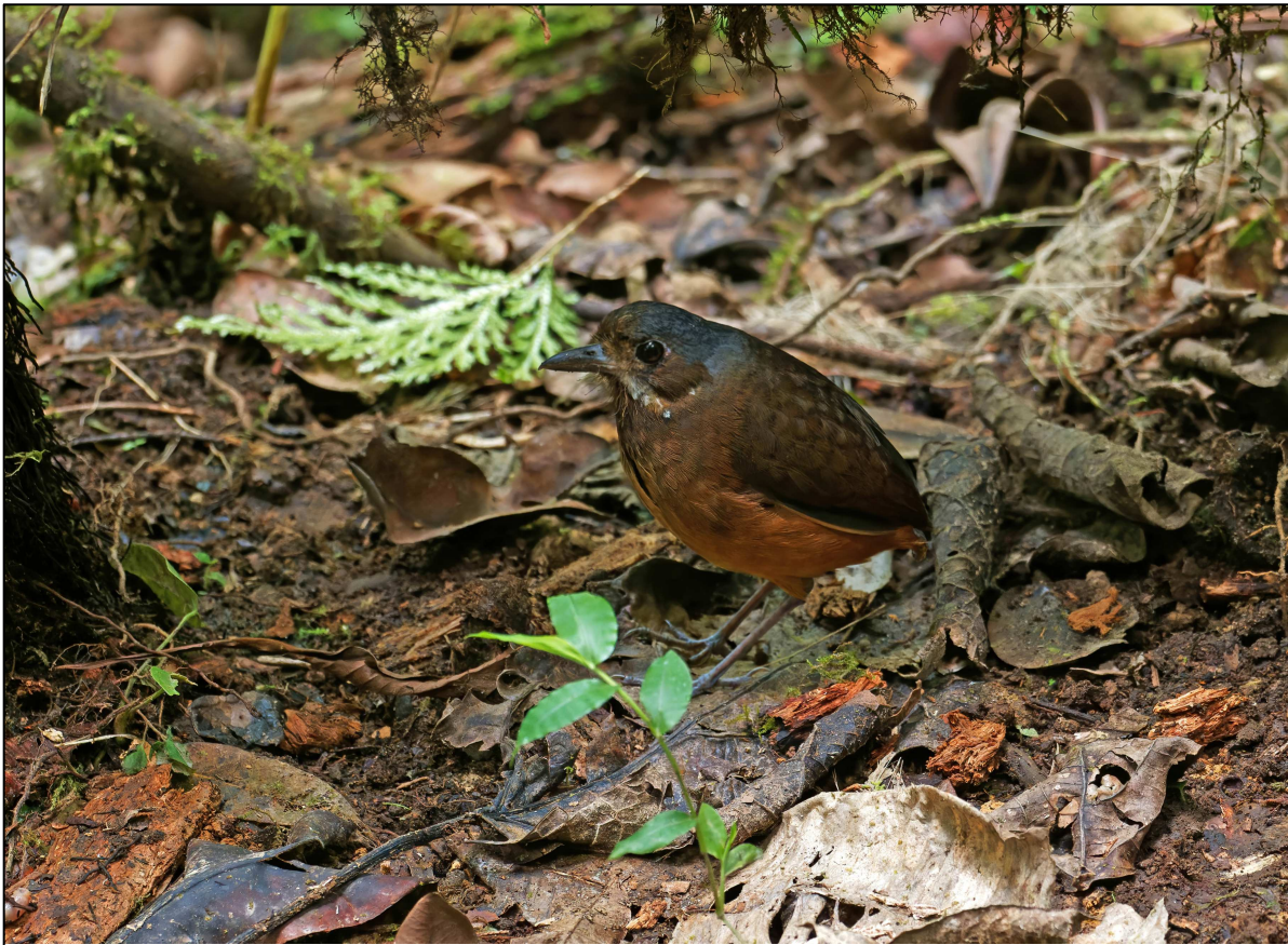
Moustached Antpitta was one of three antpittas scored at Paz de las Aves

It was then time for the traditional mid-morning brunch at Refugio Paz de Aves comprising of delicious bolones and empanadas , local food done very, very well, and washed down with Andean-grown coffee. We then spent much of the remainder of our time there searching for their famous antpittas. There were five possible species on offer, although seeing all five in one morning is actually not a given. We walked away with three and were very happy with the Ochre-breasted , Moustached ( photo below ), and Chestnut-crowned Antpittas seen! The fruit feeders and hummingbird feeders were also worth a look, and produced species like Toucan Barbet , Golden and Golden-naped Tanagers , Blue-winged Mountain-Tanager , Purple-bibbed Whitetip , White-booted Racket-tail , Velvet-purple Coronet , Andean Emerald and the spectacular Violet-tailed Sylph .