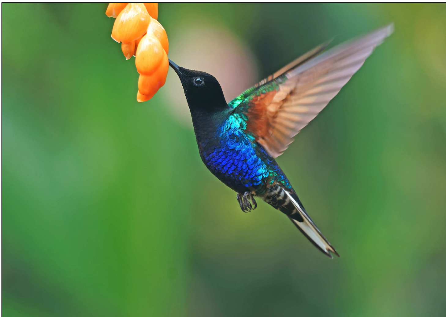
An Andean “belter”: Velvet-purple Coronet from Amagusa Reserve in the verdant Mashpi area

From both the main tour and extension we had recorded more than 370 species , with the list of birds below picked out by the group as their particular favorites: Crimson-bellied Woodpecker , Andean Cock of the Rock , Toucan Barbet , Scarlet and white Tanager , Crested Quetzal , Plate-billed Mountain-Toucan , Blue-winged Mountain- Tanager , Crimson-rumped Toucanet , Hooded Mountain-Tanager , Beryl-spangled Tanager , Cloud-forest Pygmy-Owl , Rose-faced Parrot , Torrent Duck , Velvet-purple Coronet (photo below) , Orange-fronted Barbet , Moustached Antpitta , Ocellated Tapaculo , Black Solitaire , Tanager Finch , Indigo Flowerpiercer , Black-capped Tanager , Crimson-mantled Woodpecker , Giant Hummingbird and the mighty Andean Condor .