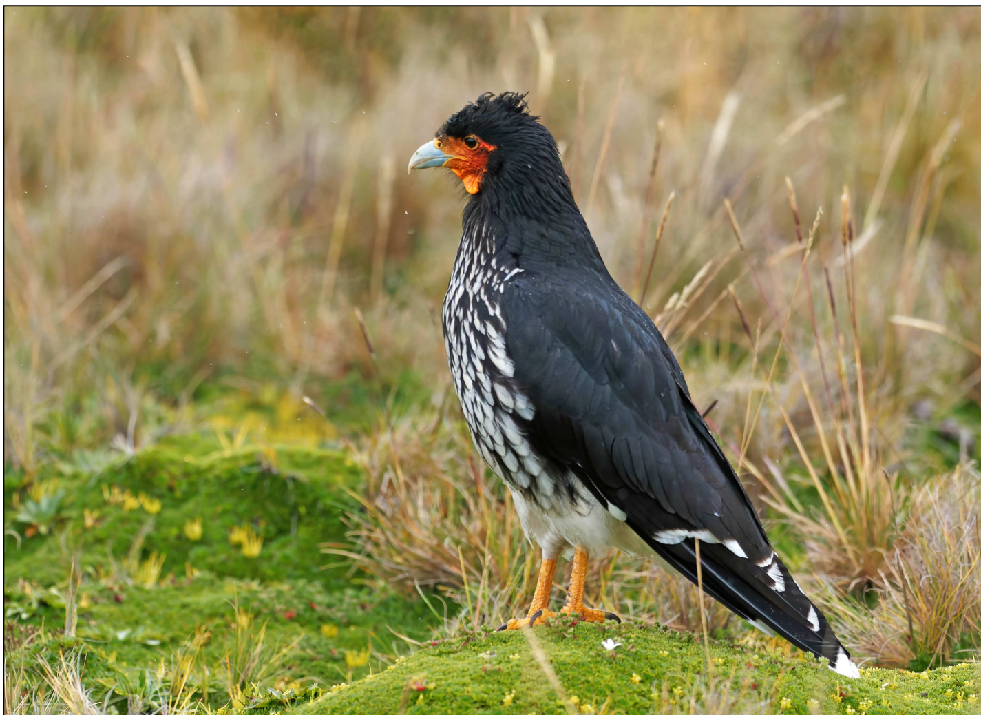
Carunculated Caracaras were quite approachable at Antisana National Park

Coot, Andean Teal, Andean Duck, Silvery Grebe, and Andean Gull. We retreated and took lunch just outside the park in a local restaurant around which we found Black-billed Shrike-Tyrant, Black Flowerpiercer, Tyrian Metaltail, Shining Sunbeam, and the largest hummingbird of them all, the impressively large Giant Hummingbird. After lunch we headed to our next destination, Guango Lodge on the other side of a high mountain pass at Papallacta . We made a stop at the pass but could not find anything of note and so carried on to Guango , getting there in time to admire some of their resident hummingbirds, like Buff-tailed and Chestnut-breasted Coronets, Tourmaline Sunangel, Long-tailed Sylph, and the cute White-bellied Woodstar to end our first memorable day in the High Andes .