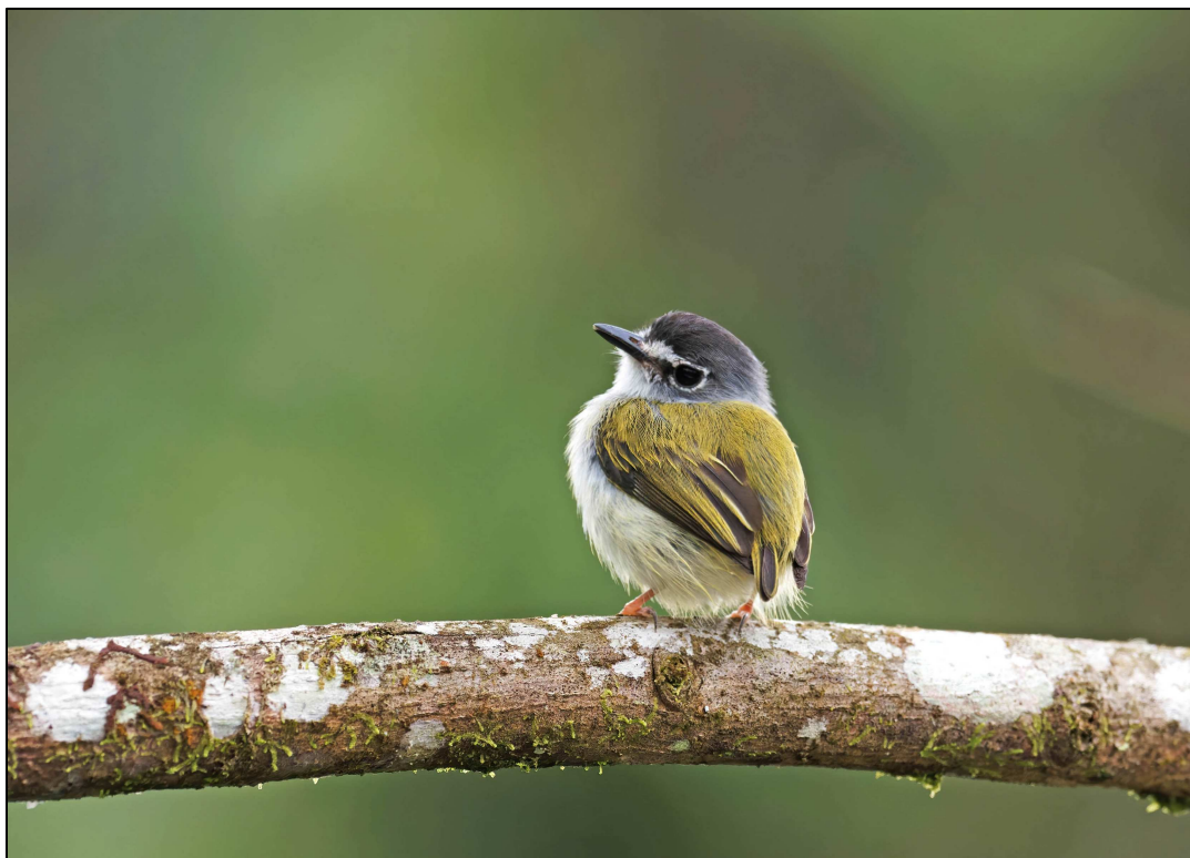
Black-capped Pygmy-Tyrant was seen at Rio Silanche