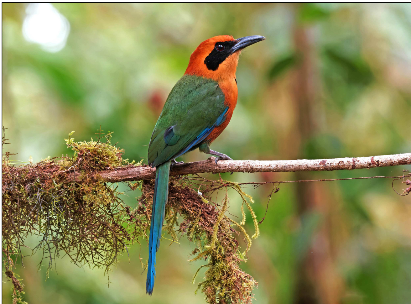
The fruit feeders right beside Tandayapa Bird Lodge attracted this handsome Rufous Motmot

On this day we stayed close to “home”, birding around the lodge first thing, then taking a late breakfast, before spending the remainder of the morning higher up the Tandayapa Valley , before returning to the lodge for a decent lunch. After a middle of the day rest, we spent further time in the Tandayapa Valley , not far above the lodge, where the road birding is often superb, as proven on this day! Fresh coffee had been brewed for our pre-breakfast birding from the veranda of the lodge, where we watched the moth sheet first thing, which lured in birds like Streaked-capped Treehunter , Plain-brown , Montane and Spotted Woodcreepers , Ornate and Golden-bellied Flycatchers , Tricolored and Chestnut-capped Brushfinches , Three-striped and Russet-crowned Warblers , and a shy Uniform Antshrike . Then we took our breakfast, while watching the fruit feeders from the table as we did so. These were active during our visit, with Golden , Flame-rumped and Golden-naped Tanagers , Red-headed Barbet , Rufous Motmot ( photo above ), Blue-winged Mountain-Tanager , and Toucan Barbet all visiting during our breakfast vigil.