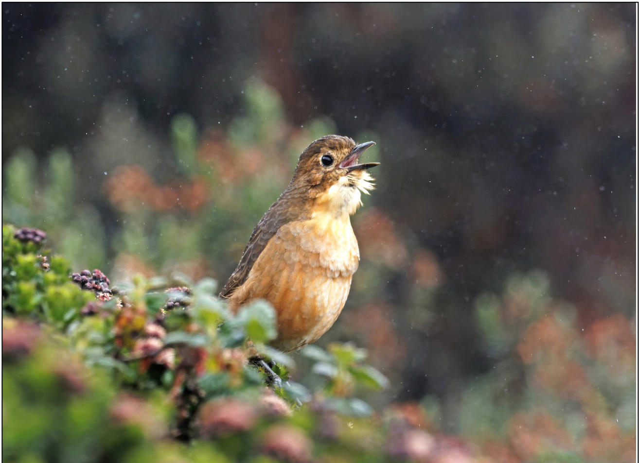
This Tawny Antpitta was belting out its familiar call in Cayambe-Coca National Park

Streaked Tuftedcheek, Pearled Treerunner, Beryl-spangled Tanager, and a friendly Slaty Brushfinch. After that, we packed up and left Guango Lodge , with a packed lunch in tow to take in the field higher up. We drove to the entrance of Cayambe-Coca National Park , finding Viridian Metaltail, Shining Sunbeam, Great Sapphirewing, Brown-backed and Rufous-breasted Chat-Tyrants , and the extremely attractive Rainbow-bearded Thornbill feeding on some flowering highland shrubs. After taking our field lunch within magnificent mountain scenery, we headed up towards the pass at Papallacta , making a short stop beside Laguna de Papallacta , where we saw some more highland waterbirds, like Andean Teal, Yellow-billed Pintail, Spotted Sandpiper , and more Slate-colored Coot . Then we birded near the other entrance to Cayamba-Coca National Park , noting some of our final birds of the tour, such as Plumbeous Sierra-finch, Chestnut-winged and Stout-billed Cincloides, Variable Hawk, Carunculated Caracara, Many-striped Canastero , and Tawny Antpitta ( photo below ). Lower down from there we made one final stop where the highlights were White-chinned Thistletail, Blue-mantled Thornbill and the usually elusive Purple-backed Thornbill . Then it was time to retreat to Quito , staying at our now familiar hotel close to the airport for one final night to reflect on what had been a very successful High Andes Extension .