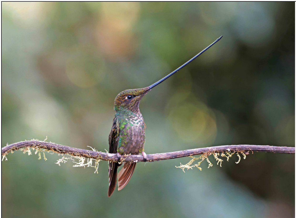
The remarkable Sword-billed Hummingbird was seen at Zuro Loma