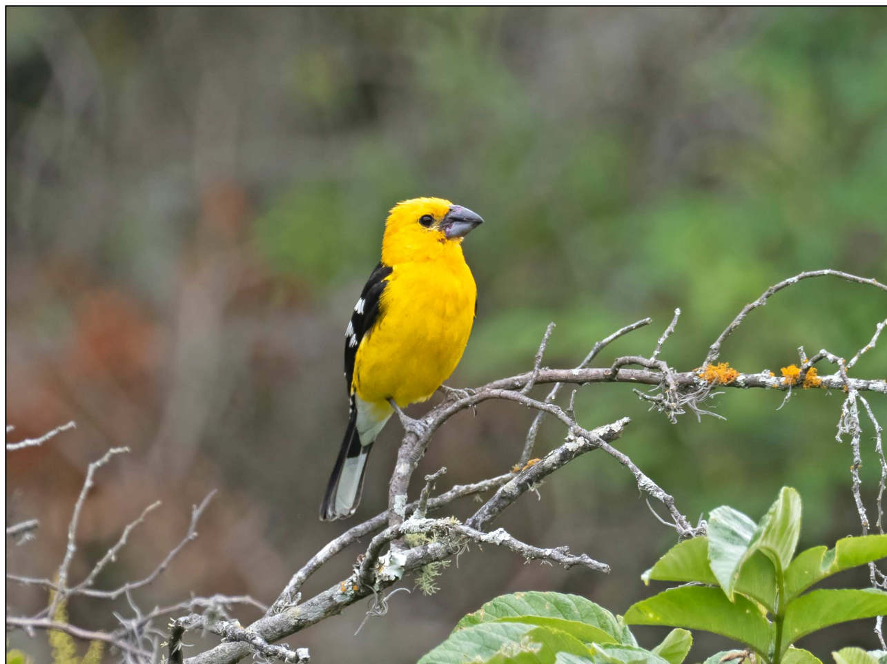
Golden Grosbeak was seen at Calacali, between Tandayapa Bird Lodge and Quito