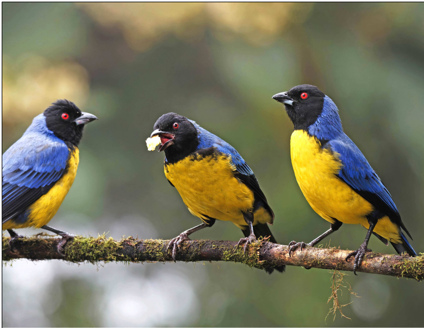
Hooded Mountain-Tanagers from Zuro Loma

June 16th: Zuro Loma, Yanacocha Reserve & Old Nono Mindo Road.