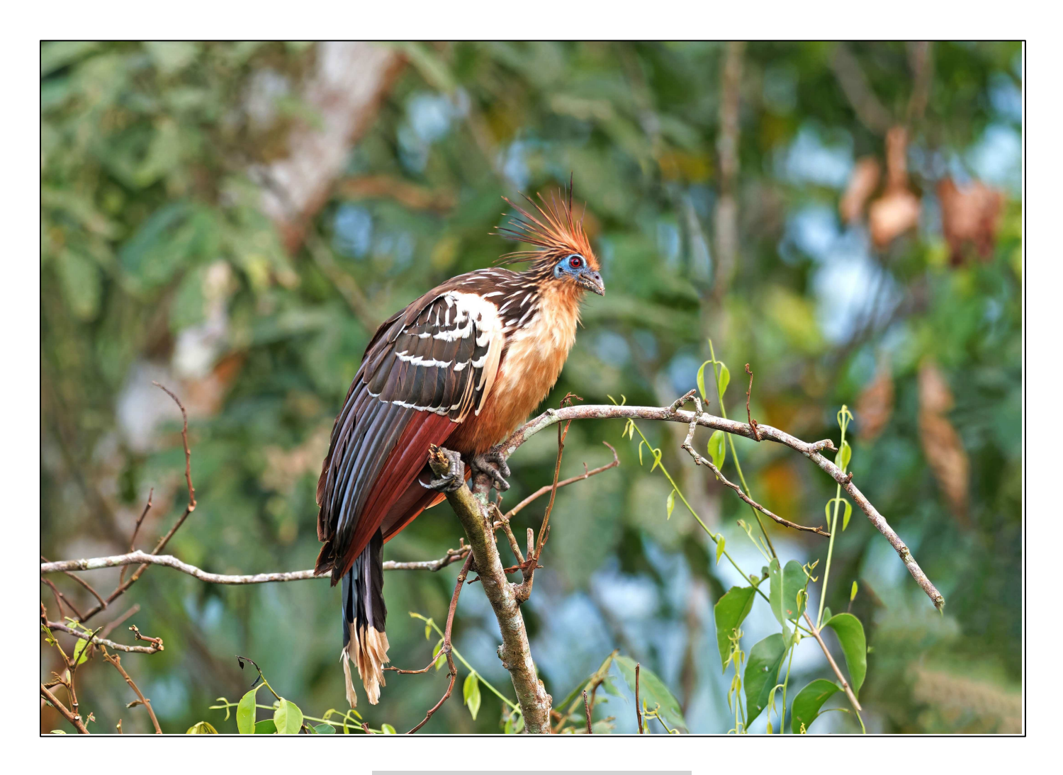
Hoatzin at Manu Biological Station

Near the end of the afternoon, we arrived at our next lodge, at the edge of foothill forest with enough time for some final birding, Spot-breasted and Yellow-tufted Woodpeckers , Red-capped Cardinal , Golden-bellied Euphonia , and a small wetland had Capped Heron , Green Kingfisher , Green Ibis , Brazilian Teal , and Hoatzin ( photo below ). At the end of the day, before darkness fell one of the lodge staff led us a sleeping Black-banded Owl for the conclusion of the day.