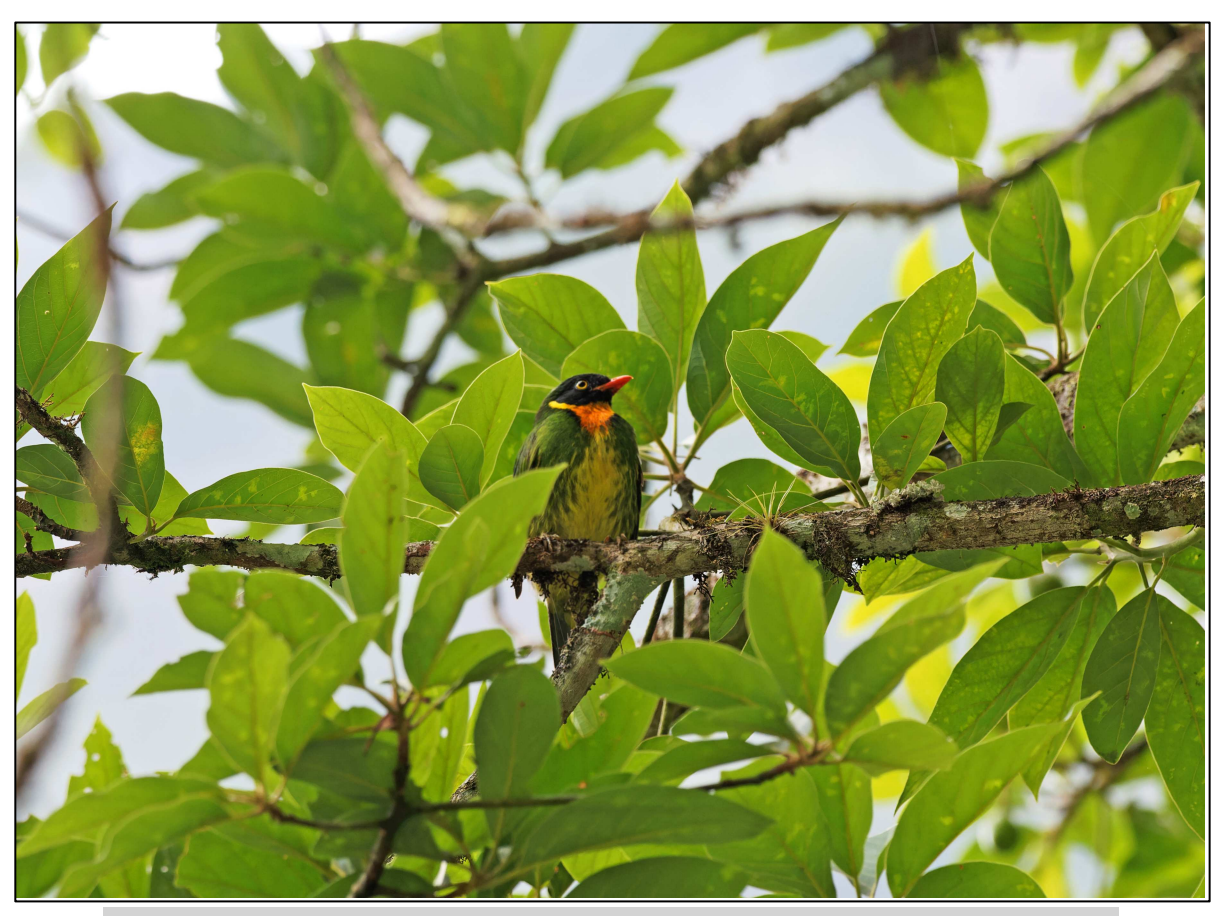
Masked Fruiteater from Machu Picchu & Torrent Duck on the Urubamba River