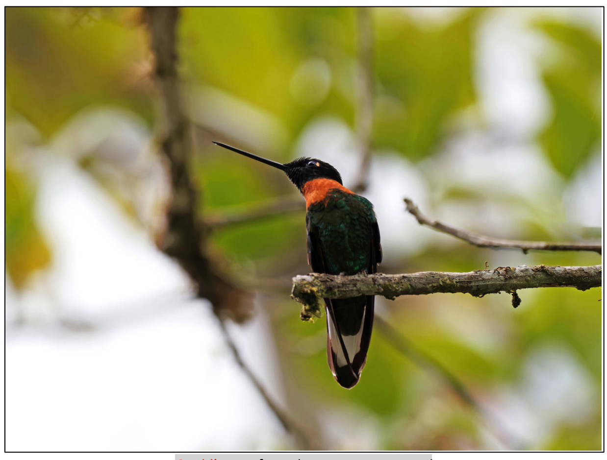
Gould's Inca from the Upper Manu Road

Among the birds we spotted in the vicinity of the pass before lunch included the striking endemic Creamy-crested Spinetail, in addition to Shining Sunbeam, Scarlet-bellied Mountain-Tanager, Puna Thistletail, and Moustached Flowerpiercer. After lunch, we dropped down from the pass and found a great feeding flock along the roadside, which held Black-faced Brushfinch, Crimsonmantled Woodpecker, and Hooded Mountain-Tanager, while Rufous-capped Thornbill and Tyrian Metaltail came into imitations of the whistles of a local pygmy-owl . Then, we were surprised by seeing a superb Gray-breasted Mountain-Toucan perched prominently on a dead snag. We continued our downward journey along this winding mountain road, making stops as activity greeted us, one stop yielding Pale-legged Warbler and the gaudy White-collared Jay, and Gould's Incas ( photo above ), Beryl-spangled Tanager, Blue-banded Toucanet ( photo next page ), and a nesting Golden-headed Quetzal. Most of the rest of our time was taken up with driving towards our destination, Cock-of-the-rock lodge, which we arrived at shortly after seeing an Andean Motmot just above there to finish off a busy days birding along the Manu Road.