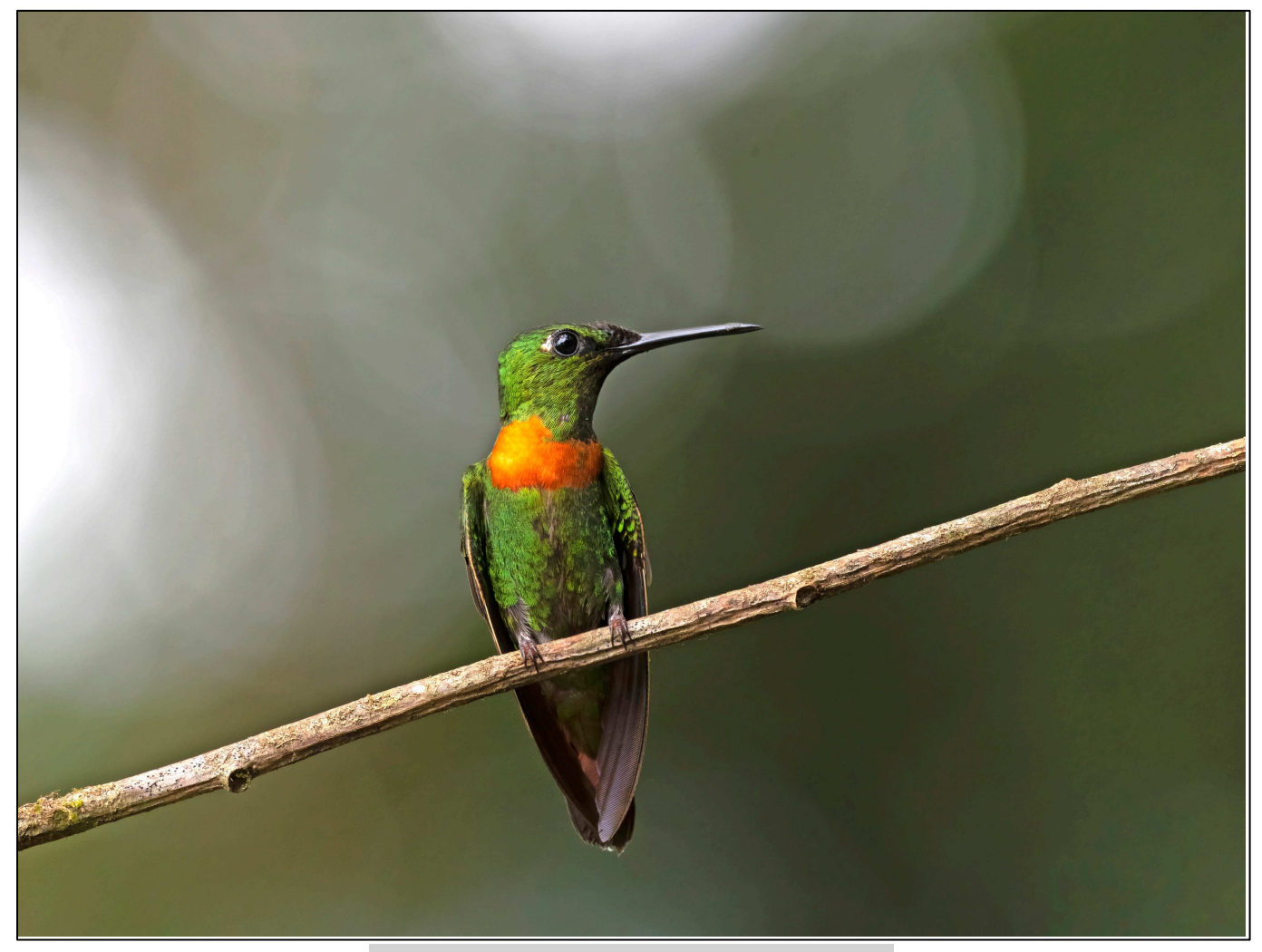
Gould's Jewelfront from Pico de Hoz Reserve

We then returned to the lodge for lunch and a rest. Later, around the lodge we found Turquoise Tanager, Gould's Jewelfront (photo below), and a surprise Spotted Tody-Flycatcher (more typically associated with river islands). Deeper inside the forest, we found Chestnut-tailed Antbird, Bluish-slate Antshrike, and the bamboo specialist, Manu Antbird. Rain caused us to retreat to our cabins, when we could bird from the shelter of these, finding Hoatzin, Chestnutfronted Macaw, Blue-headed Parrot, and Little Woodpecker. In spite of the afternoon rain, we finished the day with a good haul of birds!