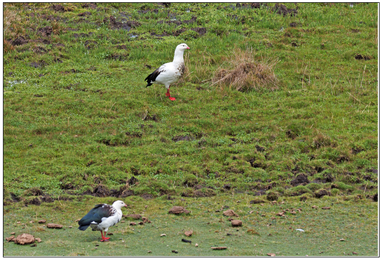
Andean Geese were seen at Abra Malaga

Higher still, we did a little bit of birding within Polylepis forest, picking up Andean Ibis and Taczanowski's Ground-Tyrant on the way there. A short period of birding within the high polylepis forest there yielded Blue-mantled Thornbill and the endemic White-browed Thistletail , before we decided to retreat to lower climes with the altitude telling on some of us. This site did produce some of the most impressive scenery of the entire tour with views of Veronica Peak visible from the pass. As we drove this highland highway, we were able to see some quintessential high Andean species like, Andean Lapwing, Andean Goose (photo below), Andean Gull , and the majestic Andean Condor on the wing.