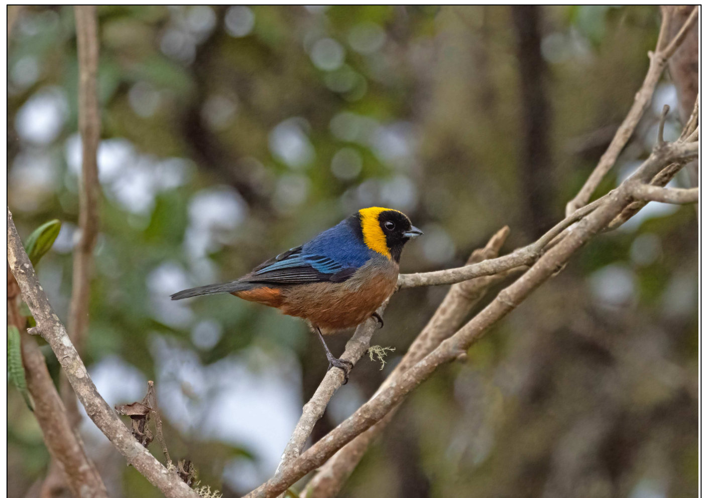
The striking Golden-collared Tanager from Upper Manu Road

As we had some spare time, we visited Wayquecha Biological Reserve, noting species like Longtailed Sylph, Amethyst throated Sunangel, White-bellied Woodstar, Speckled Hummingbird, and the scarce Violet-throated Starfrontlet at their feeders. Then, just before we called off our birding in the area, we got the stunning, Scarlet-bellied and Hooded Mountain-Tanagers, Moustached and Masked Flowerpiercers, Puna Thistletail, Drab Hemispingus, and Grass-green and Blue-and-black Tanagers and the striking Golden-collared Tanager (photo below), in a feeding frenzy. After that, we made the long drive to Ollantaytambo set within Peru's Sacred Valley.