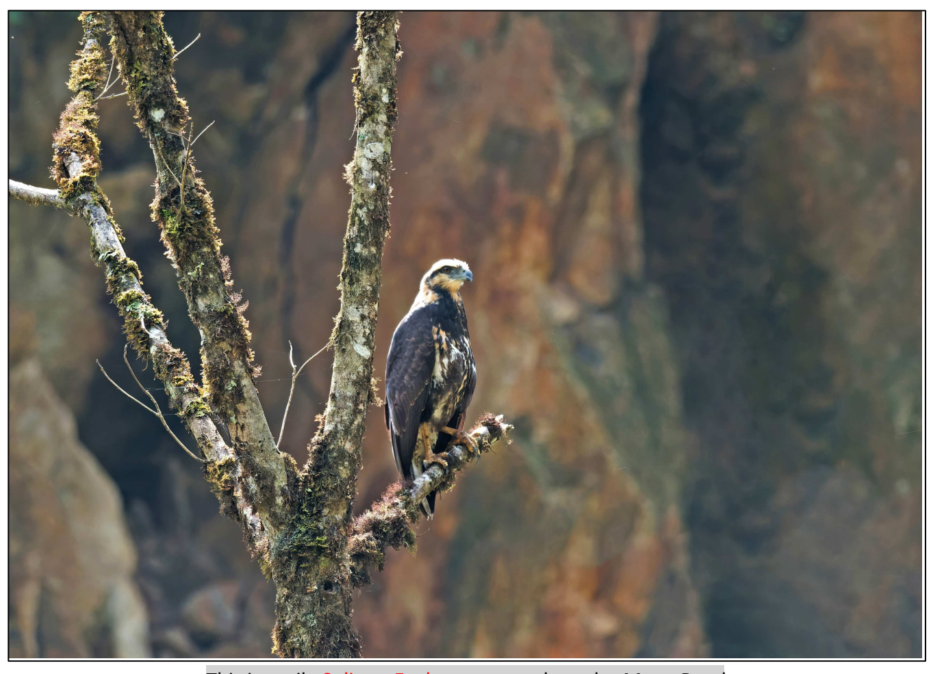
This juvenile Solitary Eagle was seen along the Manu Road