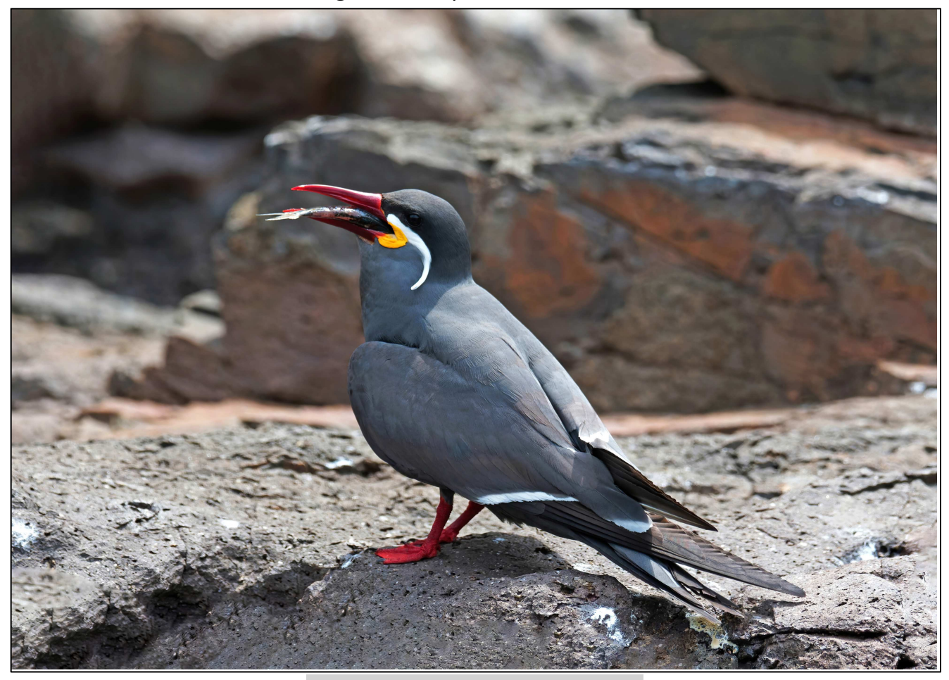
Inca Tern from Pucusana fishing port

cheeked Pintail and a selection of shorebirds. The tour closed with one final farewell donner together before our homeward, nighttime departures out of Peru .