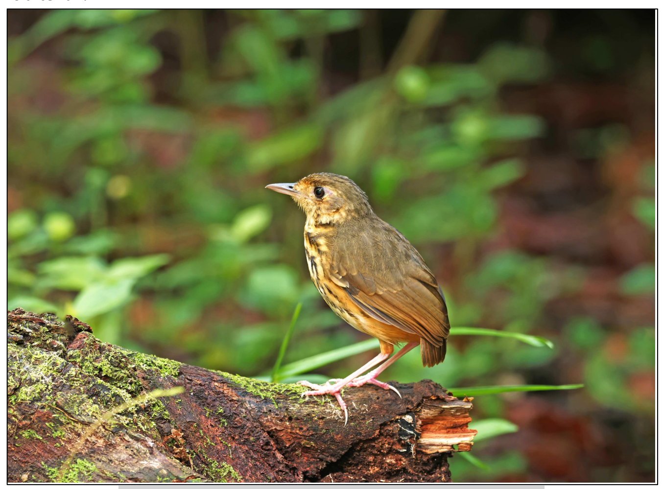
We had marvelous views of this Amazonian Antpitta at Pico de Hoz

This day mostly consisted of birding in and around the lodge. However, we started by visiting a private reserve, Pico de Hoz , named after the sicklebill hummingbird. This was not our first reason for being there though, as we checked in at an antpitta feeding station, with initially no success. Having given up on the antpitta after a considerable wait, an Amazonian Antpitta ( photo below ), finally started calling as we looking to leave and then came in and gave marvelous views after all!