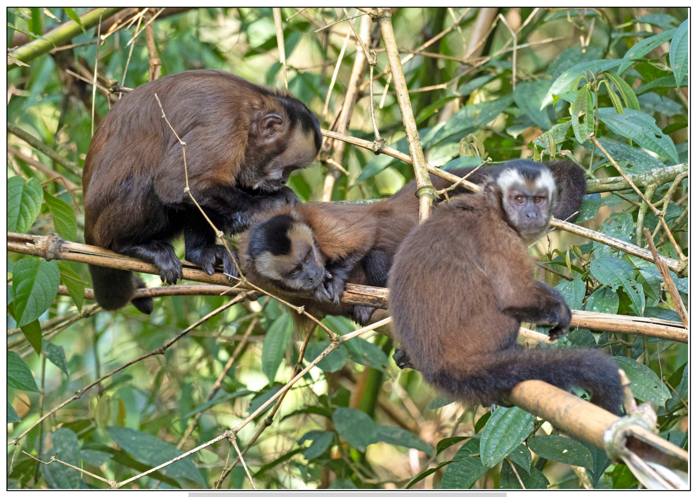
Black-capped Capuchin at Cock of the Rock Lodge