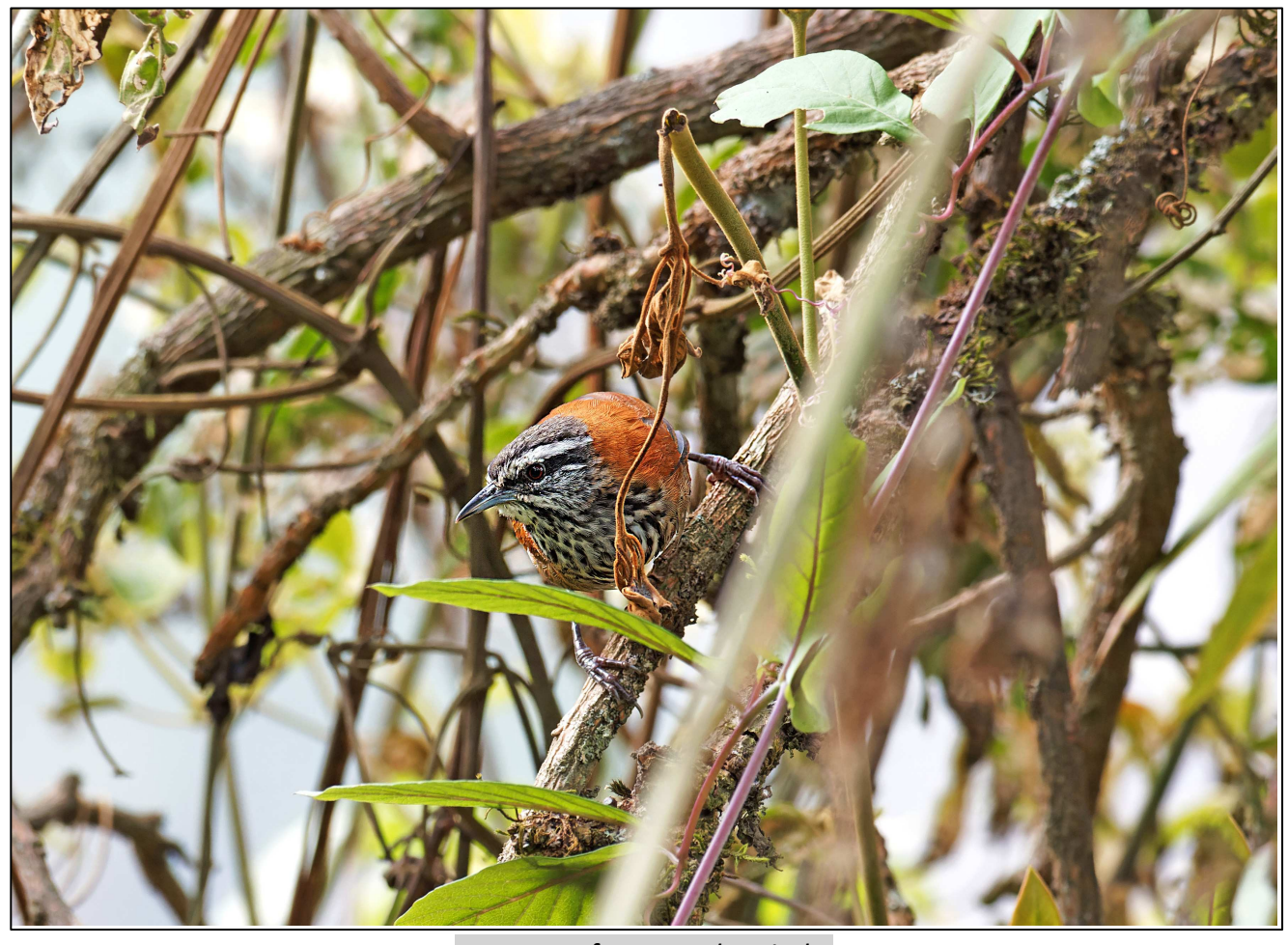
Inca Wren from Machu Picchu