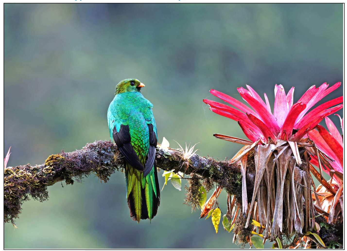
Golden-headed Quetzal from the legendary Manu Road

On this day we retraced our steps back up the Manu Road to the upper part of this, as this was the elevation where we were missing the most species. As soon as we arrived at the appropriate altitude, we came across a feeding flock that held Russet-and-yellow Tanager, Striped Treehunter, Capped Conebill, Barred Becard, Inca Flycatcher, Streaked Tuftedcheek, Versicolored Barbet, Three-striped Hemispingus, Montane Woodcreeper, and Common Chlorospingus. A short drive upwards from there also produced Andean Motmot, Andean Guan, Dusky-green Oropendola , and a vociferous White-collared Jay . Later in the morning, we continued driving up higher, and came upon Blue-capped Tanager, Spectacled Redstart, Fawnbreasted Tanager, and, with a little effort, we were even able to see the shy endemic, Red-andwhite Antpitta.