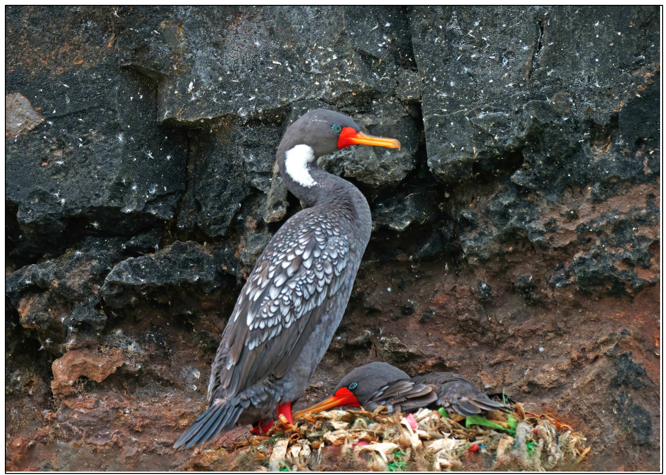
Red-legged Cormorant from Pucusana

Sadly, all too soon, the last birding day of the tour had come around. This consisted of us flying out of Cuzco in the morning back to the capital Lima . From there we made a trip out to Pucusana for a great seabird finale to the tour, as we took a boat trip into the harbor there. Our main focus was an off-shore islet, where masses of seabirds gather to breed, and we were afforded incredible views of a fine selection of pelagic birds including Inca Terns (photo next page), Redlegged Cormorants (photo above), and Humboldt Pinguins. The area also held Belcher's and Gray Gulls, American and Blackish Oystercatchers, Peruvian Pelicans, hundreds of Peruvian Boobies, and a very friendly Eliot's Storm Petrel. A few Surfbirds were also there too. After this boat trip and a tasty seafood lunch nearby we started our journey back to Lima for the end of the tour, though taking in some final birds along the way, such as some very well-hidden Peruvian Thick-knees, Long-tailed Mockingbird, Amazilia Hummingbird, Scrub Blackbird and a nice dose of waterbirds at Pantanos de Villa , which included Cinnamon Teal and White-