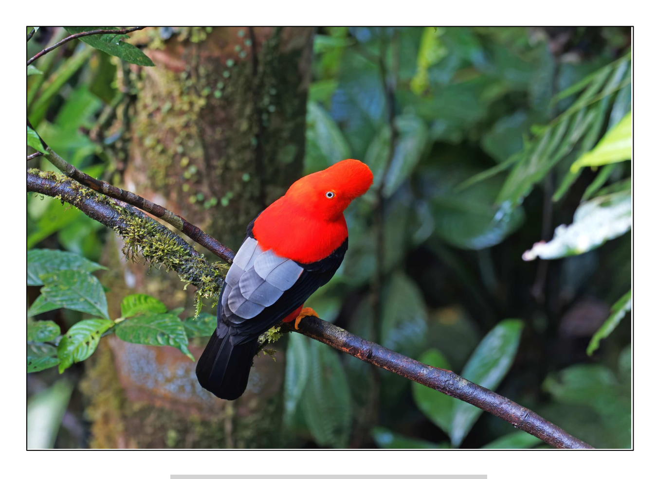
Andean Cock of the Rock from the San Pedro Area

After lunch, many took a siesta, while others watched the lodge feeders, seeing the same species that we had seen in the morning with the exception of a Black-capped Capuchin (photo next page). Some roadside birding after then produced some flocks with species like Yellow-throated, Saffron-crowned, and Spotted Tanagers, and Golden-eyed Flowerpiercer. Our driver tipped us off about a small private reserve with feeders nearby, which held species such as Amethyst and White-bellied Woodstars, Bronzy Inca, and noisy Violet-fronted Brilliants. We stayed until darkness fell to score a Lyre-tailed Nightjar to finish our day in some style.