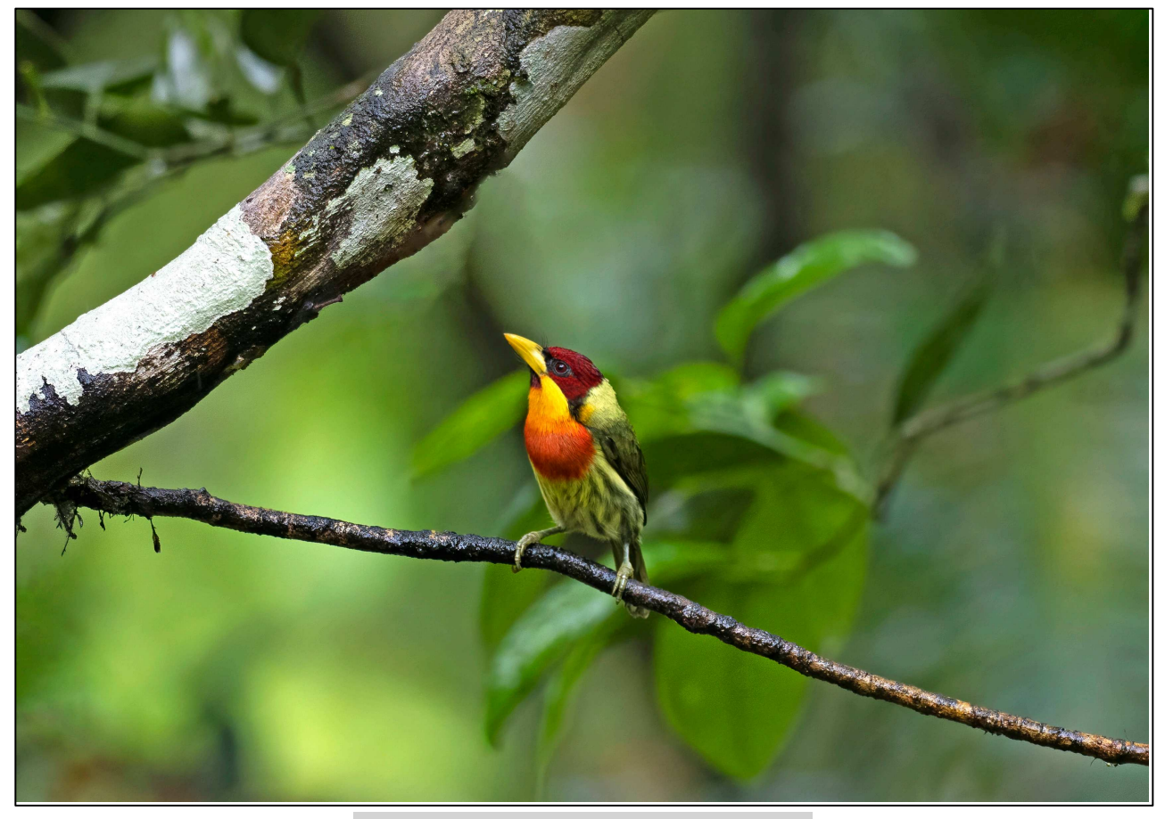
Lemon-throated Barbet at Inkamazonia

Sadly for us, this was to be our final full day in this area. Worse still, we woke up to heavy rain, limiting what we could do then. We did manage some birding right around the restaurant, where we saw Blue-throated Piping-Guan, Orange-fronted Plushcrown, Red-capped Cardinal, and by the pond, Rufescent Tiger-Heron , Purplish Jay , and the scarce Scarlet-hooded Barbet to finish off our time there. After that opener, we drove to another private reserve with great feeders, Inkamazonia. The rain continued through our visit there, though this did not stop us from building a handsome bird list, including White-bearded Hermit, Fork-tailed Woodnymph, Bluefronted Lancebill, Gould's Jewelfront, Golden-tailed Sapphire, Reddish Hermit, Sapphirespangled Emerald, Violet-headed Hummingbird, Rufous-crested Coquette, and Gray-breasted Sabrewing at the hummingbird feeders, and Buff-tailed Sicklebill (a major target for us there) at the local Verbena blooms. The fruit feeders were lively too, with Green Honeycreeper, Blue and Yellow-bellied Dacnis, Buff-throated Saltator, a pair of Lemon-throated Barbets (photo below), and Silvered-beaked, Blue-necked, Turquoise Tanager Yellow-bellied and Masked Tanagers.