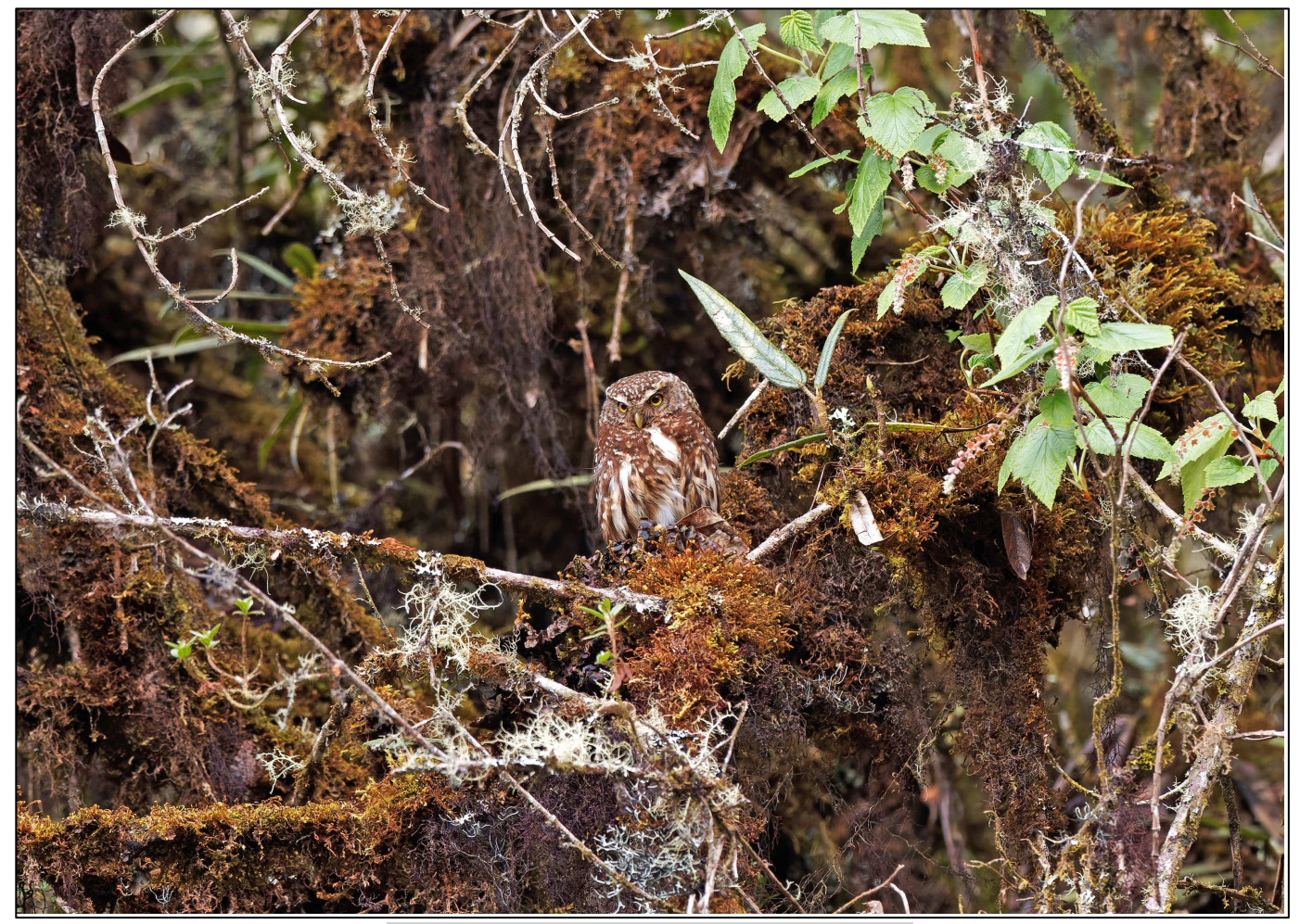
Yungas Pygmy-Owl from the Carrizales area

After some of us got brief views of the always elusive Undulated Antpitta (one of the hardest to see of all the Andean antpittas), we took lunch in the field. Some final birding in the area before we returned to Ollantaytambo produced some major targets like White-tufted Sunbeam, Cuzco Brushfinch, and Marcapata Spinetail, in addition to a treetop Red-crested Cotinga. Once back at our hotel, some of us did some late leisurely birding there, finding Blacktailed and Green-tailed Trainbearers and the bulky Black-backed Grosbeak to end the day shortly before the onset of happy hour at the bar!