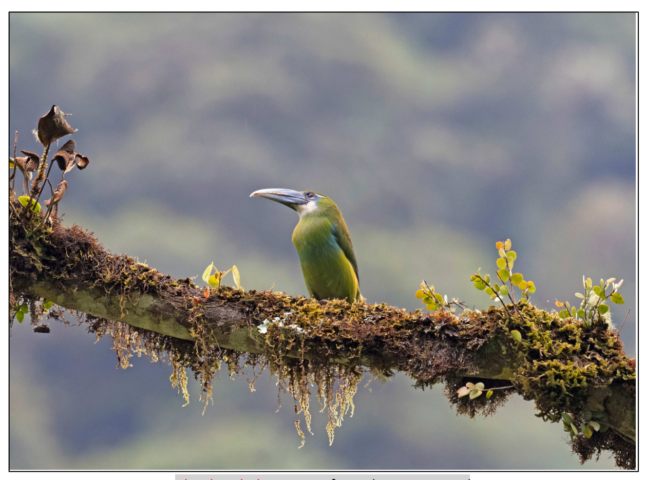
Blue-banded Toucanet from the Manu Road