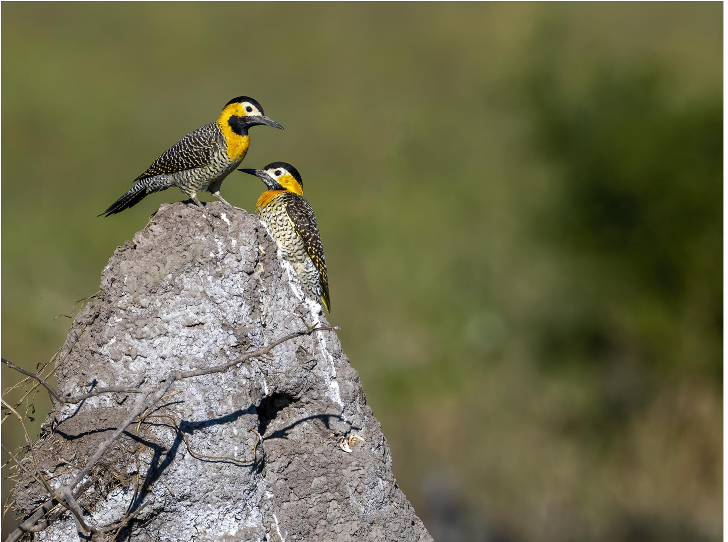
Campo Flickers (above) are very colorful and attractive. They often sit on top of termite mounts