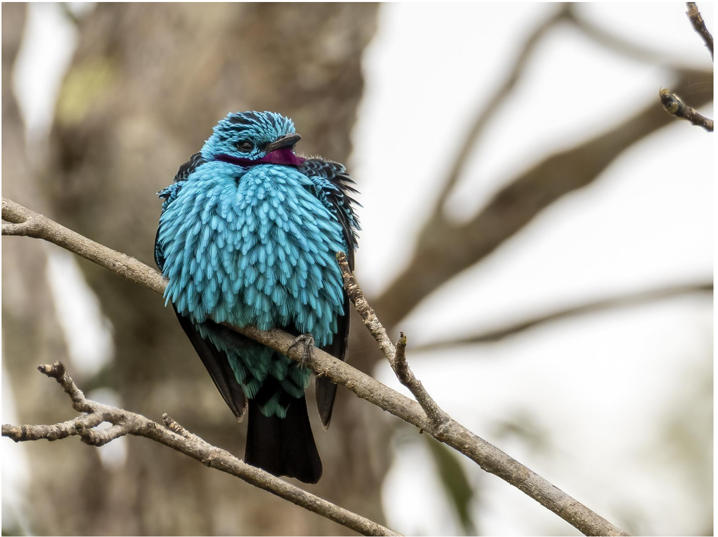
Spangled Cotingas (above) normally are canopy birds but, for some strange reason, this individual sat for the longest time in the mid-levels of a tree in an open area. It seemed like it was possibly ill, or just resting.