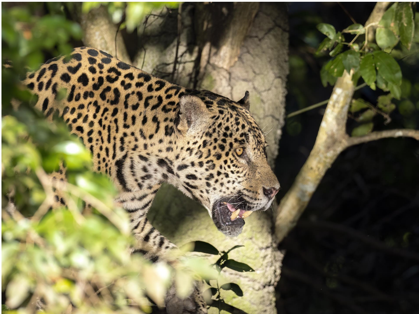
Cannot help posting another of the many views we got of Jaguars ( above ). This one was walking along the shoreline of the river parallel to us as we floated down the river following it.