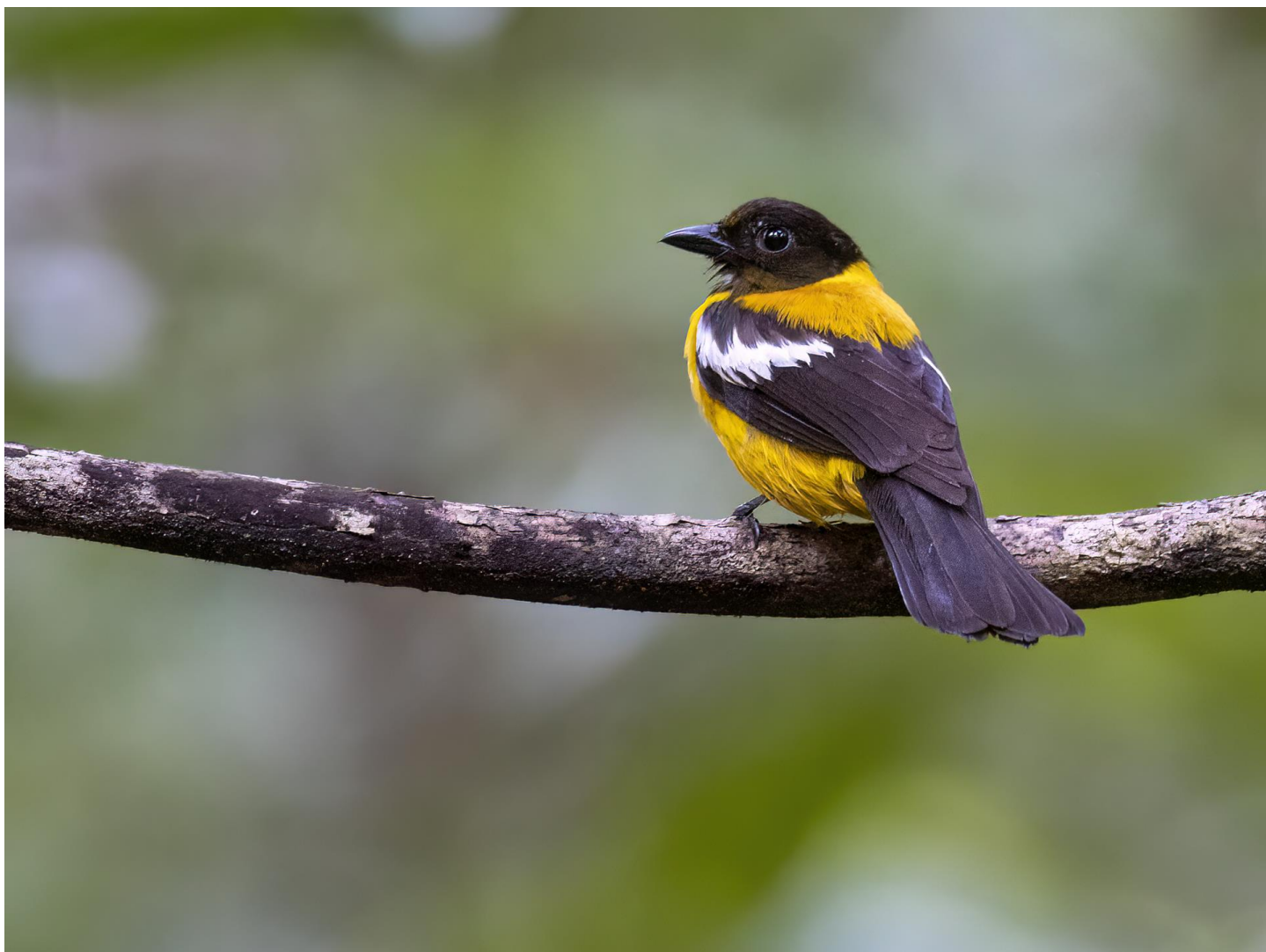
The blinds in front of the poçinhas (water drips) at Cristalino are great to see and photograph some difficult birds like this White-winged Shrike-Tanager (above) which is normally hard to see.