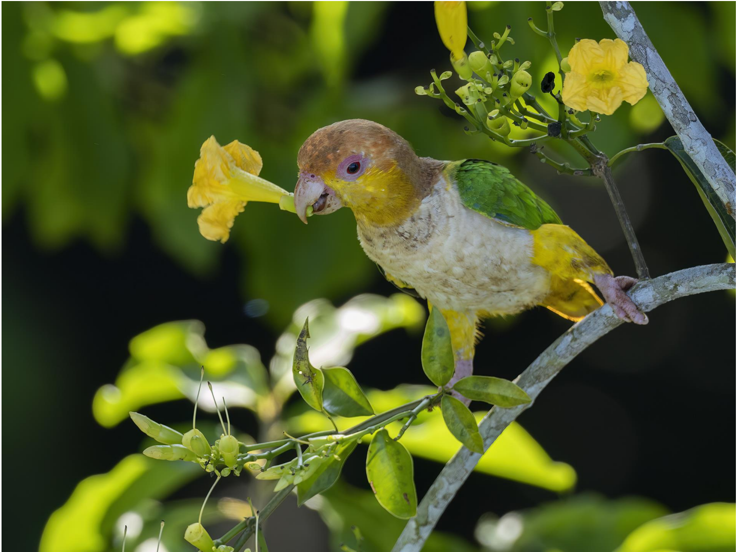
The gaudy White-bellied Parrot ( above ) put on a show at close range from the tower of Cristalino