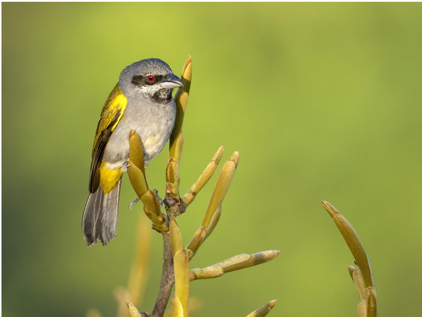
The canopy tower of Cristalino Jungle Lodge is the best place I know to see the scarce Yellow-shouldered Grosbeak (above), an Amazonian specialty stays high in the canopy.