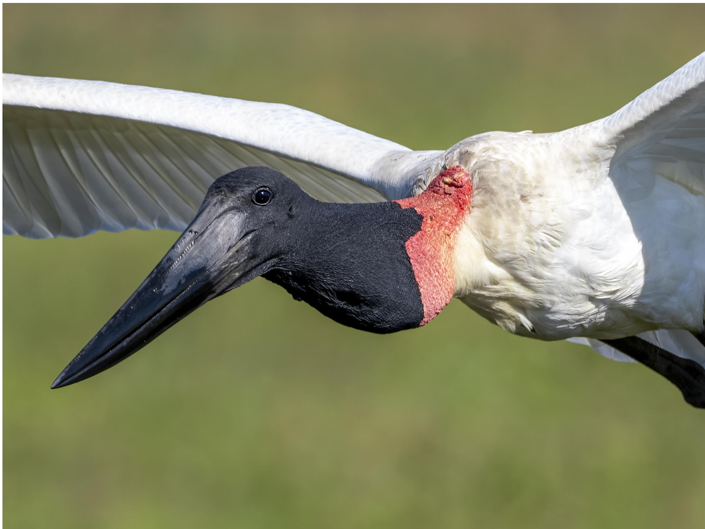
The alien-looking Jabiru stork ( above ) needs to always be featured in any report.