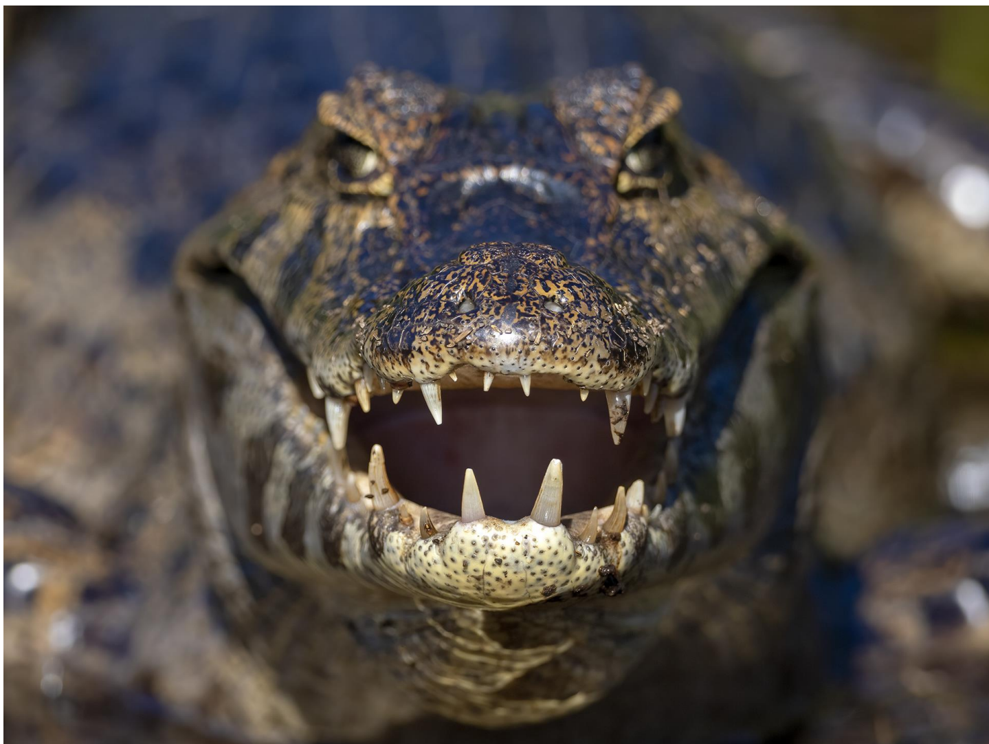
Jacare Caimans (above) are abundant and tame. They are not aggressive humans as long as you keep your distance