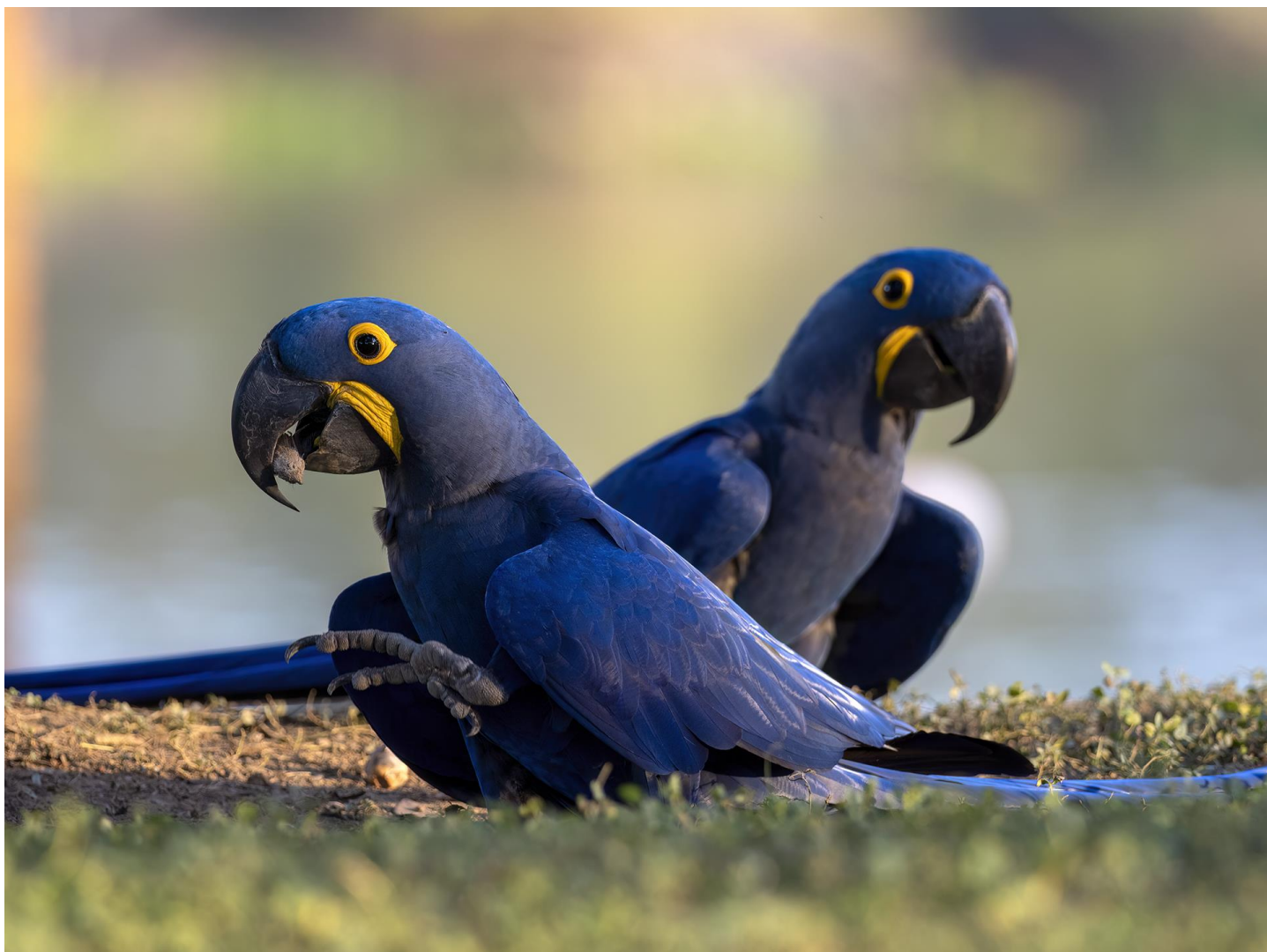
Hyacinth Macaws (above) were very cooperative one afternoon at Porto Jofre. We had seen them much earlier on the tour but true photo opportunities only became good during the last afternoon in the Pantanal