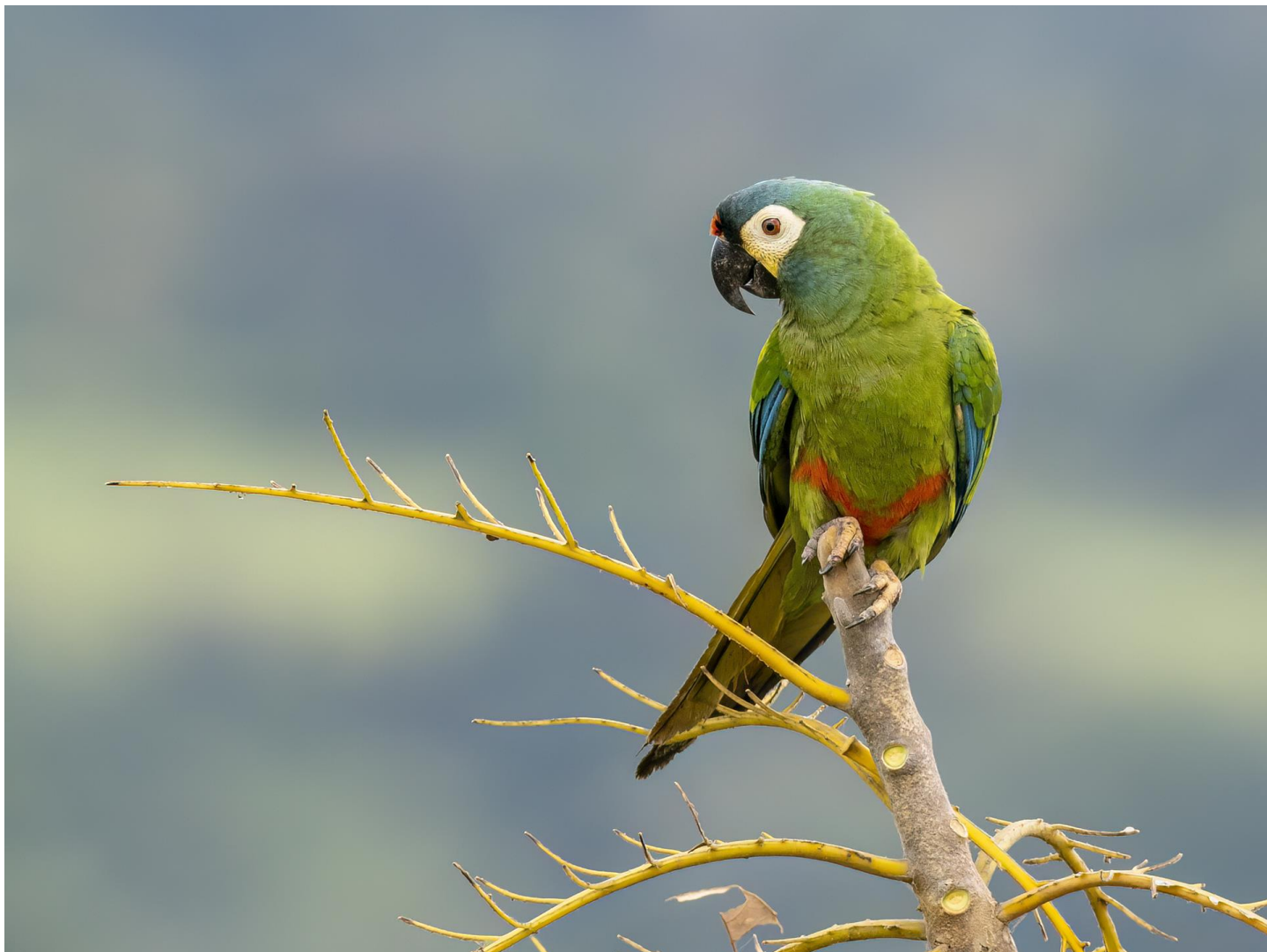
This Blue-winged Macaw ( above ) was spotted perched at eye-level and it stayed put for a long time which meant we got great views and photos