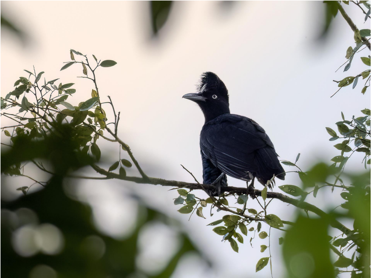
I really like this ambient shot of one of the big targets on a visit to the Amazon, the hulking Amazonian Umbrellabird (above). One of the participants did an amazing job spotting it.