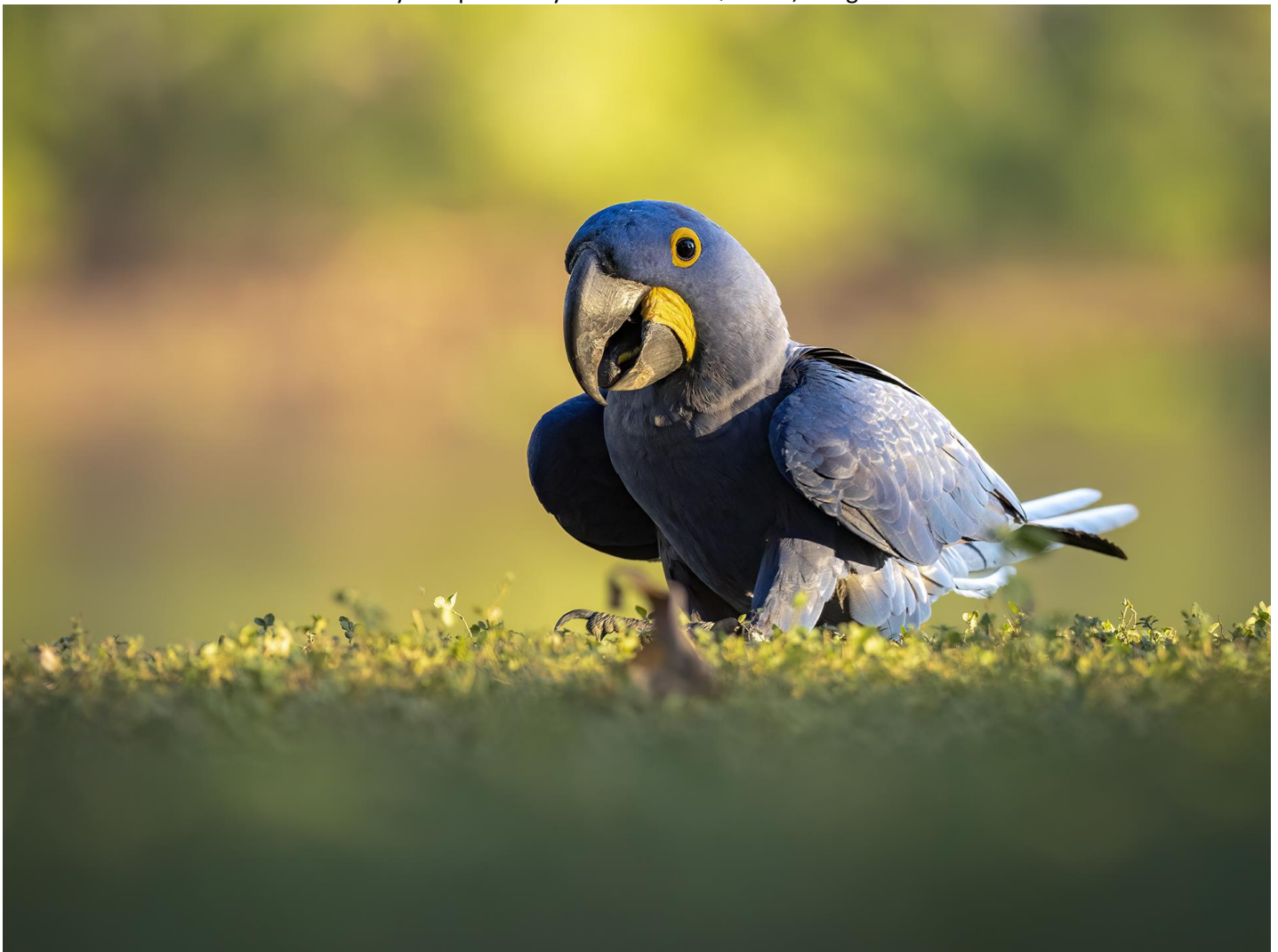
Photo Summary and photos by ANDRES VASQUEZ N., the guide for this tour

It is really difficult not to feature a Hyacinth Macaw (photo above) on this cover page when it gave us such amazing photo opps.