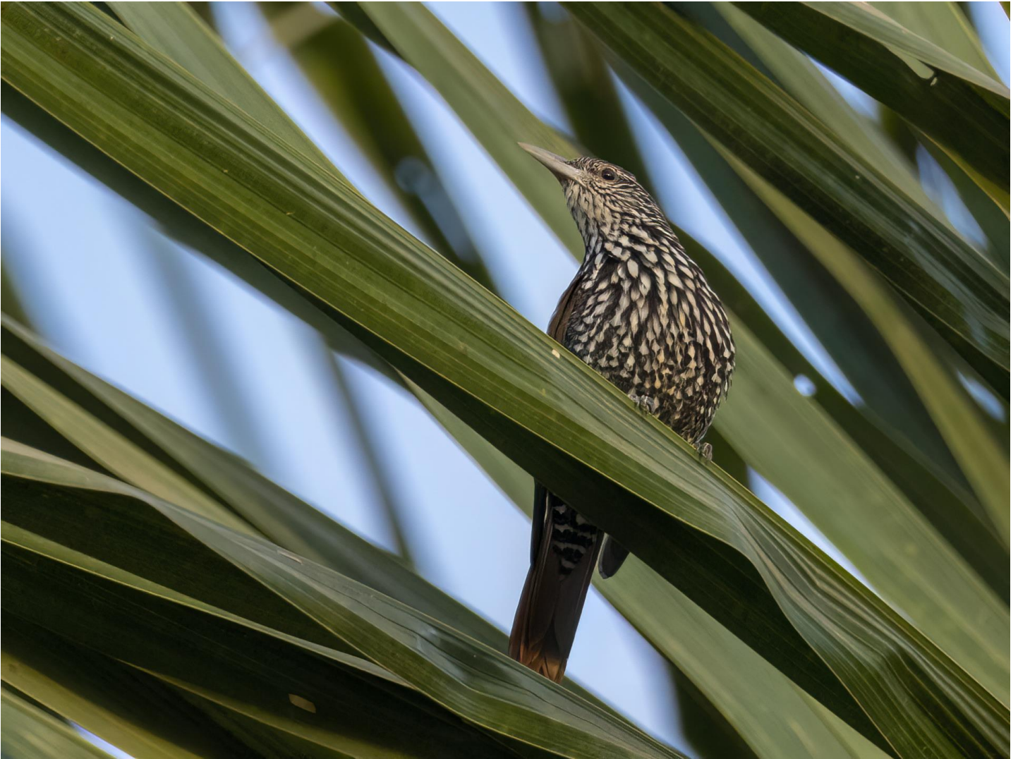
Another of my personal favorites this elusive and difficult Point-tailed Palmcreeper ( above ) which came down unusually low