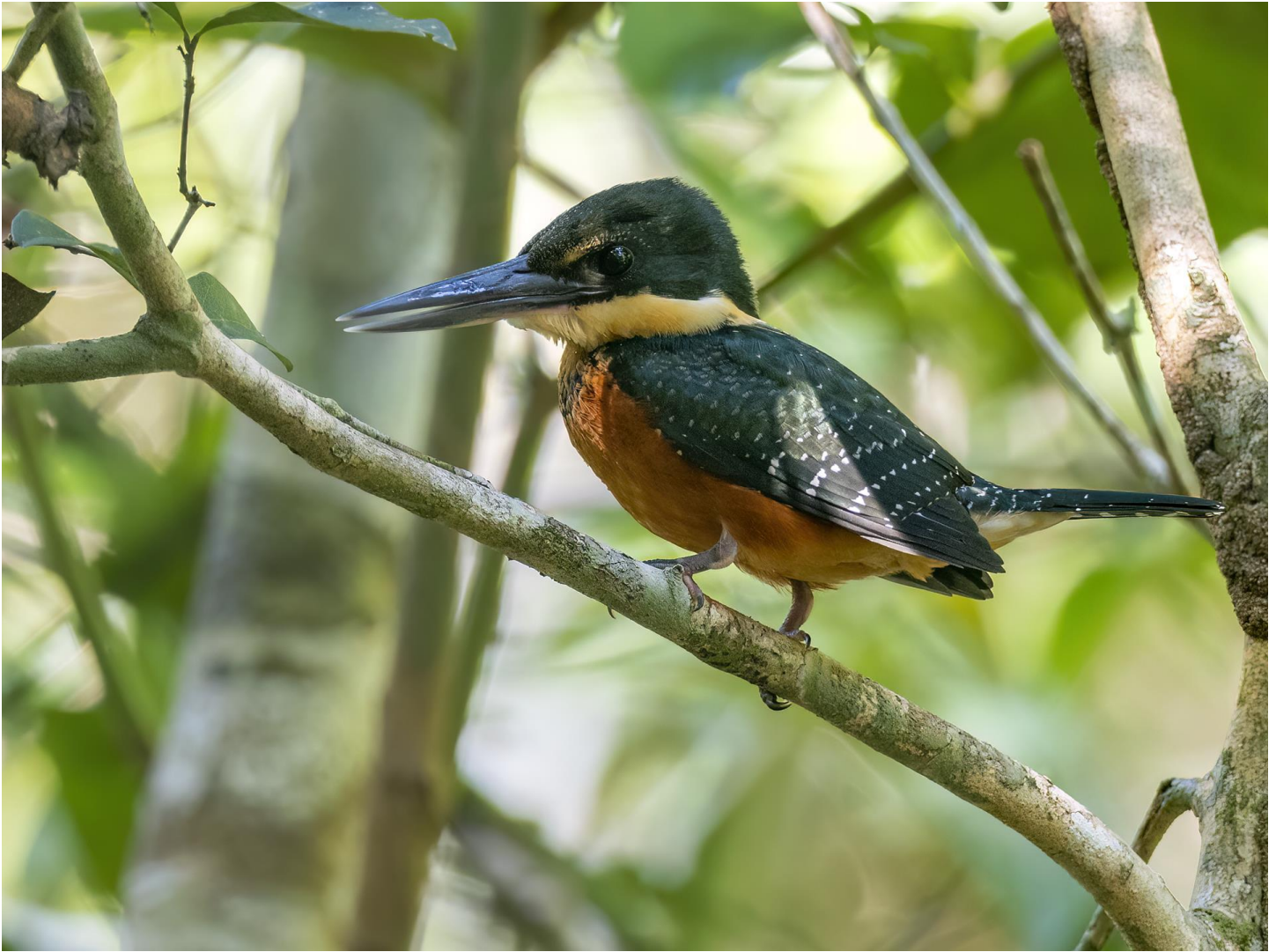
The more reclusive Green-and-rufous Kingfisher (above) was the most rewarding