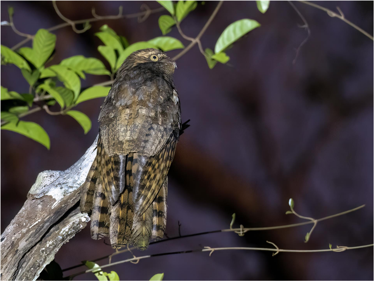
One night we were taken by our local guide to a stake-out he had for this Long-tailed Potoo ( above ). Otherwise it would be extremely hard to find