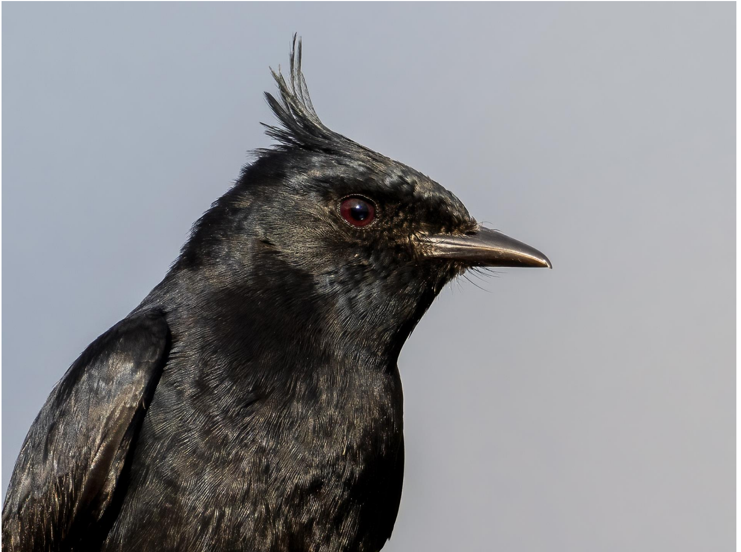
In the Cerrado we had impossibly close views of this Crested Black-Tyrant (above)