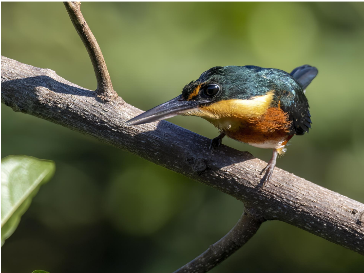
We got the 5 resident South American Kingfishers in one morning, American Pygmy (above) was the most cooperative