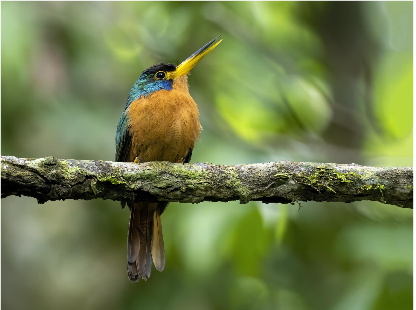
One of my favorite birds from the southern Amazon is Blue-cheeked Jacamar ( above ). I have seen it every time I have visited the area but never this well.