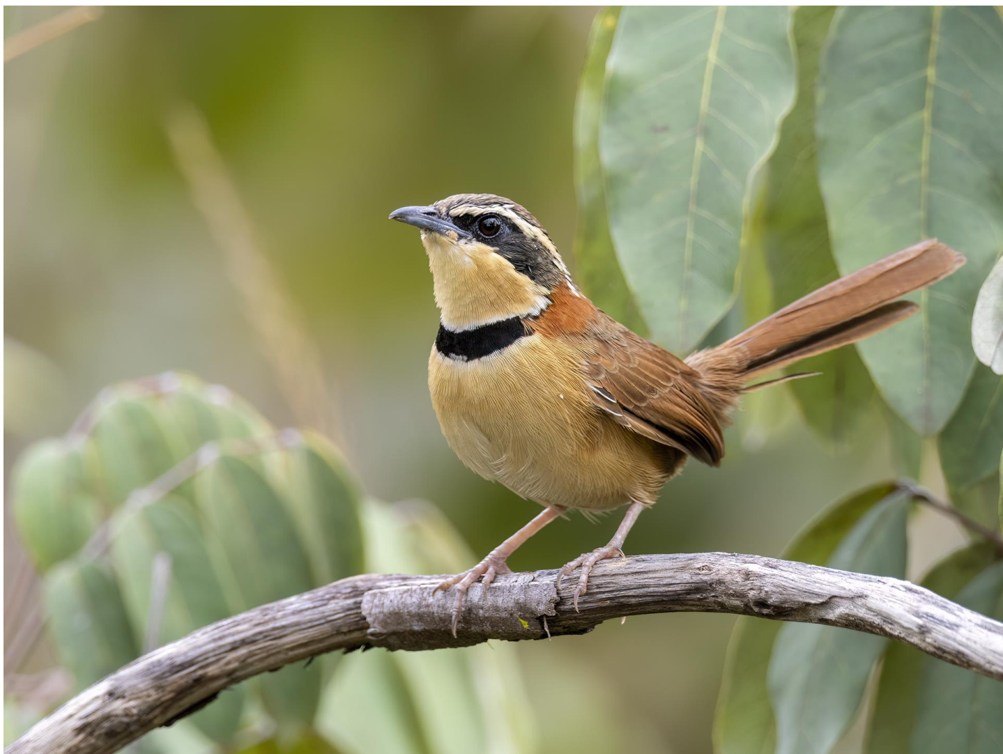
Collared Crescentchest was one of the group's favorite birds of the trip, it came early on in the tour in the Cerrado habitat ( above )

For more photos, videos and a complete description of the tour follow the link below to watch the full Video Trip Report in YouTube: Click here