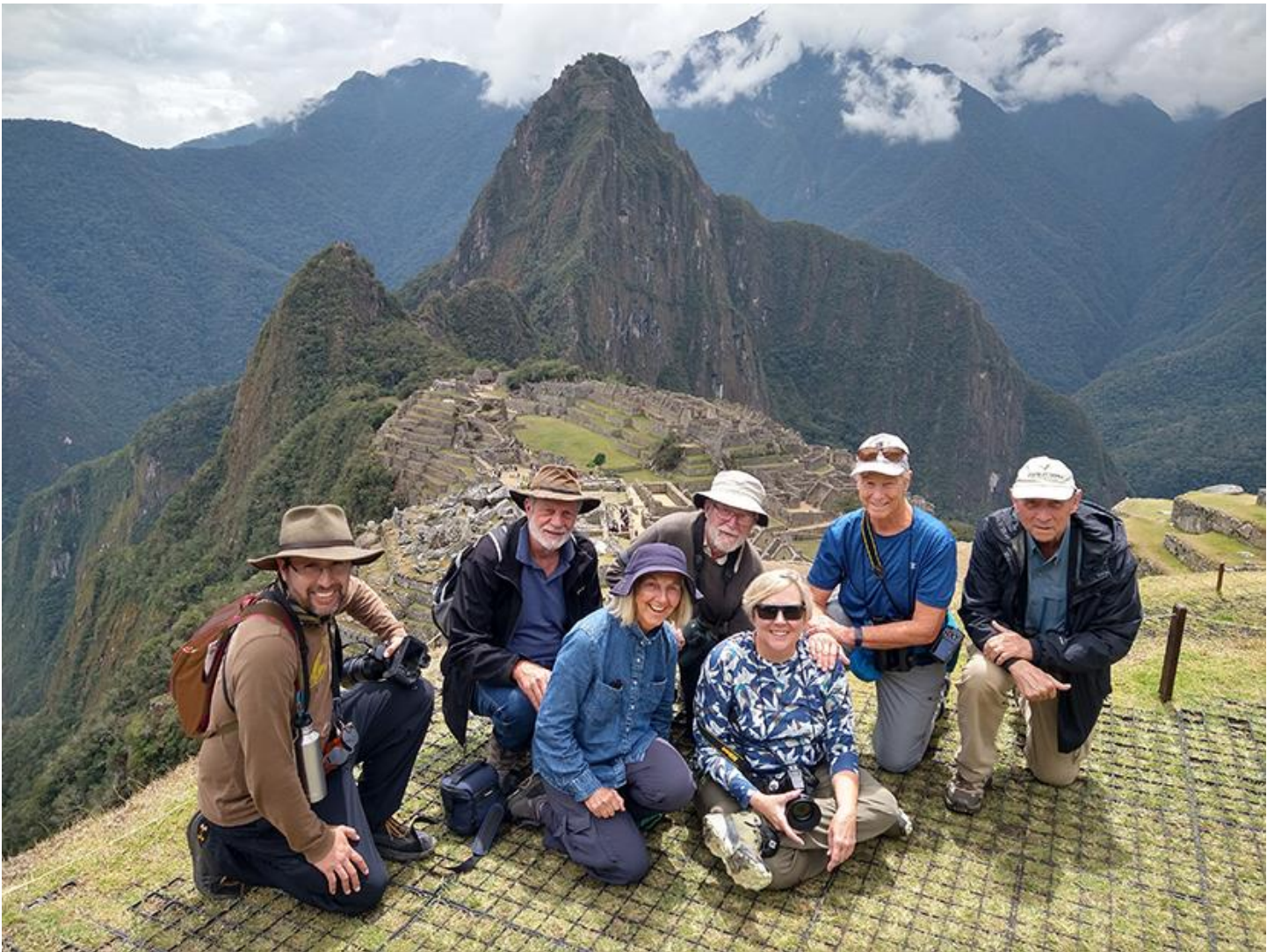
The group in Machu Picchu enjoying one of the wonders of the World (photo above).

I was very happy with the group of birders that I had the honor of guiding. It was a great combination of very experienced participants (happy at the end with 50+ lifers to add to their over 6k and 7k life lists) and some incredibly talented “new” birders that have only started birding a couple years back, plus a couple relaxed birders that were happy with not just the beautiful birds but also the not so colorful ones. Everybody got along very nicely and there was a great energy within the group.