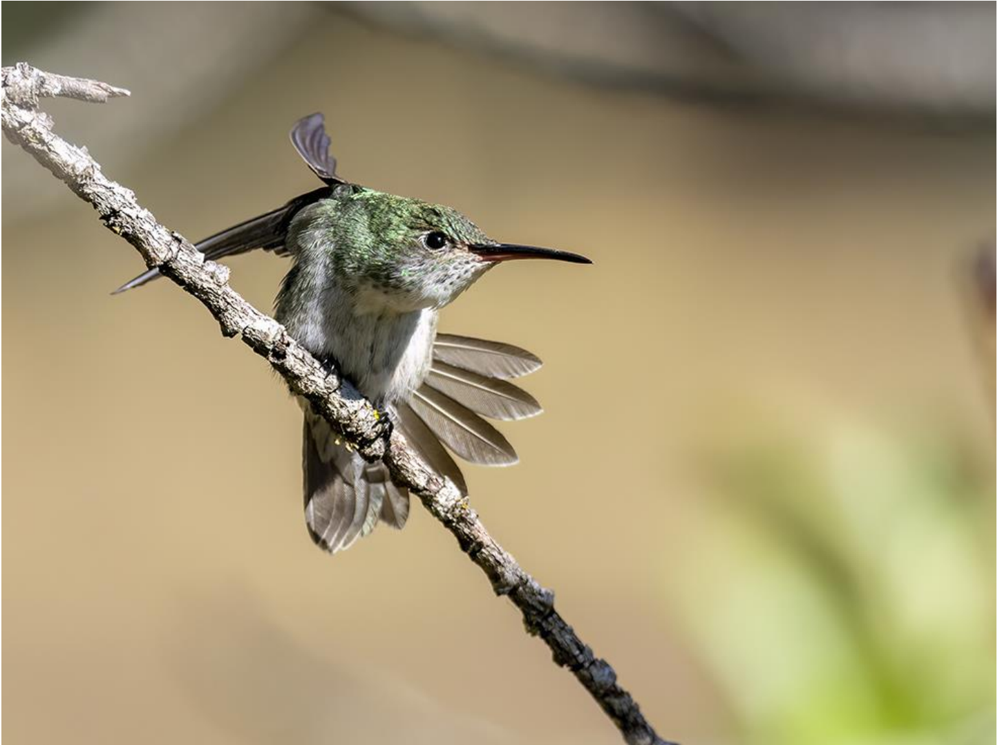
Endemic to Peru, this Green-and-white Hummingbird (photo above) was common at Sacred Garden feeders on our first birding day

The photos shown below are my personal favorite pics taken during the tour. They do not necessarily represent the rarest or the most common species; it is just my favorite selection. I will follow chronological order of the tour to have a certain correspondence with the itinerary shown above.