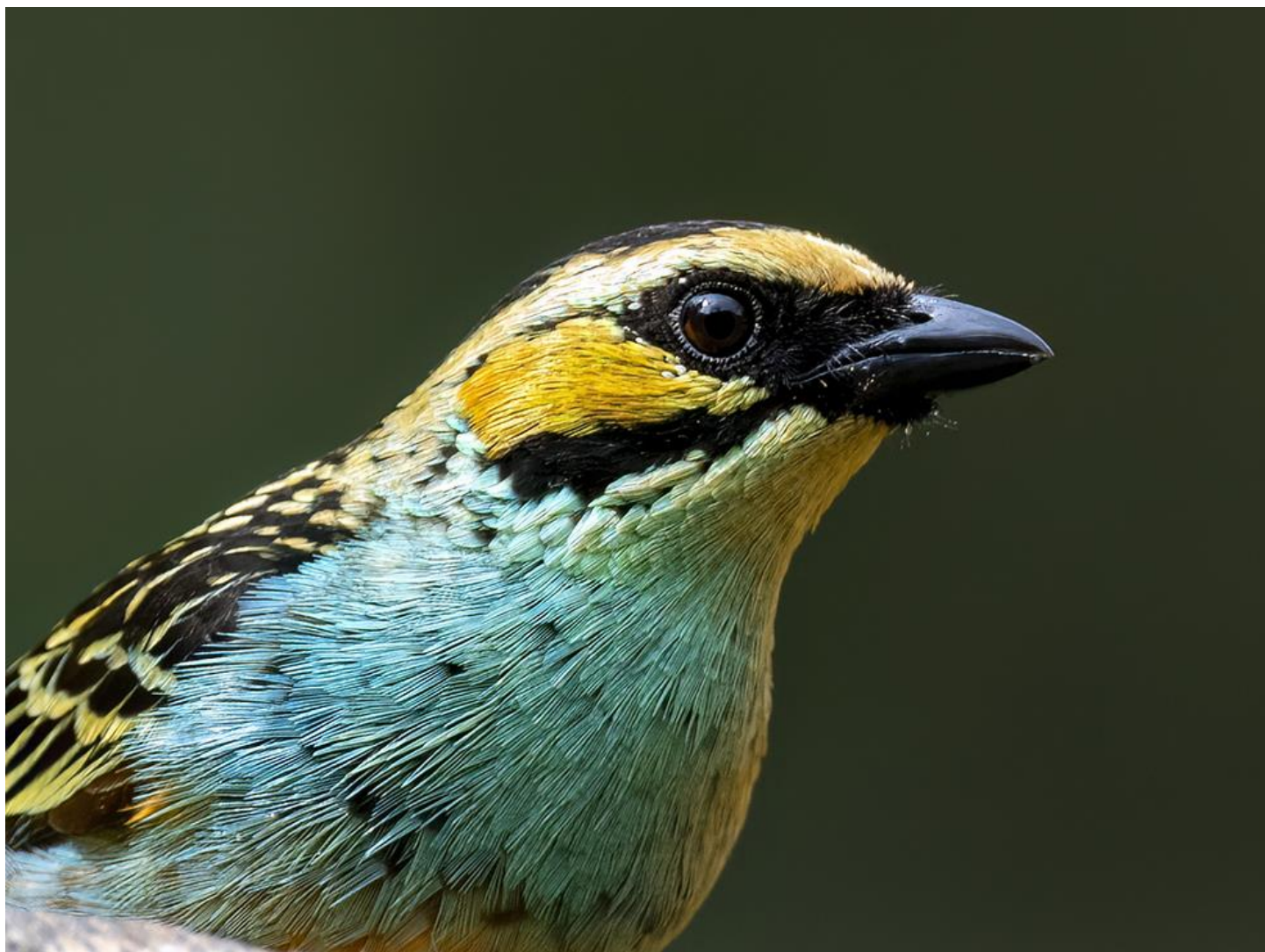
Close up views are possible from the restaurant and cabins of Cock of the Rock Lodge, thanks to the feeders. Golden-eared Tanager (above) is one of the regular visitors.