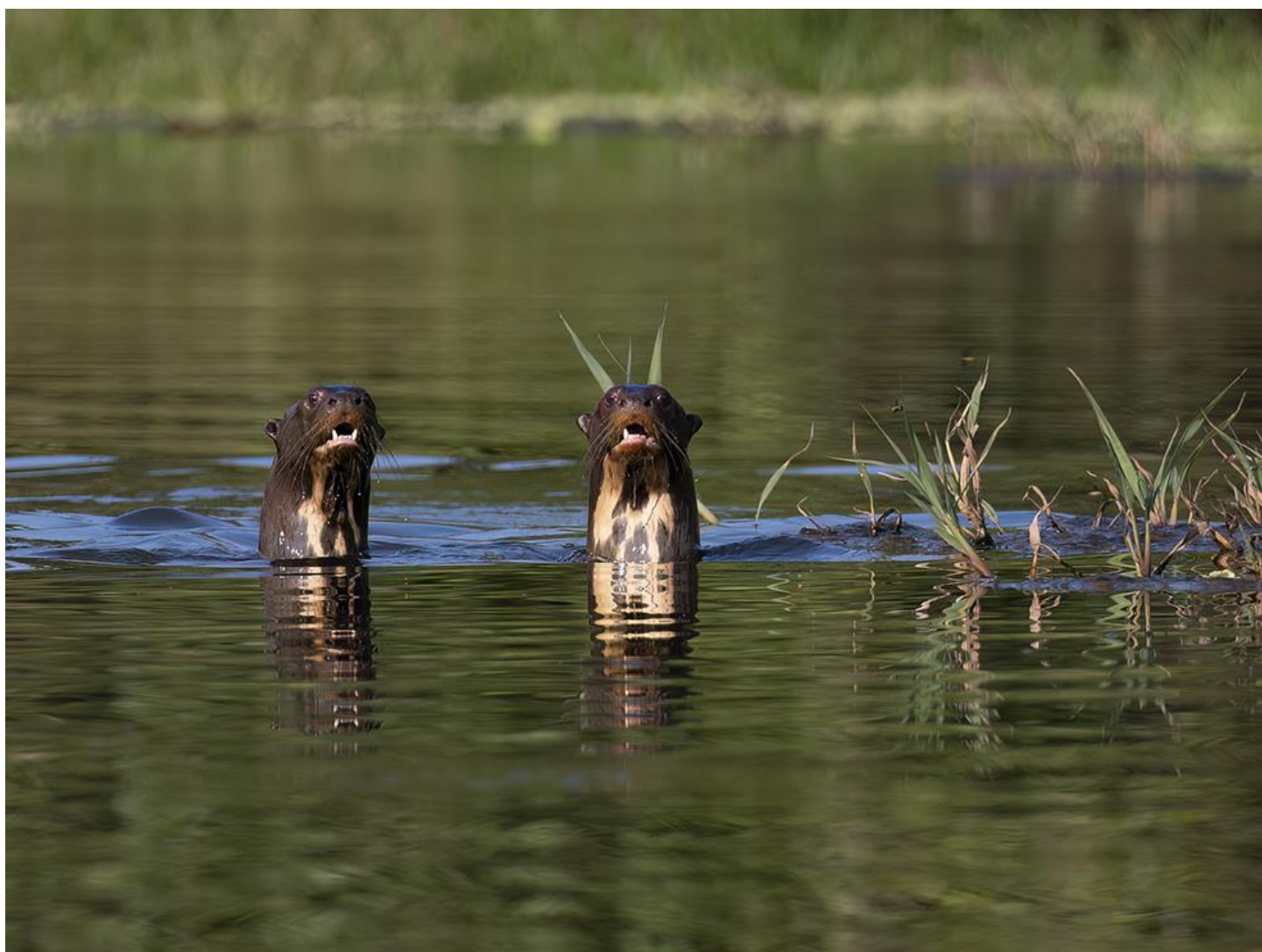
The oxbow lakes hold families of Giant Otters (above)