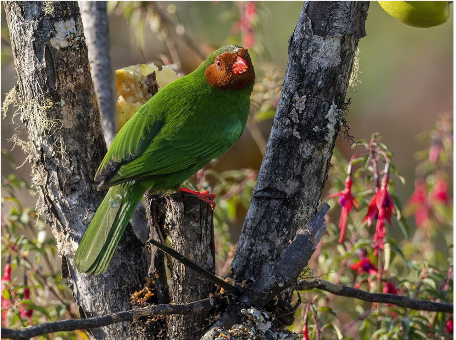
It was the first time I had ever seen a Grass-green Tanager ( above ) at feeders.