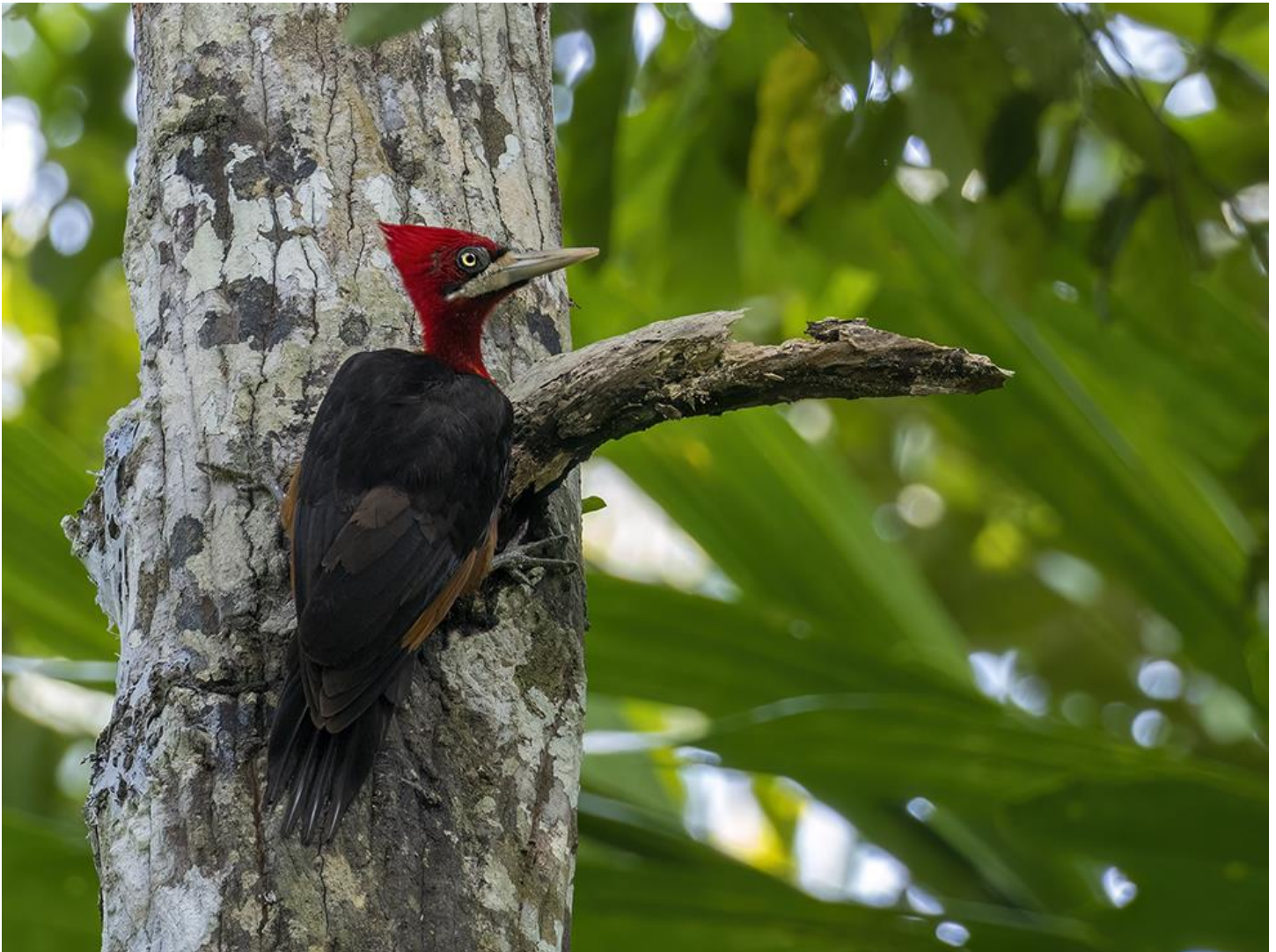
Walking trails we found a bunch of great birds including this large Red-necked Woodpecker (above).