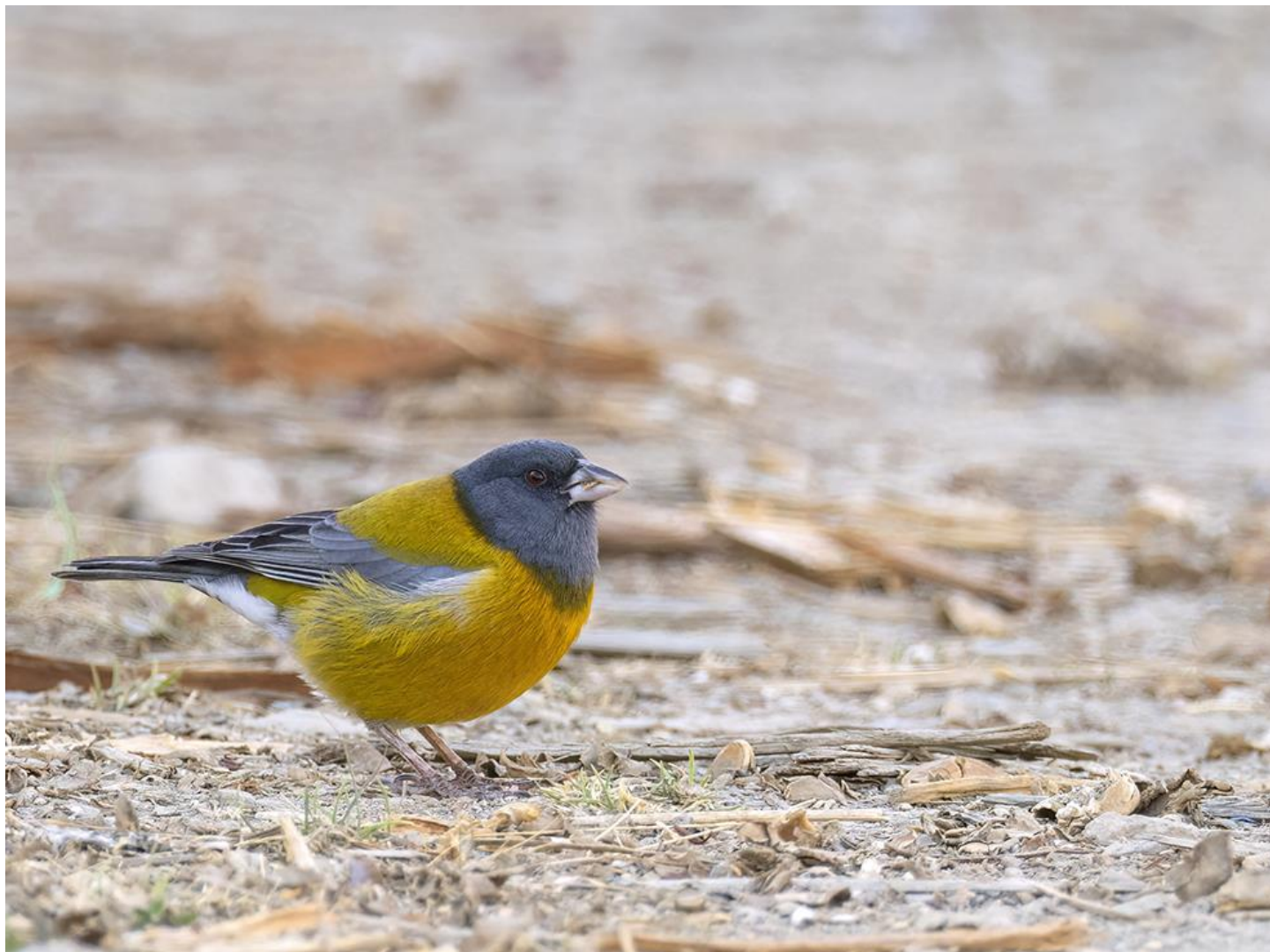
On day two we had great views of Peruvian Sierra Finch ( above ) on the way to Wayqecha Lodge.