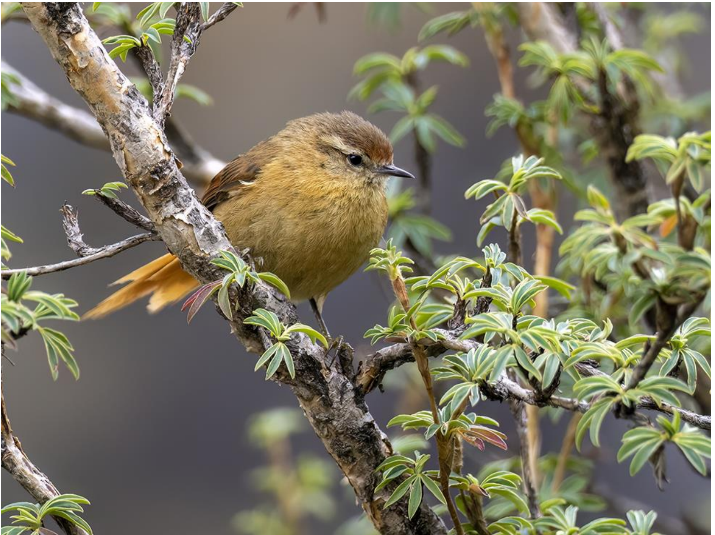
The Polylepis forest at about 14000ft of elevation provided some special birds like this Tawny Tit-Spintail (above)