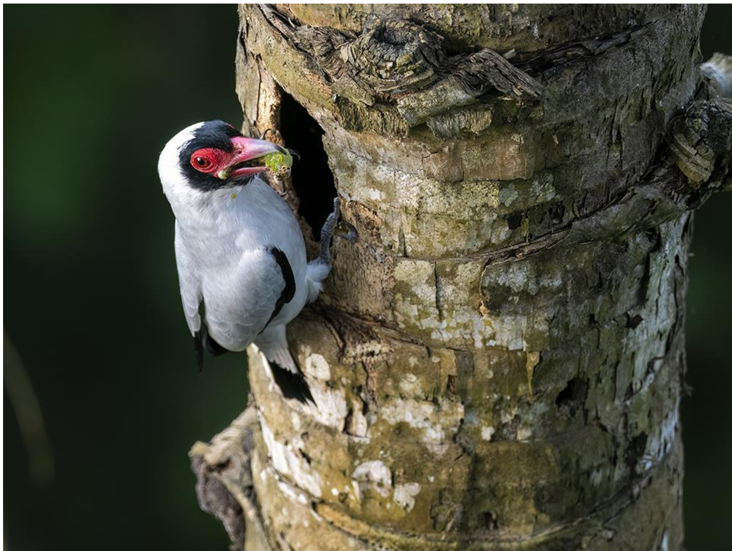
A pair of Masked Tityras (above) were nesting right next to the canopy tower at Manu Wildlife Center.