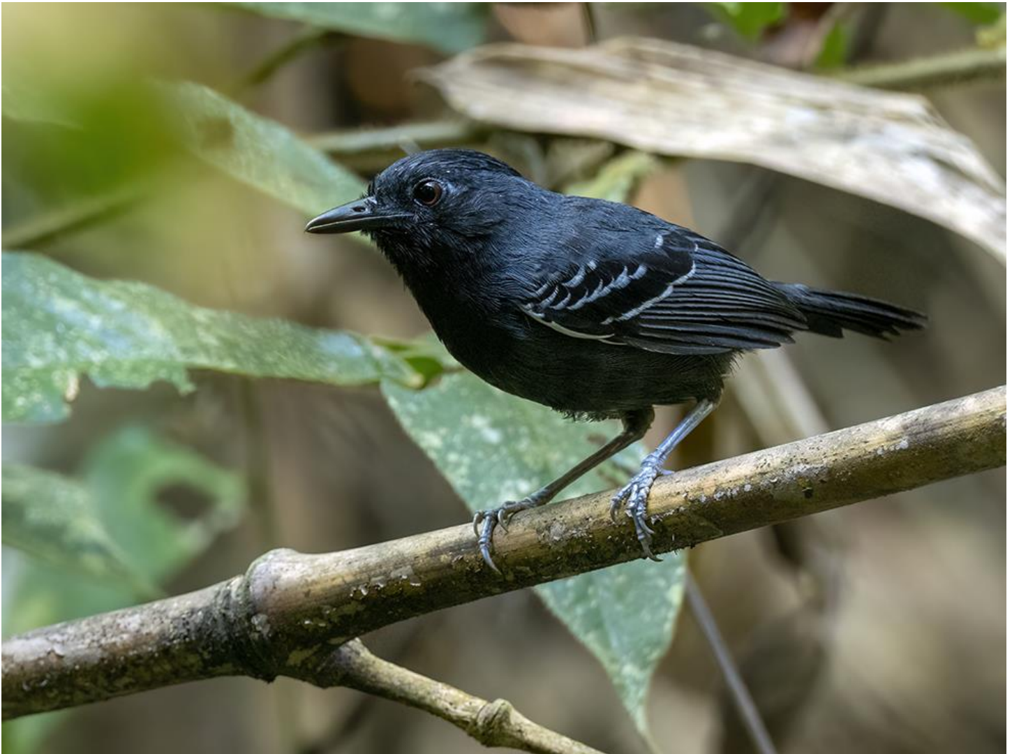
At the base of the Andes, numbers of antbirds are prolific. White-lined Antbird (above) is among the more common ones in this area.