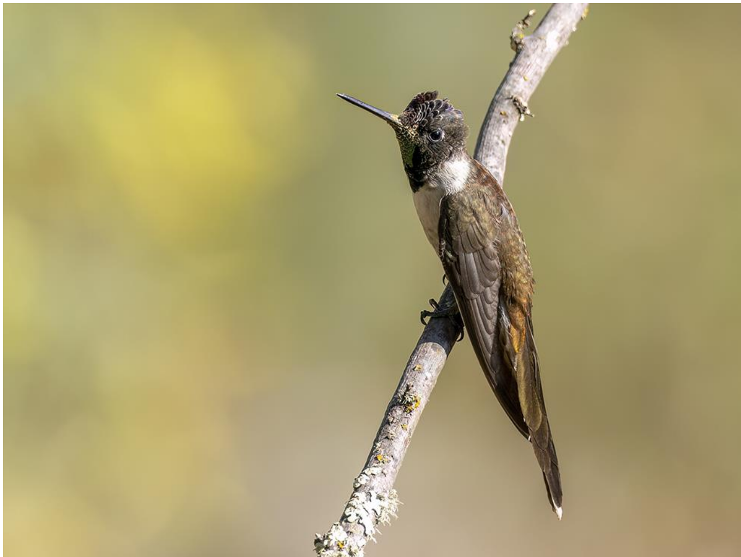
Bearded Mountaineer (above) was a big target for the first day of the tour.