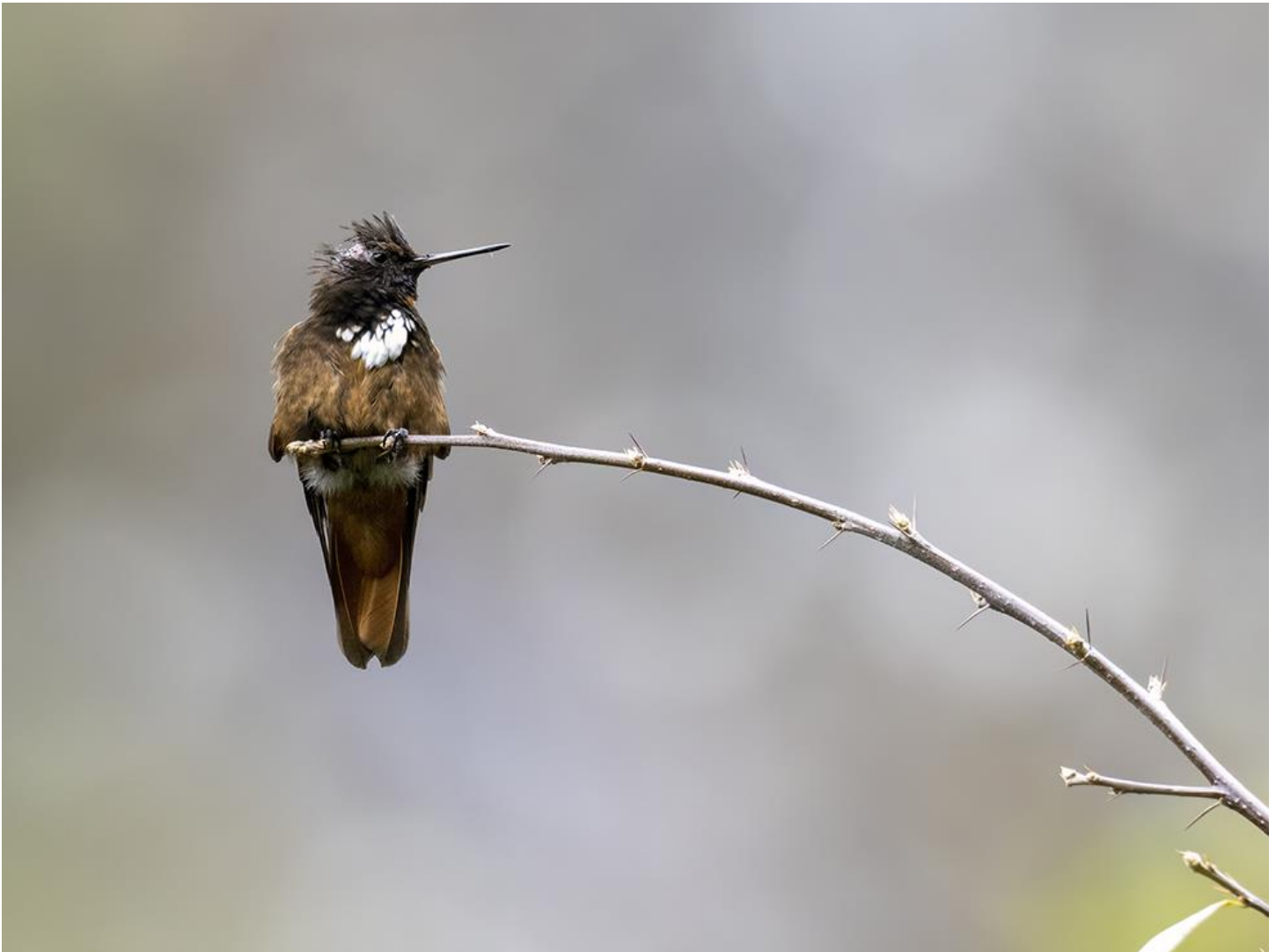
This was a last-minute bird we managed to squeeze into the list at the end of the day we visited Abra Malaga: the localized endemic White-tufted Sunbeam (photo above)

In terms of experiences, participants mentioned they loved the time in Machu Picchu, our local guide was a very nice person and a very enthusiastic leader. The boat rides along the oxbow lakes in the lowlands of the Amazon are idyllic and the birds that we found during those were superb. There was a demanding hike that we did in Abra Malaga (at about 14000ft) which is extraordinarily scenic, that proved to be a nice challenge to achieve; most participants did most of the hike and got most of the specialties of the area but surely the climb proved hard for a couple birders. The macaw clay lick was a bit slow during our visit since not many birds showed up; we did see dozens of macaws and other parrots but nature is nature and it was a little quiet this time. We were greatly surprised with the new sets of feeders at small reserves that local people have started to open along the Manu Road; there were tons of species we saw at the feeders that we did not find elsewhere.