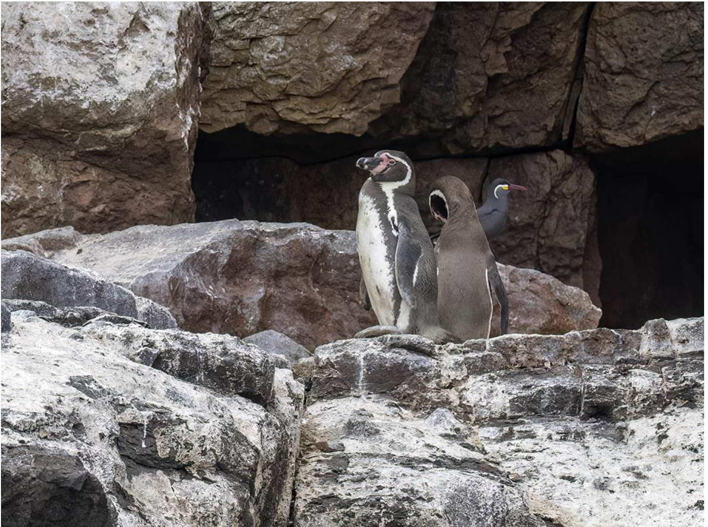
We had to do two loops around the Pucusana Islet in order to get good views of the sought after Humboldt Penguins (above). This short time in the coast is well worth it and contrastingly different from the rest of the tour.