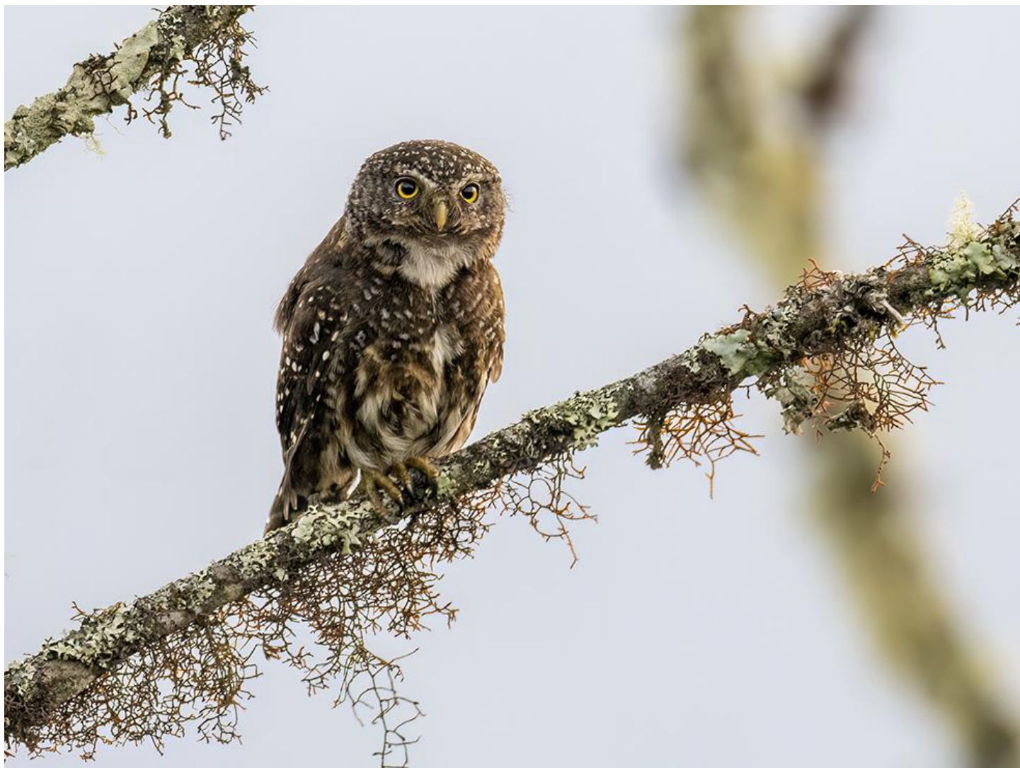
Yungas Pygmy-Owl (above) was the very first bird we saw on day three.