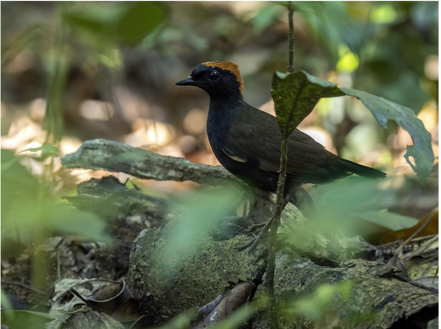
These are the kind of photos I really enjoy getting: hard to photograph birds that hide in the forest interior. It can be very frustrating but also very rewarding. This is a Rufous-capped Antthrush (above) and I really like the natural background.