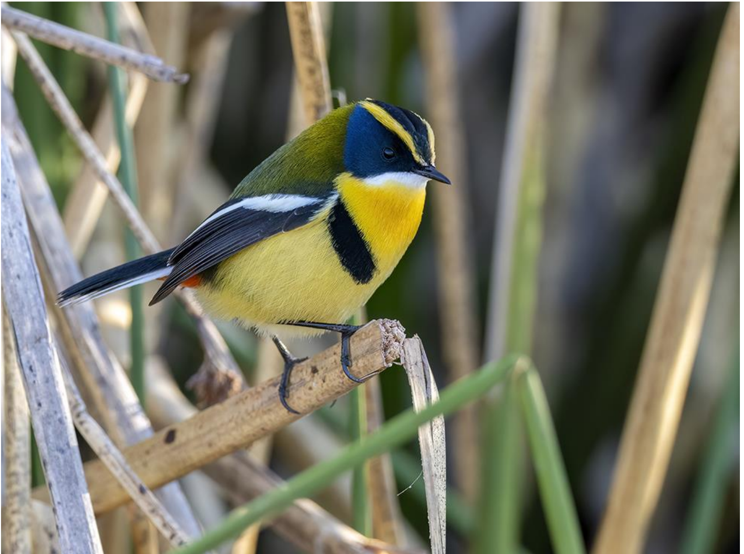
After ascending back up the high Andes, we visited Piuray Lake where the shore-side reeds hold Many-colored Rush-Tyrants (above).