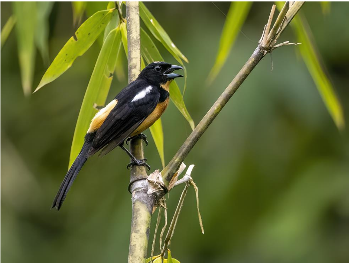
I am particularly happy with the photo I managed of this Yellow-crested Tanager (above) which is featured on the species account on eBird and soon also Merlin.