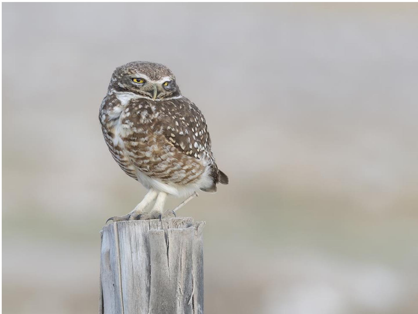
Common, widespread, never boring, Burrowing Owl (above)