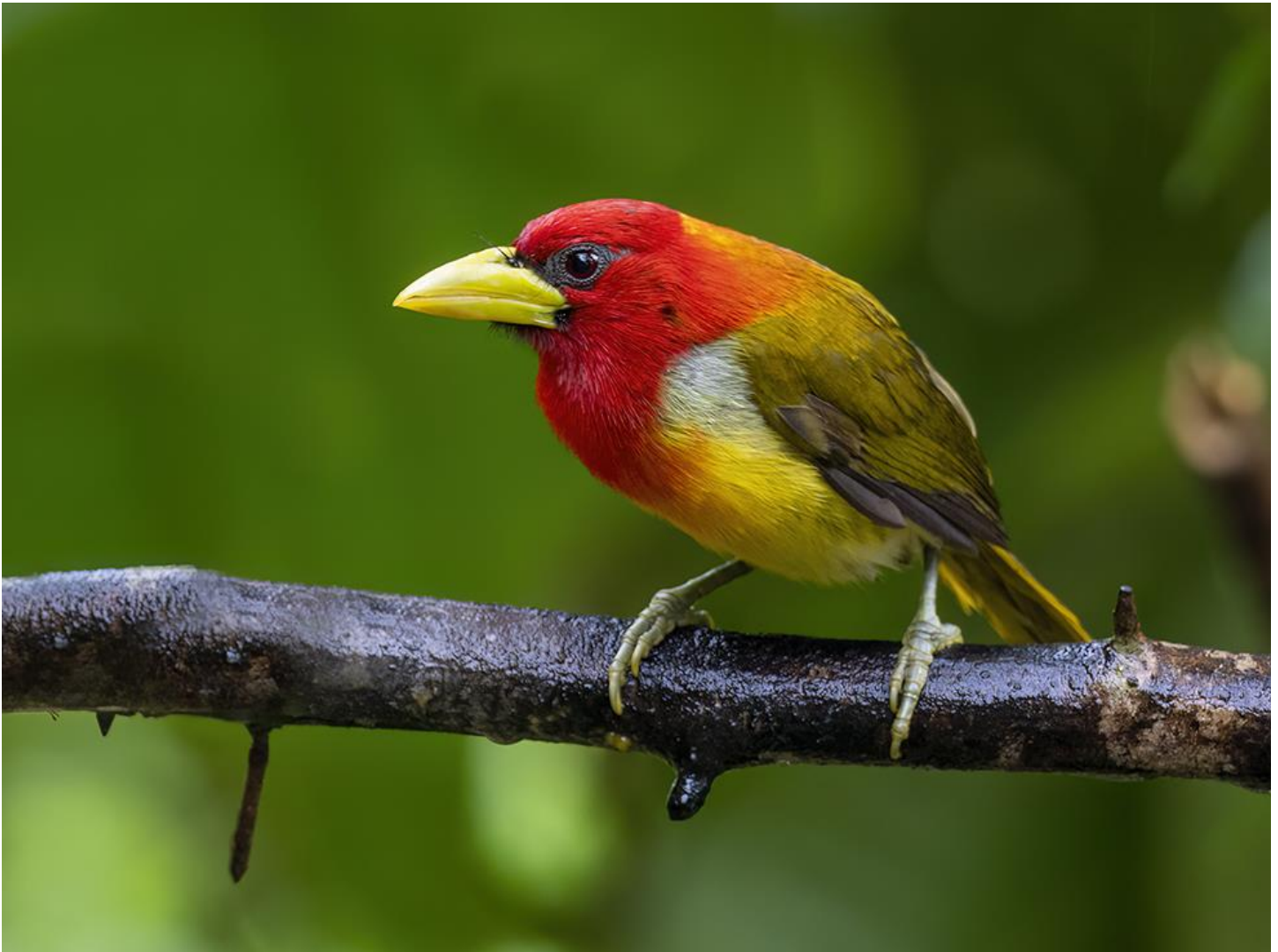
Scarlet-hooded Barbet ( above ) is a hard bird to get in this tour, or it used to be I should say; now it visits often Pico de Hoz feeders.