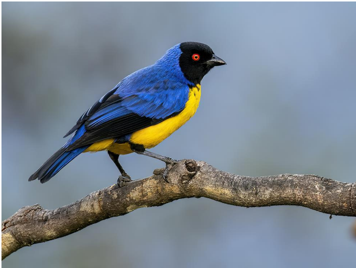
Within the last half hour of light we got the hulking Hooded Mountain Tanager ( above ) coming to feeders at Wayqecha Lodge.