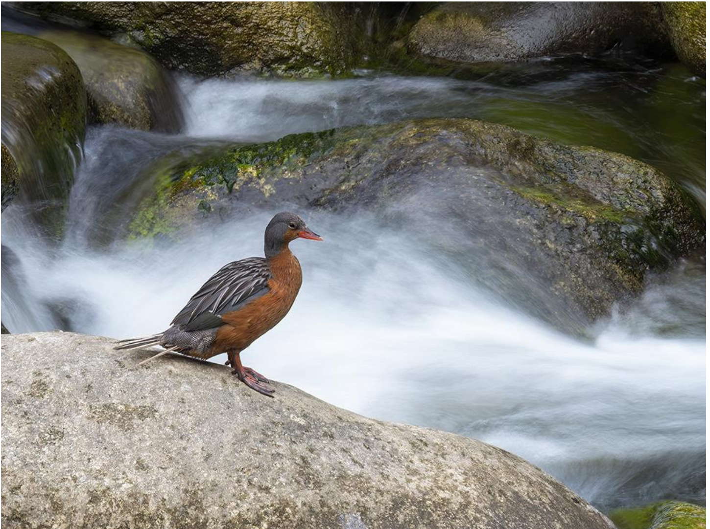
The female Torrent Duck (above) seemed uninterested in the males since she was taking care of a youngster.