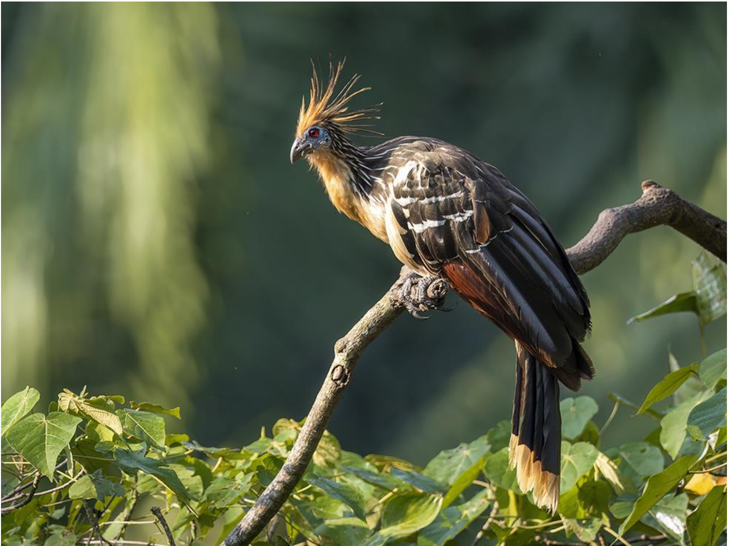
One of the most iconic lowland Amazon species, Hoatzin (above).