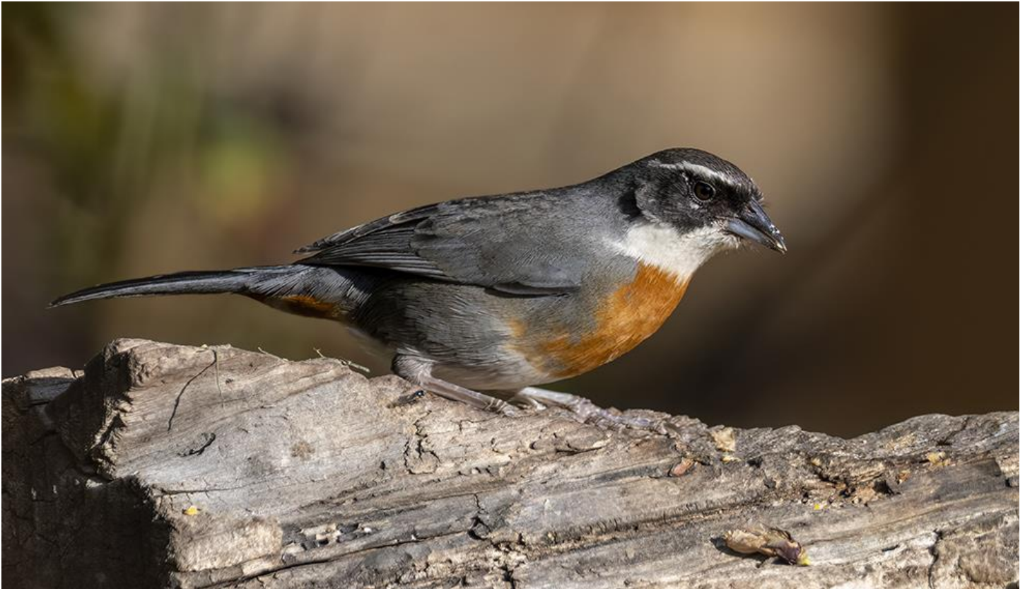
Feeders provided much more than only common colorful species, there were also localized endemics there like this Chestnut-breasted Mountain Finch (photo above)