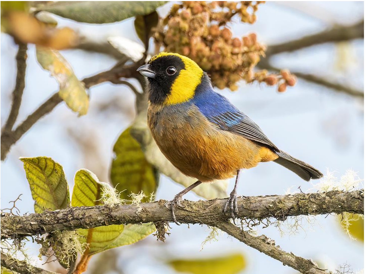
Before reaching Wayqecha we got a flock with this beauty, Golden-collared Tanager (above).