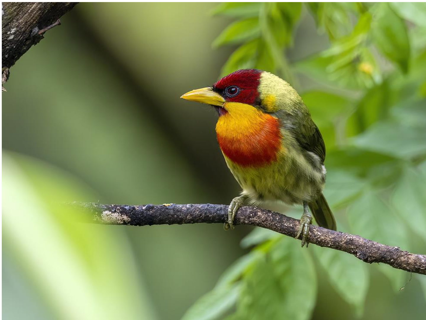
Just down the road from Pico de Hoz there is another set of feeders, Inkamazonia, where another great barbet shows up, the amazing Lemon-throated Barbet (above).