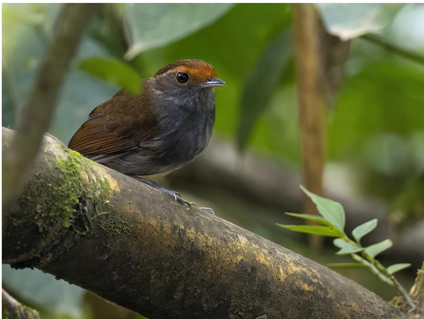
I am really happy to get shots of skulking and hard to photograph birds. This was the case for the obscure Slaty Gnateater (above)