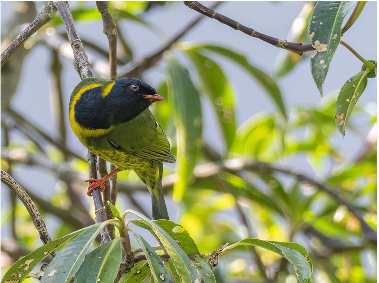
Band-tailed Fruiteater (above) was also found in the upper Manu Road.