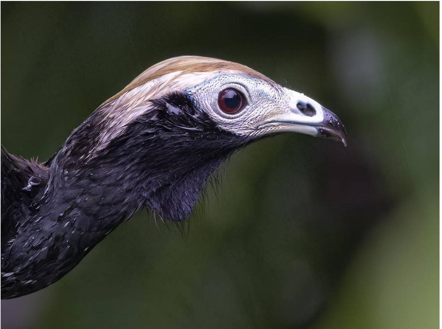
Even large species like Blue-throated Piping-Guan ( above ) visit feeders near Pillcopata.