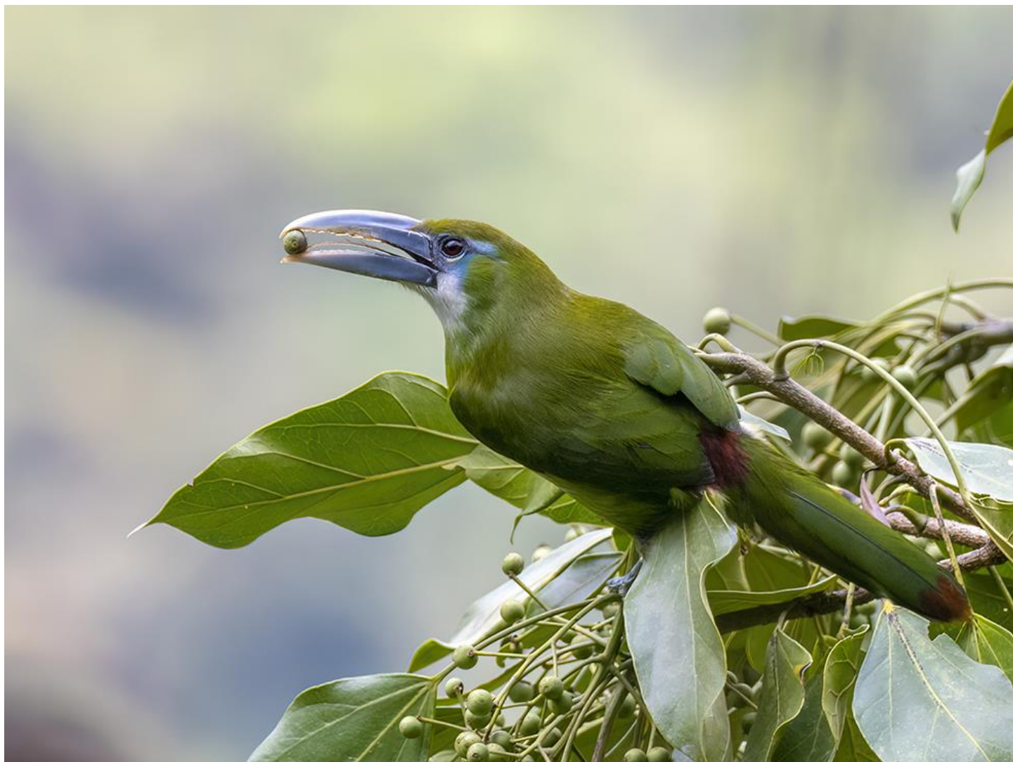
Blue-banded Toucanet (above) was the main attraction on Manu Magic Feeders.