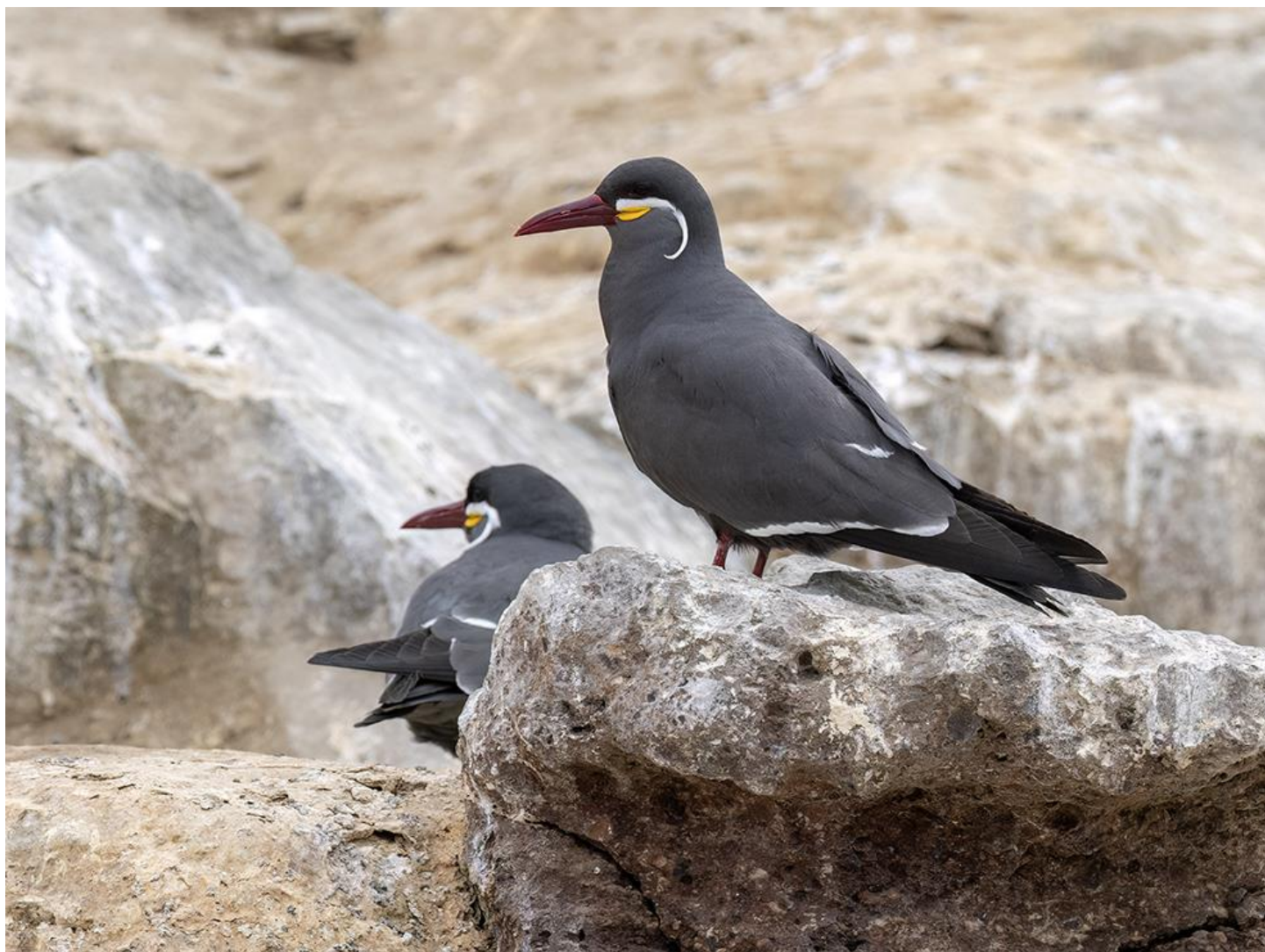
At the end of the tour, and just for a few hours, we visited the coast south of Lima where a completely new set of birds gave the list a boost, like the gorgeous Inca Tern (above).