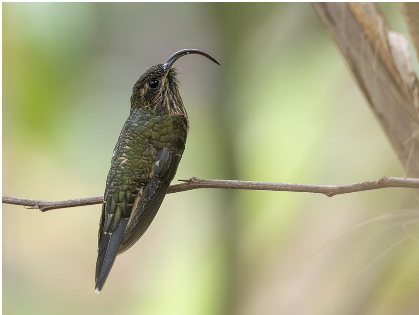
The true star of Inkamazonia is the quirky Buff-tailed Sicklebill (above)