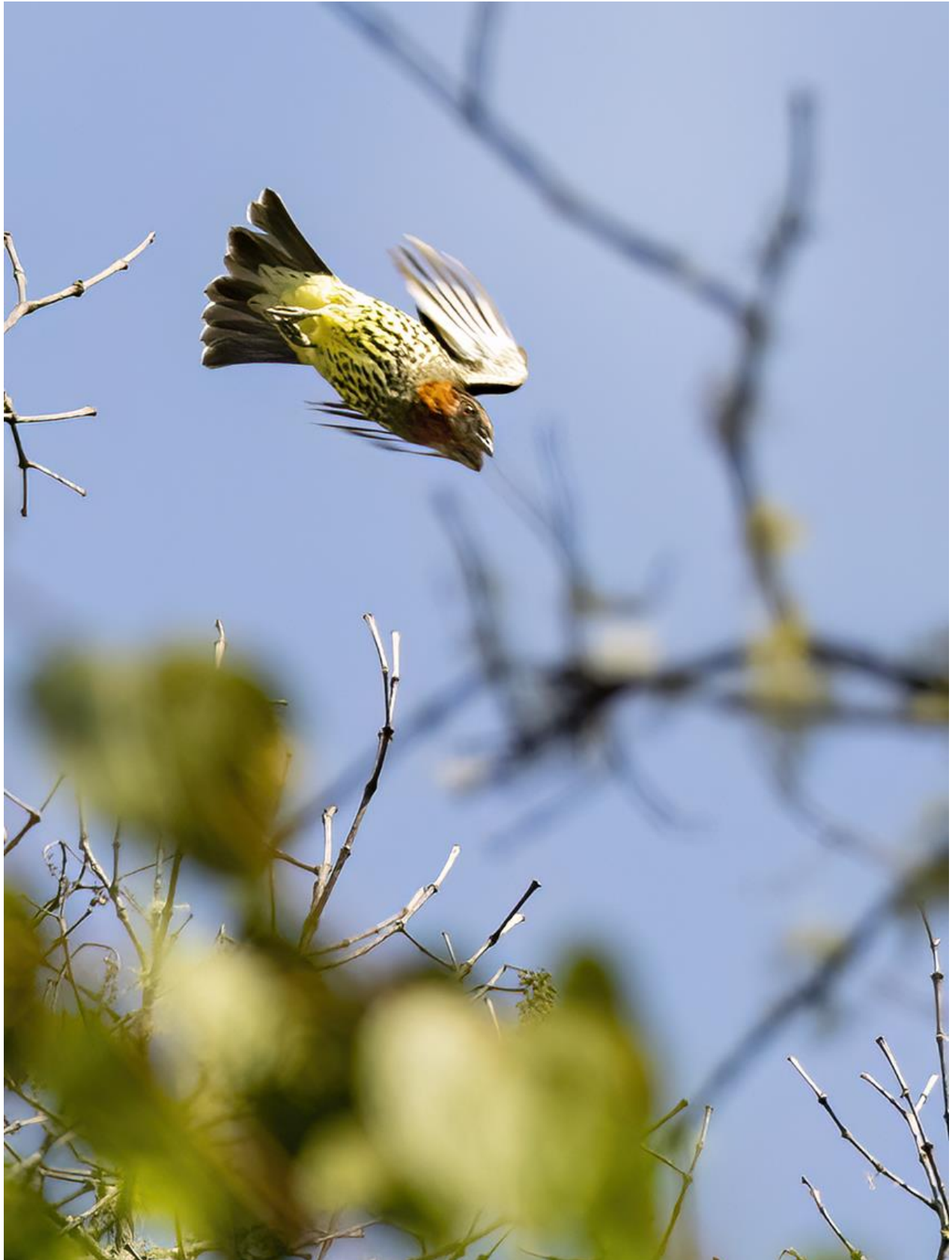
The upper Manu Road gave us the rare Chestnut-crested Cotinga (above).