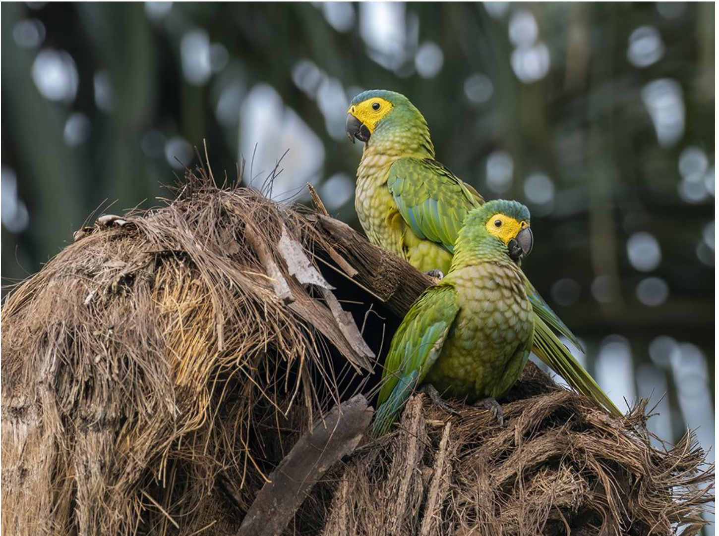
Close to sunset we visited a roadside palm grove where Red-bellied Macaws ( above ) come to roost.