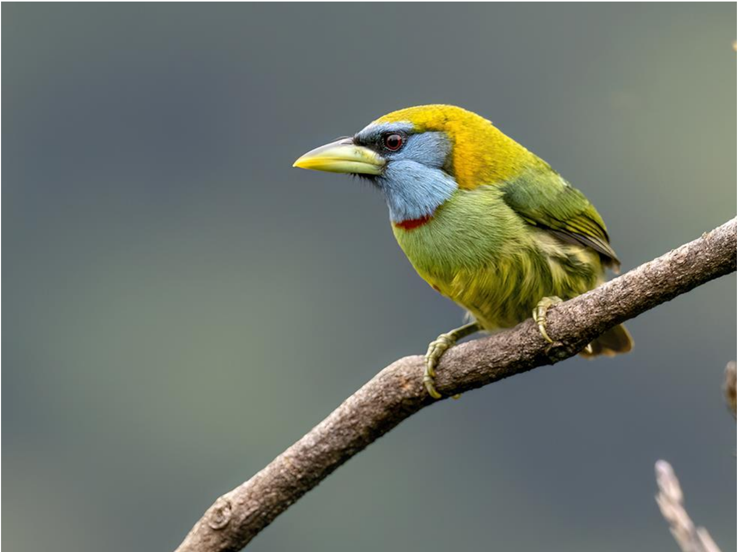
Another of the visitors to Mirador la Union Feeders was the gorgeous Versicolored Barbet (above)