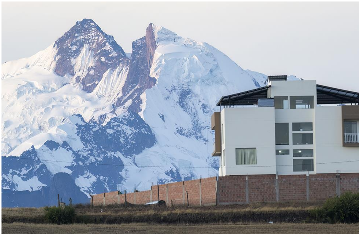
Mt. Sahuasiray (above) is the backdrop of our birding scene around Piuray Lake. The amazing Machu Picchu (below) is an absolute must visit location on Earth. We got lucky with the weather since I had rained the previous day and it was foggy the next one