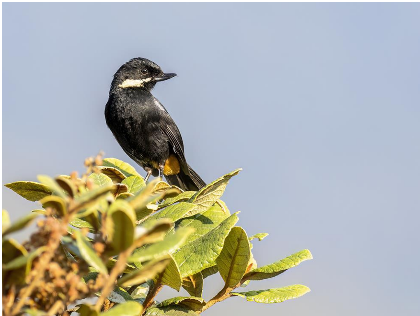
Moustached Flowerpiercer (above) is arguably the nicest looking member of the genus.