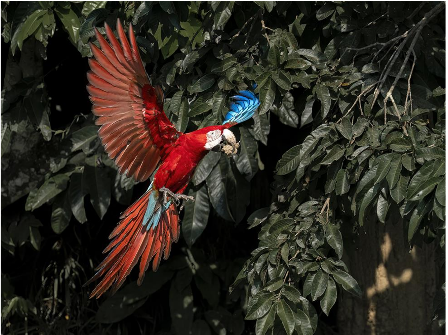
The famous Blanquillo Clay Lick was a bit slow during our visit but nevertheless we got amazing views and photo opportunities of Red-and-green Macaws (above) eating clay out of the extensive wall.