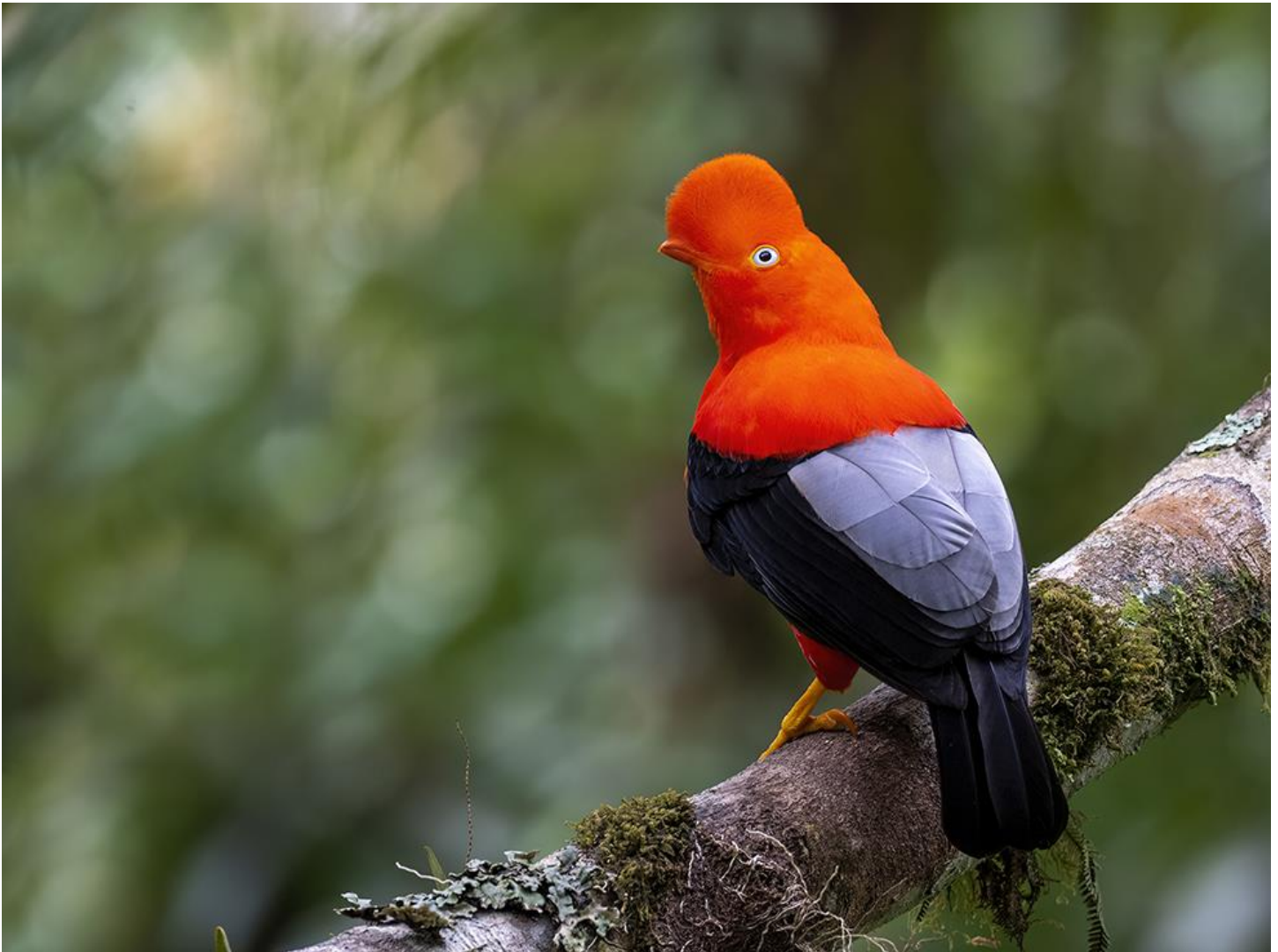
We started our birding on the first morning at Cock of the Rock Lodge with the namesake iconic bird, Andean Cock-of-the-Rock (above)