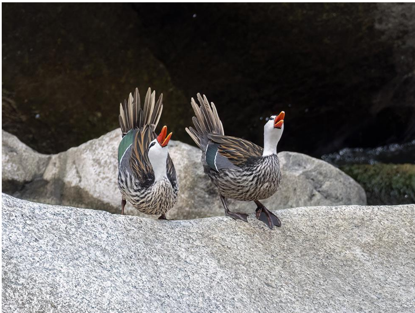
We had a memorable experience witnessing Torrent Ducks ( above ) doing a prolonged display along the Urubamba River just below Machu Picchu on our way back to Aguas Calientes.