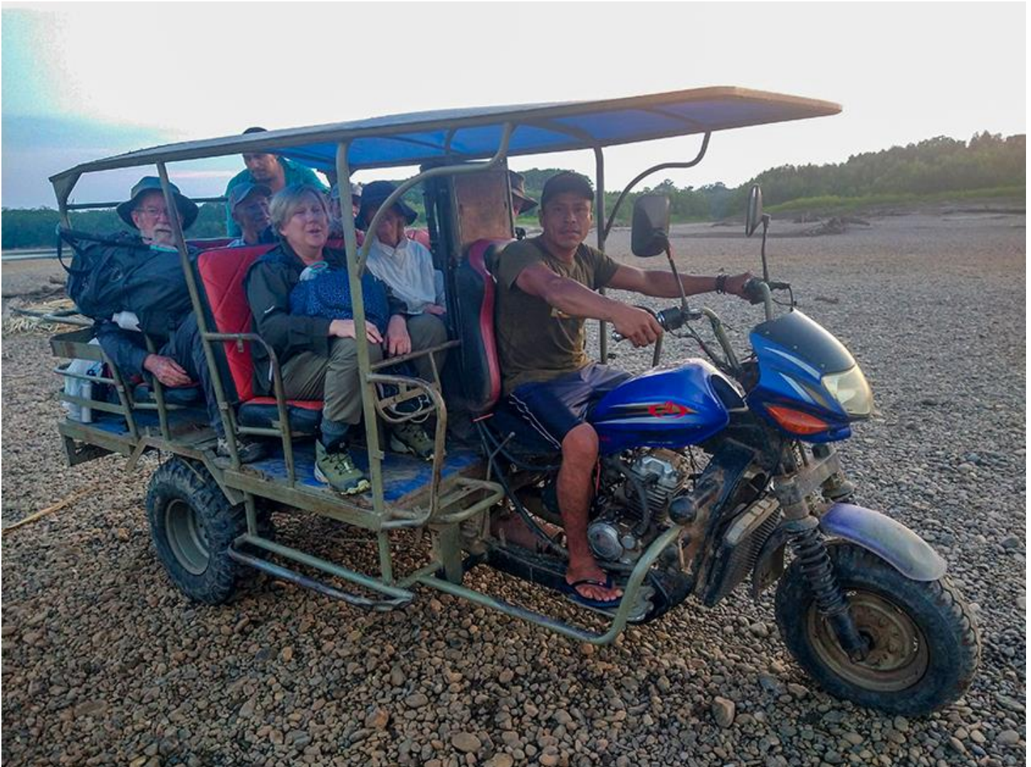
This was our transportation in and out of Tambo Blanquillo Lodge (photo above) in the Amazon lowlands