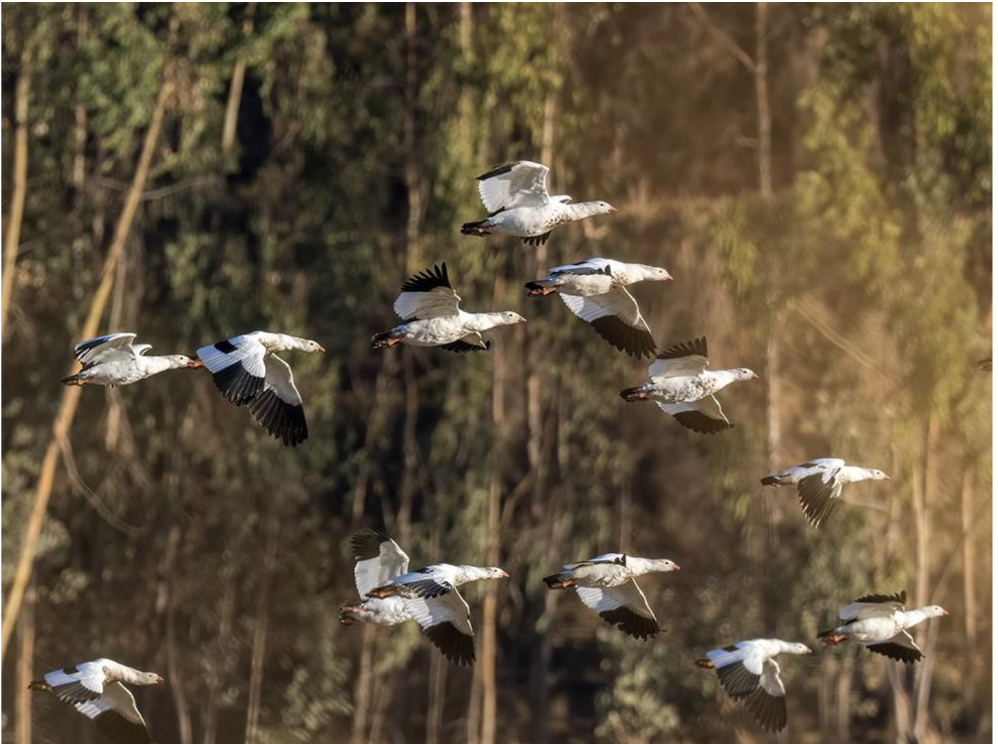
Andean Geese (above) flying in a flock with late afternoon warm light was a very memorable moment.