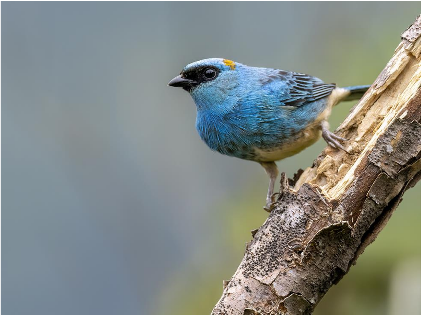
Another set of feeders just above Cock of the Rock Lodge provided a ton of good birds like this Golden-naped Tanager (above)