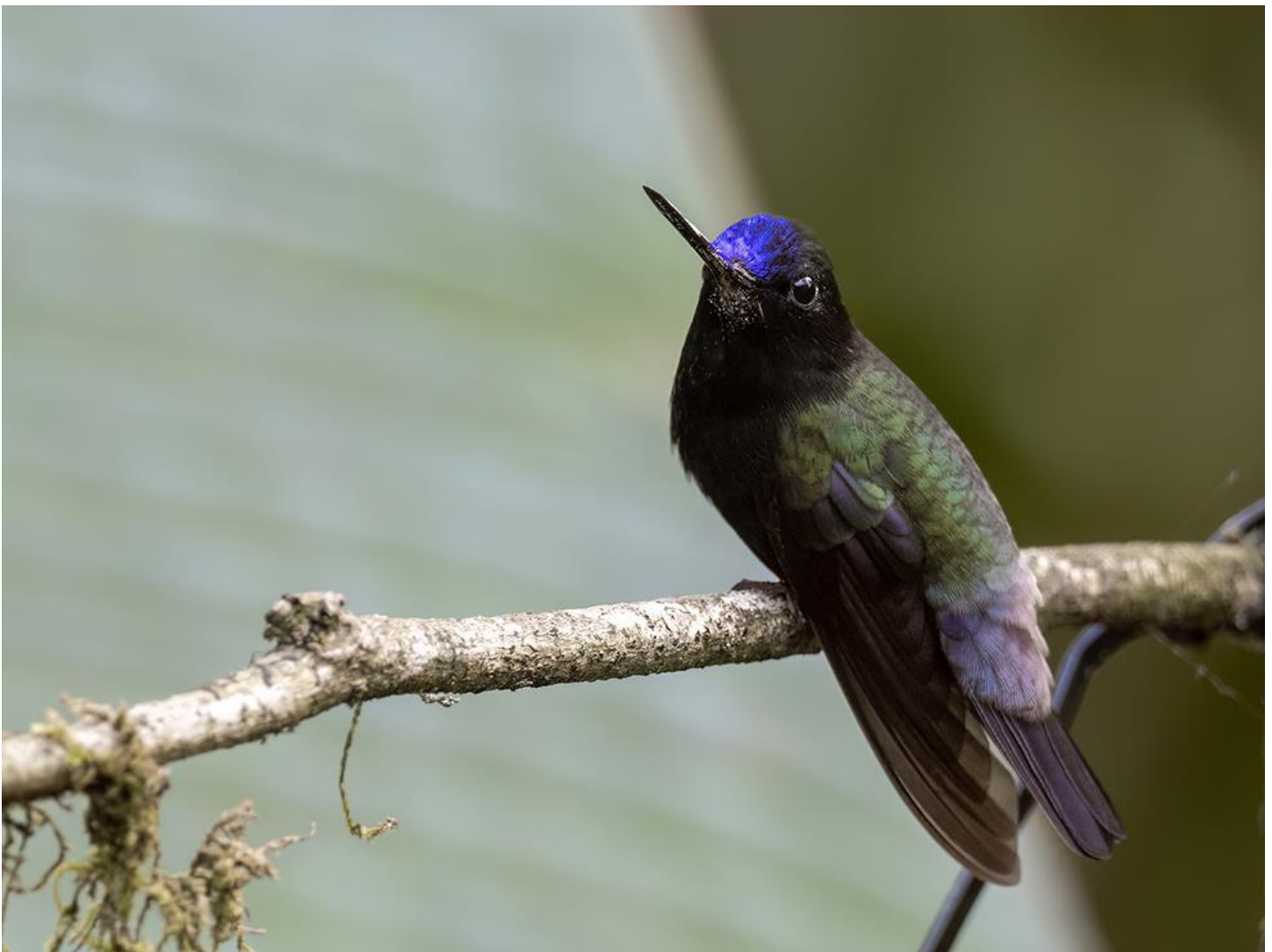
Blue-fronted Lancebill (above) is typically hard to get but close to dusk a couple individuals visited Inkamazonia feeders.