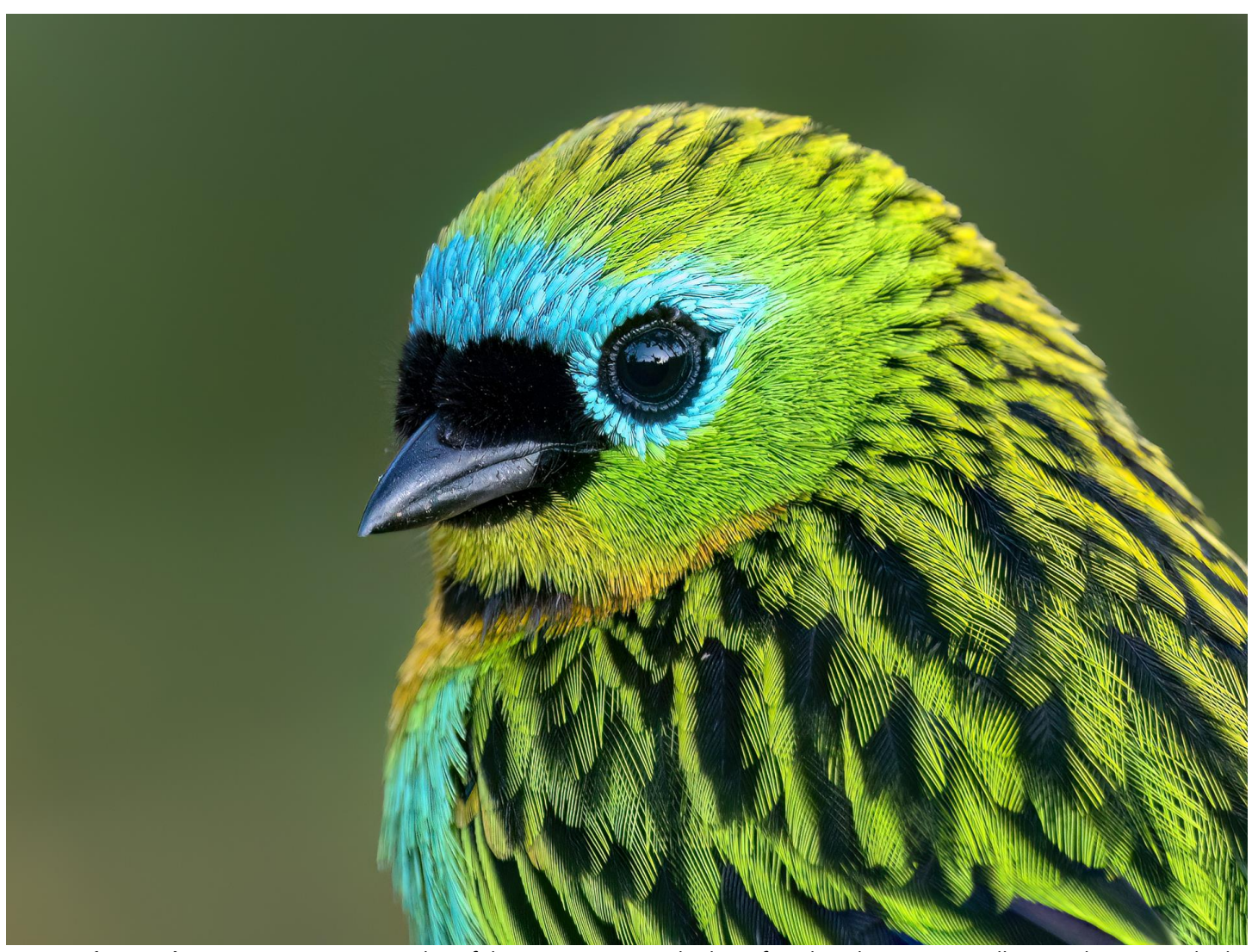
Brassy-breasted Tanager (above) was another of the very cooperative birds we found on this trip. Normally it is only a canopy bird and on this itinerary there are no feeders that attract this species. We got lucky with a flock that flew right by us at a view point in Itatiaia NP in the afternoon we arrived there.