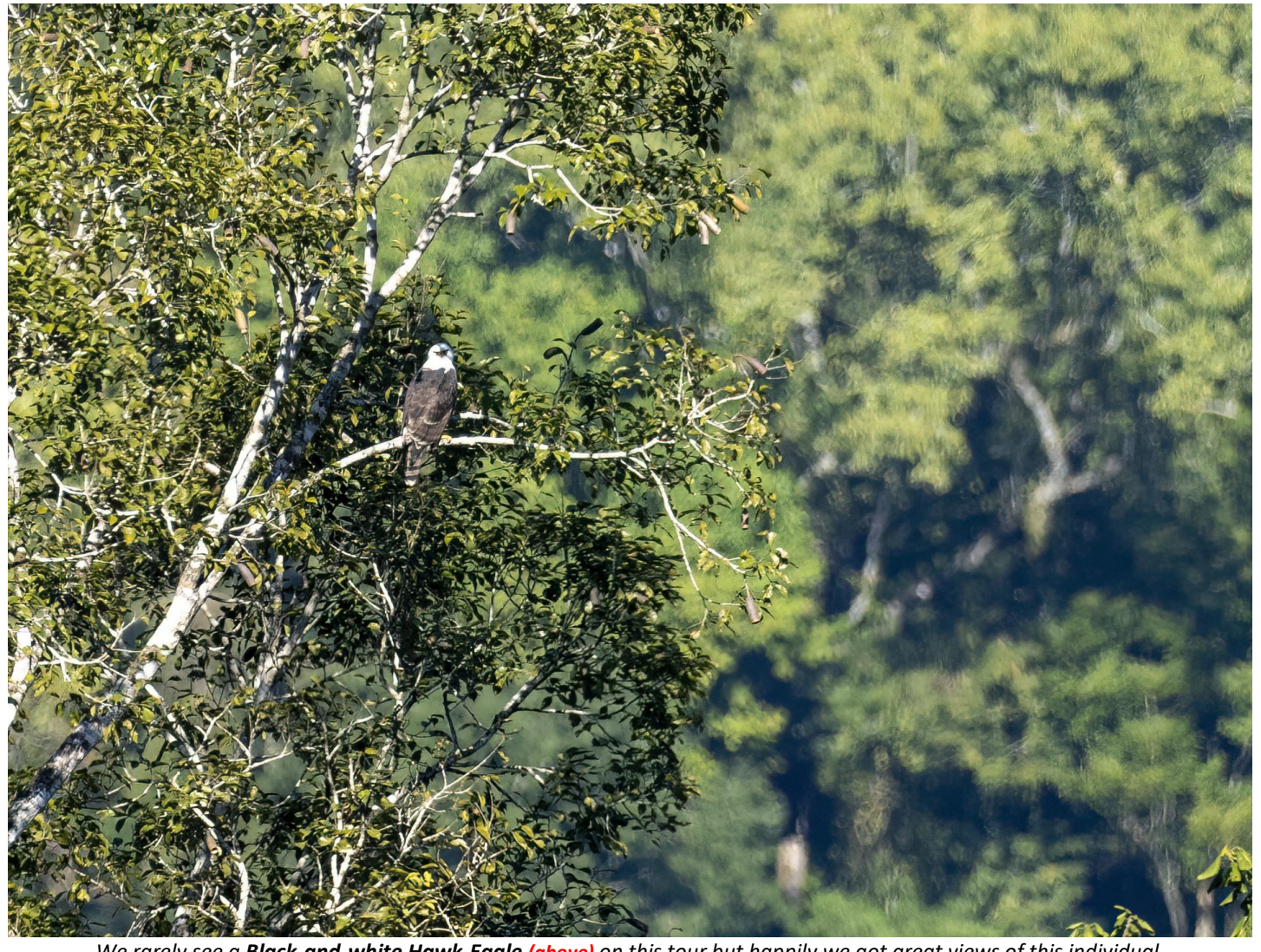
We rarely see a Black-and-white Hawk-Eagle (above) on this tour but happily we got great views of this individual.