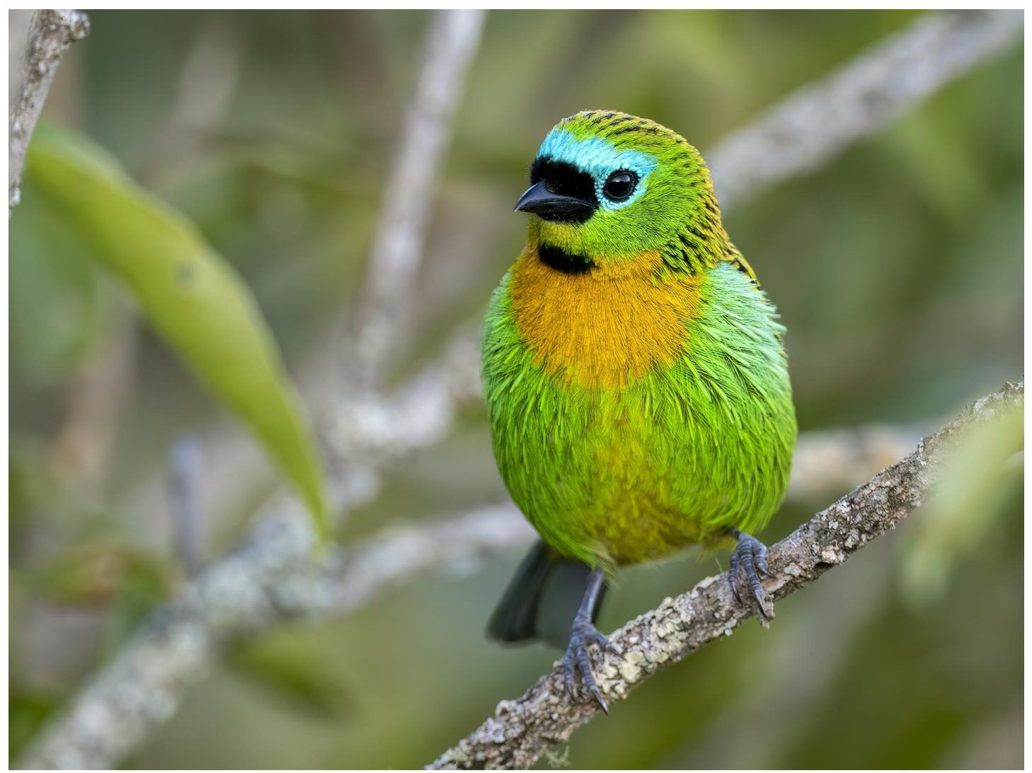
As an amazing bonus, most of these endemic birds are gorgeous as it is the case of this Brassy-breasted Tanager (photo above), which was considered one of the favorite birds of the tour. Other big highlights included Frilled and Festive Coquettes, Green-crowned Plovercrest, Swallow-tailed and Pin-tailed Manakins, Black-cheeked and Rufous Gnateaters, Red-necked Tanager, Black-and-white Hawk-Eagle , a ton of antbirds , and lots more.

The humid forests of Southeast Brazil are home to an array of gaudy birds out of which a relatively large percentage are endemic to these areas. Being in a way an isolated ecosystem nested between the Atlantic Ocean and the large Cerrado in the interior of the country, the narrow strip of forest and mountains that run parallel to the shoreline create the perfect conditions for high diversity and endemism. This trip offers a great opportunity for birders looking for a short tour to see a vast number of the special birds found exclusively here. We racked up 54 Brazilian endemic species (plus various other near endemics) in the seven birding days of this tour.