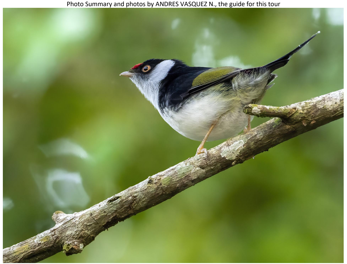
Probably my favorite photo from this tour was this one of the minuscule but incredible Pin-tailed Manakin (photo above)

Click here to view the report on YouTube