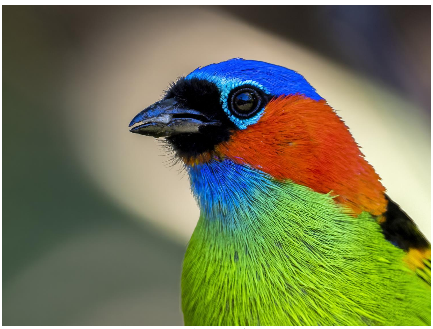
Red-necked Tanagers (above) are for sure some of the most colorful birds on Earth.