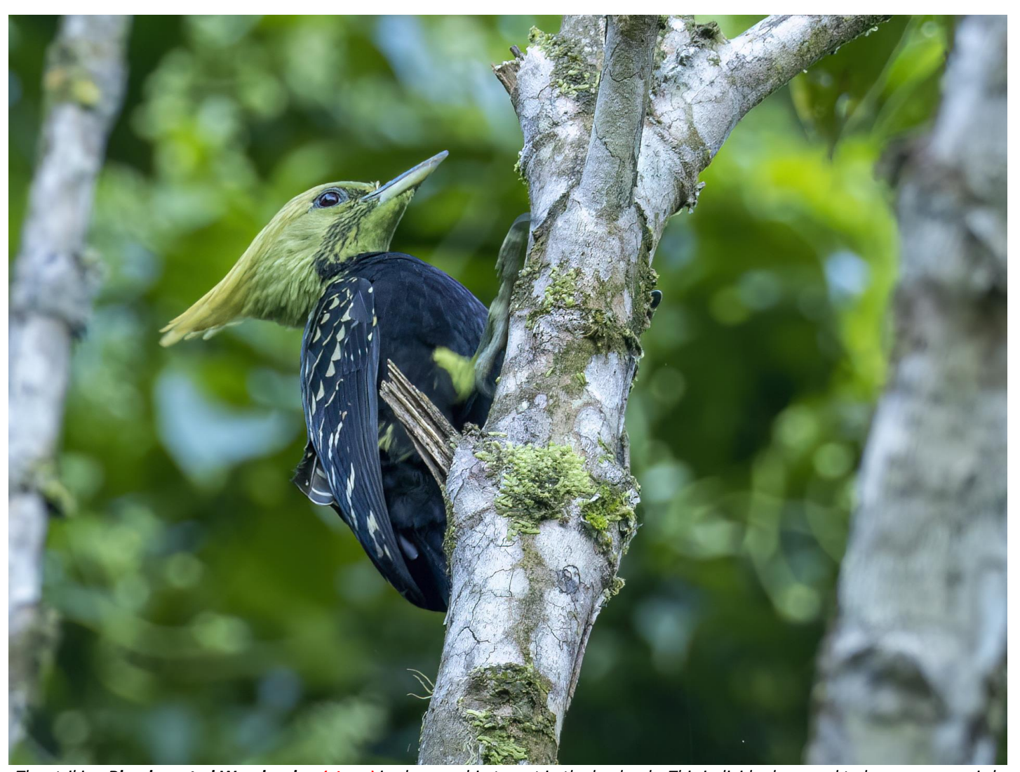
The striking Blond-crested Woodpecker (above) is always a big target in the lowlands. This individual seemed to have a very weird tone of yellow on its head, a bit greenish, a bit envious.