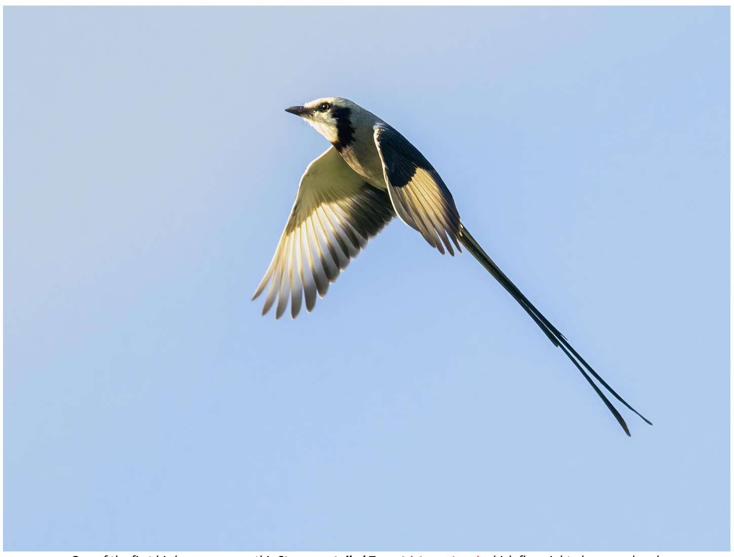
One of the first birds we saw was this Streamer-tailed Tyrant (photo above) which flew right above our heads

FAVORITE PHOTOS OF THE TRIP: The following are my favorite pics taken during the tour. They do not necessarily represent the rarest or the most common species; it is just my favorite selection.