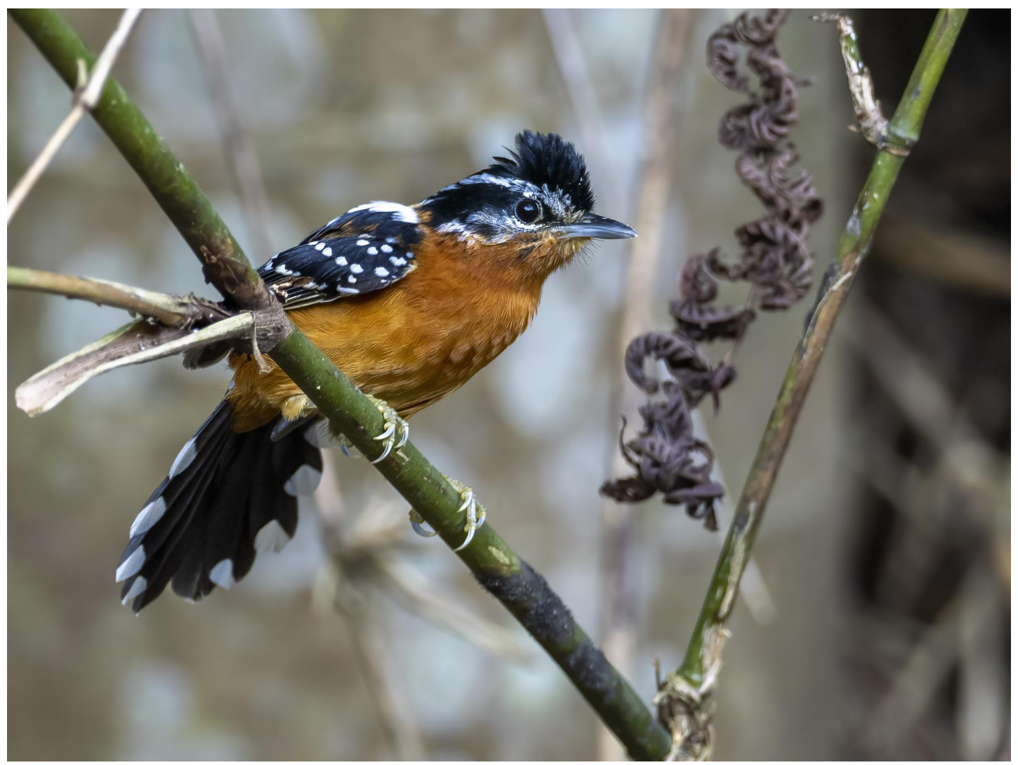
Ferruginous Antbirds (above) are common both in the highlands and in the lowlands. We got this responsive individual at the end of the very first day of our tour.