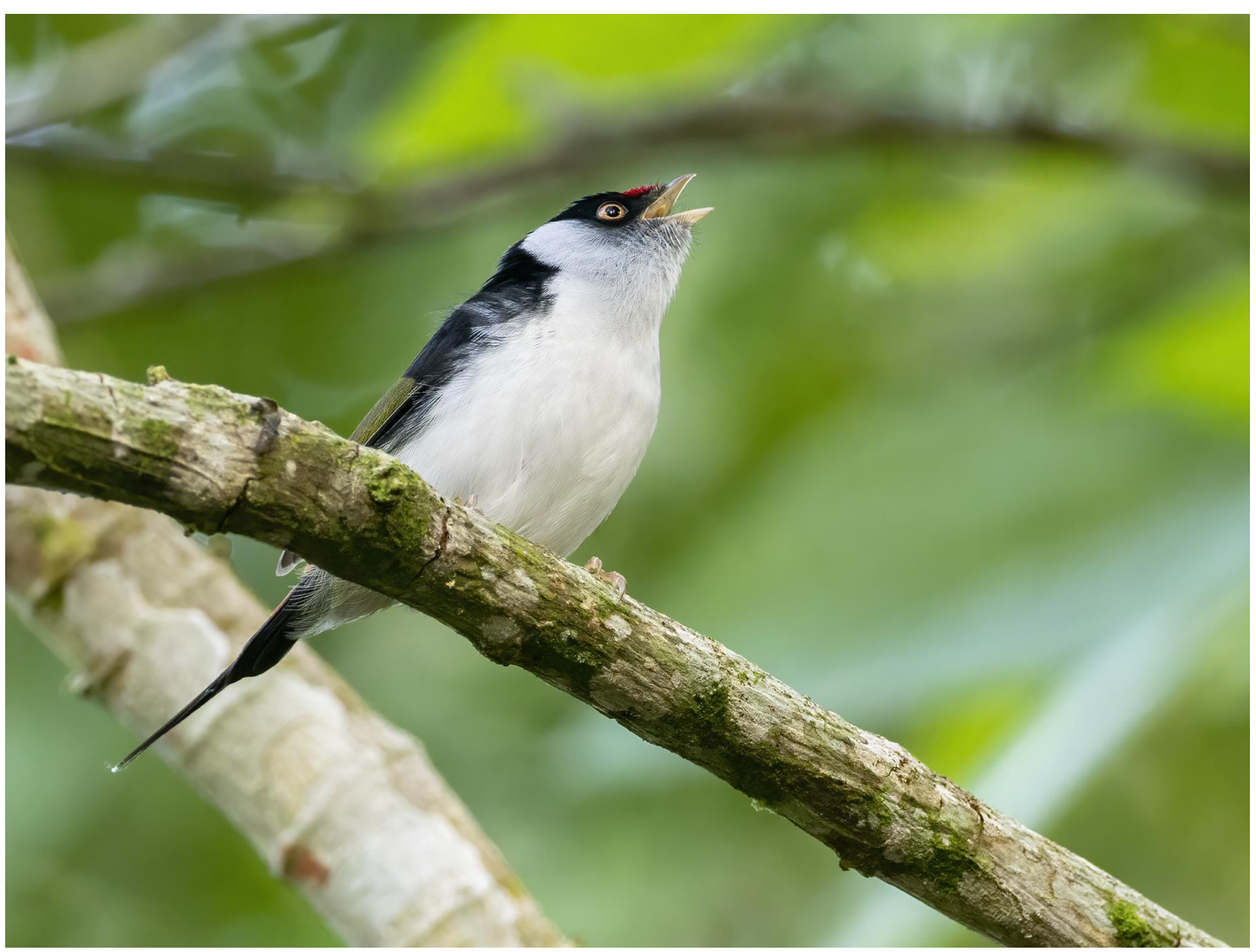
Pin-tailed Manakin (above) is a bird I see often but it hardly allows you to get close enough and due to its tiny size