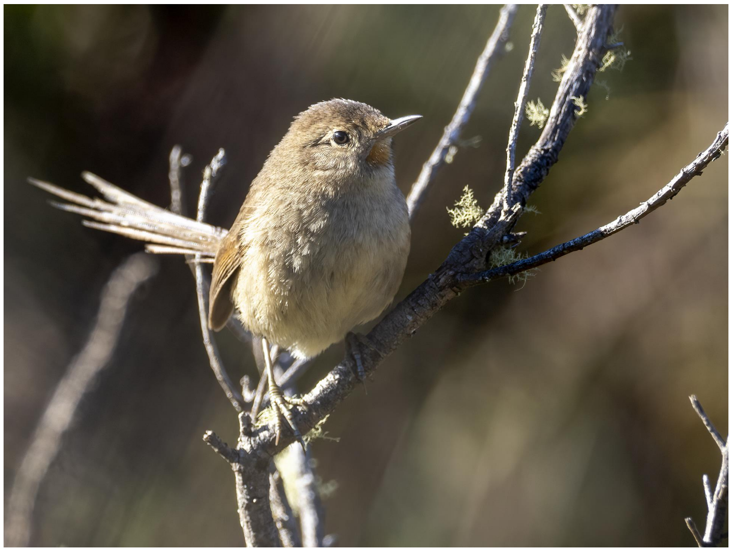
It doesn't look like much but the Itatiaia Spinetail or Thistletail (above) is a shy localized Endemic of Brazil