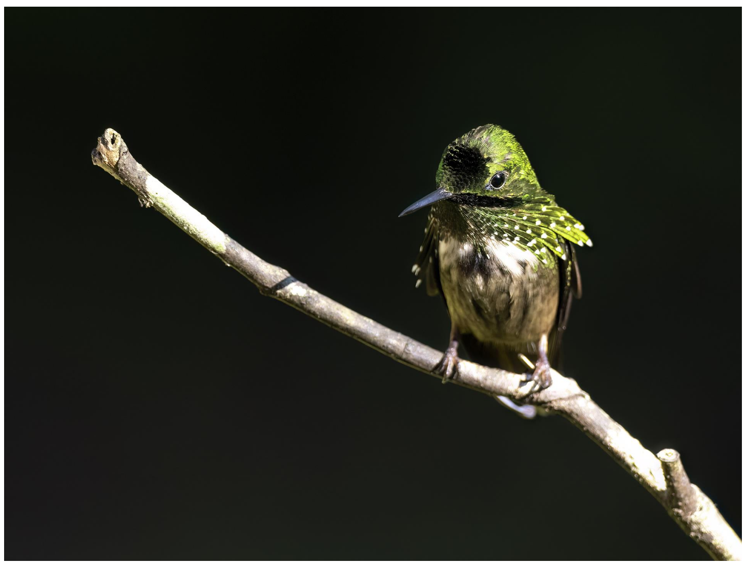
An obligate on any trip report of a tour that visits the Ubatuba Area is this Festive Coquette (above) which is happily common at the feeders of Sitio Folha Seca where dozens of individuals constantly visit the flowers and feeders there.