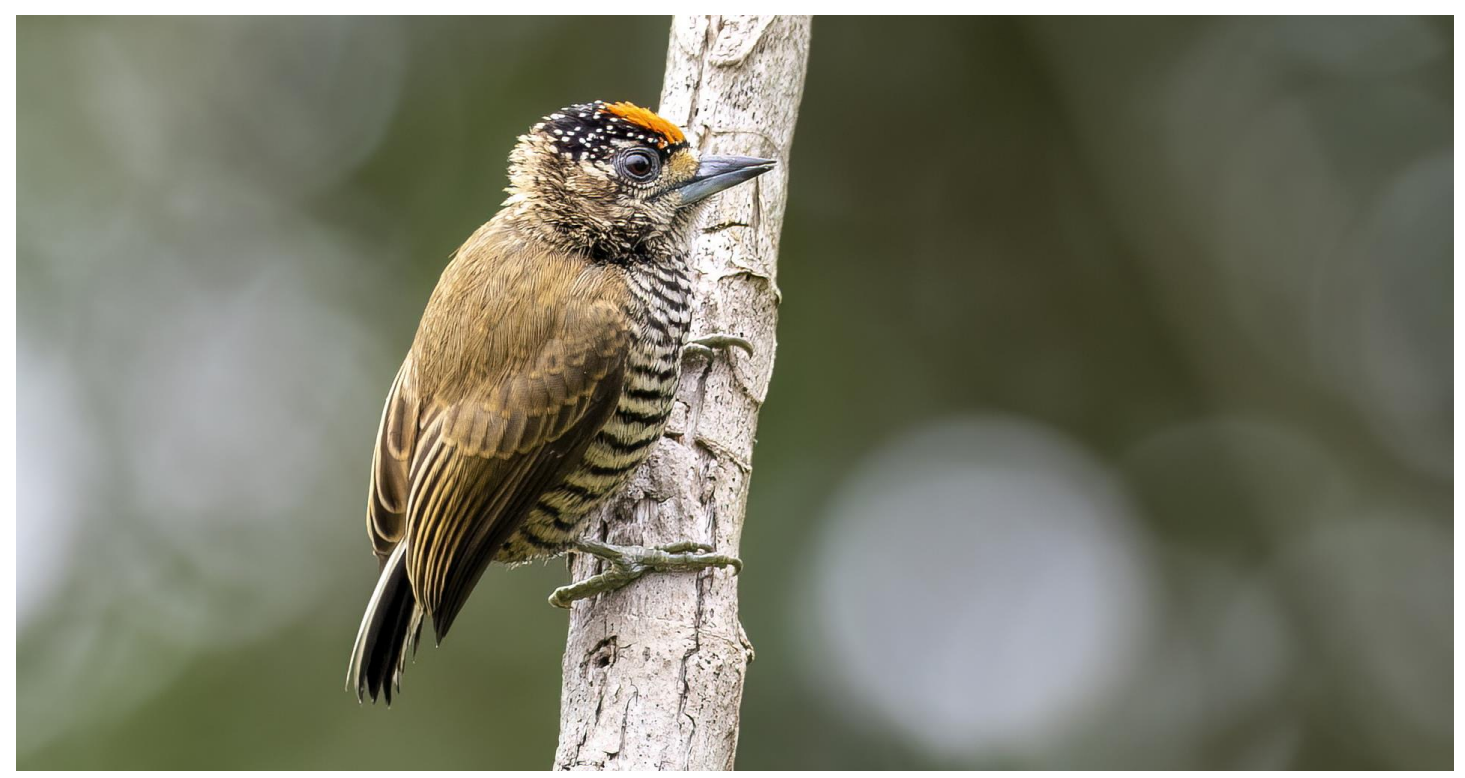
We got this tiny White-barred Piculet (photo above) near Parque Nacional Itatiaia

In the following pages you will find a SUMMARY of the best photos I managed to get during this tour but not a detailed narrative of the tour. As mentioned above, details with more photos and videos are available on the full VIDEO TRIP REPORT linked to this document that you can watch in our YouTube Channel, here: <a href="https://youtu.be/v4_JbiF2Ht8?si=uN2ms6GC-DR43tw3">https://youtu.be/v4_JbiF2Ht8?si=uN2ms6GC-DR43tw3</a>