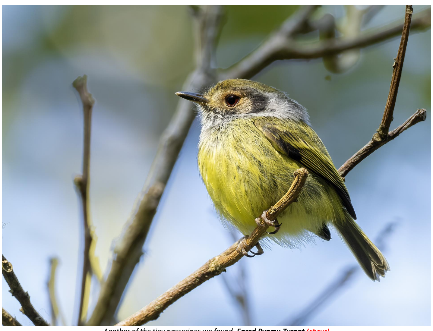
Another of the tiny passerines we found, Eared Pygmy-Tyrant (above)