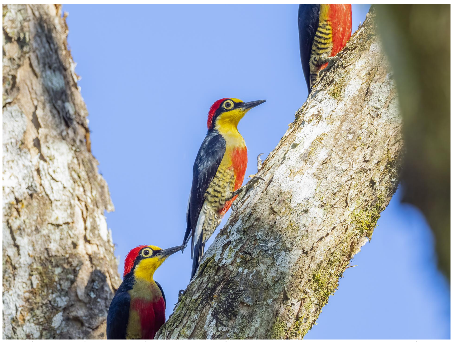
One of the most colorful woodpeckers of the area is the Yellow-fronted Woodpecker (above). We got a very cooperative family in Fazenda Angelim located in the outskirts of Ubatuba.