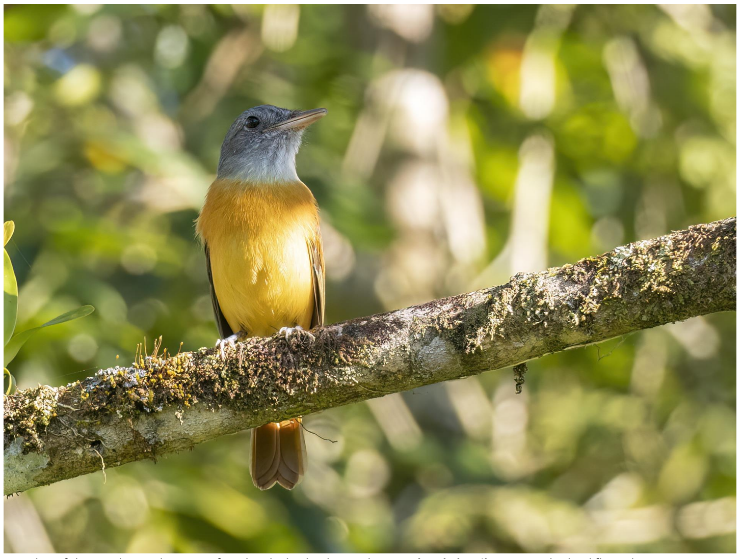
Another of the Brazilian endemics we found in the lowlands was this Gray-hooded Attila (above). This loud flycatcher is quite easy to locate thanks to its flamboyant song.