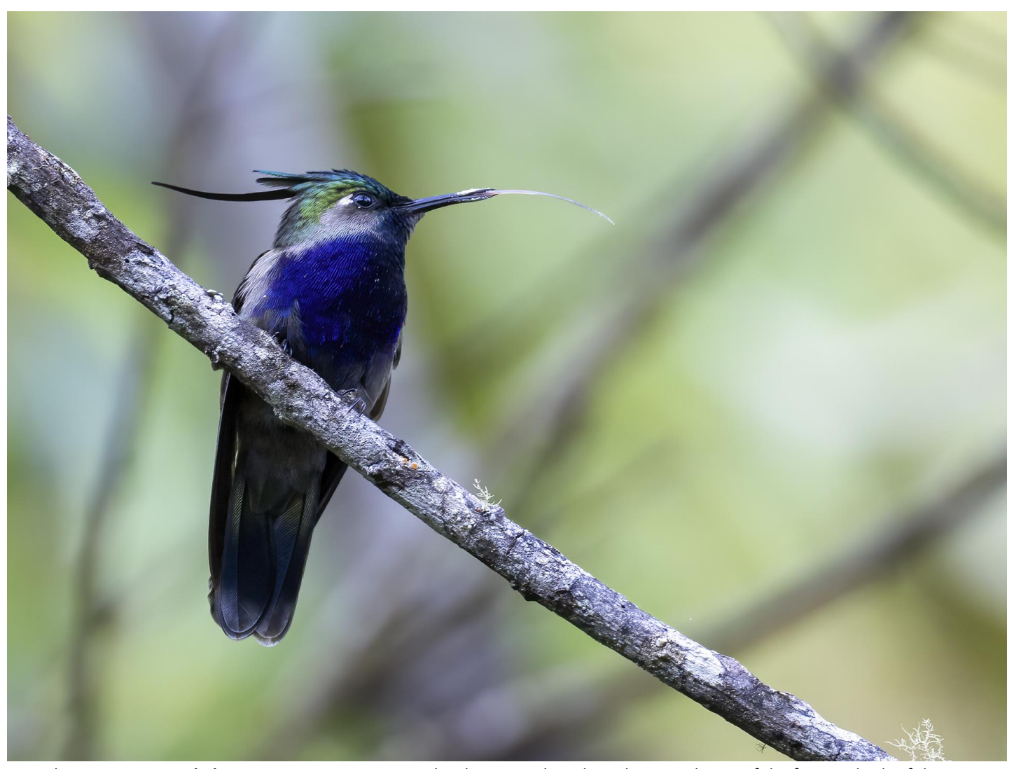
This Green-crowned Plovercrest (above) was not only a big target but also subsequently one of the favorite birds of the trip