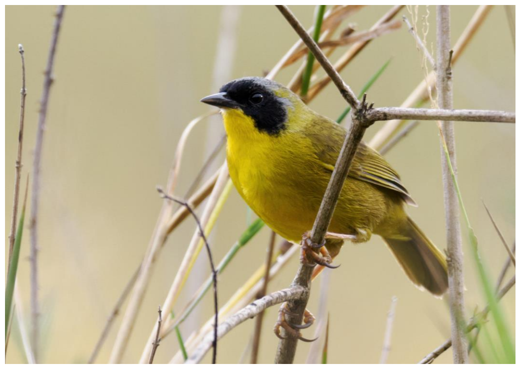
"Chiriqui" Olive-crowned Yellowthroat from Lagunas de Volcán