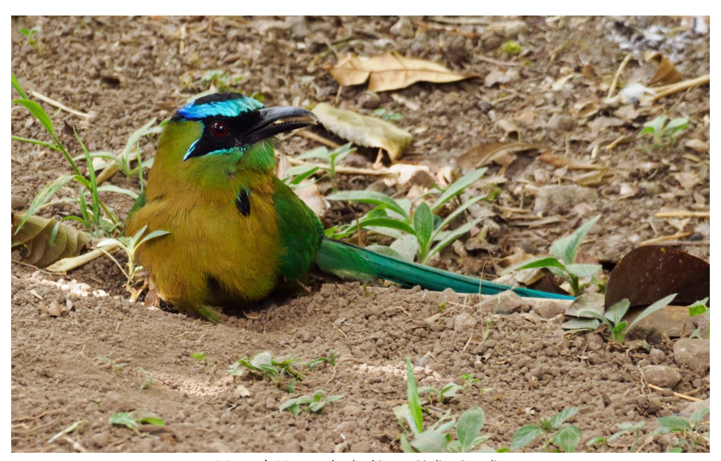
A Lesson's Motmot dustbathing at Birding Paradise