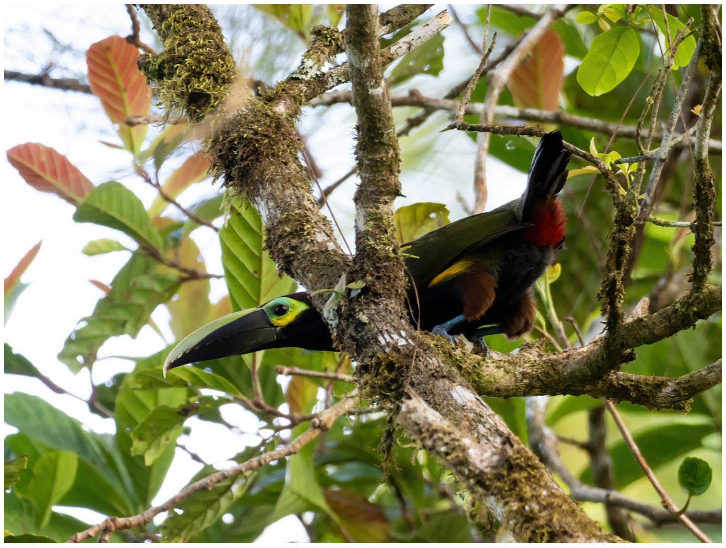
This rare and beautiful Yellow-eared Toucanet was one of the most memorable birds of the tour

The country of Panama has a birdlist of over 1000 species – a truly shocking number given the small size of the country, about the size of the US state of South Carolina or the Canadian province of New Brunswick. This diversity is in large part